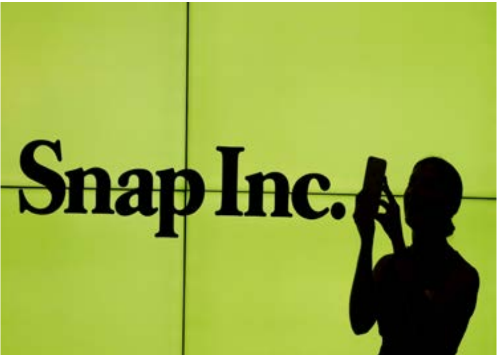
FILE PHOTO: A woman stands in front of the logo of Snap Inc. on the floor of the New York Stock Exchange (NYSE) while waiting for Snap Inc. to post their IPO, in New York City, NY, U.S.

Earlier this month, Snap launched a gaming platform within its Snapchat app featuring original and third-party games such as Zynga Inc's Tiny Royale.