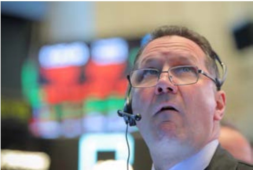
Traders work on the floor at the NYSE in New York