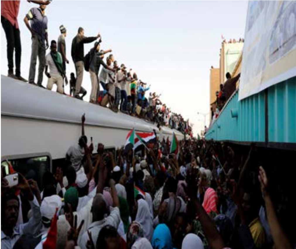
Protesters on a train from Atbara, the birthplace of an uprising that toppled Sudan's former President Omar al-Bashir, shout slogans as they approach to a train station in Khartoum