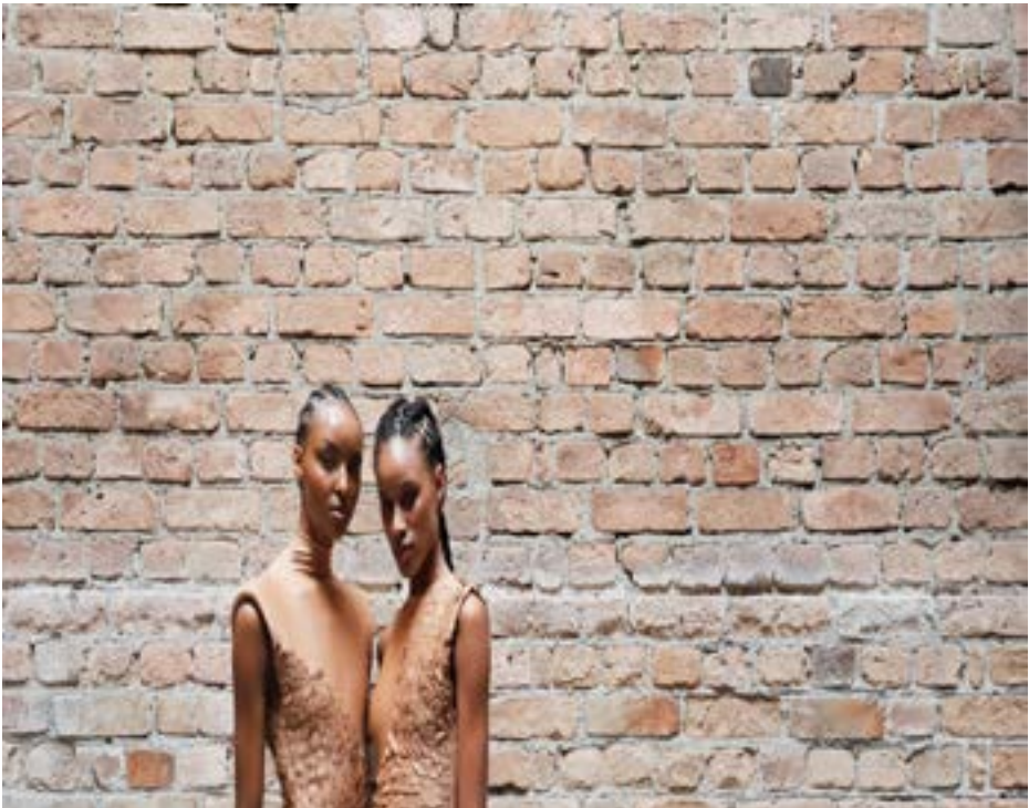
Models pose backstage before Lenny Niemeyer show during Sao Paulo Fashion Week in Sao Paulo