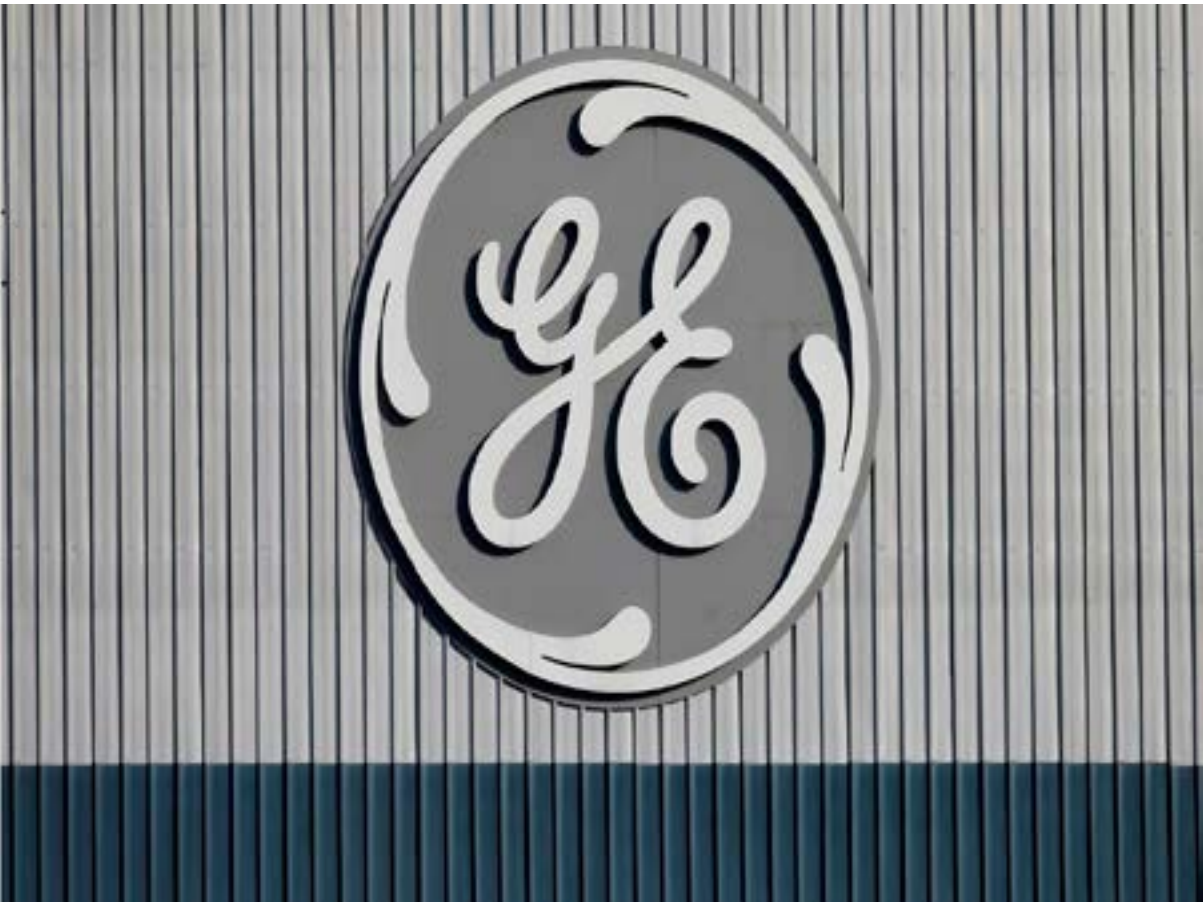
FILE PHOTO: The logo of U.S. conglomerate General Electric is pictured at the company’s site of its energy branch in Belfort, France, February 5, 2019. REUTERS/Vincent Kessler