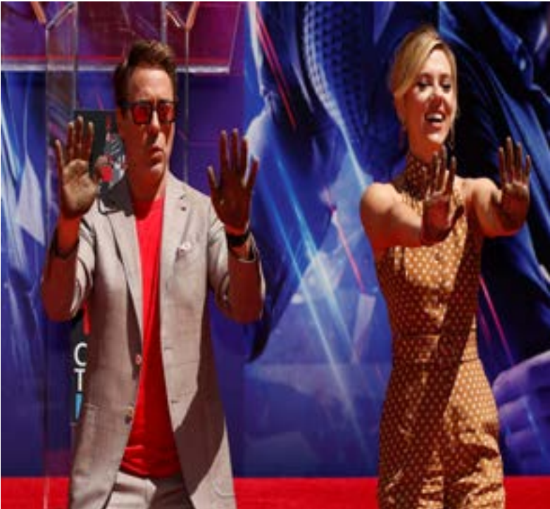
Actors Robert Downey Jr., Chris Evans, Mark Ruffalo, Chris Hemsworth, Scarlett Johansson, Jeremy Renner and Marvel Studios President Kevin Feige place their handprints in cement at a ceremony at the TCL Chinese Theatre in Hollywood