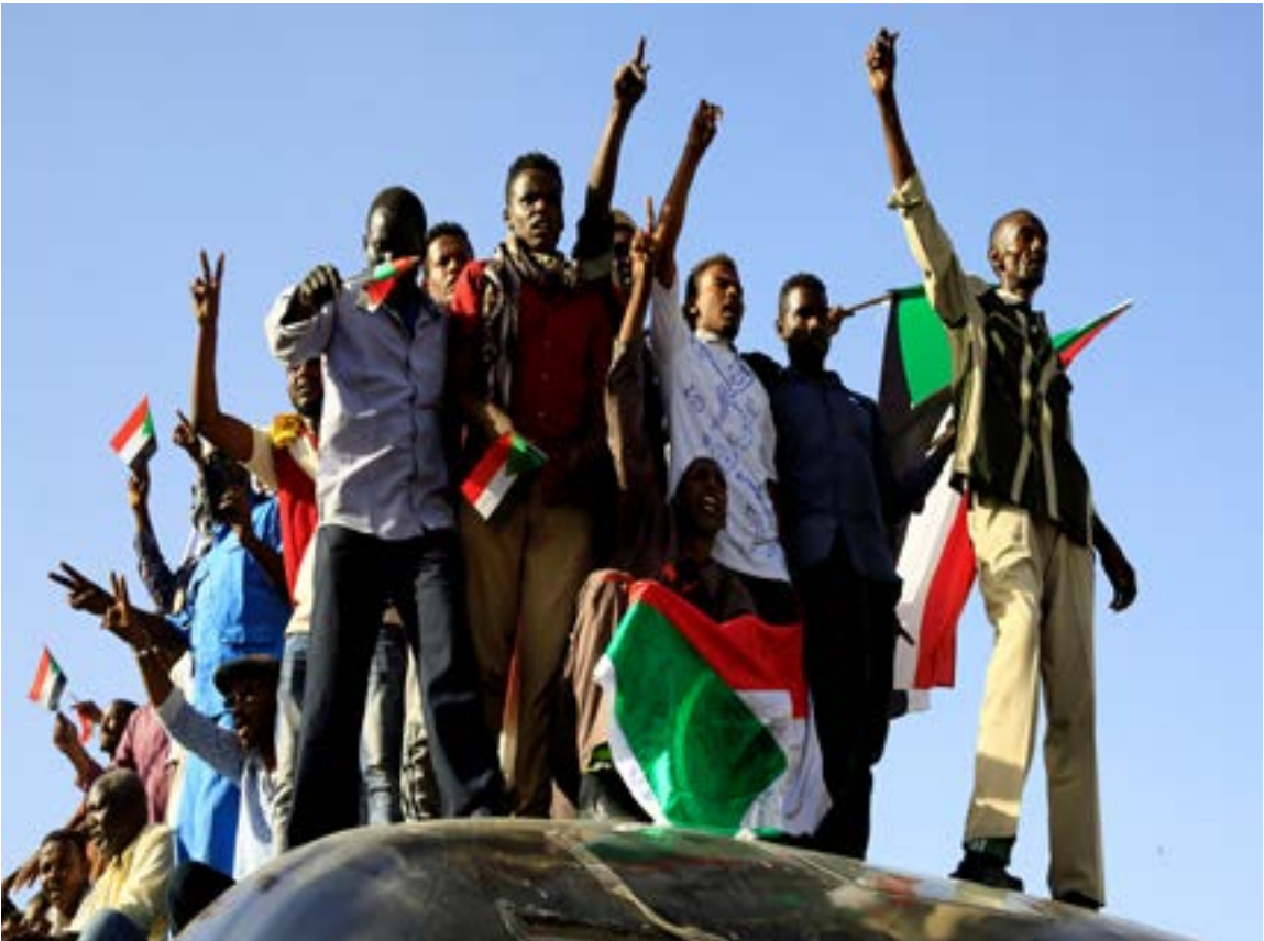
Sudanese demonstrators ride atop a train from Atbara, the birthplace of an uprising that toppled Sudanese former President Omar al-Bashir, as they approach the military headquarters in Khartoum