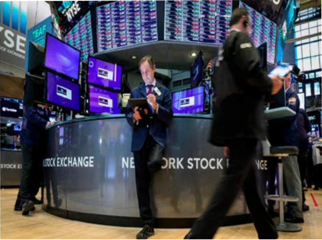
FILE PHOTO: The logo of Foxconn, the trading name of Hon Hai Precision Industry, is seen on top of the company’s building in Taipei, Taiwan, March 30, 2018. REUTERS/Tyrone Siu

NEW YORK (Reuters) - The S&P 500 and the Nasdaq registered record closing highs after a broad-based rally on Tuesday as a clutch of better-than-expected earnings reports eased concerns about a slow-down. The Dow Jones Industrial Average rose 145.41 points, or 0.55%, to 26,656.46, the S&P 500 gained 25.69 points, or 0.88%, to 2,933.66 and the Nasdaq Composite added 105.56 points, or 1.32%, to 8,120.82.