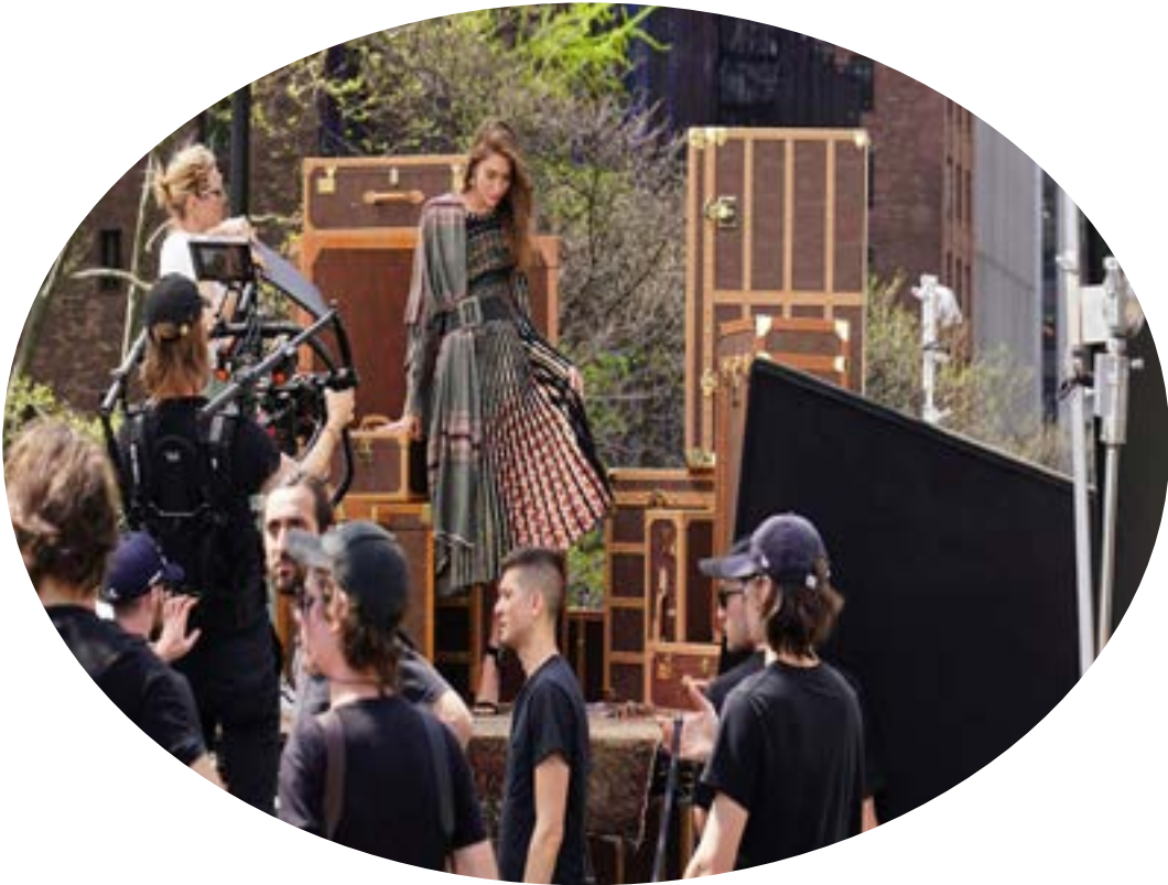
A model poses on a set during a photo and video shoot on the street in New York