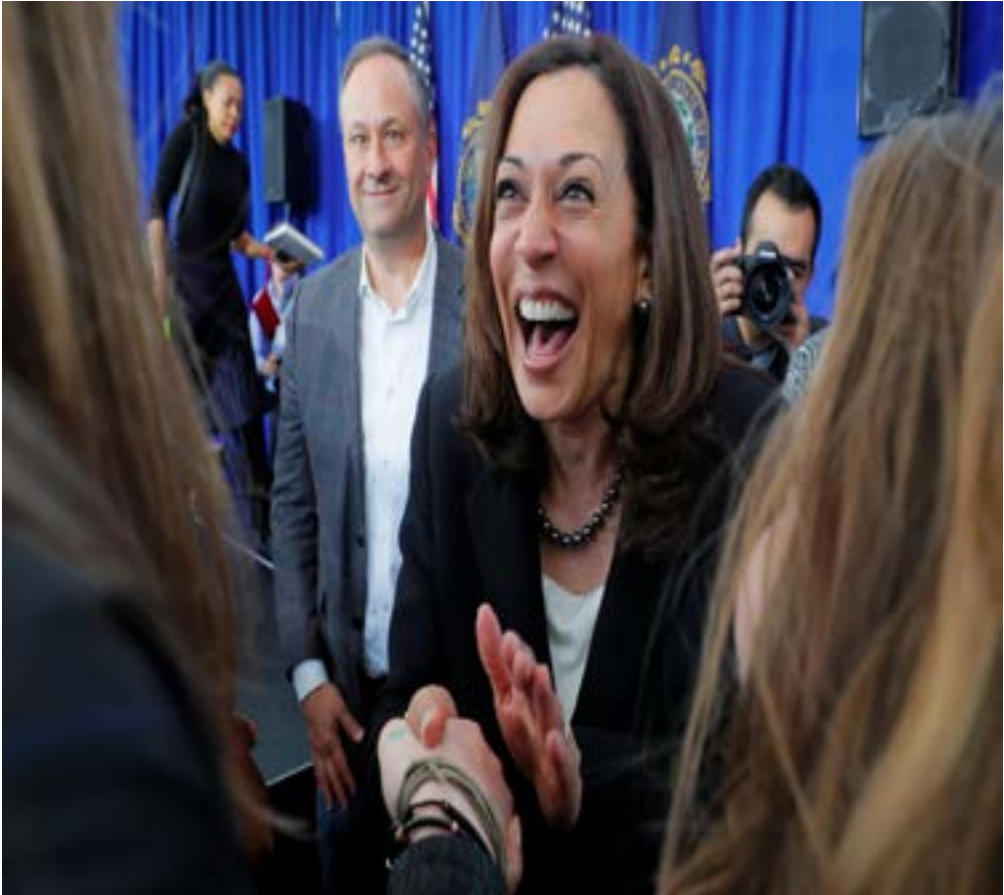
Democratic 2020 U.S. presidential candidate Harris greets audience members during a campaign stop in Keene