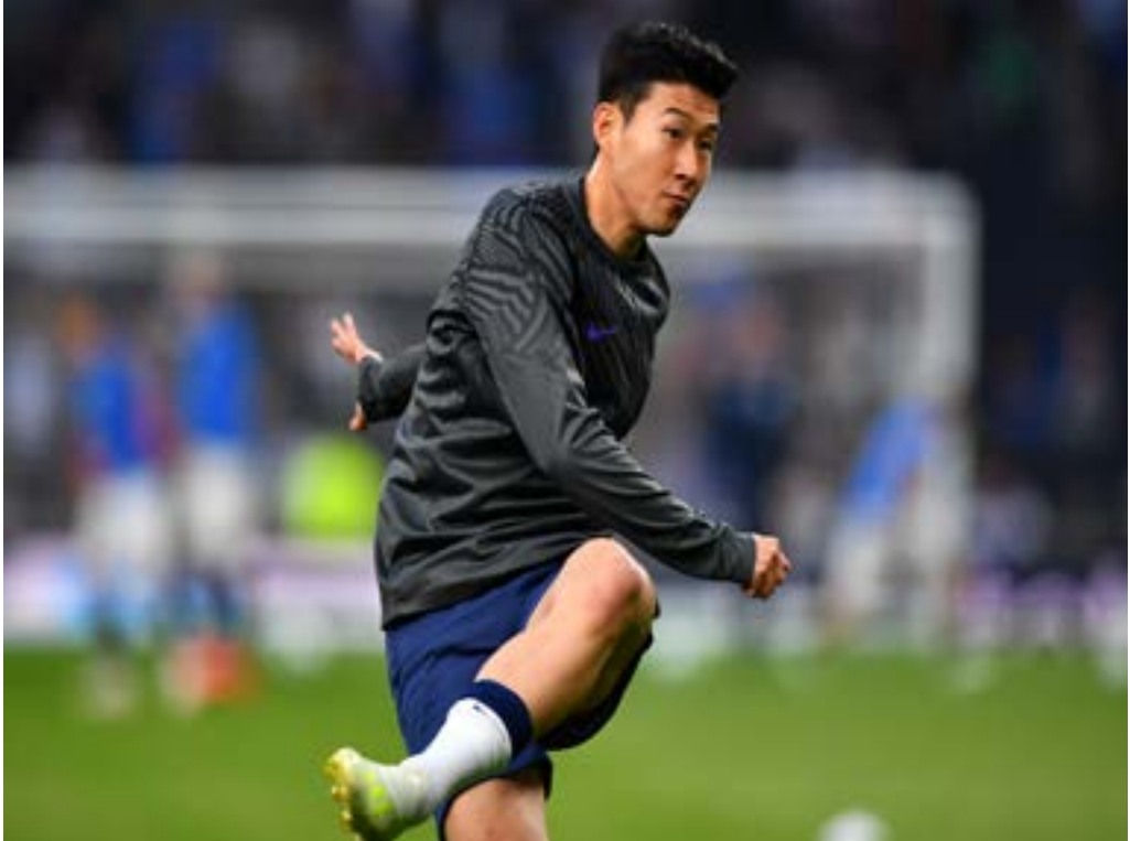
Soccer Football - Premier League - Tottenham Hotspur v Brighton & Hove Albion - Tottenham Hotspur Stadium, London, Britain - April 23, 2019 Tottenham's Son Heung-min during the warm up before the match