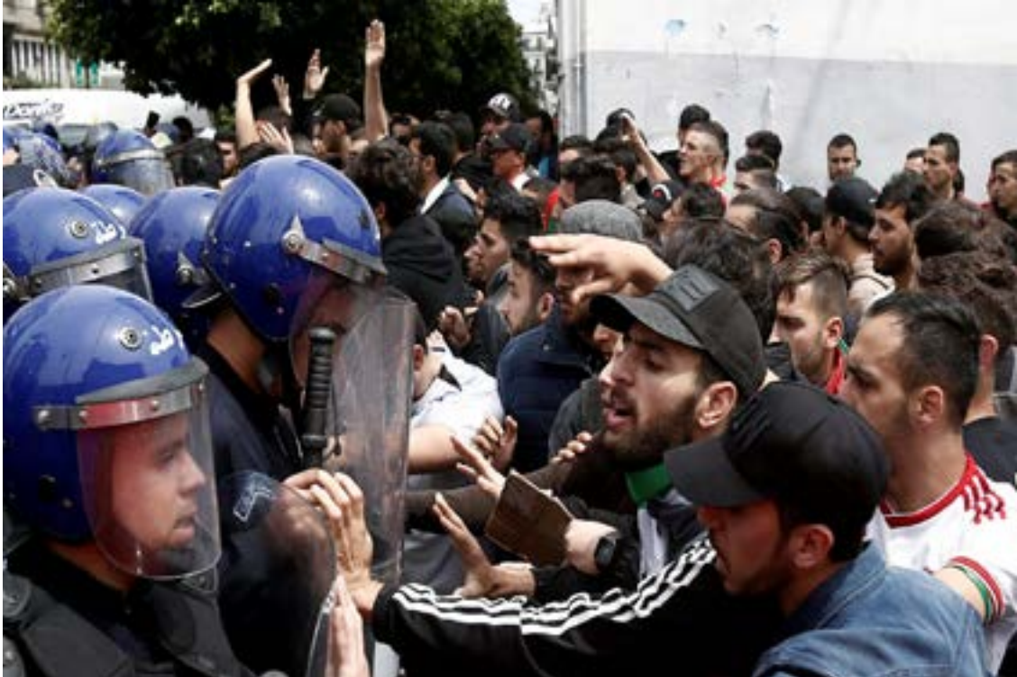
Demonstrators and police confront each other during anti government protests in Algiers