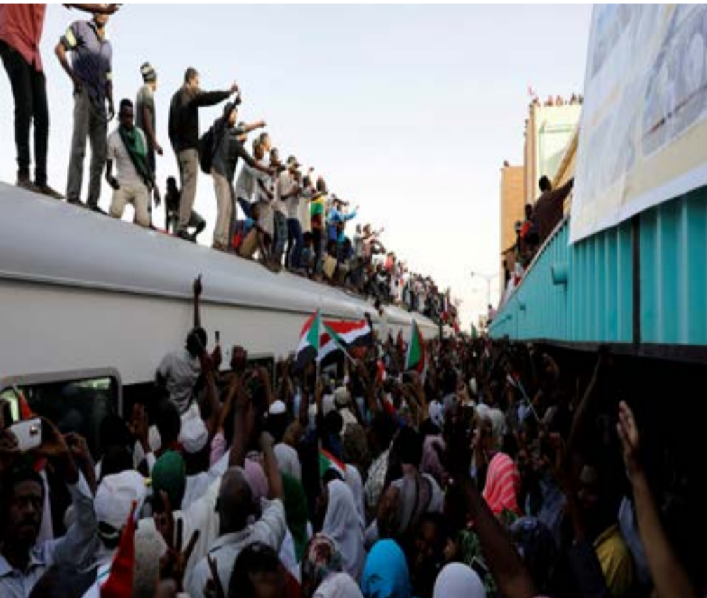
Protesters on a train from Atbara, the birthplace of an uprising that toppled Sudan's former President Omar al-Bashir, shout slogans as they approach to a train station in Khartoum