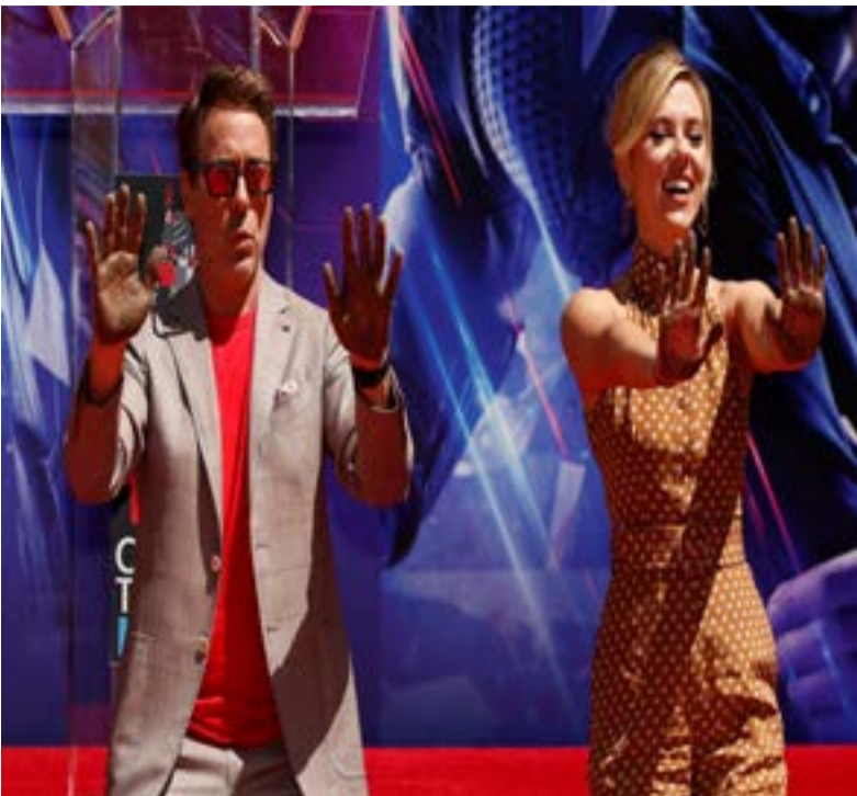
Actors Robert Downey Jr., Chris Evans, Mark Ruffalo, Chris Hemsworth, Scarlett Johansson, Jeremy Renner and Marvel Studios President Kevin Feige place their handprints in cement at a ceremony at the TCL Chinese Theatre in Hollywood