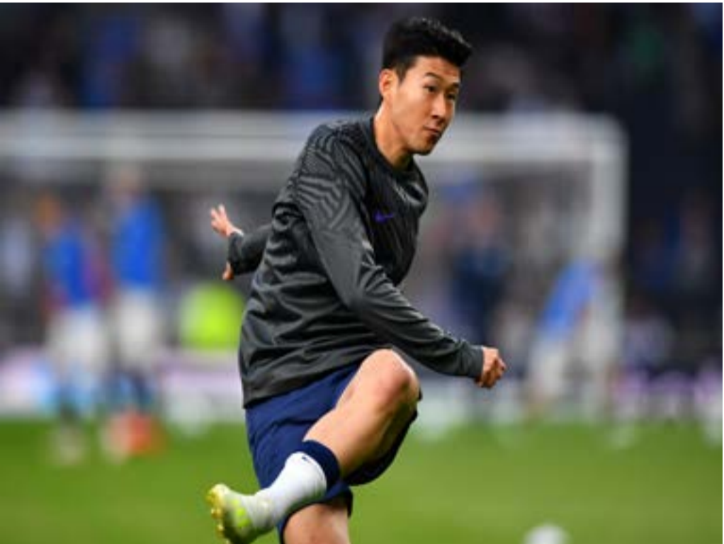
Soccer Football - Premier League - Tottenham Hotspur v Brighton & Hove Albion - Tottenham Hotspur Stadium, London, Britain - April 23, 2019 Tottenham's Son Heung-min during the warm up before the match