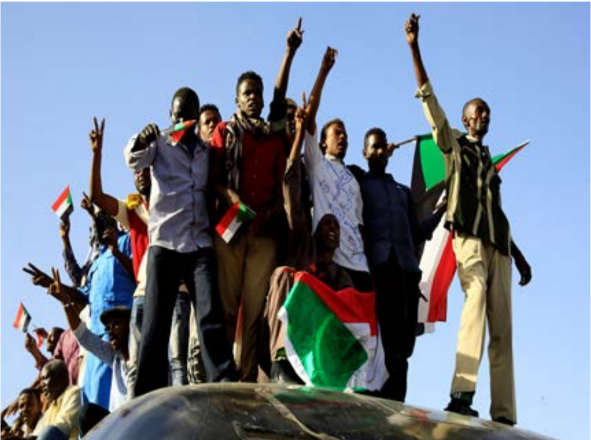
Sudanese demonstrators ride atop a train from Atbara, the birthplace of an uprising that toppled Sudanese former President Omar al-Bashir, as they approach the military headquarters in Khartoum