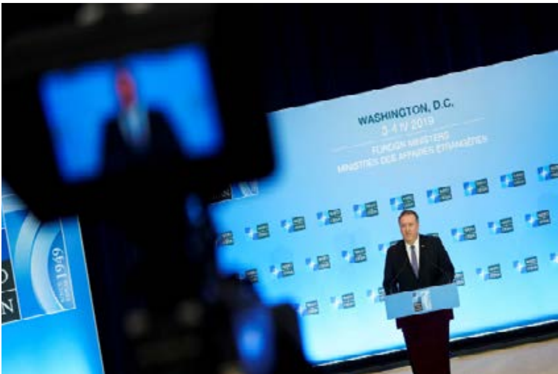
U.S. Secretary of State Pompeo speaks to the media during the NATO Foreign Minister's Meeting in Washington