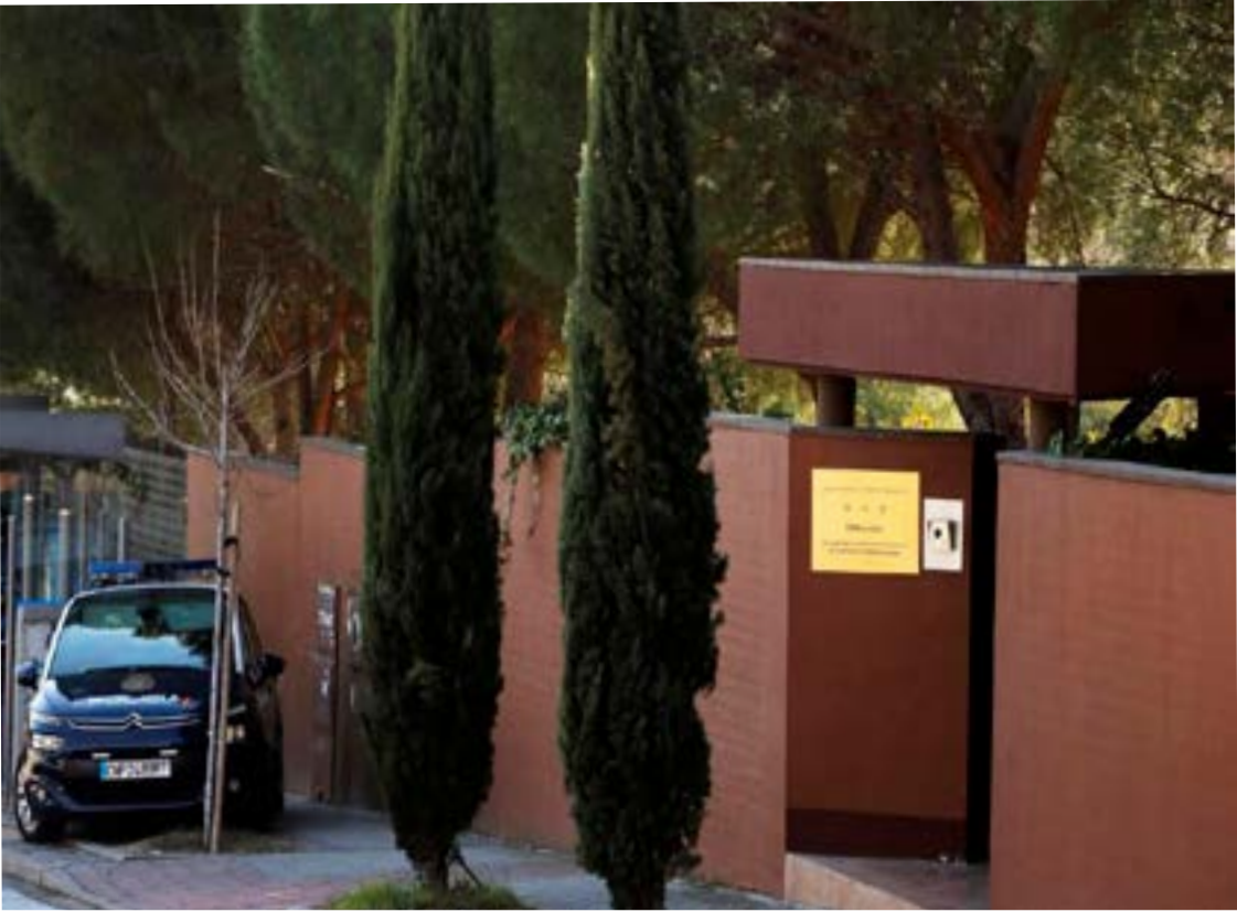
FILE PHOTO: A Spanish National Police car is seen outside the North Korea’s embassy in Madrid, Spain February 28, 2019.