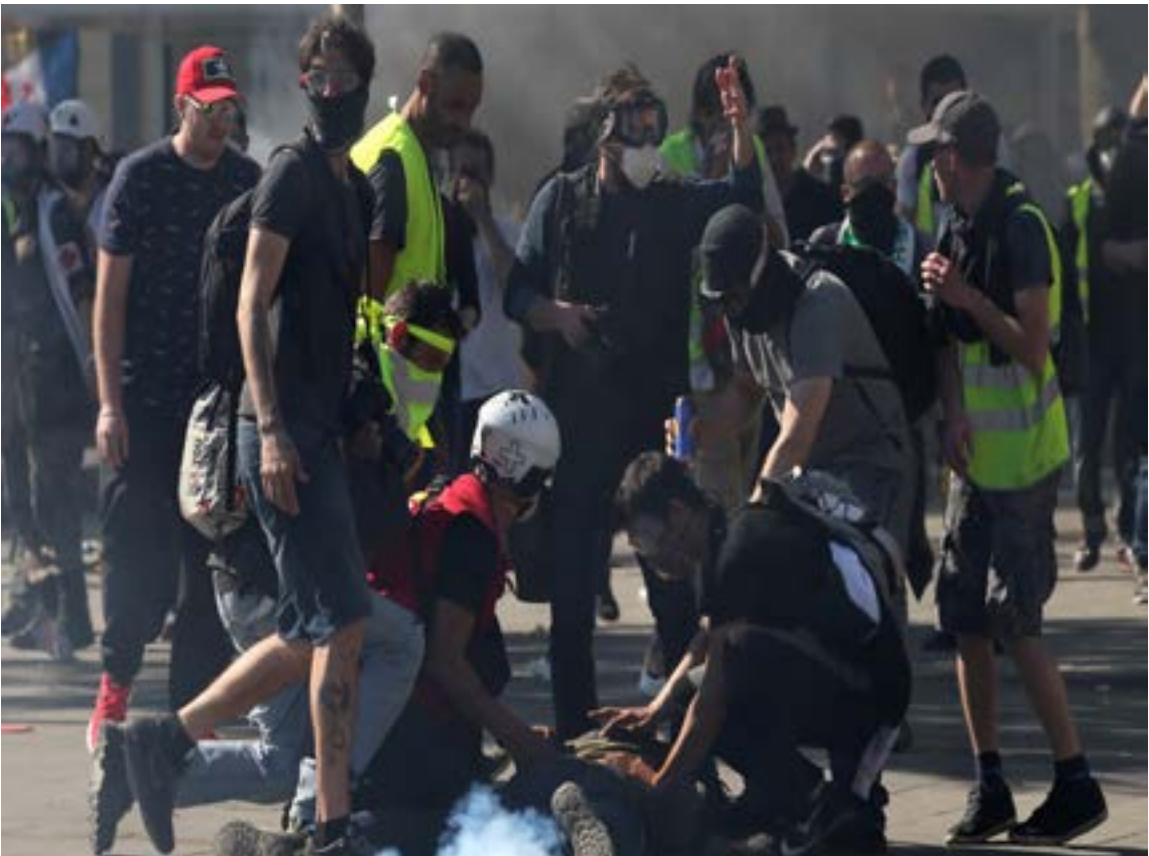
French “yellow vests” stage 23rd consecutive national protest on Saturday