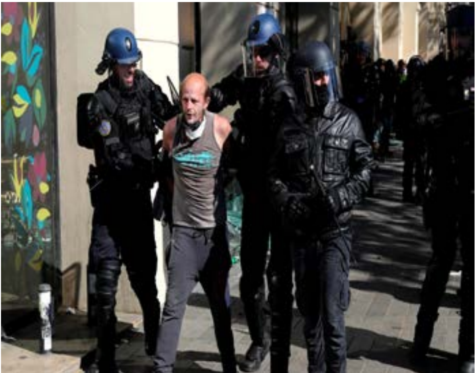
French “yellow vests” stage 23rd consecutive national protest on Saturday