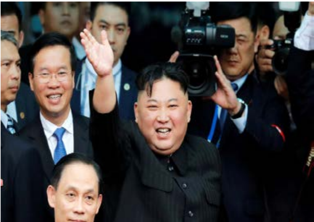
North Korean leader Kim Jong Un bids farewell to the crowd before boarding his train to depart for North Korea at Dong Dang railway station

legislation would provide useful tools to help change North Korea. “We continue to support the bill and appreciate them honoring our son’s memory,” the Warmbiers said. The measure, which would deny access to the U.S. banking system to any foreign bank that does business with North Korea, unanimously passed the Senate Banking Committee last year but did not advance further. To become law, it would need to pass the full Senate and House of Representatives and be signed into law by Trump.