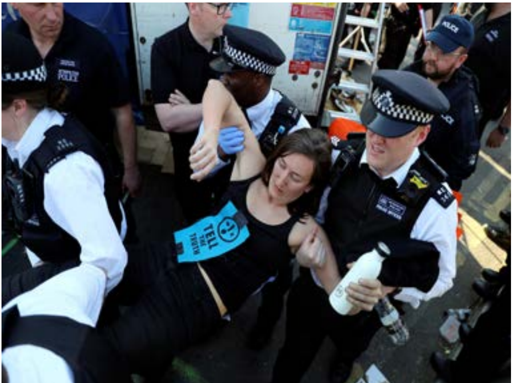
A climate change activist is detained during the Extinction Rebellion protest on Waterloo Bridge in London, Britain April 20, 2019.