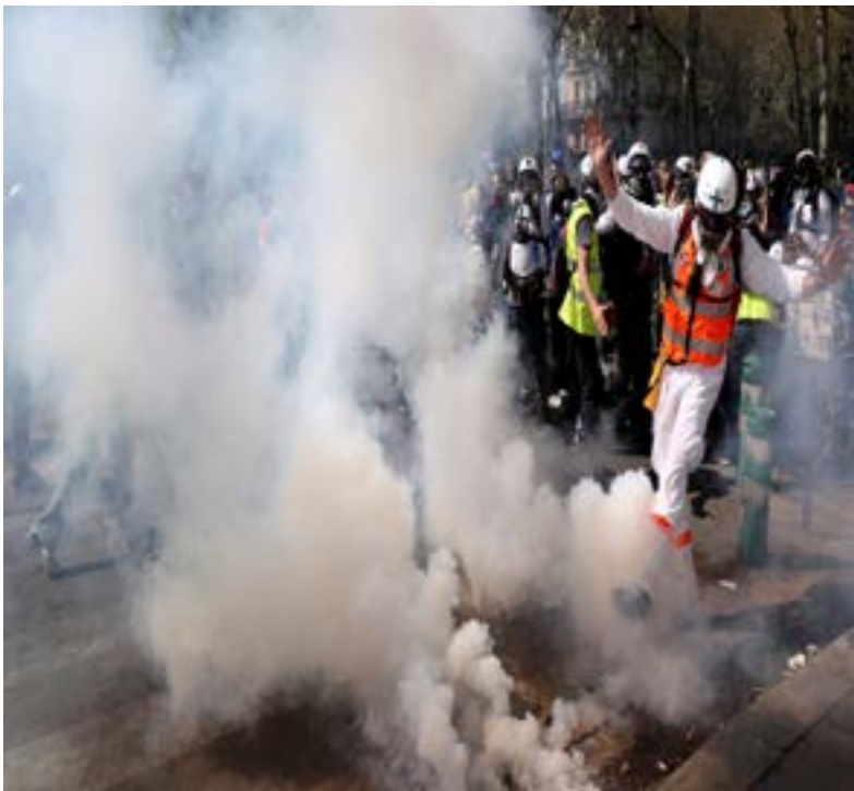
French “yellow vests” stage 23rd consecutive national protest on Saturday