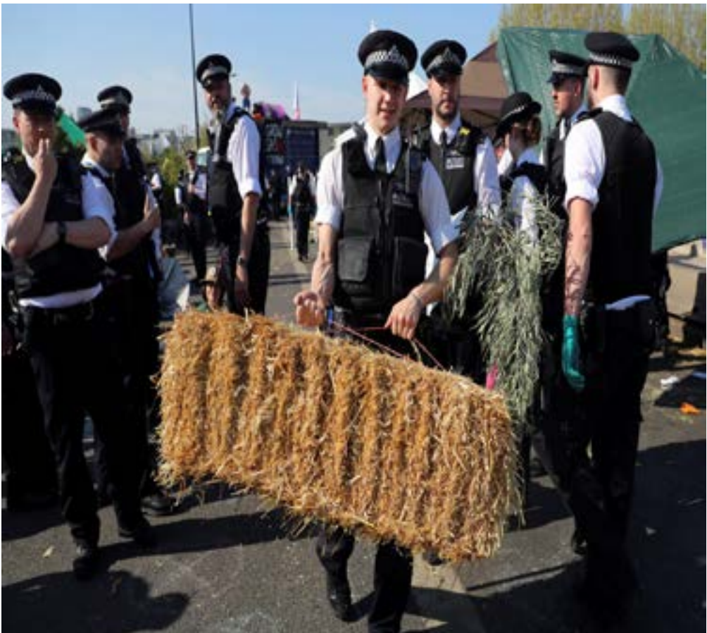
A police officer removes a haystack during the Extinction Rebellion protest on Waterloo Bridge in London, Britain April 20, 2019.