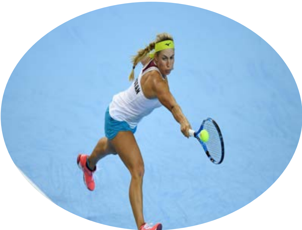
Tennis - Fed Cup - World Group II Playoffs - Great Britain v Kazakhstan - Copper Box Arena, London, Britain - April 20, 2019 Kazakhstan's Yulia Putintseva in action during her match against Great Britain's Katie Boulter