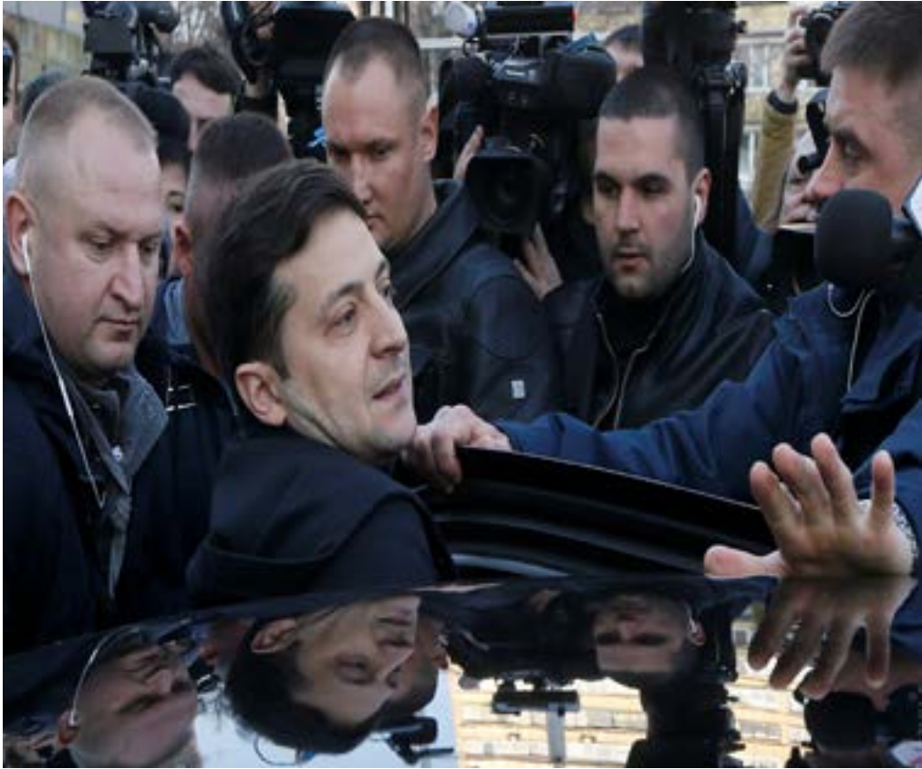
FILE PHOTO: Ukrainian presidential candidate and comedian Volodymyr Zelenskyy gets into a car after undergoing a drugs and alcohol test in Kiev