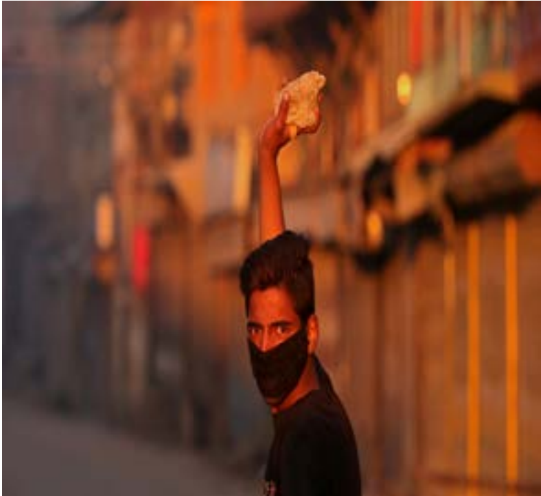
A masked Kashmiri demonstrator looks on as he prepares to throw a stone towards Indian police during a protest after the end of the second phase of general election in Srinagar