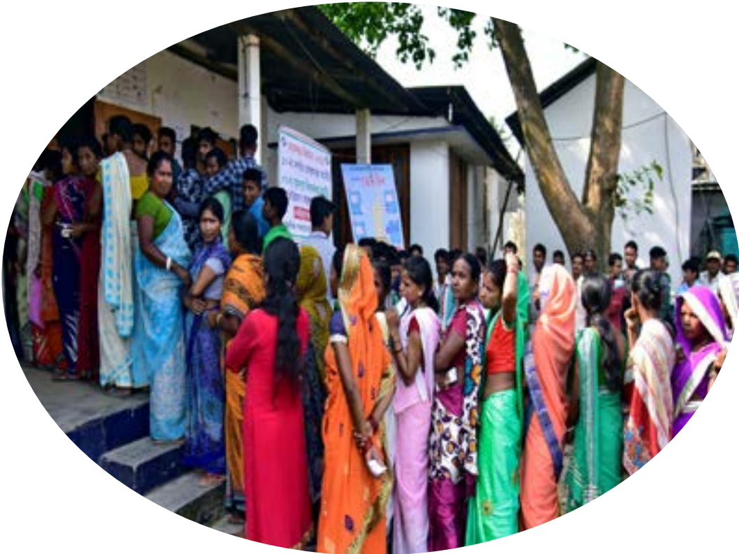
People wait in queues to cast their votes outside a polling station during the second phase of general election in Hojai