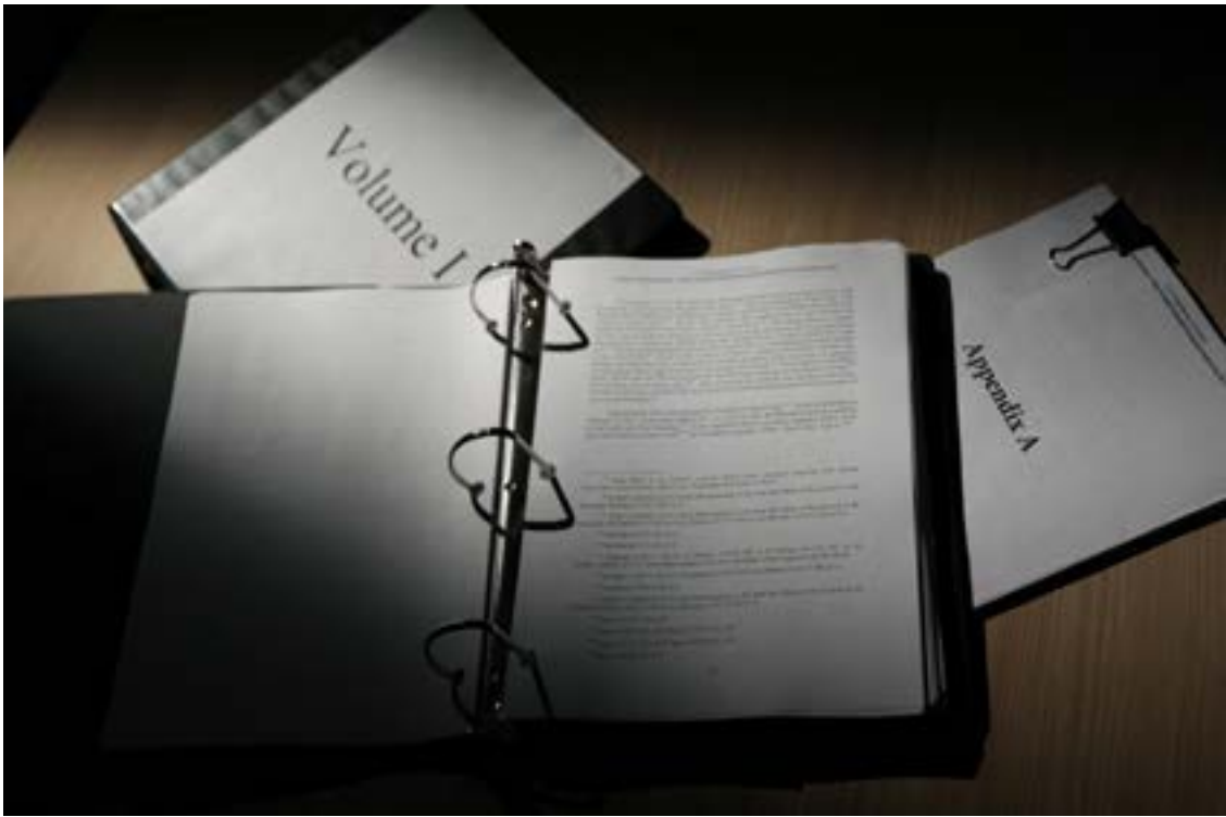
Official binders given to reporters with Special Counsel Robert Mueller's report on Russian interference in the 2016 U.S. presidential election are seen in Washington