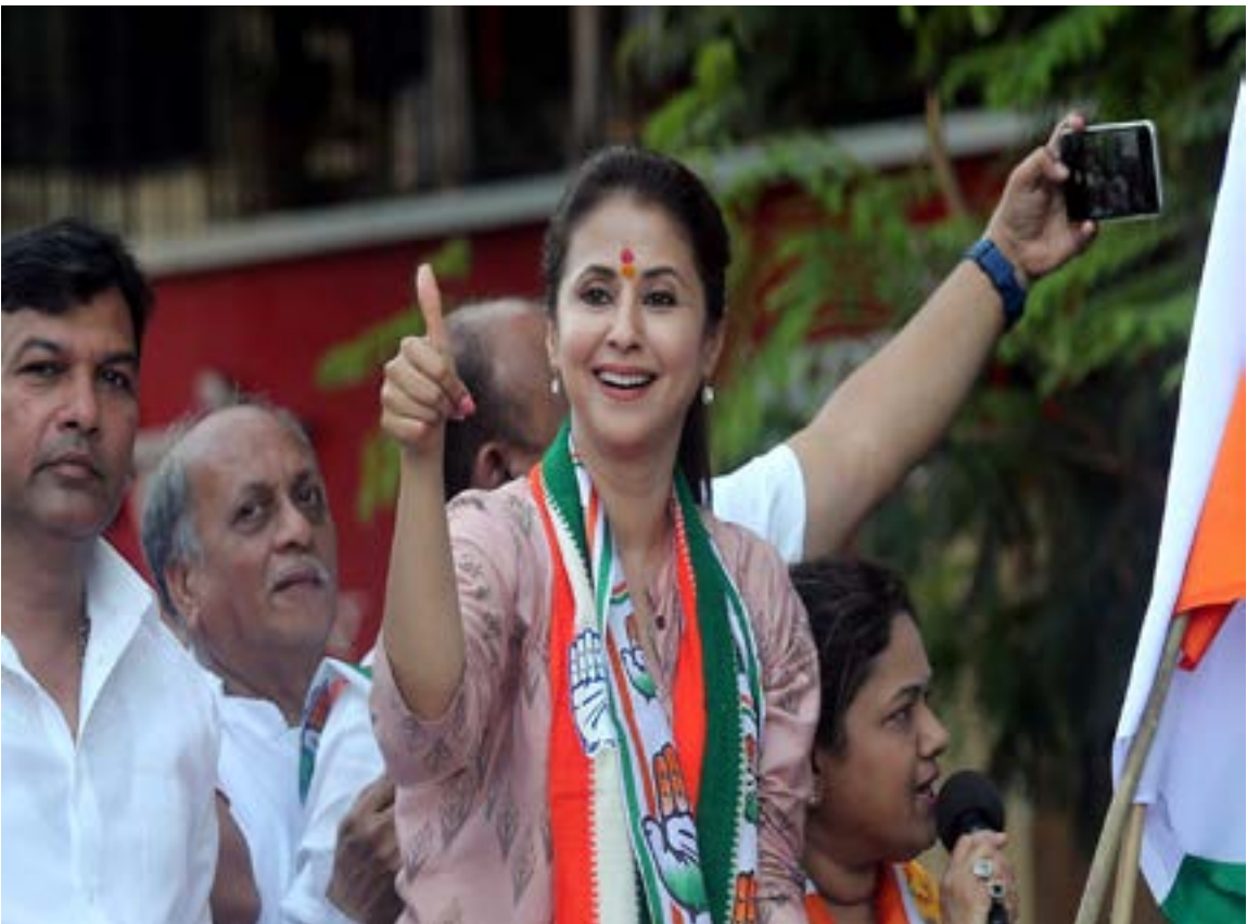
FILE PHOTO: Urmila Matondkar, Bollywood actress-turned-politician who recently joined India's main opposition Congress party, gestures during her election campaign rally in Mumbai