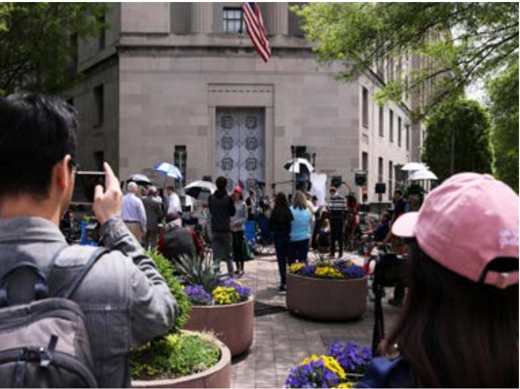
Tourists take pictures of television reporters working on a sidewalk outside of the Justice Department, after the release of Special Counsel Robert Mueller's report on Russian interference in the 2016 U.S. presidential election in Washington