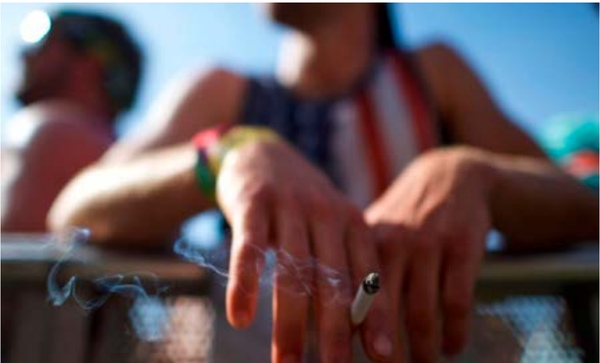
A man smokes at the Firefly Music Festival in Dover, Delaware U.S., June 16, 2018.

Altria Group has been a major contributor to McConnell’s campaigns, according to data from the Center for Responsive Politics, which tracks money in politics. McConnell’s campaign received $31,900 from Altria employees or political action committees in the most recent election cycle, making him one of the top four recipients of campaign cash in Congress, according to the data.