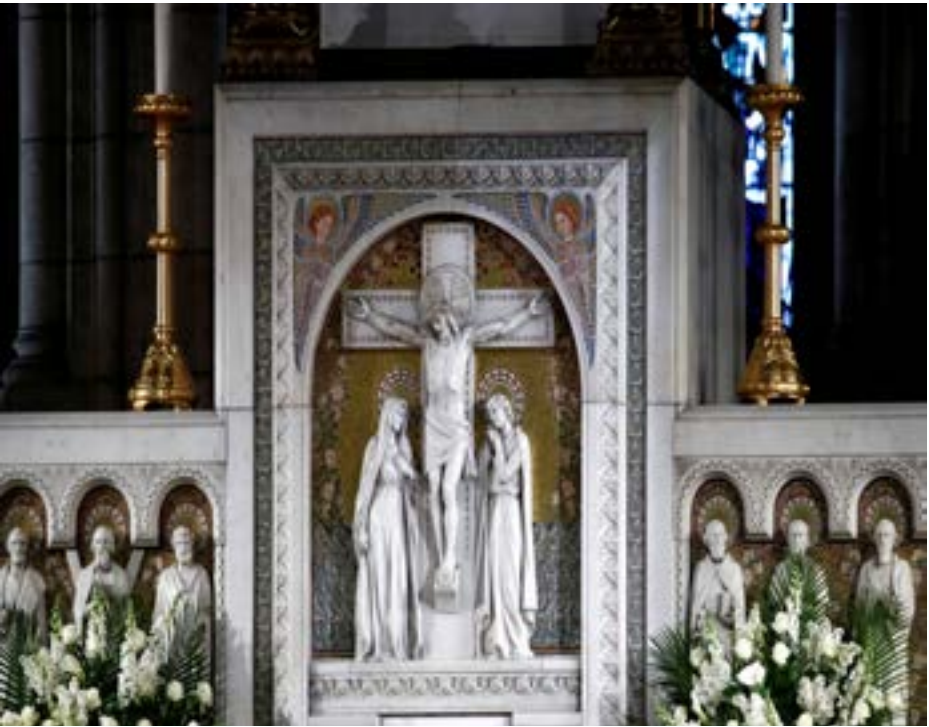
A statue of Jesus Christ on the cross is pictured during a mass for the celebration of the Last Supper at the Sacre-Coeur Basilica of Montmartre, days after a massive fire devastated large parts of the structure of the gothic Notre-Dame Cathedral, in Paris