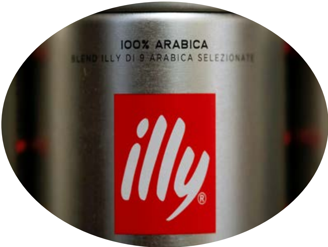
FILE PHOTO: An Illy Caffee can is seen in a coffee shop in Rome, Italy, May 3, 2016. To match Interview COFFEE-ILLY/