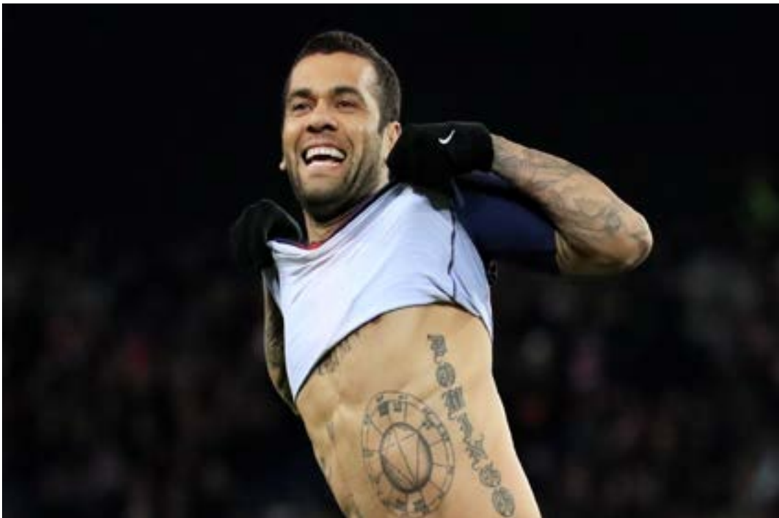
Soccer Football - Coupe de France - Semi Final - Paris St Germain v FC Nantes - Parc des Princes, Paris, France - April 3, 2019 Paris St Germain’s Dani Alves celebrates scoring their third goal