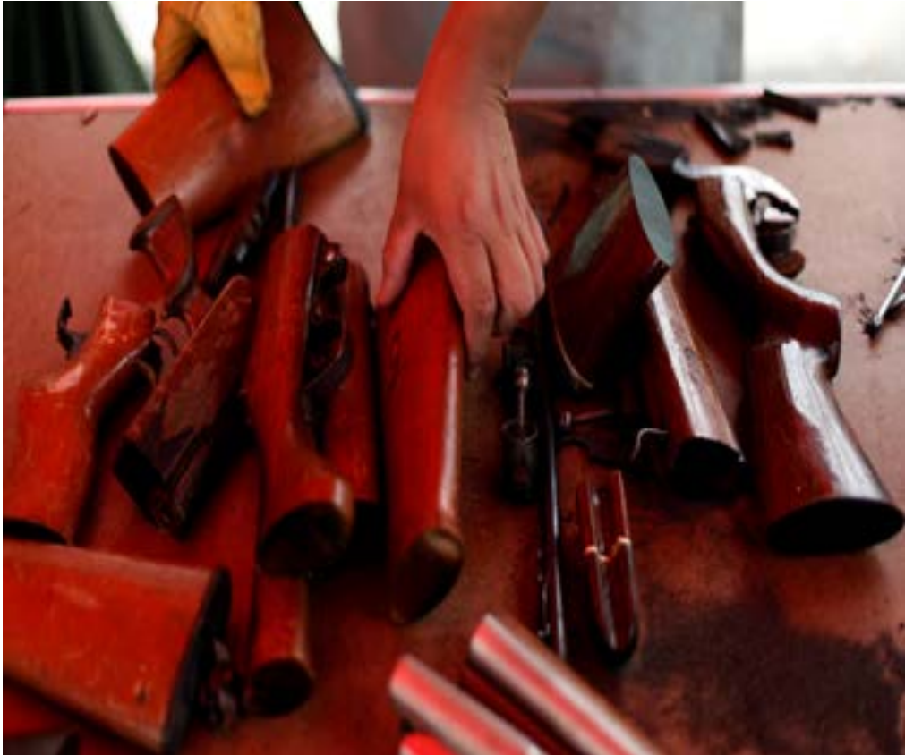
Weapons destroyed by soldiers after being delivered by citizens as part of a voluntary disarmament program, are pictured in Mexico City