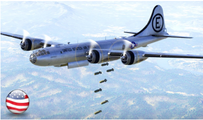
The B-29 aircraft.

After his service, he returned to the Houston area, teaching meteorology at Ellington Air Force Base before his roughest flying assignments — piloting B-29 aircraft into tropical storms and hurricanes to gauge the pressure, or through toxic clouds to measure radiation.