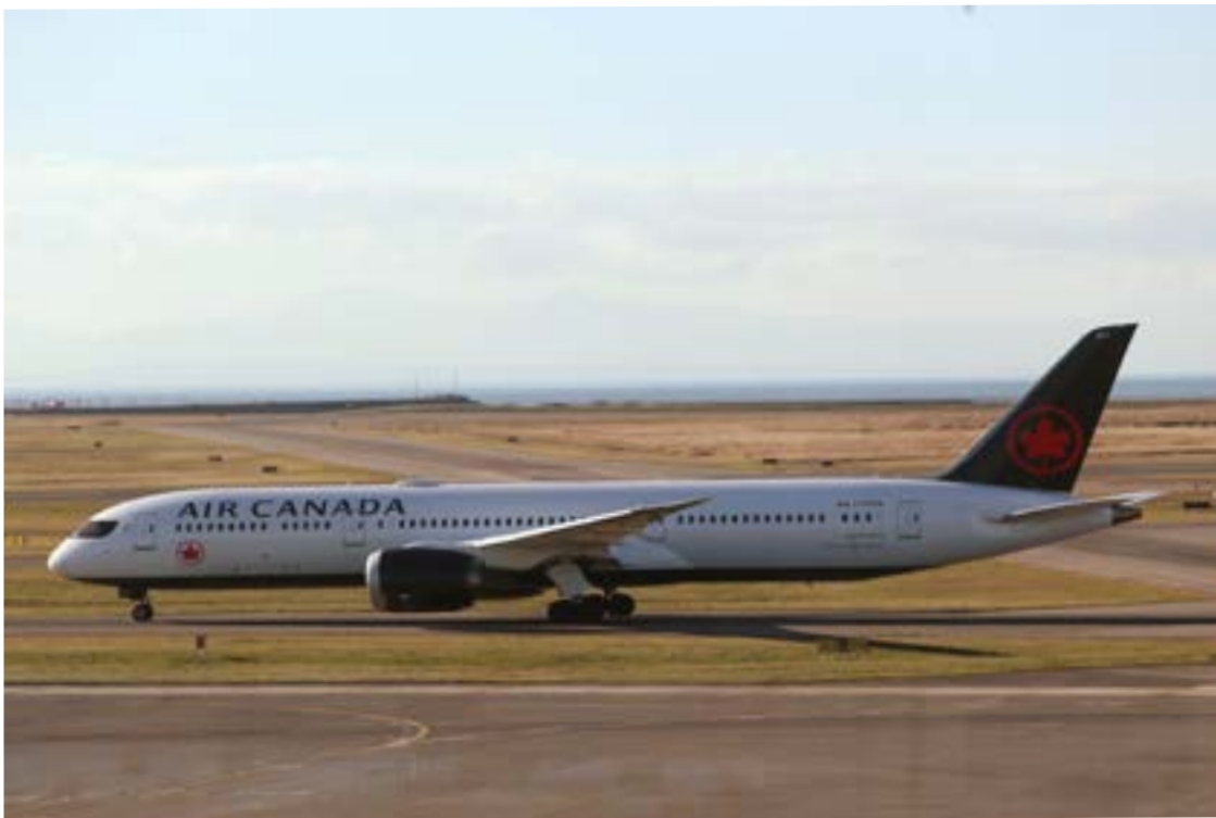
FILE PHOTO: An Air Canada Boeing 787 airplane is pictured at Vancouver's international airport in Richmond,