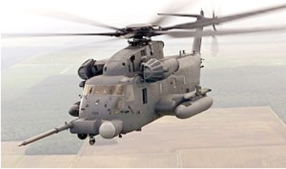
The Jolly Green Giant HH-3E rescue helicopter.

The Air Force lost a couple of airplanes in such hazardous duty. Rees was awarded the Distinguished Flying Cross and an Air Medal. He spent the Cold War and much of the early 1950s at Kelly and Travis Air Force bases, supervising disaster preparations at loading stations that sent cargo to military overseas. In the 1960s and early 1970s, Rees learned about ground electronics in Colorado and was stationed in Germany, then flew Jolly Green Giant HH-3E rescue helicopters, flying out of an Air Force base in Thailand into Vietnam to pick up downed pilots during the war. A North Dakota base, another missile and bomber station and then England for two years finished Lt. Col. Rees’s 26 1/2 years of active duty in 1975.