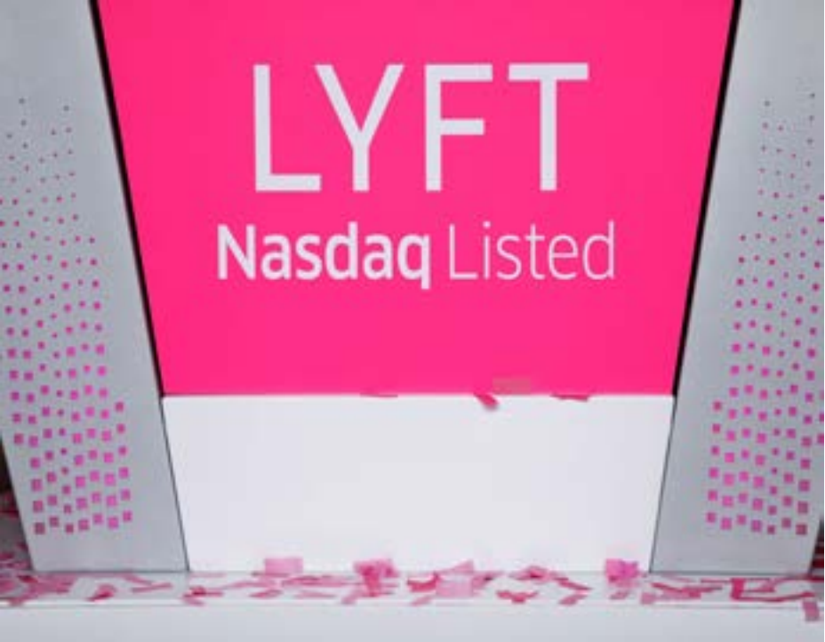
FILE PHOTO: Lyft supporters gather for the Lyft IPO as the company lists its shares on the Nasdaq in the first-ever ride-hailing initial public offering, in Los Angeles