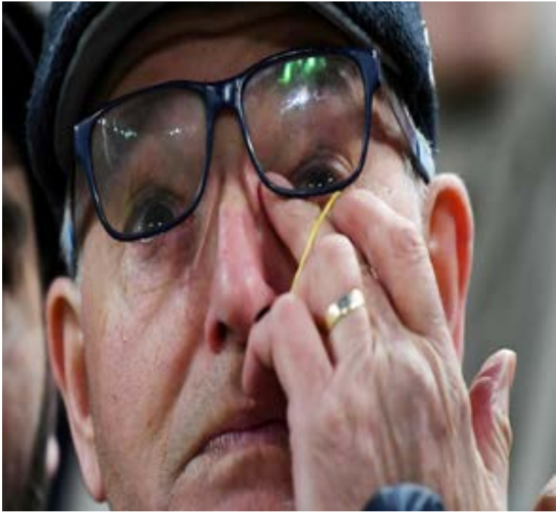
Soccer Football - Premier League - Tottenham Hotspur v Crystal Palace - Tottenham Hotspur Stadium, London, Britain - April 3, 2019 Fans before the match REUTERS/Dylan Martinez .