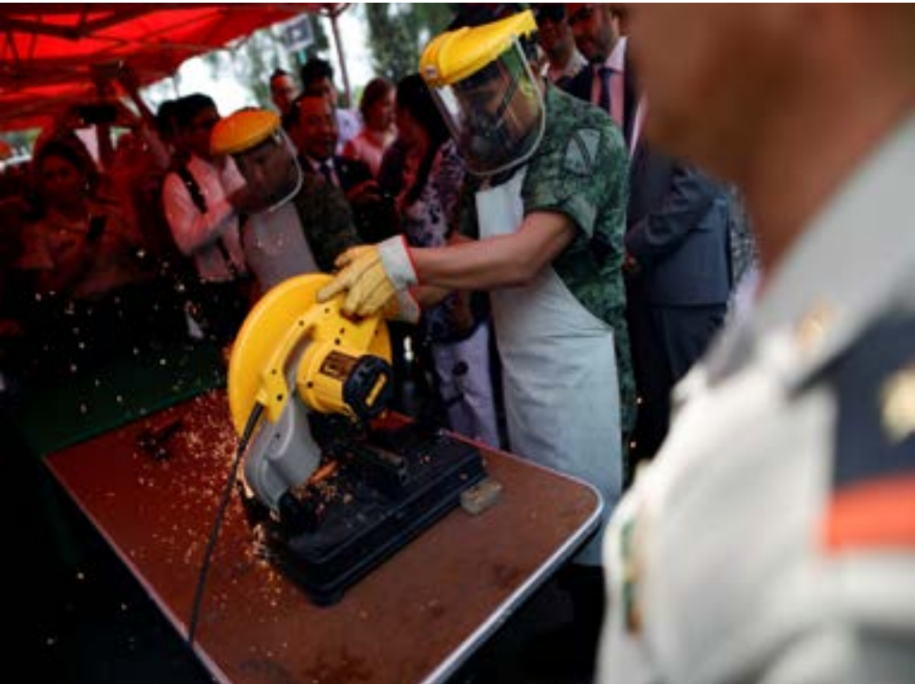
A soldier destroys weapons delivered by citizens as part of a voluntary disarmament program in Mexico City