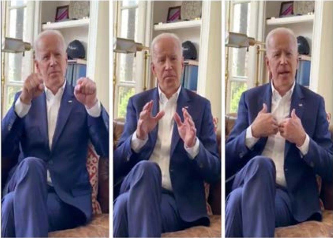
Former U.S. Vice President Joe Biden appears in a video in which he pledges to be “more mindful about respecting personal space in the future\