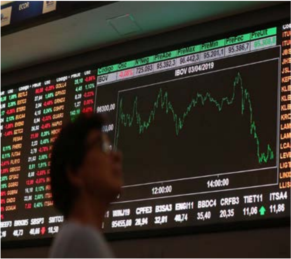
A woman looks at an electronic board showing the graph of the recent fluctuations of market indices on the floor of Brazil’s B3 Stock Exchange in Sao Paulo