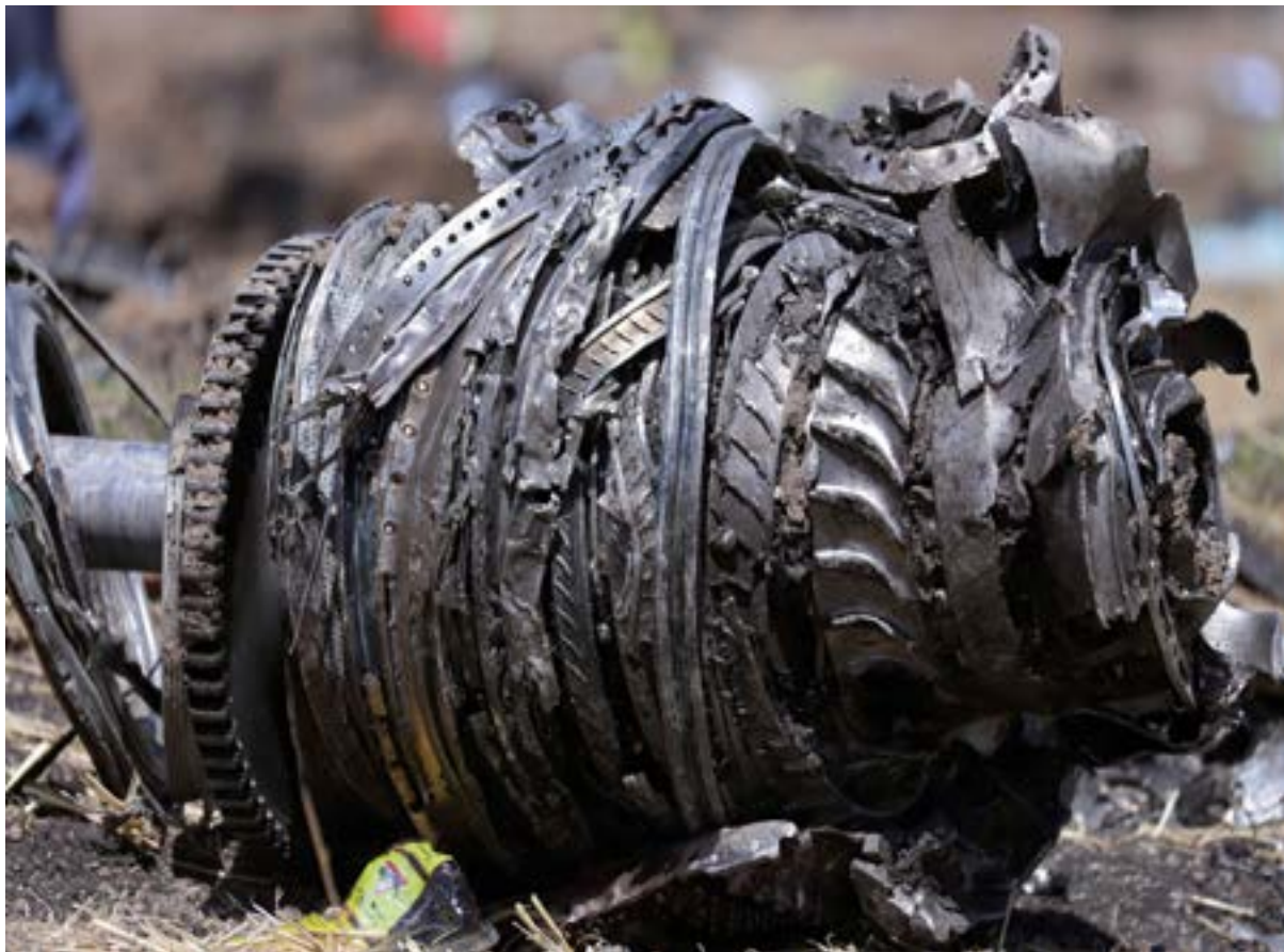
FILE PHOTO: Airplane engine parts are seen at the scene of the Ethiopian Airlines Flight ET 302 plane crash, near the town of Bishoftu

In a statement, Boeing said: "We urge caution against speculating and drawing conclusions on the findings prior to the release of the flight data and the preliminary report."