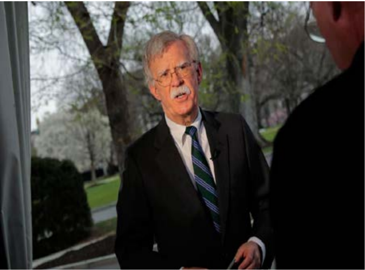
U.S. National Security Advisor John Bolton speaks during an interview at the White House in Washington, U.S., March 29, 2019.

Oil provides 90 percent of export revenue for OPEC member Venezuela. The United States imposed sanctions on Venezuela's state-owned oil company PDVSA in January, preventing U.S. companies from dealing with it unless revenues went to a fund available to Guaido. The Trump administration has not yet slapped sanctions on companies from other countries that do business with PDVSA - but U.S. officials have been having "conversations" with oil trading houses and governments around the world to convince them to scale down their dealings with Maduro, Trump's Venezuela envoy Elliott Abrams said earlier on Friday. U.S. National Security Advisor John Bolton speaks during an interview at the White House in Washington, U.S., March 29, 2019. Russia and China support Maduro, who has said Guaido is a puppet of Washington. Maduro retains control of state functions and the loyalty of the country's military.