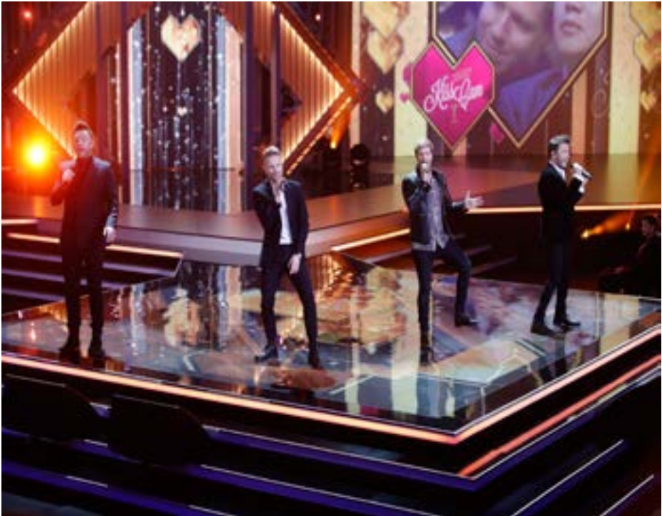
Westlife perform during the annual German film and television awards ‘Golden Camera’ (‘Die Goldene Kamera’) of German TV magazine ‘HoerZu’ in Berlin, Germany, March 30, 2019.