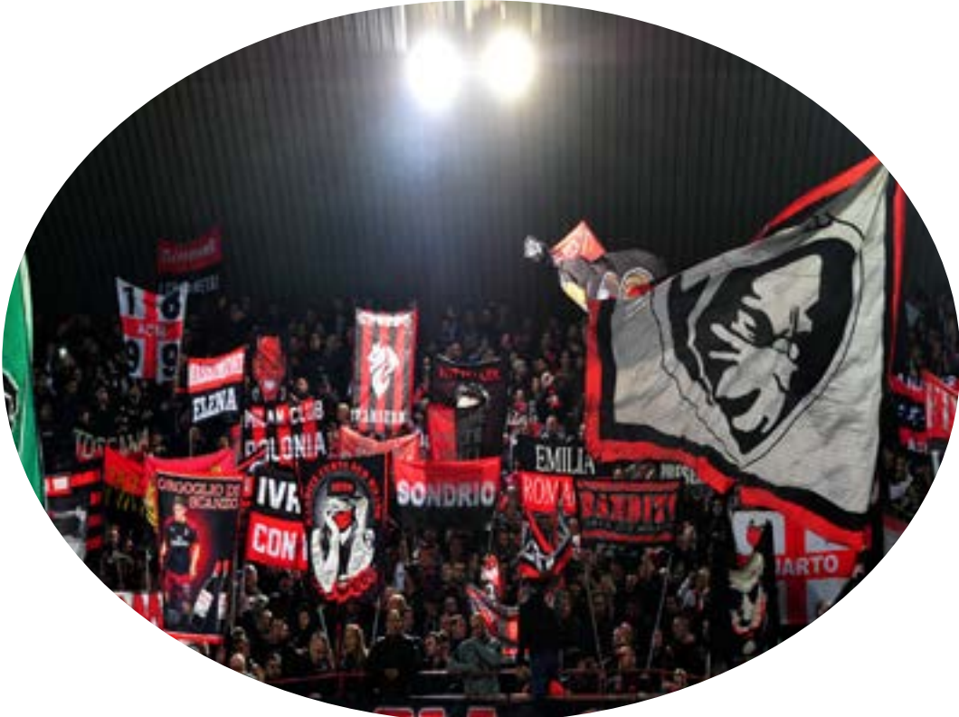
Soccer Football - Serie A - Sampdoria v AC Milan - Stadio Comunale Luigi Ferraris, Genoa, Italy - March 30, 2019 General view of AC Milan fans inside the stadium during the match