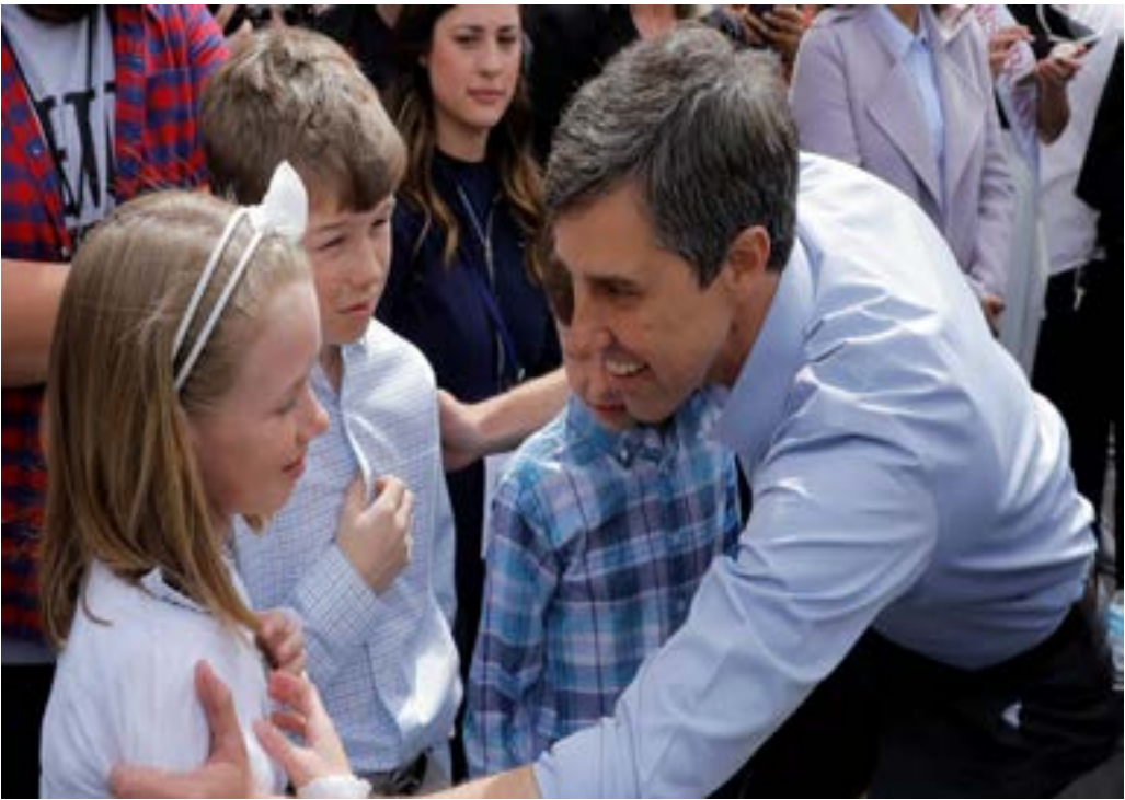
Democratic 2020 U.S. presidential candidate Beto O’Rourke poses for a photo with supporters during a kickoff rally on the streets of El Paso, Texas, March 30, 2019.

O’Rourke, who announced his White House campaign on March 14, shot to national prominence last year in an unexpectedly close race against incumbent Texas Republican Senator Ted Cruz.