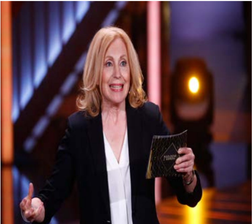
Maren Kroymann presents the nominees for Best Actress during the annual German film and television awards ‘Golden Camera’ (‘Die Goldene Kamera’) of German TV magazine ‘HoerZu’ in Berlin, Germany, March 30, 2019.