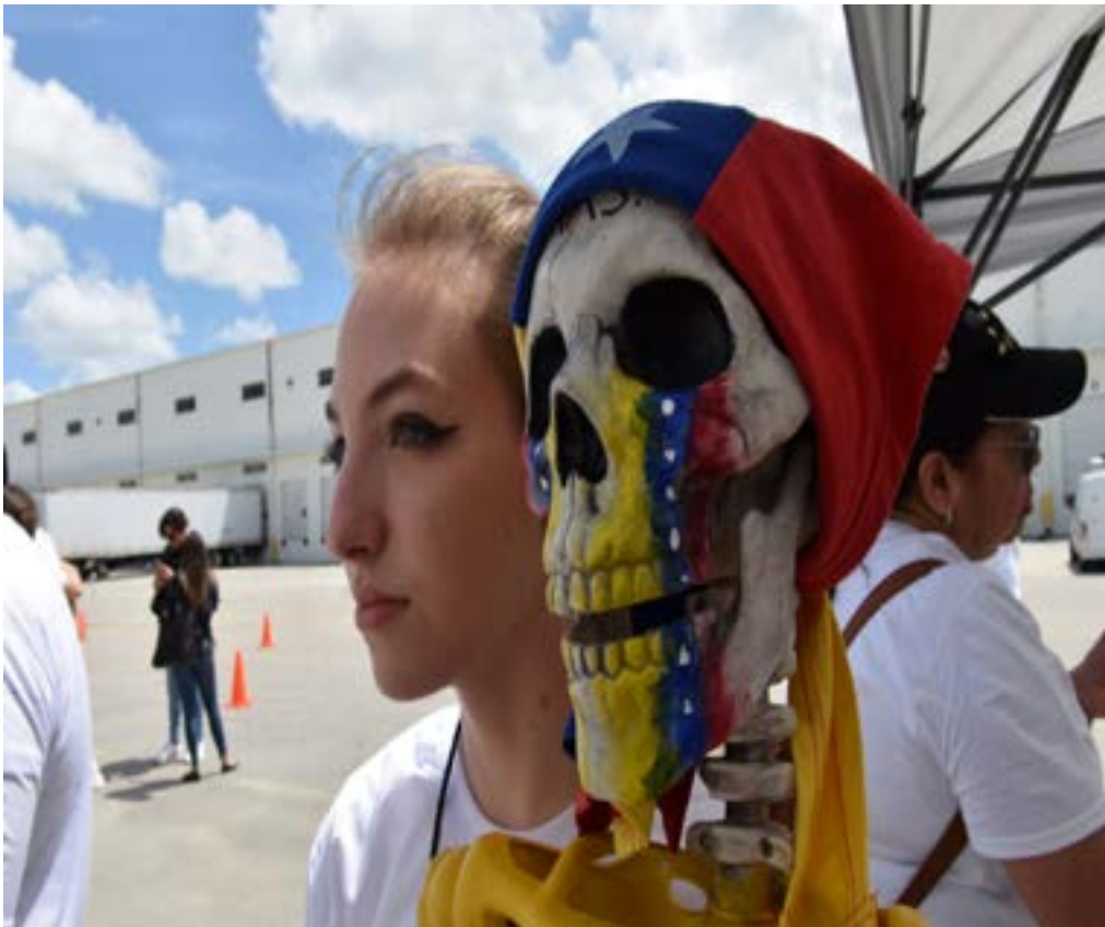
Venezuelan exiles hold a humanitarian collection drive for Venezuela, in Miami