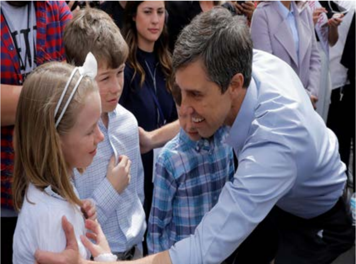
Democratic 2020 U.S. presidential candidate Beto O’Rourke hugs his children at a kickoff rally on the streets of El Paso