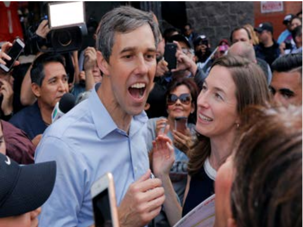
Democratic 2020 U.S. presidential candidate Beto O’Rourke and his wife Amy interact with supporters during a kickoff rally on the streets of El Paso