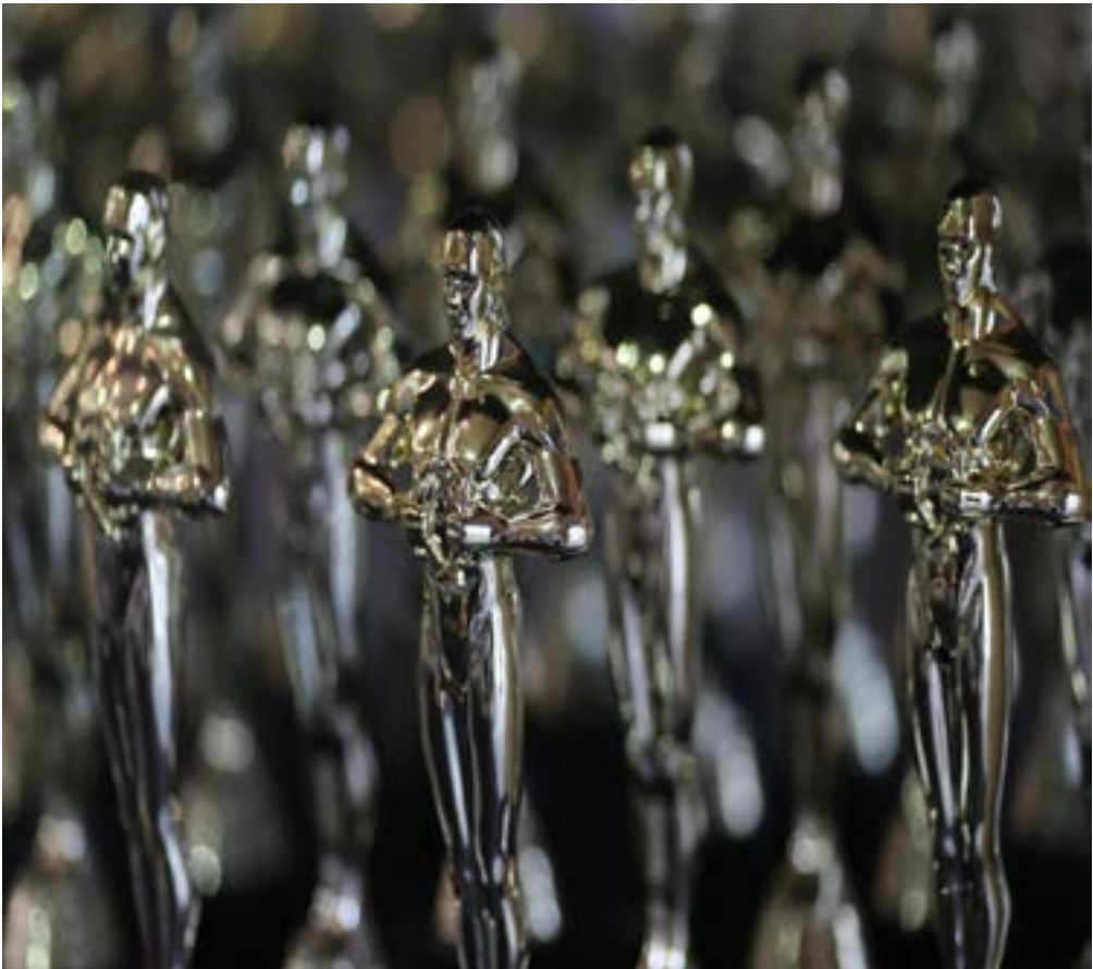
A store sells souvenir awards outside the Dolby Theatre before the 91st Academy Awards in Hollywood, Los Angeles