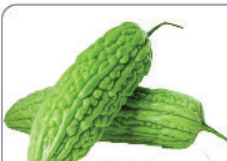
苦瓜 Bitter melon