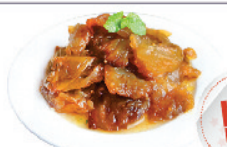
紅海蜷頭(AAAA) Red Salted Jellyfish