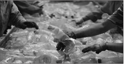
China no longer wants trash from the U.S. and other countries.

So, where will our waste go when China stops importing it? Action will need to come soon: in Hong Kong, mountains of paper waste that would normally go to China have been piling up since a July ban on 24 types of "foreign garbage." That ban is already driving up the prices of paper products. A paper mill manager in southern China told Reuters in September that the price of finished paper had doubled as a result, from 3,000 yuan (US $453) per ton to 6,000 yuan ($906) per ton. Stuart Foster from Recoup, the UK's national charity for developing plastics recycling, told The Guardian that there were inklings of possible import restrictions years ago. However, there was no action taken in the UK. This is despite the fact that, Foster says, that this could be an opportunity for the UK to create their own plastics infrastructure, which could add to the economy.