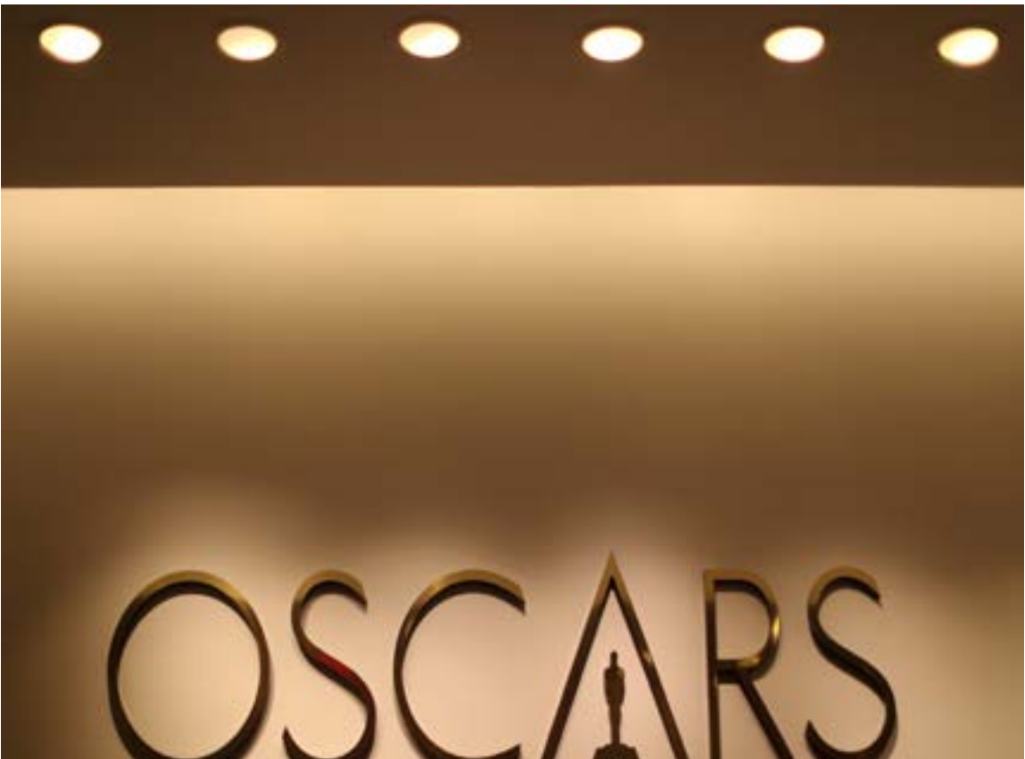
A store sells Oscars souvenirs outside the Dolby Theatre before the 91st Academy Awards in Hollywood, Los Angeles, California, U.S., February 14, 2019.