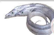
新鮮帶魚 Fresh Belt Fish