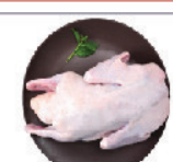
无头鴨 Headless Duck