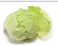
台灣高麗菜 Taiwan Cabbage