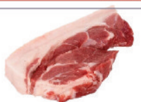
帶骨夾心肉 Pork Butt With Bone