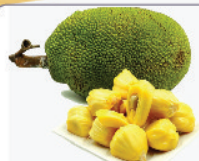
菠萝蜜 Jack Fruit