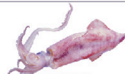
新鮮魷魚 Fresh Squid