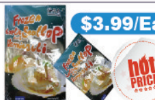
海洋島 蒜蓉扇貝 Frozen Garlic Scallop 200G