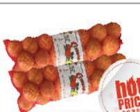
德州橙 Oranges 10Lbs