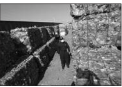
are recyclable but are not. Customs officers check on imported solid waste

"The fellow said we don't take plastic anymore," Satish says. "It should go in the trash." The facility had been shipping its plastic to China, but suddenly that was no longer possible. The U.S. exports about one-third of its recycling, and nearly half goes to China. For decades, China has used recyclables from around the world to supply its manufacturing boom. But this summer it declared that this "foreign waste" includes too many other nonrecyclable materials that are "dirty," even "hazardous." In a filing with the World Trade Organization the country listed 24 kinds of solid wastes it would ban "to protect China's environmental interests and people's health." The complete ban takes effect Jan. 1, but already some Chinese importers have not had their licenses renewed. That is leaving U.S. recycling companies scrambling to adapt. "It has no value ... It's garbage." Rogue Waste Systems in southern Oregon collects recycling from curbside bins, and manager Scott Fowler says there are always nonrecyclables mixed in. As mounds of goods are compressed into 1-ton bales, he points out some: a roll of linoleum, gas cans, a briefcase, a surprising number of knitted sweaters. Plus, there are the frozen food cartons and plastic bags that many people think