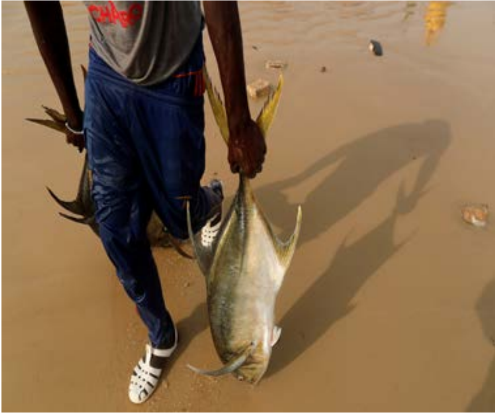
Fish seller carries fresh product that he bought from fishermen in Dakar