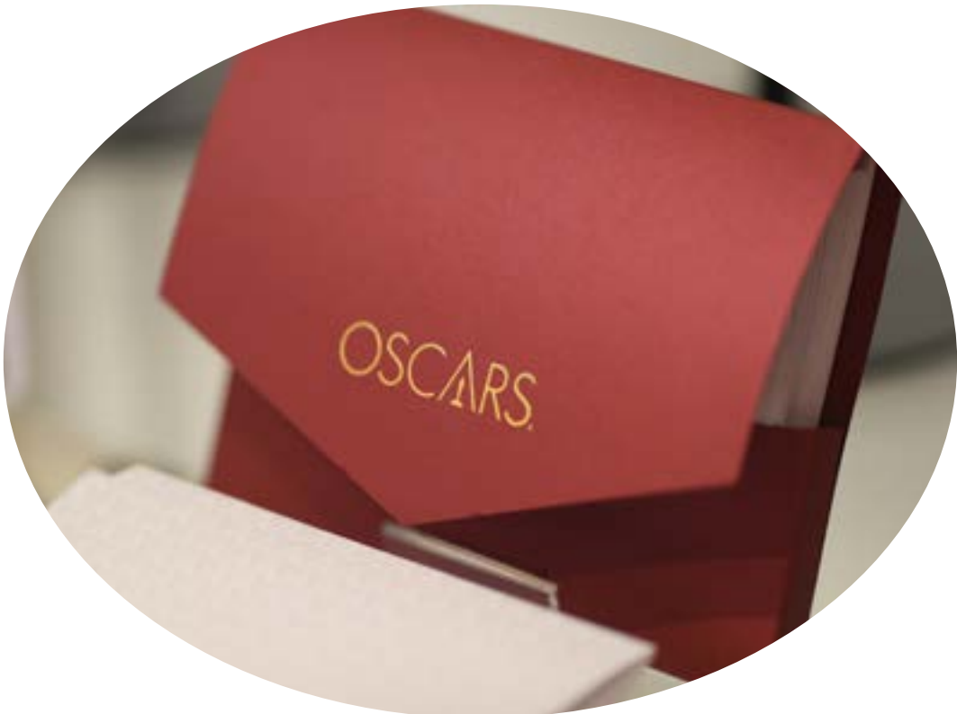
An Oscars winner's envelope is seen in a souvenir store outside the Dolby Theatre before the 91st Academy Awards in Hollywood, Los Angeles