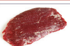
嫩炒牛肉 Flank Steak