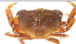
加洲大蟹 Live Dungeness Crab