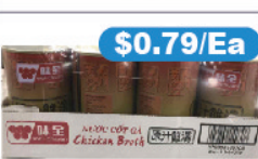
味全鸡汤 Chicken Broth