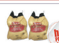
童子雞 Cornish Hen