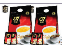
G7 三合一咖啡 Coffee Mix 3 in 1 166x100Pk