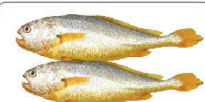
黃花魚 Yellow Croaker