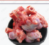
羊骨 Lamb Bone