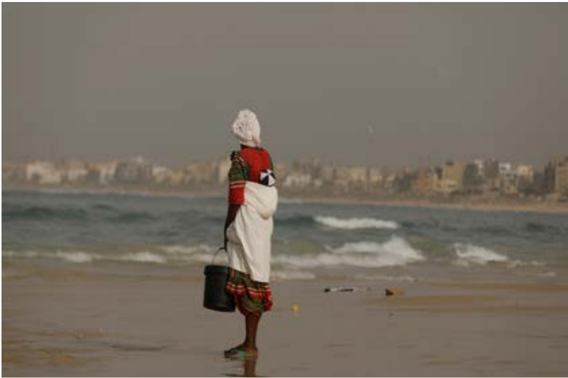
Fish seller waits to buy fresh product from fishermen at the port of Yoff in Dakar