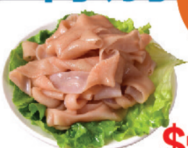
鵝腸 Goose Chitterlings