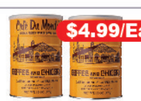
法式咖啡 French Coffee