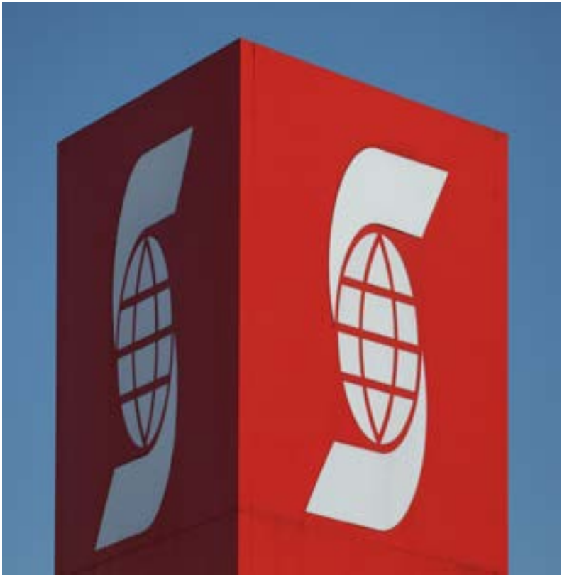
The Bank of Nova Scotia (Scotiabank) logo is seen outside of a branch in Ottawa, Ontario, Canada, February 14, 2019.