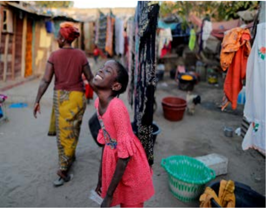
A girl laughs as she jokes with her relatives at their house corridor in Saint Louis