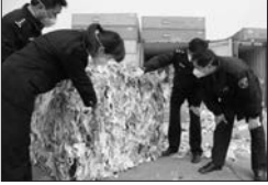
Chinese authorities inspect bales of imported waste.

Starting in January, China's government is enacting a plastic waste import ban, in an attempt to cut down on millions of tons of plastic and other recyclables they receive every year. This change may drastically affect how the world recycles and disposes of waste. The Guardian reports that, according to an analysis of customs data by Greenpeace, British companies alone have imported over 2.7 million tons of plastic waste to China and Hong Kong since 2012. According to Industry Week, China accepted 51 percent of global plastic scrap imports in 2016. The biggest chunk of that trash came from the US, where the majority of "recycled" plastics are actually shipped abroad to then be recycled; as such, trash has actually become one of the US's biggest exports. Europe, Hong Kong, Japan and Southeast Asia ship their recyclables to China as well. All of this trash has historically been used to fuel China's manufacturing industry.