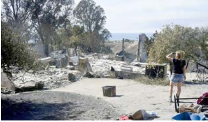
The wildfires in California have killed close to 80 people, and hundreds more are missing.

Even when you donate, there's a right way and a wrong way.