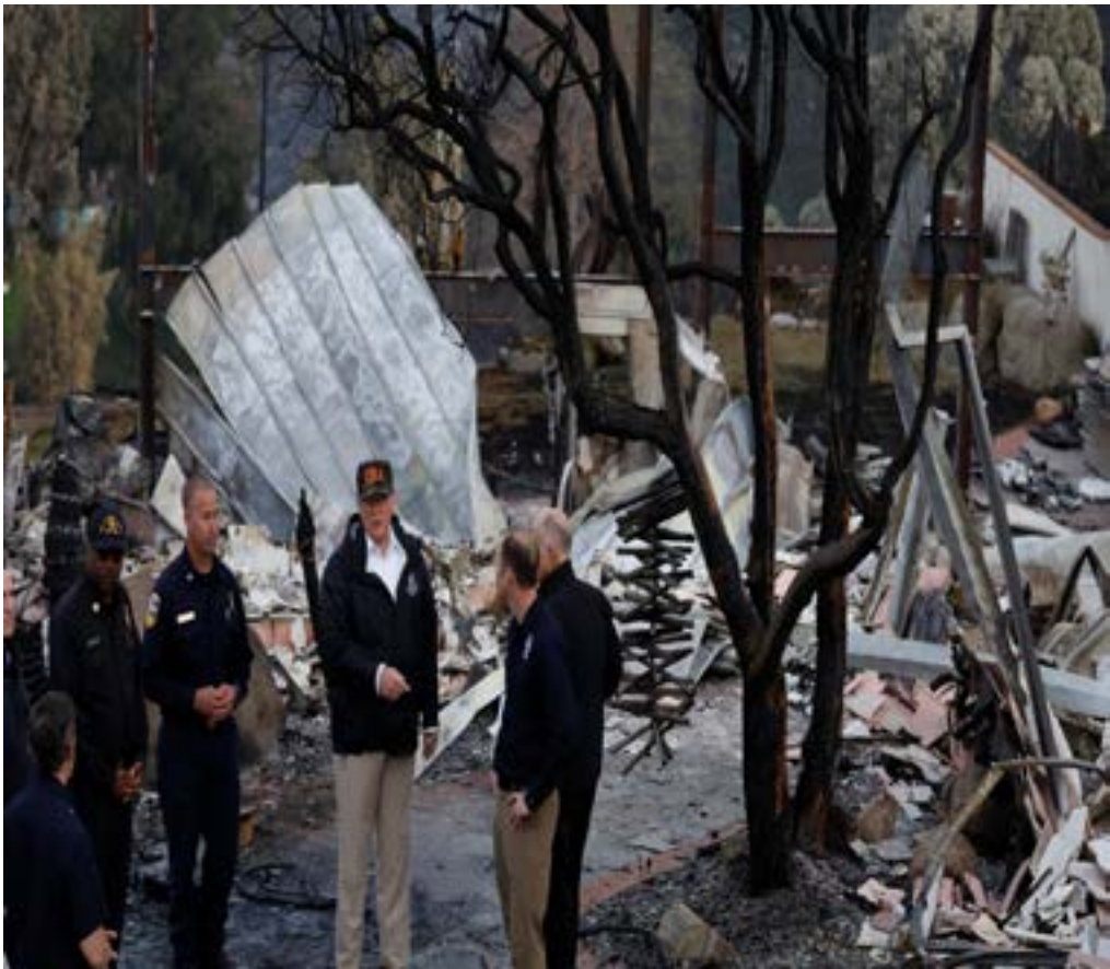
President Donald Trump surveys homes destroyed by the Woolsey fire in Malibu California