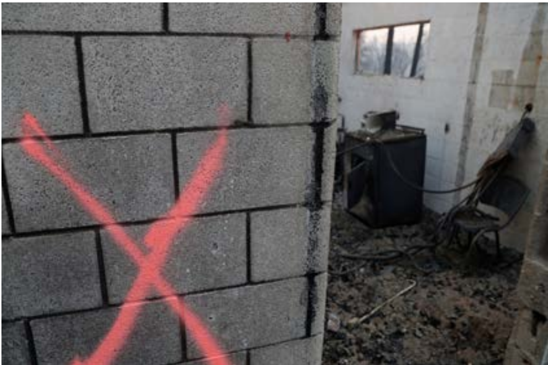
A building marked by search crews is seen in the aftermath of the Camp Fire in Paradise