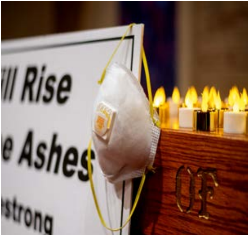
An air mask hangs on an altar during a vigil for the lives and community lost to the Camp Fire at the First Christian Church of Chico in Chico