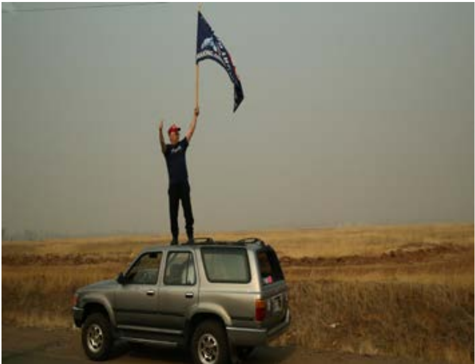
A man waves a Trump flag as the motorcade of U.S. President Donald Trump flies by after Trump visited a neighborhood recently destroyed by the Camp fire in Paradise, California, U.S.