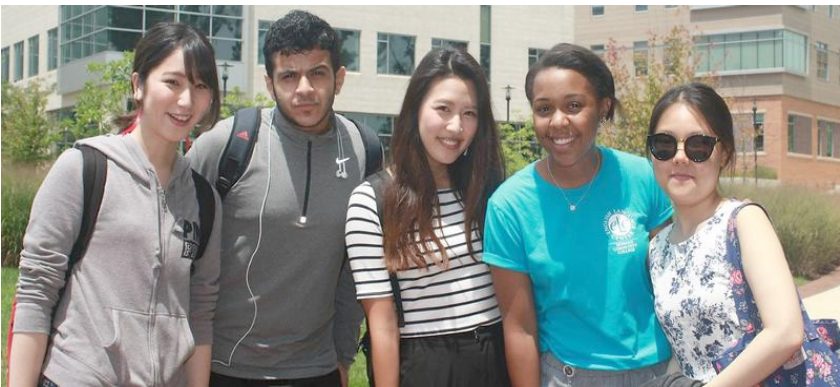
TUTE FOR URBAN RESEARCH