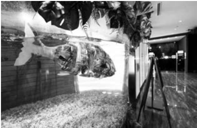
Even the fish are robotic with electric lights on their battery-powered bodies.

The reception at the Henn na Hotel east of Tokyo is eerily quiet until customers approach the robot dinosaurs manning the front desk. Their sensors detect the motion and they bellow “Welcome.” might be about the weirdest check-in experience possible, but that’s exactly the point at the Henn na (whose name means ‘weird’) chain, which bills itself as offering the world’s first hotels staffed by robots. The front desk staff are a pair of giant dinosaurs that look like cast members of the Jurassic Park movies, except for the tiny bellboy hats perched on their heads. The robo-dinos process check-ins through a tablet system that also allows customers to choose which language—Japanese, English, Chinese or Korean—they want to use to communicate with the multilingual robots. The effect is bizarre, with the large dinosaurs gesticulating with their long arms and issuing tinny set phrases. Yukio Nagai, manager at the Henn na Hotel Maihama Tokyo Bay, admits some customers find it slightly unnerving. “We haven’t quite figured out when exactly the guests want to be served by people, and when it’s okay to be served by robots,” he told AFP. But for other guests the novelty is the charm: each room is staffed with mini-robots that look a bit like spherical Star Wars droid BB-8, and help guests with everything from changing channels to playing music.