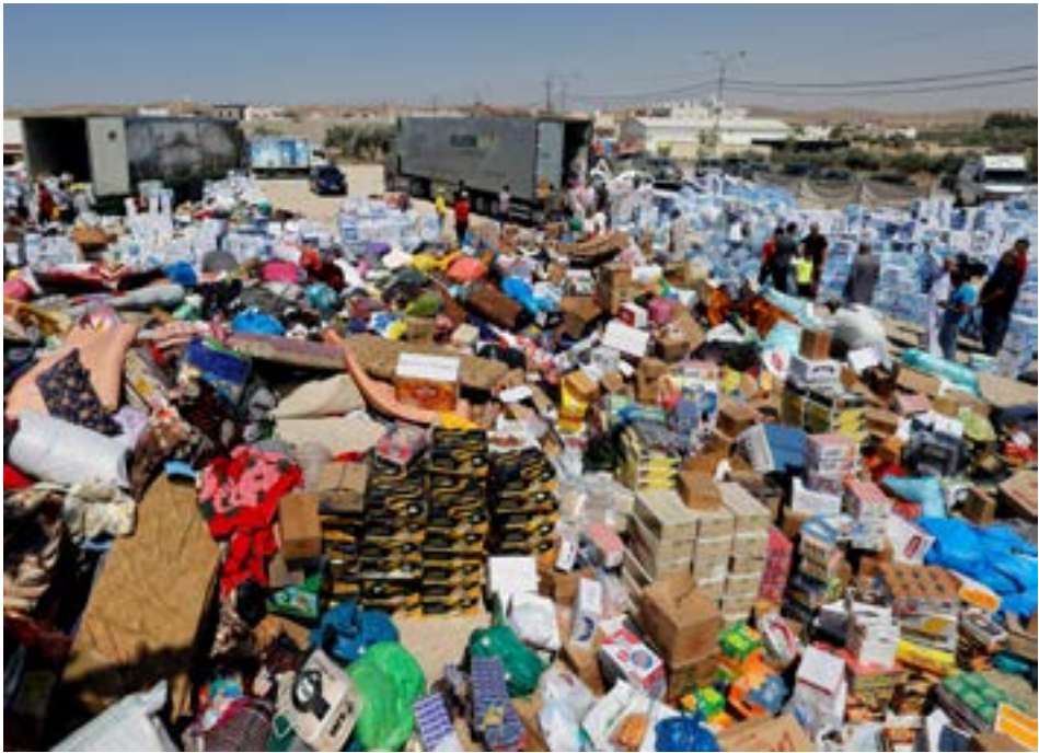
FILE PHOTO: Humanitarian aid is prepared to be delivered to Syria, in the town of Ramtha