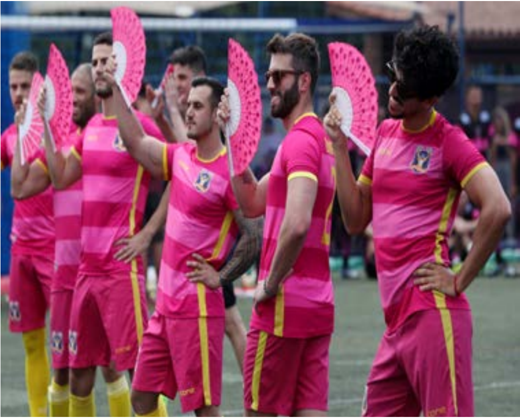
Soccer players of the Futeboys soccer team attend the opening ceremony of the Champions LiGay, a gay soccer tournament in Sao Paulo