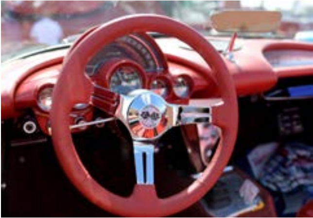
FILE PHOTO: The steering wheel of a Chevrolet Corvette is pictured before the start of the 11th rally Hamburg-Berlin Classic in Bremen