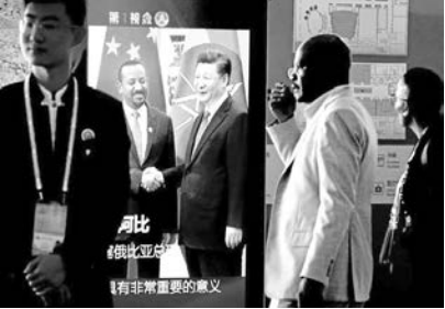
African delegates walk by a screen panel showing a footage of Chinese President Xi Jinping with Ethiopia’s Prime Minister Abiy Ahmed ahead of the Forum on China-Africa Cooperation in Beijing, Monday, Sept. 3, 2018. African leaders will likely press their Chinese hosts at a conference this week to help narrow their trade deficits with Beijing by shifting more manufacturing to their continent, the chief executive of the biggest African bank said.

Has the BRI been a success? Unfortunately there’s no straightforward way for tracking how it is progressing. Chinese officials talk mostly about topline investment in the plan and debtor countries don’t disclose their loans in any detail. Chinese lenders, including the Asia Infrastructure Investment Bank, have showcased some of the key financings but there’s no authoritative breakdown of how all the capital has been allocated or how the projects are performing.