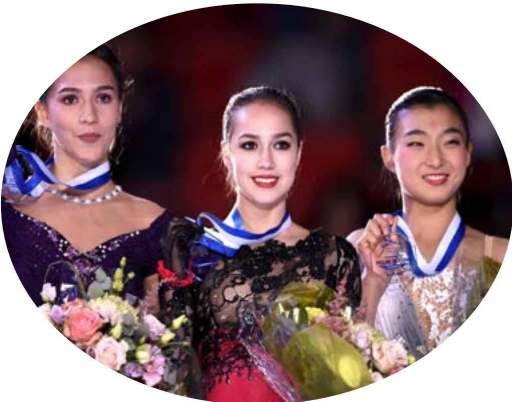
(L-R) Silver medalist Stanislava Konstantinova, gold medalist Alina Zagitova, both of Russia and bronze medalist Kaori Sakamoto of Japan pose during the victory ceremony for the ladies' competition at the figure skating ISU Helsinki Grand Prix in Helsinki, Finland November 3, 2018. ATTENTION EDITORS - THIS IMAGE WAS PROVIDED