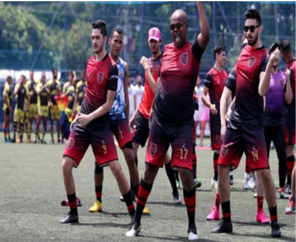
Soccer players of the Bulls soccer team attend the opening ceremony of the Champions LiGay, a gay soccer tournament in Sao Paulo