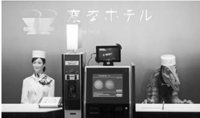
In Pictures: Japan’s First Robot-Operated Hotel

But Nagai said relying on robots for everything from front desk duty to cleaning had proved an efficient choice in a country with a shrinking labour market. “It’s becoming difficult to secure enough labour at hotels. To solve that problem, we have robots serving guests.”