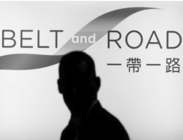
China celebrated the fifth anniversary of the Belt and Road Initiative this week.

Unsurprisingly, the propaganda push from media like China Global Television Network, the international incarnation of state broadcaster CCTV, is that things are going even better than expected. “The Belt and Road Initiative is like welcome rain after a long drought,” it ventured last week, before switching metaphors to describe how friends of the programme have been getting a “free ride on the Chinese fast-train”. Railways are a feature in the anniversary coverage, which has tried to talk about some of the outcomes of the initiative, including the 10,000th journey involving freight trains between China and Europe. Other newspapers also talked about the savings in travel time on Belt and Road journeys, courtesy of freshly dug tunnels through the mountains of Uzbekistan, or newly laid track along the Kenyan coast. In loftier prose, the Chinese media has championed BRI as an opportunity for all, with benefits that more than transcend the train timetables. “The BRI focuses on promoting the connectivity of the land, sea, air and the internet,” China’s state television channel enthused in the kind of celebration that makes critics of Belt and Road cringe. “It