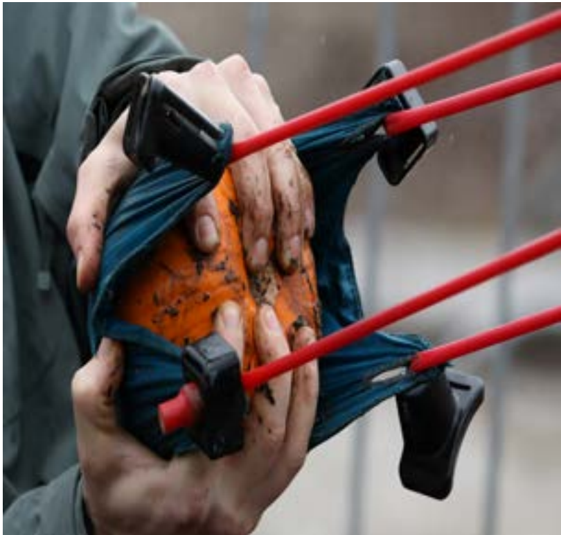
A man prepares to launch a pumpkin using a giant slingshot in Ottawa