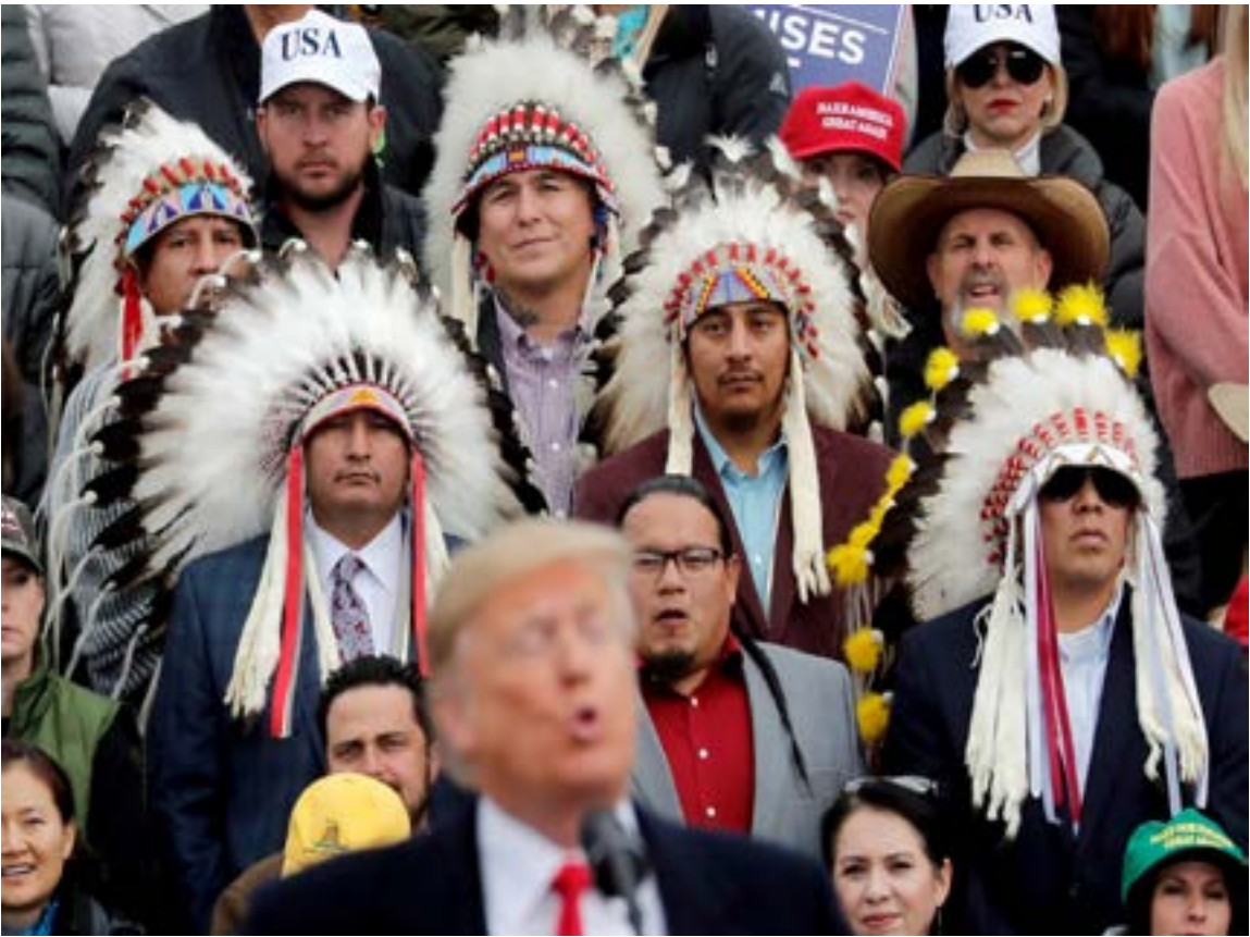
Supporters listen as U.S. President Donald Trump speaks during a campaign rally at the Bozeman Yellowstone International Airport in Belgrade