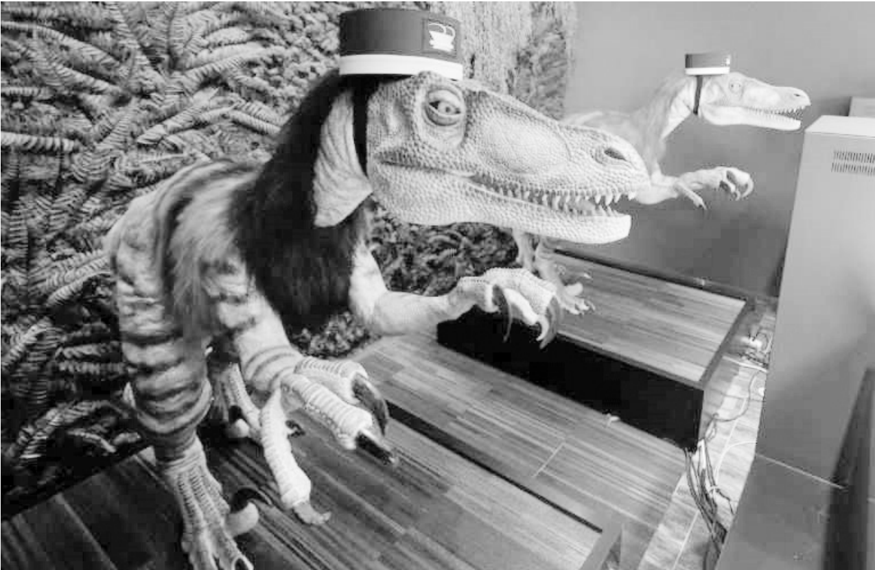
Dinosaur robots wait to check in customers at the Henn na hotel