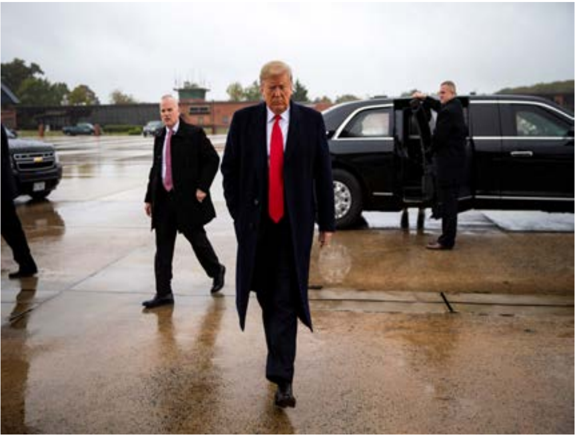
U.S. President Donald Trump speaks about the shooting in Pittsburgh, under the wing of Air Force One at Indianapolis International Airport, in Indianapolis, IN, U.S., October 27, 2018.