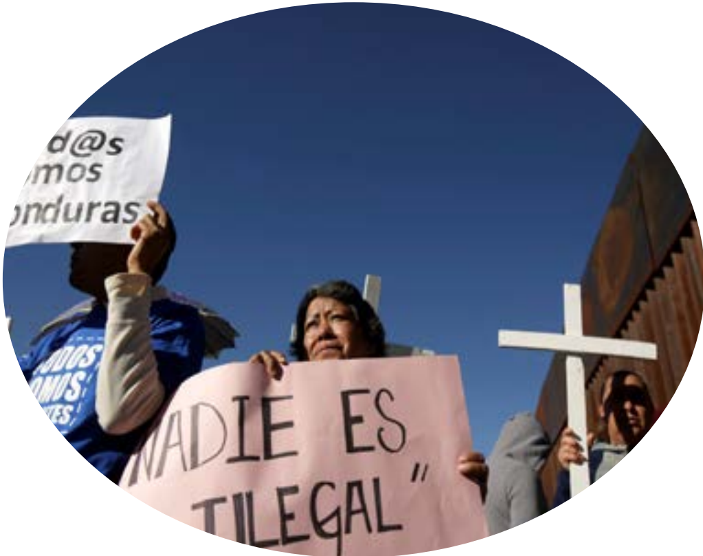
People hold placards on the Mexican side of the border fence between Ciudad Juarez and El Paso, during a binational mass in support of migrants and in memory of those who died trying to cross illegally into the U.S., in Ciudad Juarez