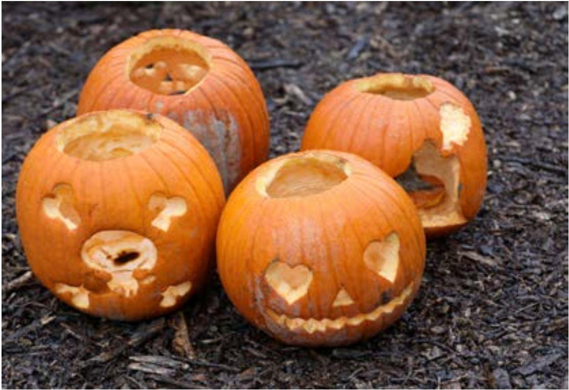
Carved pumpkins are seen before being launched during the Squash CF Pumpkin Launch fundraiser in Ottawa