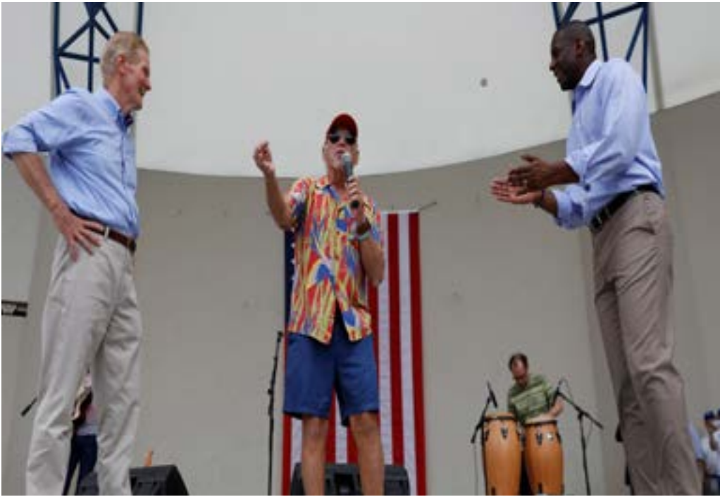
Singer Jimmy Buffett speaks with Democratic gubernatorial candidate Andrew Gillum and Senator Bill Nelson (D-FL) in West Palm Beach, Florida