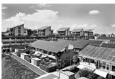
Babcock Ranch may be giving us a peek of tomorrow's suburbia. Local criticism of the development so far has focused on the environmental impacts of its footprint.