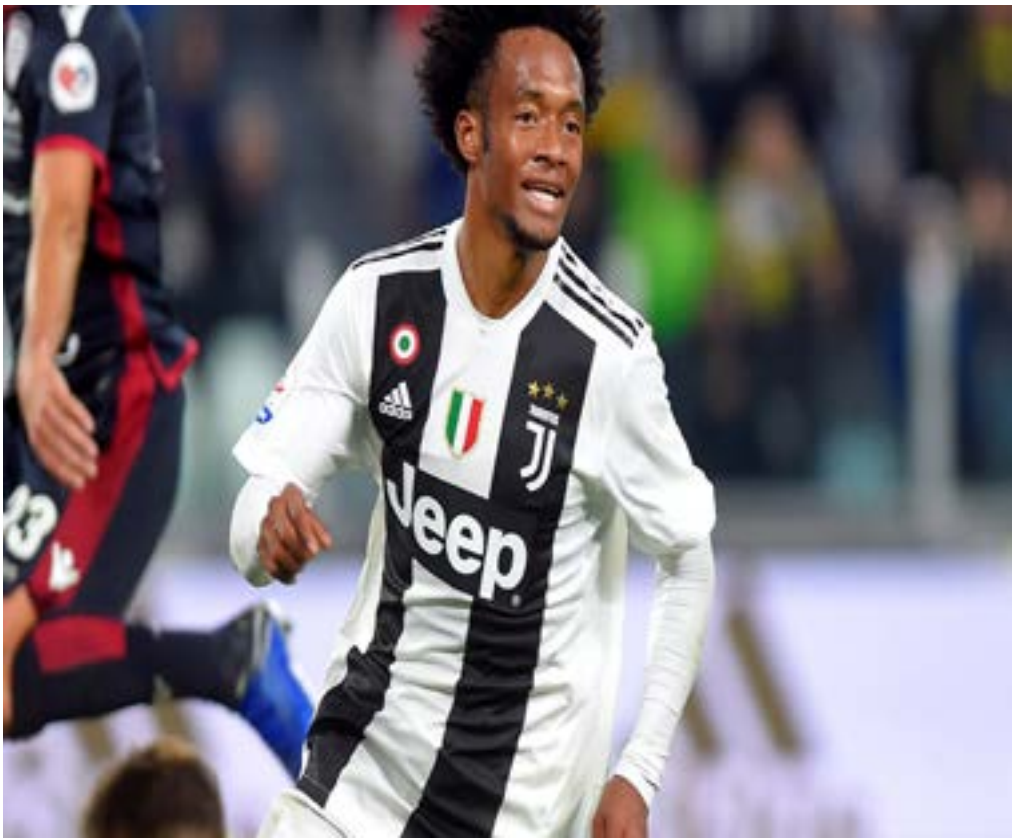
Soccer Football - Serie A - Juventus v Cagliari Calcio - Allianz Stadium, Turin, Italy - November 3, 2018 Juventus' Juan Cuadrado celebrates scoring their third goal