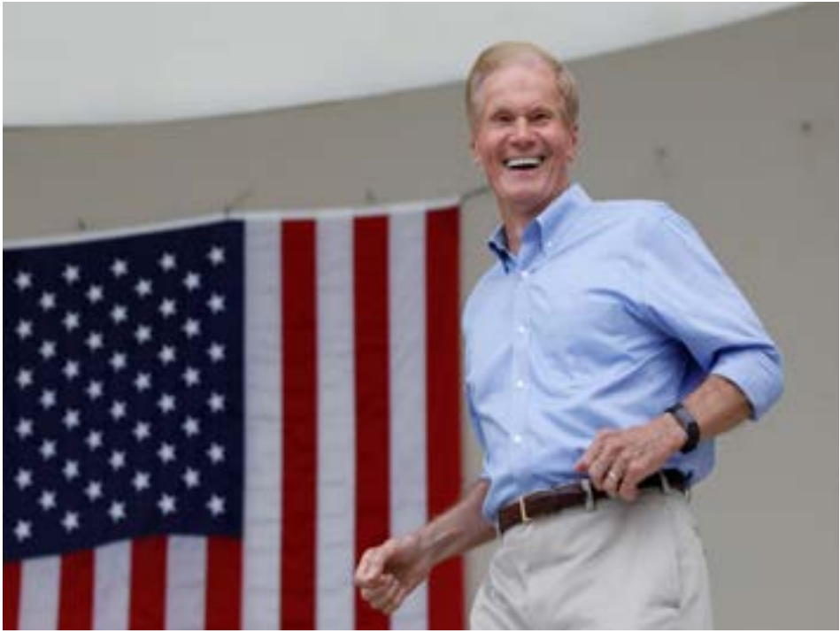
Senator Bill Nelson (D-FL) smiles in West Palm Beach, Florida