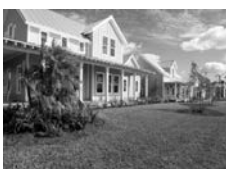
The houses at Babcock Ranch range from about 1,500 to 4,000 square feet. Built by a range of homebuilders, they are required to meet at least a bronze standard of certification from the Florida Green Building Coalition. (Babcock Ranch)

Kitson wants his critics to see the town firsthand before passing judgment. "They think they'll come in and [it'll be] like George Jetson, but it's not. It's an old-town feeling with all of those modern conveniences and technology of today." He acknowledges that some will question the choices that were made for Babcock Ranch on environmental grounds, and whether it can call itself fully sustainable when, for example, residents still need cars to commute to jobs in other towns, and the housing stock is larger detached homes rather than higher-density units.