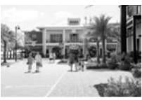
Founder's Square, the development's town center, already has a health and wellness center, a co-working space, and a gastropub.

from the $190,000s to more than half a million dollars. The sales pitch rests on their high-tech and green features. These are Alexa-controlled smart homes with 1-gigabit fiber internet and wiring for electric cars in every garage; kitchens and laundry rooms piped for natural gas cooktops, ranges, and dryers; and metal roofs to reduce heating and cooling costs.