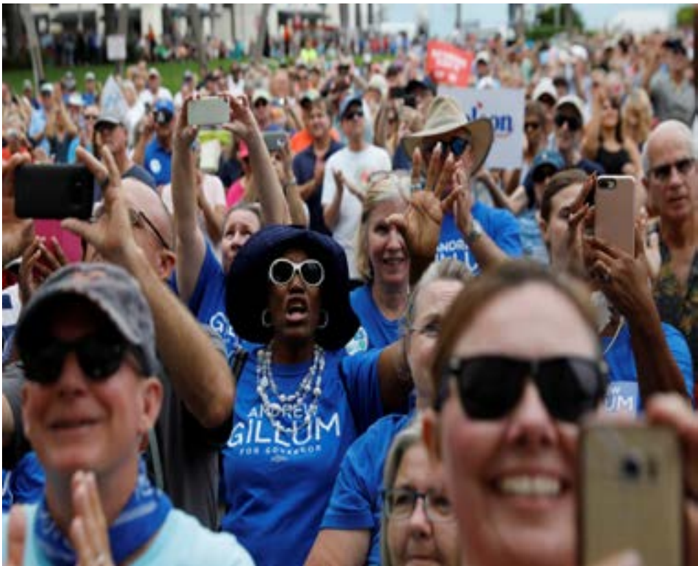
Supporters of Democratic gubernatorial candidate Andrew Gillum cheer in West Palm Beach, Florida