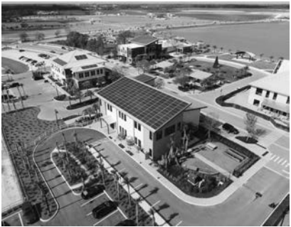
An aerial view of Babcock Ranch near Fort Myers, Florida, which is projected to have 50,000 residents by the time it's completed.

Overview People are starting to move into Babcock Ranch, an ambitious development in Florida more than a decade in the making. With a solar field and self-driving shuttles, it's a suburb that its creators hope will be revolutionary.