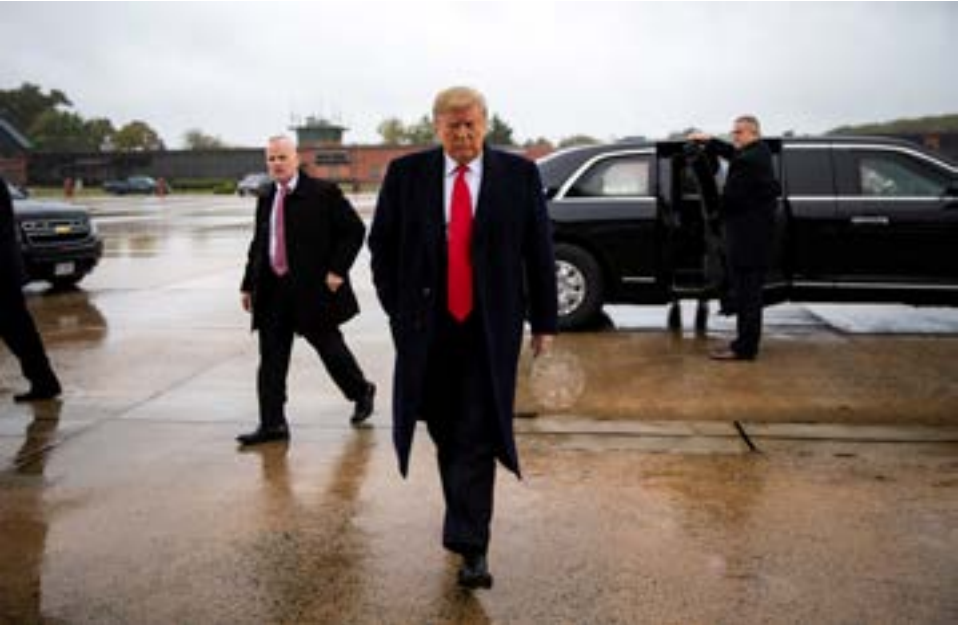
U.S. President Donald Trump arrives to speak about the shooting in Pittsburgh, under the wing of Air Force One at Joint Base Andrews in Maryland, U.S., before traveling to Indiana and Illinois, October 27, 2018.

"America is booming. Republicans passed a massive tax cut for working families and we will soon follow it up with another 10 percent tax cut for the middle class," Trump said, standing in a Belgrade, Montana, airfield with Air Force One as a backdrop. U.S. President Donald Trump arrives to attend a campaign rally for Republican U.S. Senate candidate Matt Rosendale at the Bozeman Yellowstone International Airport in Belgrade, Montana, U.S., November 3, 2018. REUTERS/Carlos Barria Last December, Trump signed into law the largest tax overhaul since the 1980s, which slashed the corporate rate to 21 percent from 35 percent and temporarily reduced the tax burden for most individuals as well. The appearance was intended to boost the campaign of Matt Rosendale, the Republican state auditor challenging Democratic U.S. Senator Jon Tester. Trump called out Tester for his vote against his most recent Supreme Court nominee, saying "what he did was terrible." Republicans in many competitive suburban districts have tried to focus their campaign messages on the robust economic growth, though in his campaign appearances Trump has also focused on his hard-line immigration stance as he looks to stem the illegal