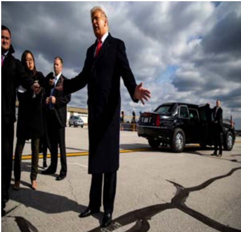
U.S. President Donald Trump speaks about the shooting in Pittsburgh