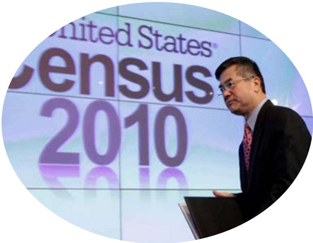
FILE PHOTO: U.S. Commerce Secretary Gary Locke arrives at the presentation of the 2010 Census U.S. population at the National Press Club in Washington