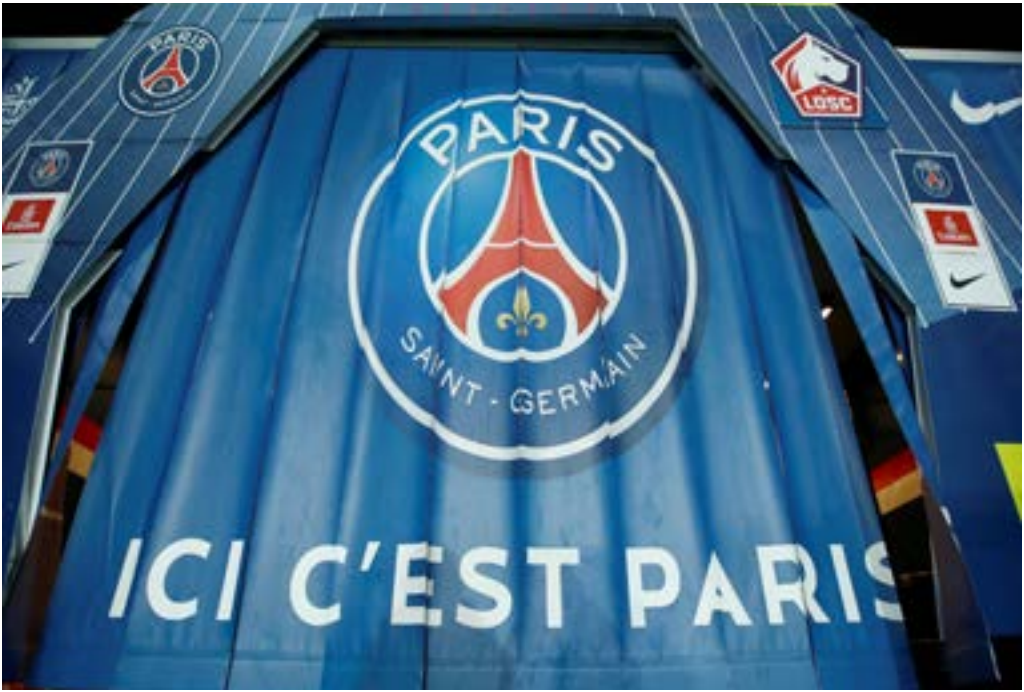
Soccer Football - Ligue 1 - Paris St Germain vs Lille - Parc des Princes, Paris, France - November 2, 2018 General view inside the stadium before the match