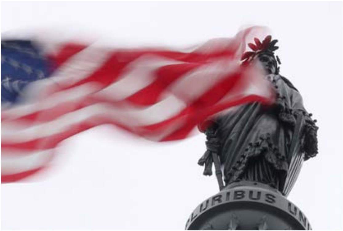
The U.S. flag flies near the Statue of Freedom atop the U.S. Capitol in Washington