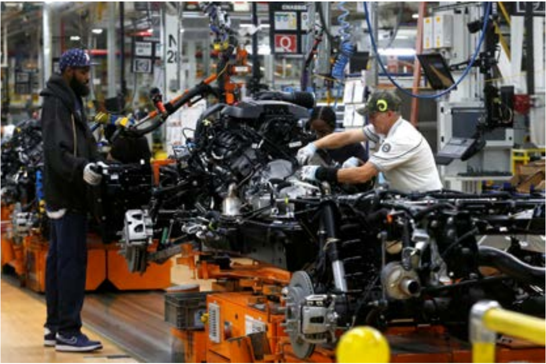
Fiat Chrysler Automobiles assembly workers build 2019 Ram pickup trucks at the FCA Sterling Heights Assembly Plant in Sterling Heights, Michigan