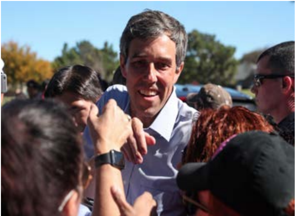
U.S. Rep. Beto O’Rourke (D-TX), candidate for U.S. Senate greets supporters at a campaign rally in Carrollton