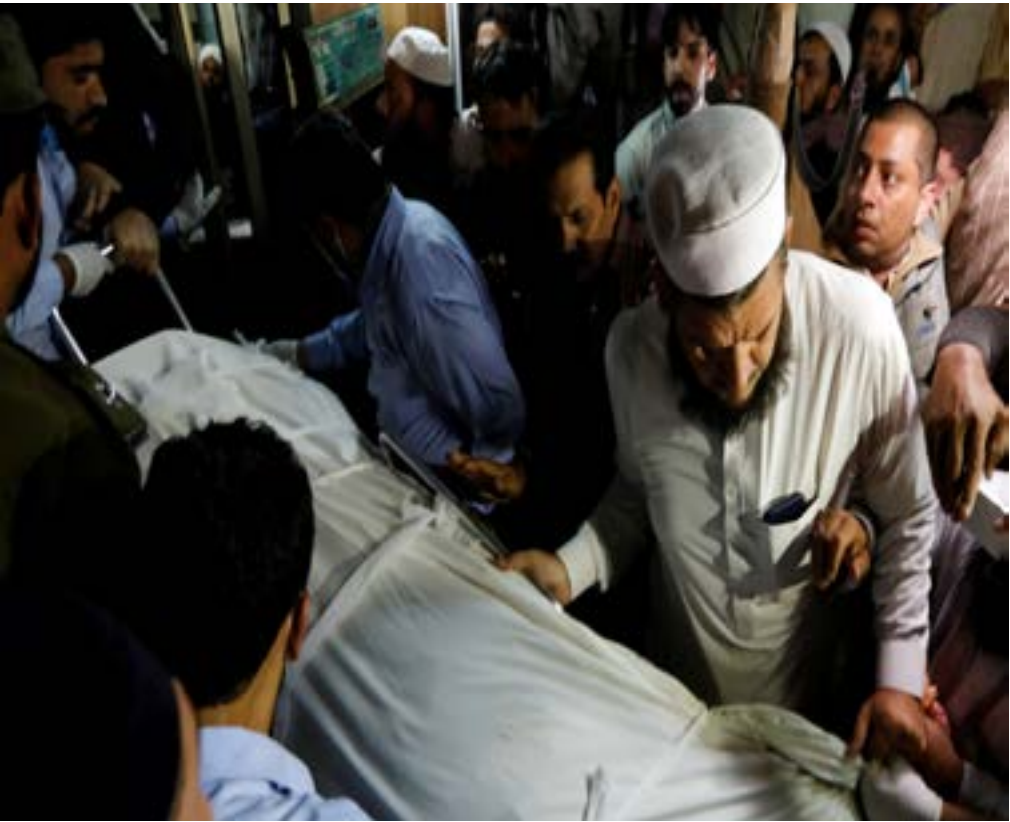
Men move the body of Muslim cleric Sami ul-Haq, from the hospital in Islamabad