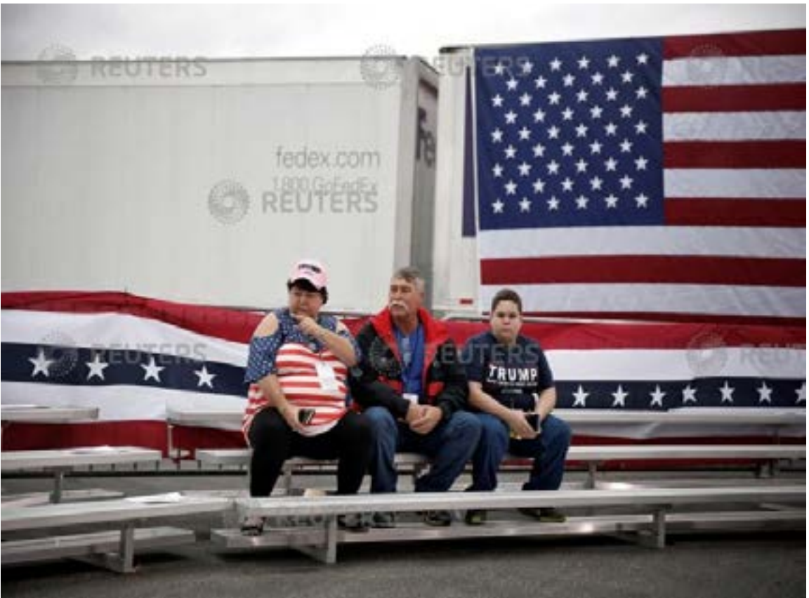
U.S President Donald Trump supporters sit on a bench ahead of his rally in Huntington, West Virginia, U.S., November 2, 2018.