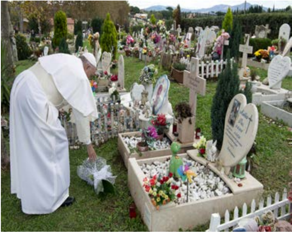
Pope Francis visit the Laurentino Cemetery before the All Souls’ Mass Day in Rome