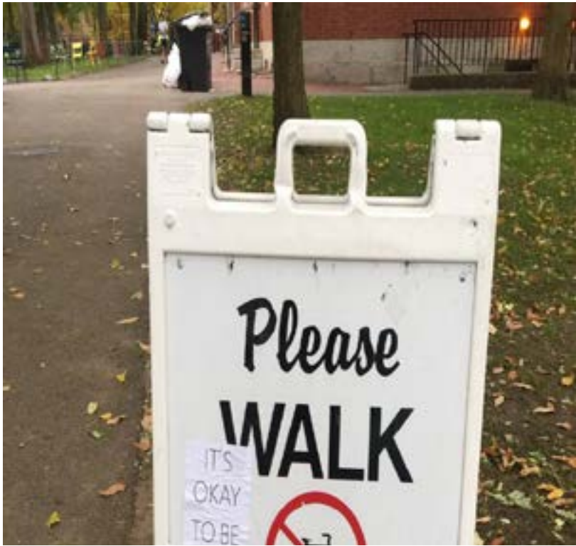
FILE PHOTO: A sign reading “It’s okay to be white” is posted on a pole in Halifax, Nova Scotia