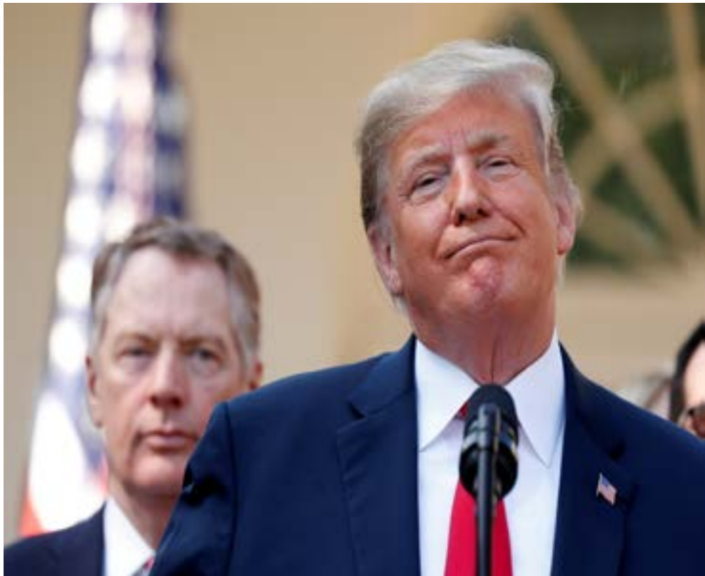
FILE PHOTO: U.S. President Donald Trump stands with U.S. Trade Representative Robert Lighthizer as he delivers remarks on the United States-Mexico-Canada Agreement (USMCA) during a news conference in the Rose Garden of the White House in Washington, U.S., October 1, 2018.

In recent days, Trump has sought to present as a threat to the United States a large group of migrants from Central America who have left poverty and violence at home and are heading slowly through Mexico toward the U.S. border. Republican Senator Chuck Grassley, an ally of the president and head of the powerful Senate Judiciary Committee, echoed some of the president's strong rhetoric about the caravan in a letter to the secretaries of the Department of Homeland Security and the State Department. In the letter, Grassley said his office had received information that several members of the caravan had "significant criminal histories" and was seeking information about "potential national security threats that reportedly exist among the members." Trump said on Wednesday the United States could send as many as 15,000 troops to the border to confront the migrant caravan, more than twice the number previously disclosed by defense officials. Republican lawmakers and other Trump supporters have applauded the deployment. But critics argue Trump has manufactured a crisis to drive Republican voters to the polls. On another immigration front, Trump said this week he would seek to scrap the constitutional right of citizenship for U.S.-born children of noncitizens and illegal immi-