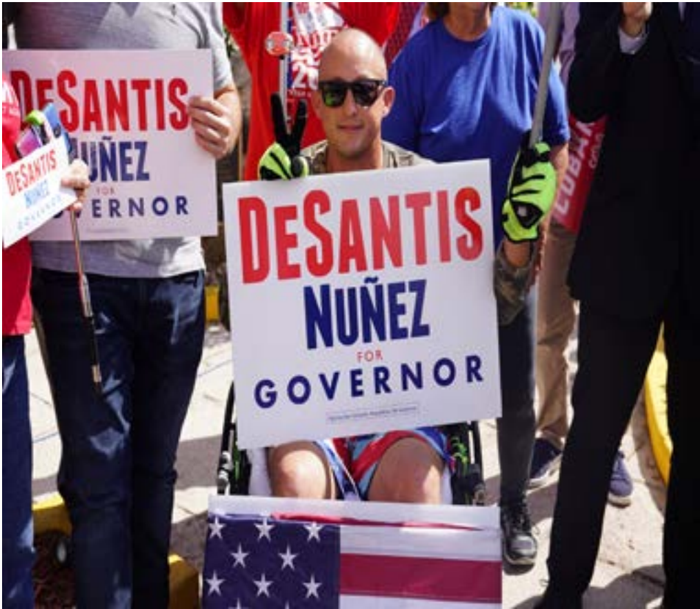
A supporter of Candidate for Governor Ron DeSantis is pictured at Versailles restaurant in the Little Havana section of Miami