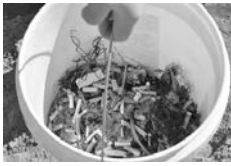
Cigarette butts collected on a Florida beach in 2010.