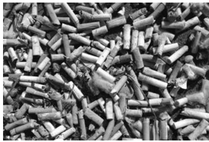
Cigarette butts collected during the 2012 International Coastal Cleanup in Oregon.