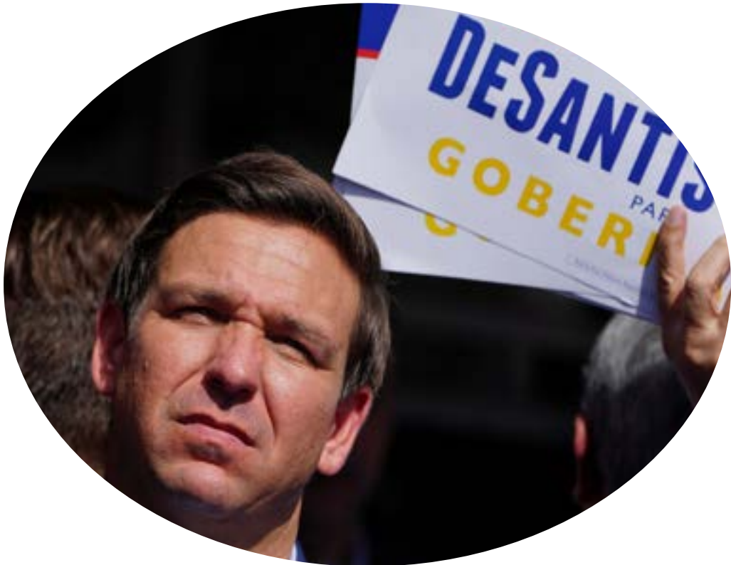
Candidate for Governor Ron DeSantis speaks at Versailles restaurant in the Little Havana section of Miami