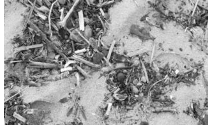
Cigarette butts found on a beach in Puerto Rico during the 2010 International Coastal Cleanup.

"Their efforts — anti-litter campaigns and handheld and permanent ashtrays — did not substantially affect smokers' entrenched 'butt flicking' behaviors," said a research paper co-authored by Novotny.