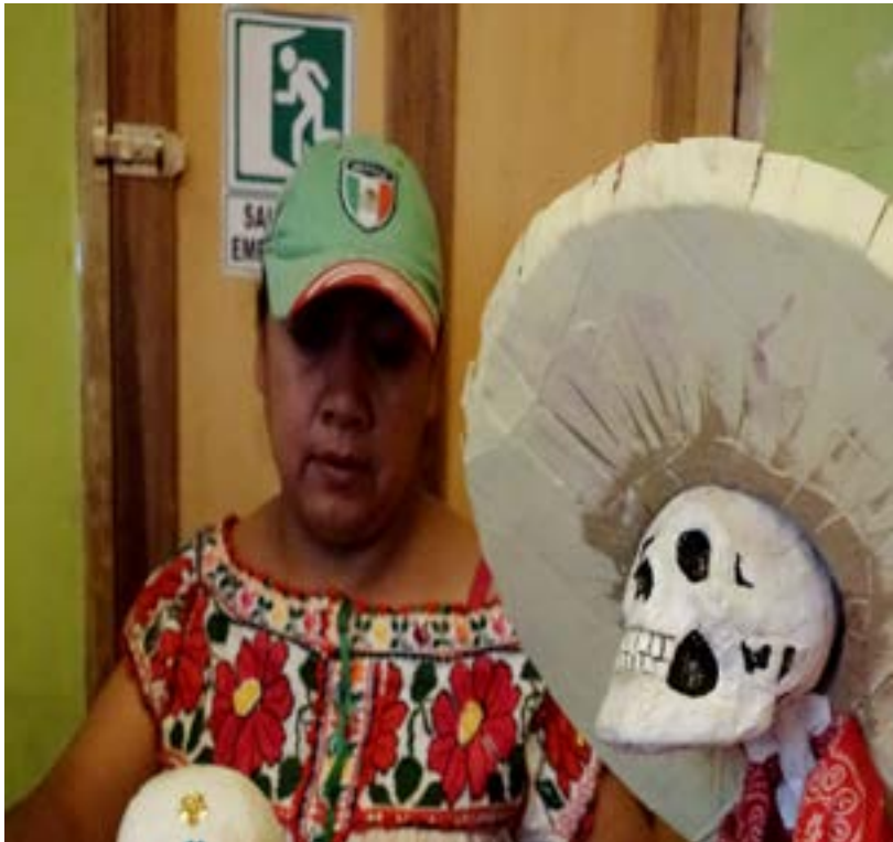
A Mexican migrant arranges an offering during the Day of the Dead celebrations in La Paz