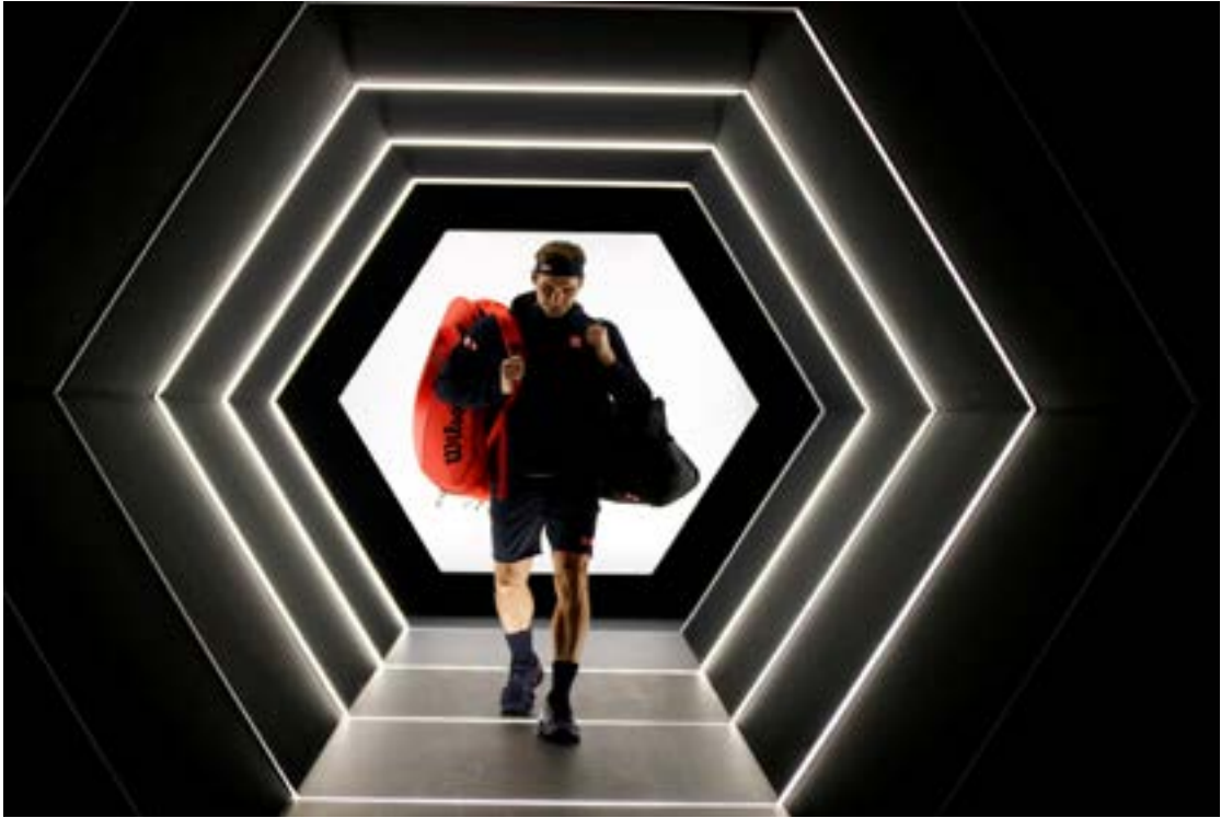
Tennis - ATP 1000 - Paris Masters - AccorHotels Arena, Paris, France - November 1, 2018 Switzerland’s Roger Federer makes his entrance before his third round match against Italy’s Fabio Fognini