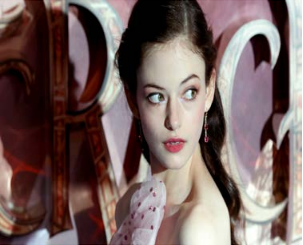
Cast member Mackenzie Foy attends the London premiere of ‘The Nutcracker and the Four Realms’ movie in London, Britain, November 1, 2018.