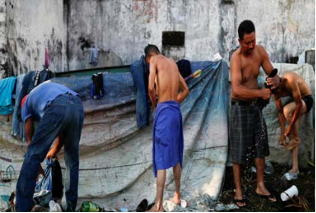
Migrants, part of a caravan traveling to the U.S., clean themselves and wash their clothes in Huixtla, Mexico, November 1, 2018.