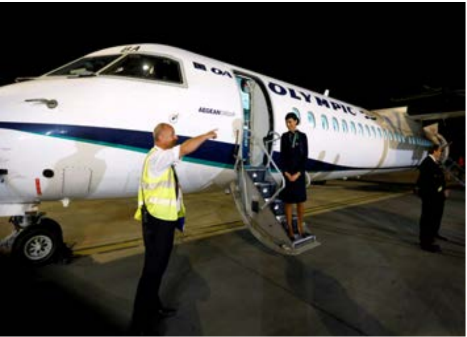
Passengers are welcomed as the airplane of Greek carrier Aegean Airlines lands at Skopje airport on its first in more than a decade direct flight between Athens and Skopje