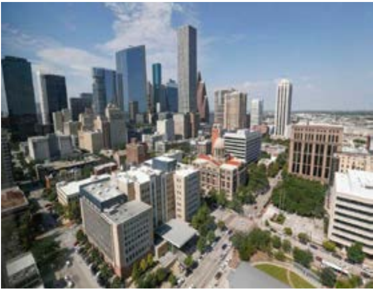
Houston, TX: 0.4 years

more quickly than home values. According to Zillow, it takes almost two years less time to save up for a home now in Austin; home buyers in San Antonio and Dallas-Fort Worth can also buy more quickly than in 1988.