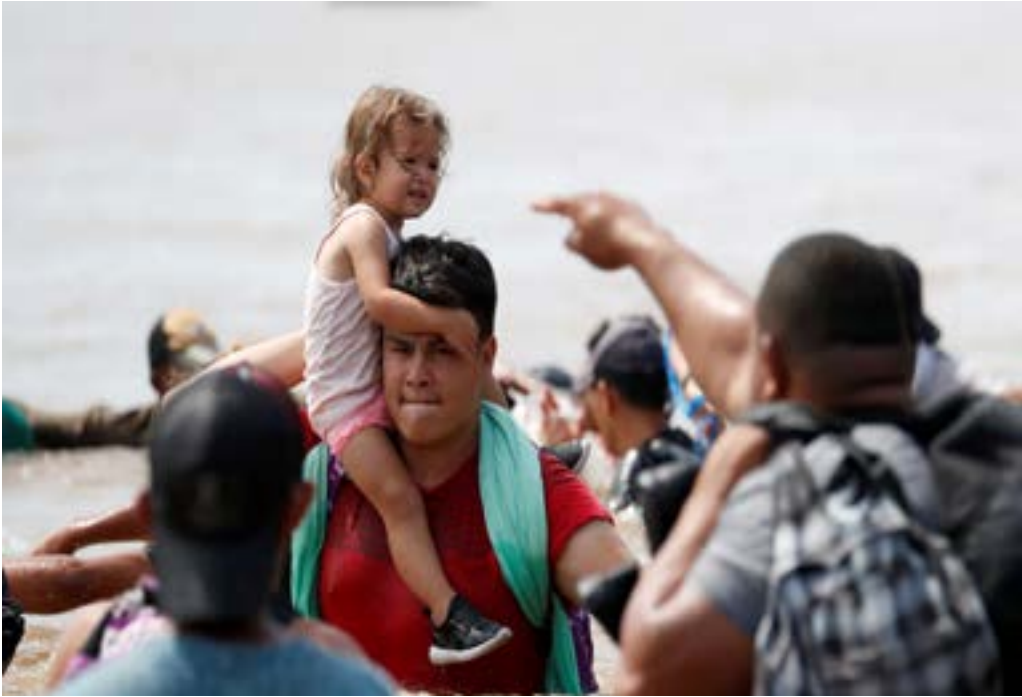
Central American migrants cross the Suchiate river, the natural border between Guatemala and Mexico, to reach the U.S., as seen from Ciudad Hidalgo