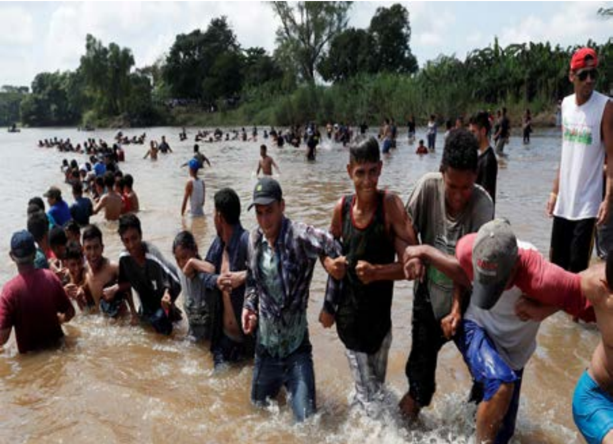
Central American migrants cross the Suchiate river, the natural border between Guatemala and Mexico, to reach the U.S., as seen from Ciudad Hidalgo