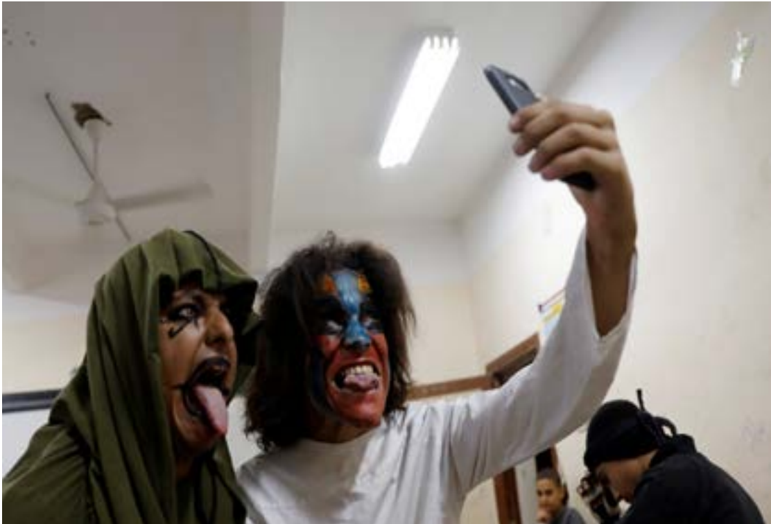
Members of the Egyptian Arab Federation of Professional Wrestlers takes a selfie at the class of the Abu Sultan High School in Ismailiya