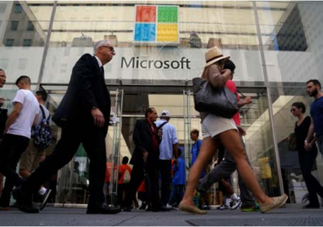
FILE PHOTO: A Microsoft store is pictured in New York City, New York, U.S., August 21, 2018.

Trump's rival for the presidency, Hillary Clinton - are frequent targets of right-wing critics. Also sent packages were Eric Holder, who served as attorney general under Obama; former CIA Director John Brennan, who had his security clearance withdrawn after frequently lambasting Trump; prominent Democratic Party donor George Soros; and California Representative Maxine Waters, another outspoken Trump critic. Two packages were sent to Waters, whom Trump has called "an extraordinarily low IQ person."