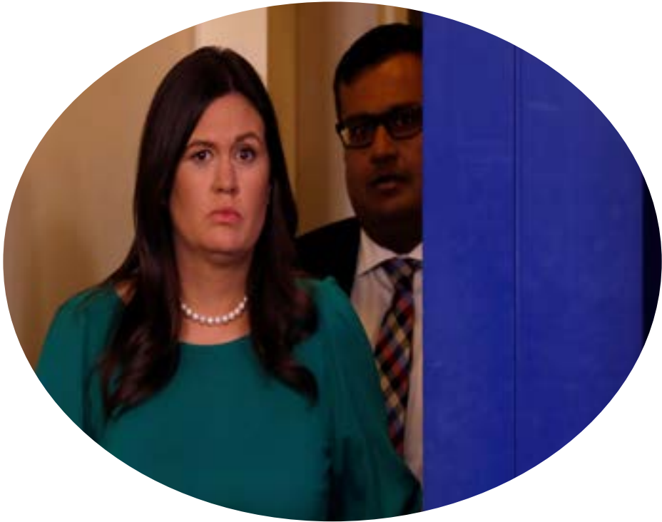
U.S. White House Press Secretary Sarah Huckabee Sanders arrives to hold the daily briefing at the White House in Washington, DC, U.S.