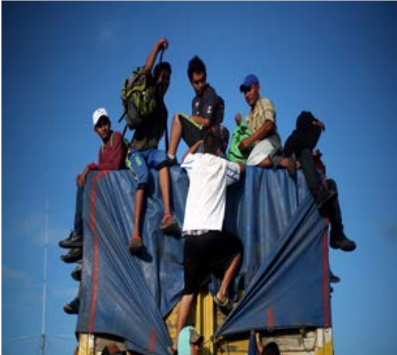
Migrants, traveling with a caravan of thousands from Central America en route to the United States, hitchhike on a truck along the highway to Santiago Niltpec from San Pedro Tapanatepec