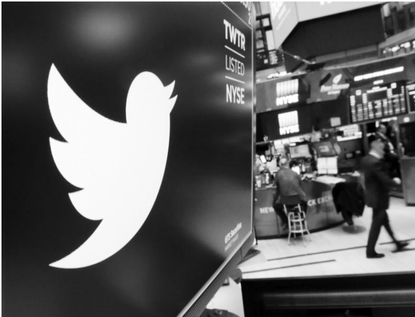
In this Feb. 8, 2018 file photo, the logo for Twitter is displayed above a trading post on the floor of the New York Stock Exchange. Twitter suspended at least 58 million user accounts in the final three months of 2017, according to data obtained by The Associated Press. The figure highlights the company's newly aggressive stance against malicious or suspicious accounts in the wake of Russian disinformation efforts during the 2016 U.S. presidential campaign.

Compiled And Edited By John T. Robbins, Southern Daily Editor