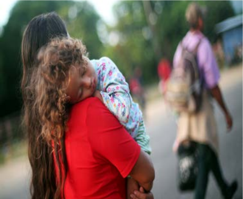
Migrants, traveling with a caravan of thousands from Central America en route to the United States, walk along the highway to Santiago Niltpec from San Pedro Tapanatepec