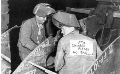
“Me Chinese Please, No Japanese”.

Japanese internment actually presented an opportunity for economic and social advancement to the Chinese. Chinese merchants moved into formerly Japanese-owned businesses. And when the Japanese were removed from their farm jobs, the United States Employment Service issued a call for Chinese Americans to replace them.