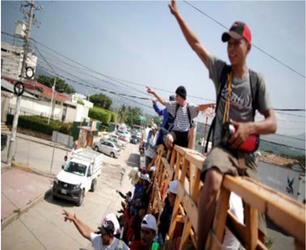
Migrants, part of a caravan of thousands from Central America en route to the United States, hitchhike on a truck along the highway to Arriaga from Pijijiapan