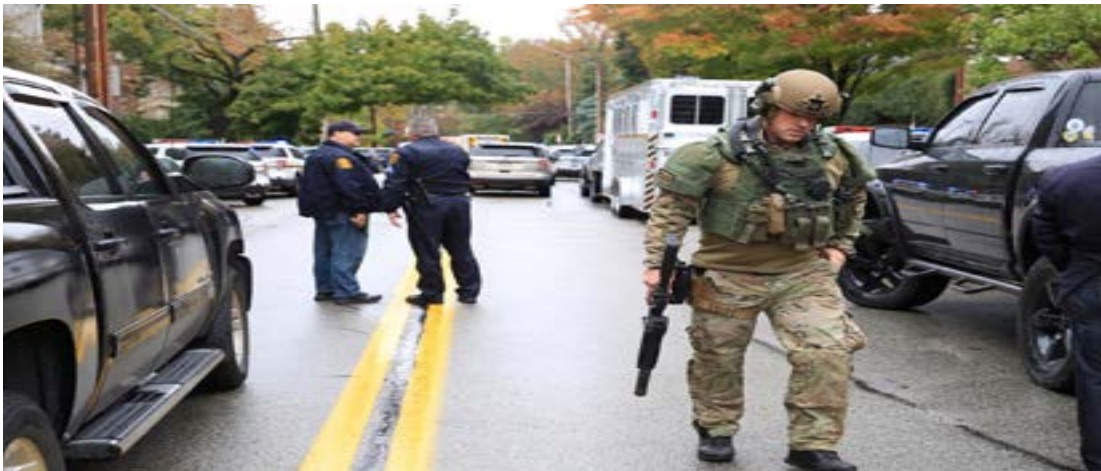
Police officers respond after a gunman opened fire at the Tree of Life synagogue in Pittsburgh Pennsylvania

PITTSBURGH (Reuters) - A gunman killed at least eight people and injured 12 in an attack on a Pittsburgh synagogue during Sabbath religious services on Saturday, and a suspect was in custody in a possible hate crime, local authorities and media reported. A "bearded heavy-set white male" was in custody, KDKA television said, citing police sources saying the gunman walked into the building and yelled "All Jews must die". Responding officers "received fire" and three officers were injured, KDKA said, but it was not immediately clear if they were counted among the 12 injured. Pennsylvania Governor Tom Wolf, who was at the scene of the shooting according to local media, said in a tweet: "We are providing local first responders with whatever help they need." The University of Pittsburgh Medical Center said it was treating multiple patients at UPMC Presbyterian. Earlier, a police commander said the shooting resulted in "multiple casualties." Police surrounded the Tree of Life synagogue after reports of an active shooter at the building in the city's Squirrel Hill neighborhood, local TV news images showed. "Do not come out of your home right now, it is not safe," Pittsburgh police Commander Jason Lando warned local residents, in an impromptu news conference at the scene.