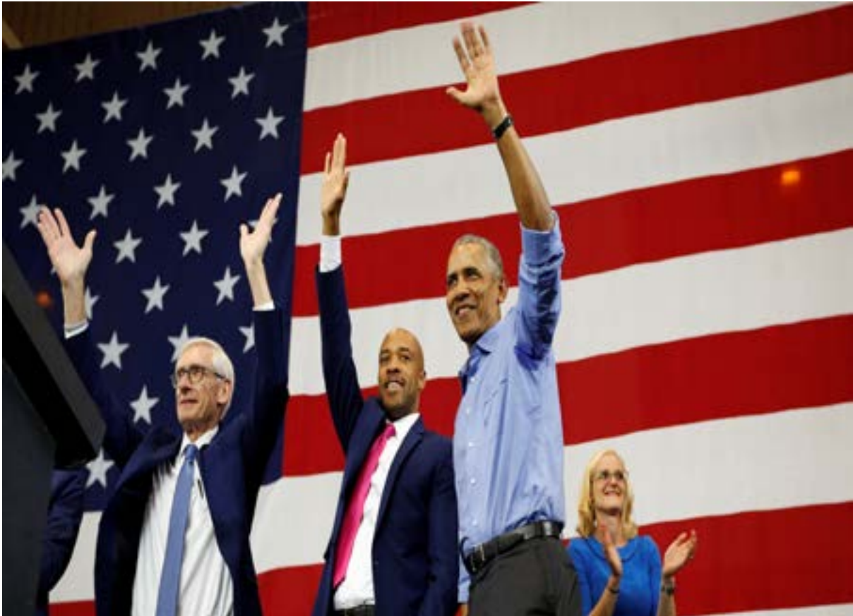
Former U.S. President Barack Obama waves to the crowd during a campaign rally for Wisconsin democratic candidates at North Division High School in Milwaukee