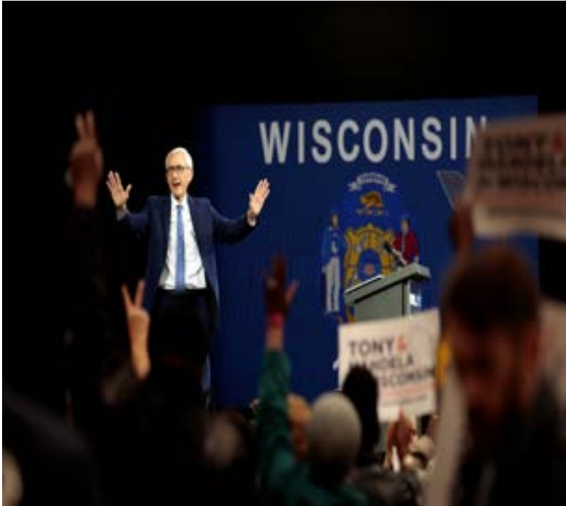
Gubernatorial Democratic candidate Tony Evers speaks at a rally attended by former U.S. President Barack Obama at North Division High School in Milwaukee