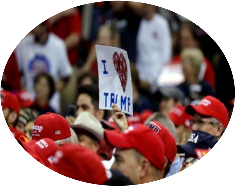
FILE PHOTO: Supporters participate at a campaign rally for U.S. Senator Ted Cruz (R-TX) in Houston, Texas, U.S., October 22, 2018. REUTERS/Leah Millis/File Photo