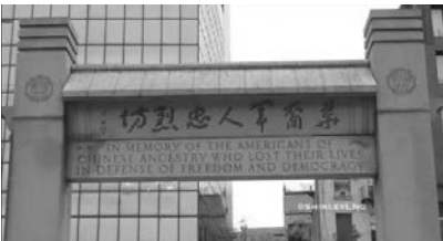
American Legion Lt. B.R. Kim Lau Chinese Memorial Post 1291

https://www.duckworth.senate.gov/news/press-releases/senate-passes-bipartisan-duckworth-hirono-bill-to-honor-chinese-american-wwii-veterans 2/3