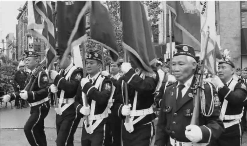
Memorial Day Observance in New York by American Legion Lt. B.R. Kim Lau Chinese Memorial Post 1291