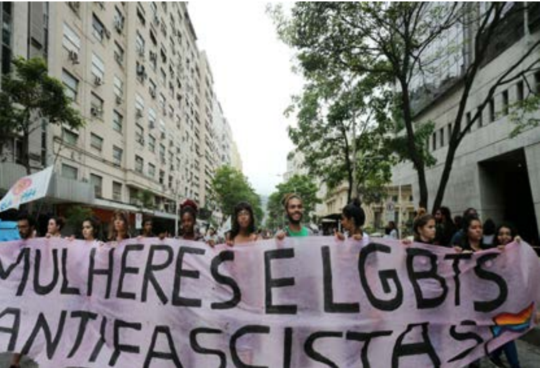
Brazilian students protest against censorship at the universities in front of the Electoral Court in Rio de Janeiro