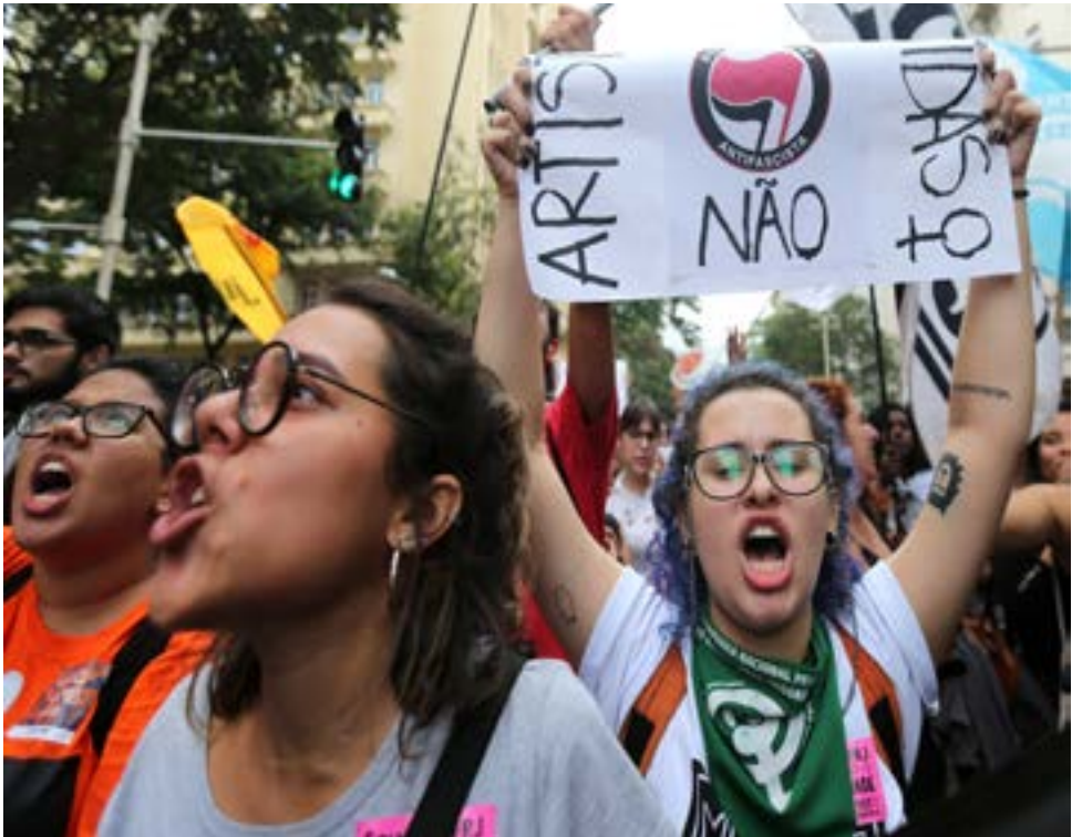
Brazilian students protest against censorship at the universities in front of the Electoral Court in Rio de Janeiro