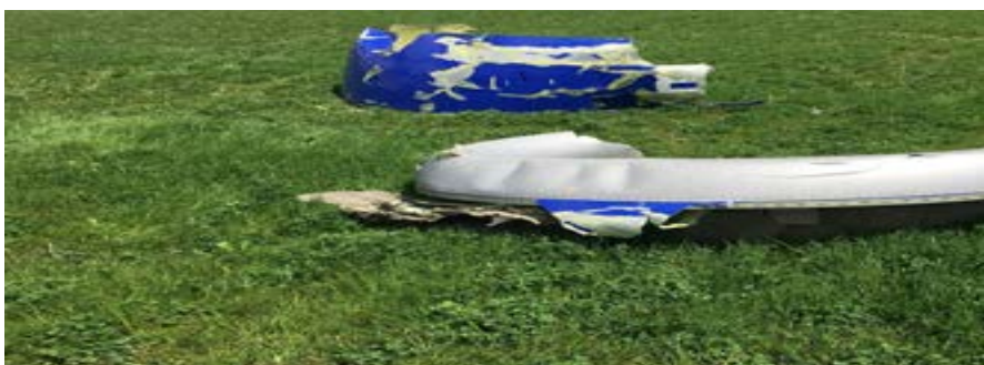
NTSB photo shows parts of the engine cowling from the Southwest Airlines plane which blew its engine in mid air yesterday over the skies of Philadelphia