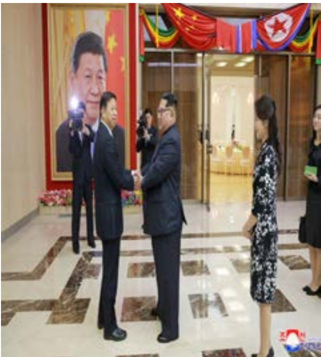
North Korean leader Kim Jong Un greets Song Tao, head of the Chinese Communist Party's international liaison department, in this undated photo released by North Korea's Korean Central News Agency (KCNA) in Pyongyang