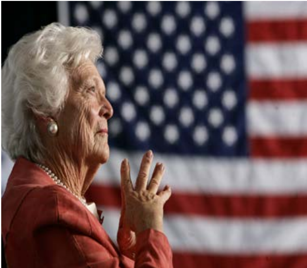
Former U.S. first lady Barbara Bush listens to her son, President George W. Bush, as he speaks at an event on social security reform in Orlando