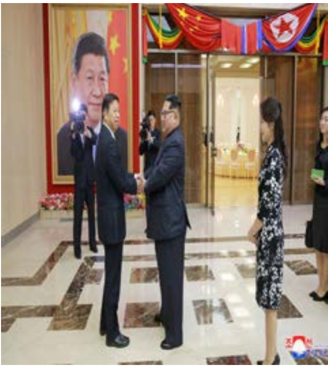
North Korean leader Kim Jong Un greets Song Tao, head of the Chinese Communist Party's international liaison department