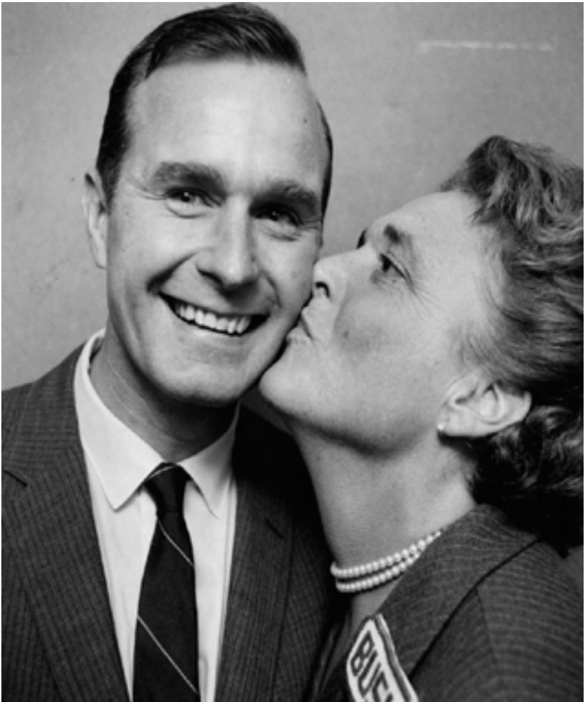
Newly-elected U.S. Rep. George Bush flashes a winner’s smile as his wife, Barbara, gives him a victory kiss following his 1966 election to a seat in from the 7th district in Texas