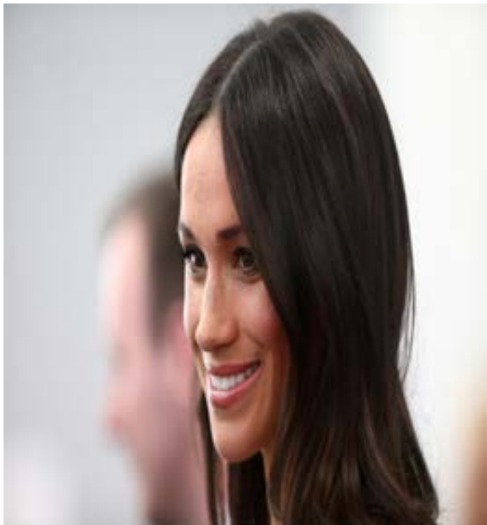
Markle attends a reception with delegates from the Commonwealth Youth Forum in London