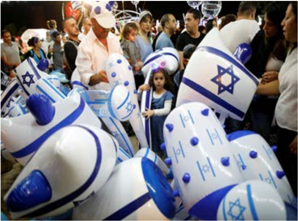
An Israeli girl plays with an inflatable hammer during celebrations marking Israel's 70th Independence Day in the southern city of Ashkelon