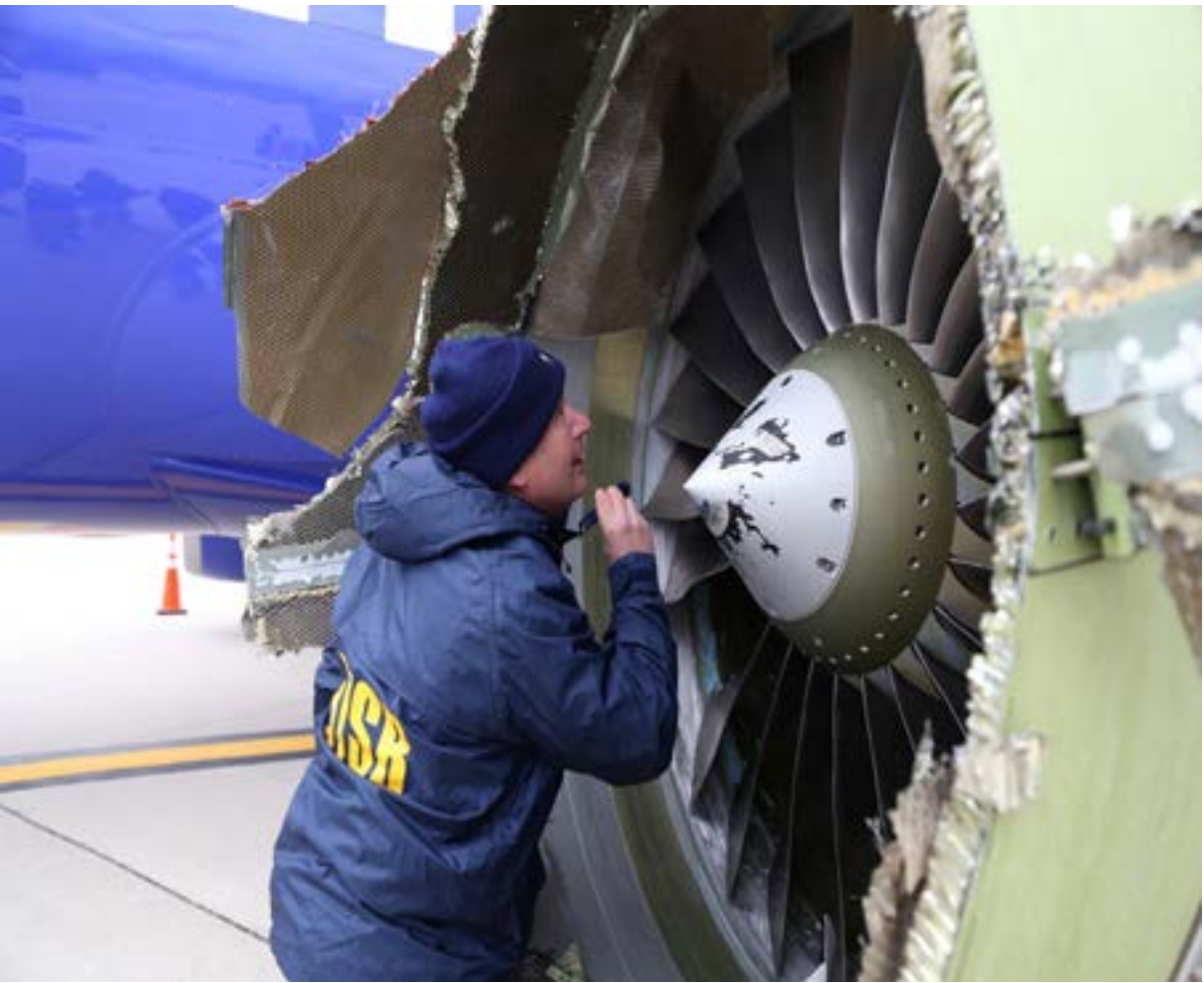
A NTSB investigator on scene examining damage to the engine of the Southwest Airlines plane in Philadelphia