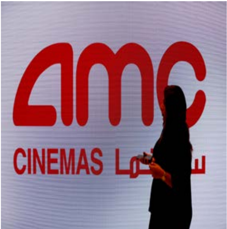
A woman walks at Saudi Arabia's first commercial movie theater in Riyadh