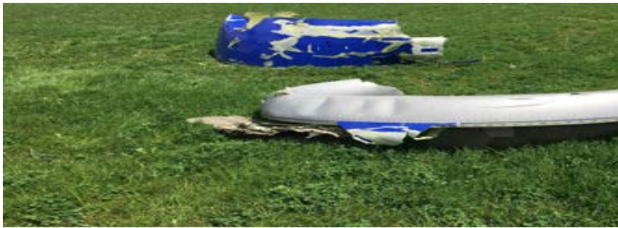
NTSB photo shows parts of the engine cowling from the Southwest Airlines plane which blew its engine in mid air yesterday over the skies of Philadelphia