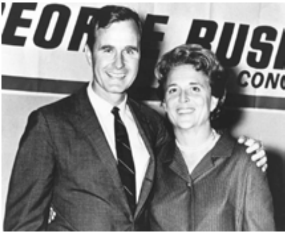
George Herbert Walker Bush poses with his wife, Barbara, during his campaign for Congress in the 1960s.