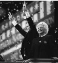
President George Bush and First Lady Barbara attend the 1992 Republican National Convention in Houston, Texas. Bush, the GOP nominee for president, lost his second bid for office to democrat Bill Clinton.

in 2016. During her tenure as the nation’s first lady, Mrs. Bush, the mother of six children, was a champion for global literacy and continued the work after she and her husband left the White House. In 1989, she formed the Barbara Bush Foundation for Family Literacy, which encourages parents to read to their children. “Literacy fits in with so many other things,” she once told The Chicago Tribune. “If more people could read, fewer people would have AIDS. There would be less homelessness. I’m absolutely convinced of that.”