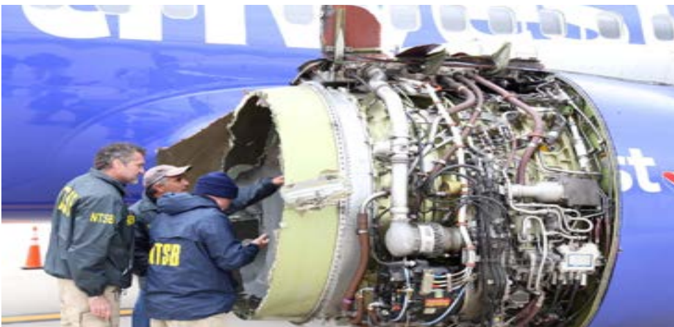
NTSB investigators on scene examining damage to the engine of the Southwest Airlines plane in Philadelphia

able to pull her back inside but she died of her injuries later on Tuesday. Southwest crews were inspecting similar engines the airline had in service, focusing on the 400 to 600 oldest of the CFM56 engines, made by a partnership of France’s Safran and General Electric, according to a person with knowledge of the situation. It was the second time that style of engine had failed on a Southwest jet in the past two years, prompting airlines around the world to step up inspections. A National Transportation Safety Board inspection crew was also combing over the Boeing 737-700 for signs of what caused the engine to explode. Sumwalt said the fan blade, after suffering metal fatigue where it attached to the engine hub, suffered a second fracture about halfway along its length. Pieces of the plane were found in rural Pennsylvania by investigators who tracked them on radar. The metal fatigue would not have been observable by looking at the engine from the outside, Sumwalt said. According to Sumwalt, the jet was traveling at 190 miles per hour when it made an emergency landing at Philadelphia International Airport, much faster than the typical 155-mile-per-hour touchdown. Passengers described scenes of panic as a piece of shrapnel from the engine shattered a window on the aircraft, almost sucking Riordan out.