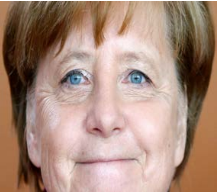
German weekly cabinet meeting in Berlin