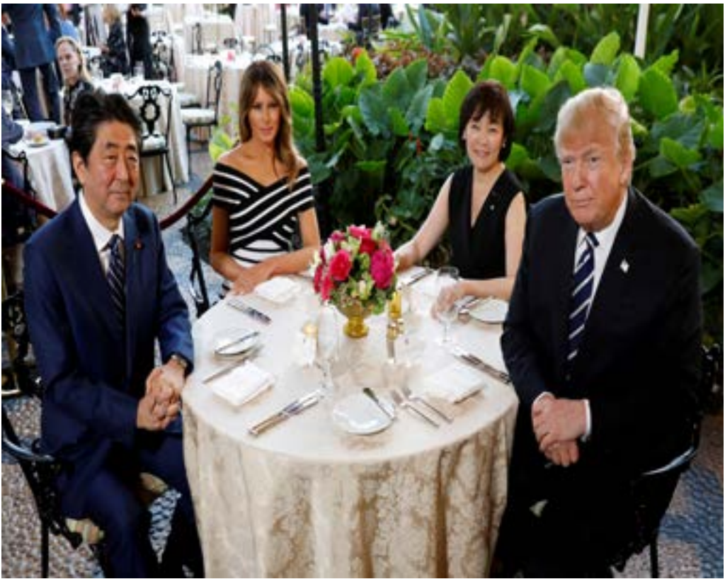
U.S. President Donald Trump and first lady Melania dine with Japan's PM Abe and wife in Palm Beach