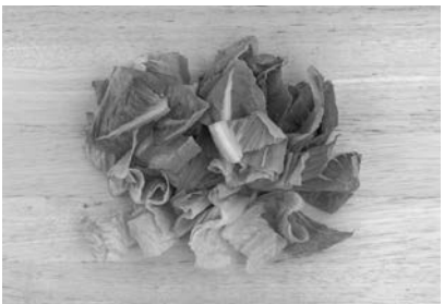
Bundled Romaine lettuce (left photo) and when chopped for bagged salads.

To keep yourself and your family safe, the CDC recommends avoiding any romaine lettuce products that could be contaminated. It issued a wide-ranging caution, not limited to any specific brand or retailer: