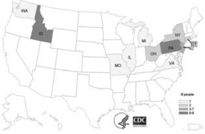
Table showing the number of ill people arranged by state of residence

Restaurants and retailers should ask their suppliers about the source of their chopped romaine lettuce.