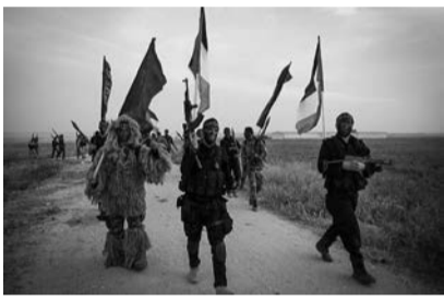
Palestinian Islamic Jihad militants march during a military drill near the border with Israel, east of the town of Khan Younis in the southern Gaza Strip, on March 27, 2018.

the northern portion of the coastal enclave.