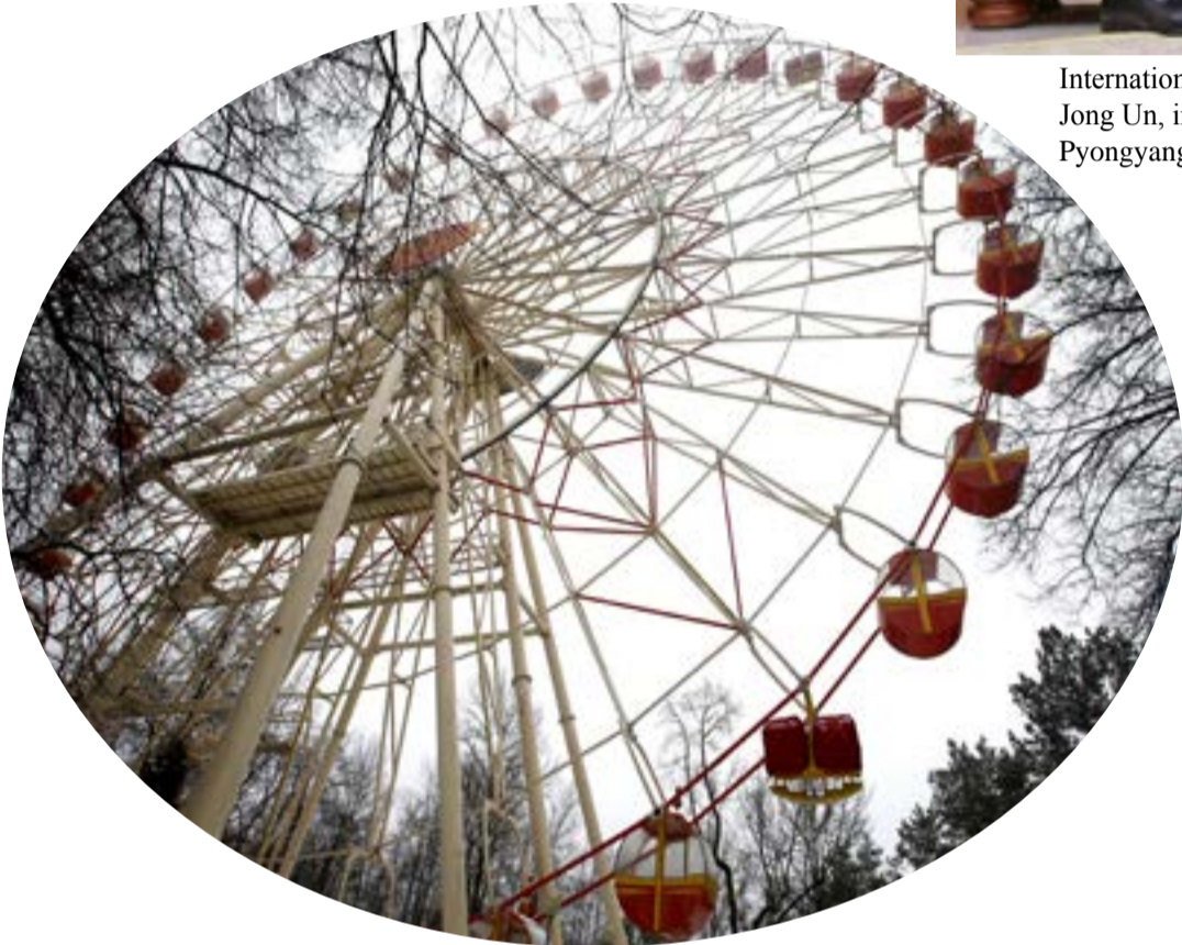
A Ferris wheel is seen at Gorky park in Minsk, Belarus March 30, 2018. REUTERS/Vasily Fedosenko TPX IMAGES OF THE DAY