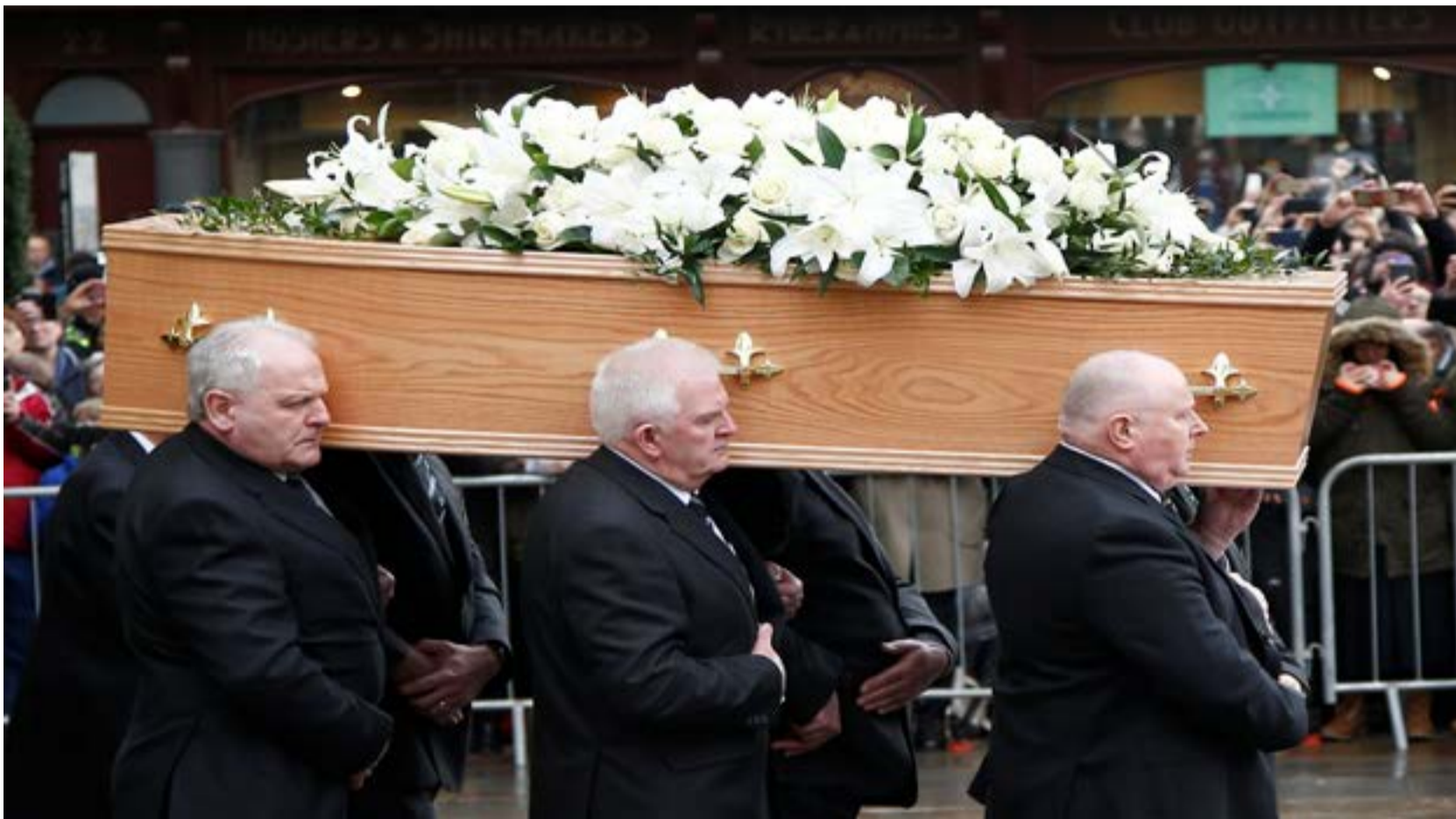
Pallbearers carry the coffin out of Great St Marys Church at the end of the funeral of theoretical physicist Prof Stephen Hawking, in Cambridge