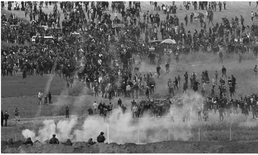
Photo taken on March 30, 2018 from the southern Israeli kibbutz of Nahal Oz across the border from the Gaza strip shows tear gas grenades falling during a Palestinian city protest, with Israeli soldiers seen below in the foreground.