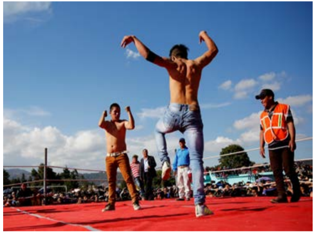
Two men participate in a bare-knuckle fight as part of a local tradition on Good Friday during Holy Week in the town of Chivarreto, on the outskirts of Guatemala City