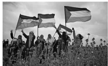
Palestinian women wave Palestinian flags and flash the victory gesture during a protest near the border with Israel east of Jabalia in the Gaza Strip on March 30, 2018.

Early Friday, the army stationed additional infantry battalions and more than 100 snipers along the border in order to prevent that from happening. The Border Police and Israel Police also sent additional forces to southern Israel in order to act as a secondary defense line in case Palestinians made it past the soldiers along the border.