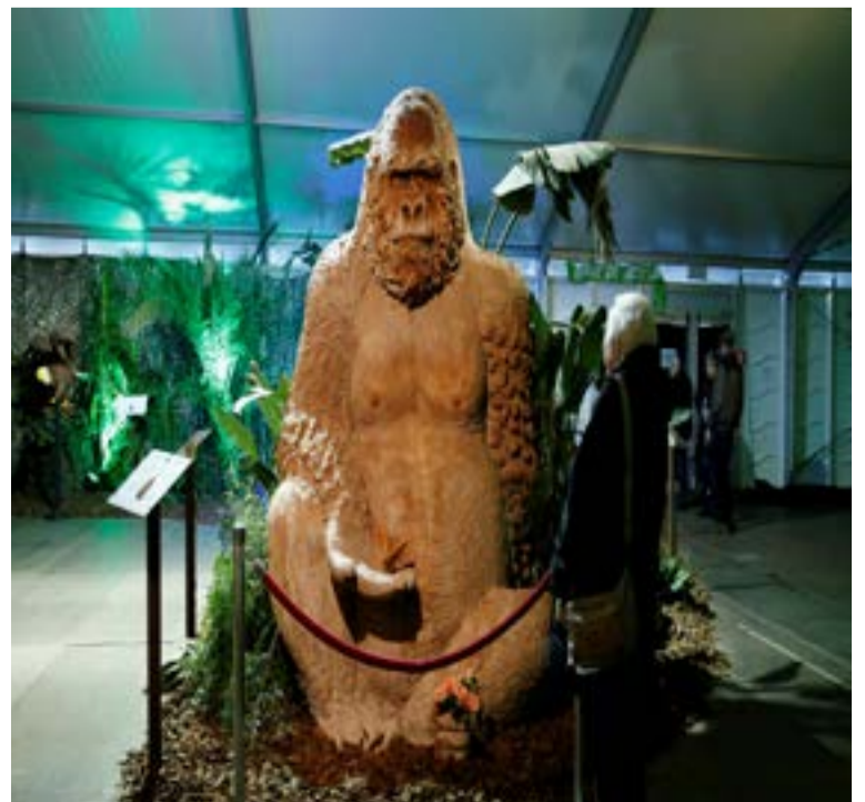
A visitor looks at a chocolate sculpture of a gorilla during the chocolate sculpture festival in Durbuy