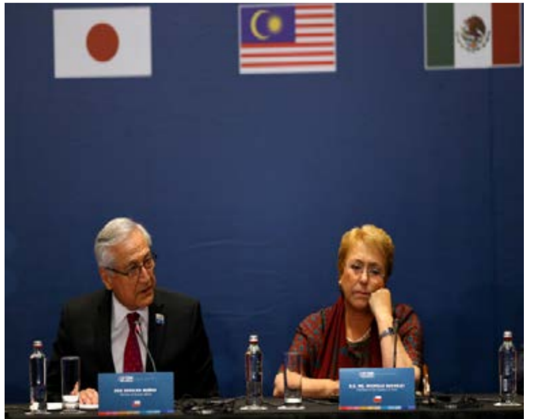
Chile's Foreign Minister Heraldo Munoz delivers a speech next to Chile's President Michelle Bachelet, before signing the Trans-Pacific Partnership (TPP) trade deal, in Santiago TRADE-TPP/CHILE-SIGNING