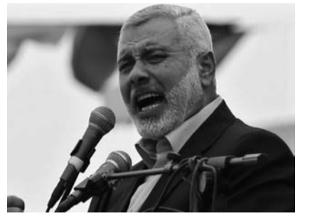
Hamas leader Ismail Haniyeh 'Return home'

According to the United Nations, some 1.3 million of Gaza's 1.9 million residents are refugees or their descendants.