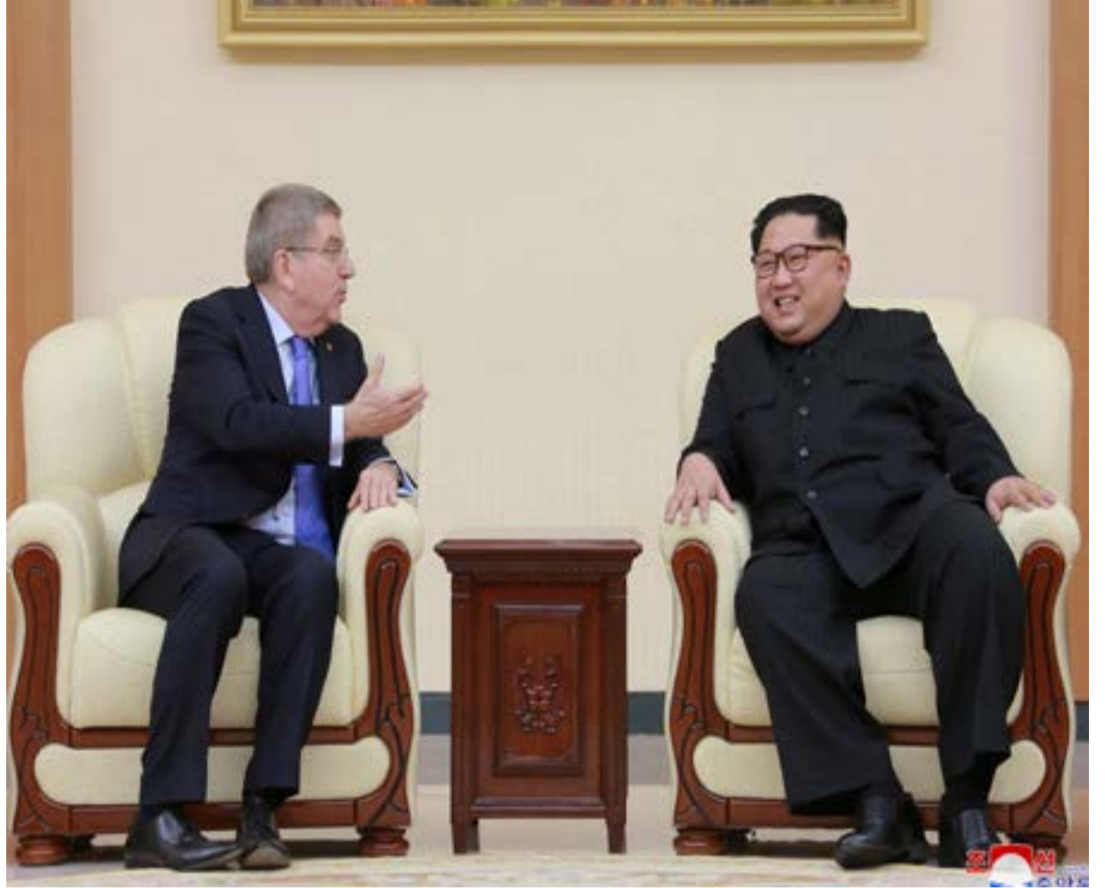
International Olympic Committee (IOC) President Thomas Bach meets with North Korean leader Kim Jong Un, in this undated photo released by North Korea's Korean Central News Agency (KCNA) in Pyongyang March 31, 2018.