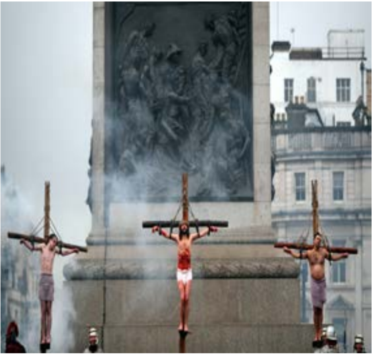
Actor James Burke-Dunsmore playing Jesus performs in The Passion of Jesus at Trafalgar Square in London