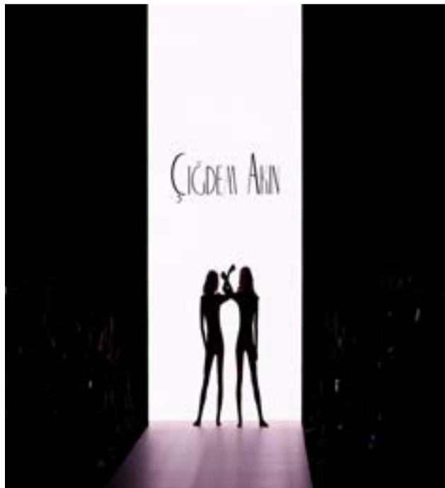
Models present a creation by Cigdem Akin during the Mercedes-Benz Fashion Week in Istanbul