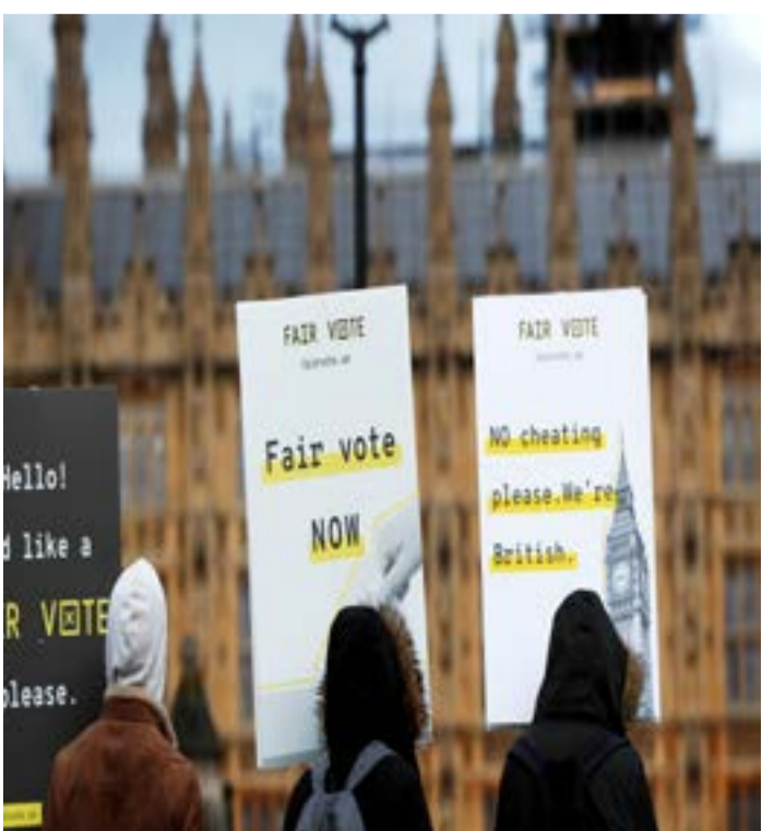
Demonstrators hold placards opposite Parliament during a protest in London