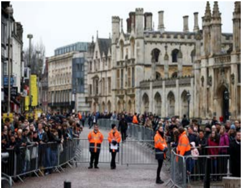
The funeral cortege arrives at Great St Marys Church, where the funeral of theoretical physicist Prof Stephen Hawking is being held, in Cambridge

"Beyond the Night Sky", inspired by a poem and quotes from "A Brief History of Time" and whistling and "shh" sounds based on recordings of space. Pallbearers carry the coffin into Great St Marys Church, where the funeral of theoretical physicist Prof Stephen Hawking is being held, in Cambridge, Britain, March 31, 2018. Astronomer Royal Martin Rees, a personal friend, read from Plato's Apology 40, "The Death of Socrates", which talks of the search for knowledge persisting after death. Confined to a wheelchair for most of his life after being diagnosed with Motor Neurone Disease when he was 21, Hawking's towering intellect and sheer persistence struck a chord with ordinary people, Rees said in an appreciation published earlier this month. "Why did he become such a 'cult figure'? The concept of an imprisoned mind roaming the cosmos plainly grabbed people's imagination," he said. "His name will live in the annals of science; millions have had their cosmic horizons widened by his best-selling books; and even more, around the world, have been inspired by a unique example of achievement against all the odds - a manifestation of amazing will-power and determination." Hawking's ashes will be interred at Westminster Abbey in June, among some of the greatest scientists in history, Isaac Newton and Charles Darwin.