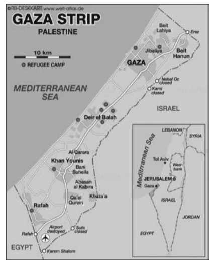
Location of the Gaza Strip

Organizers said the protests would be peaceful but Israeli officials were wary of a fresh flareup along the enclave's border. Hamas, the key organizer of the campaign, is an Islamist terror group that seeks the destruction of Israel.