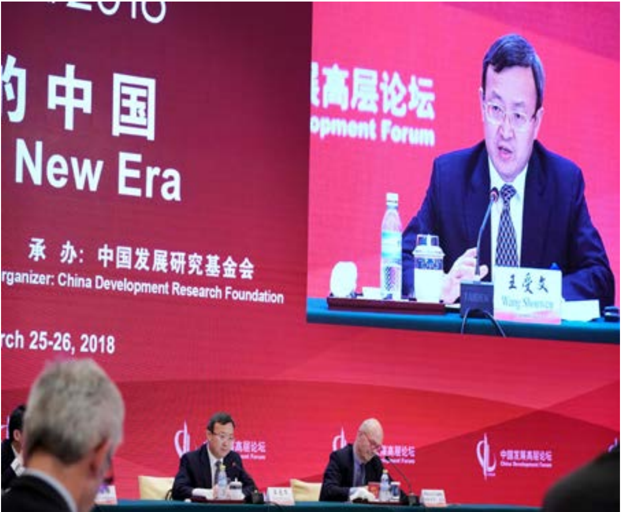
Chinese Vice Commerce Minister and Deputy China International Trade Representative Wang Shouwen attends the annual session of CDF 2018 in Beijing