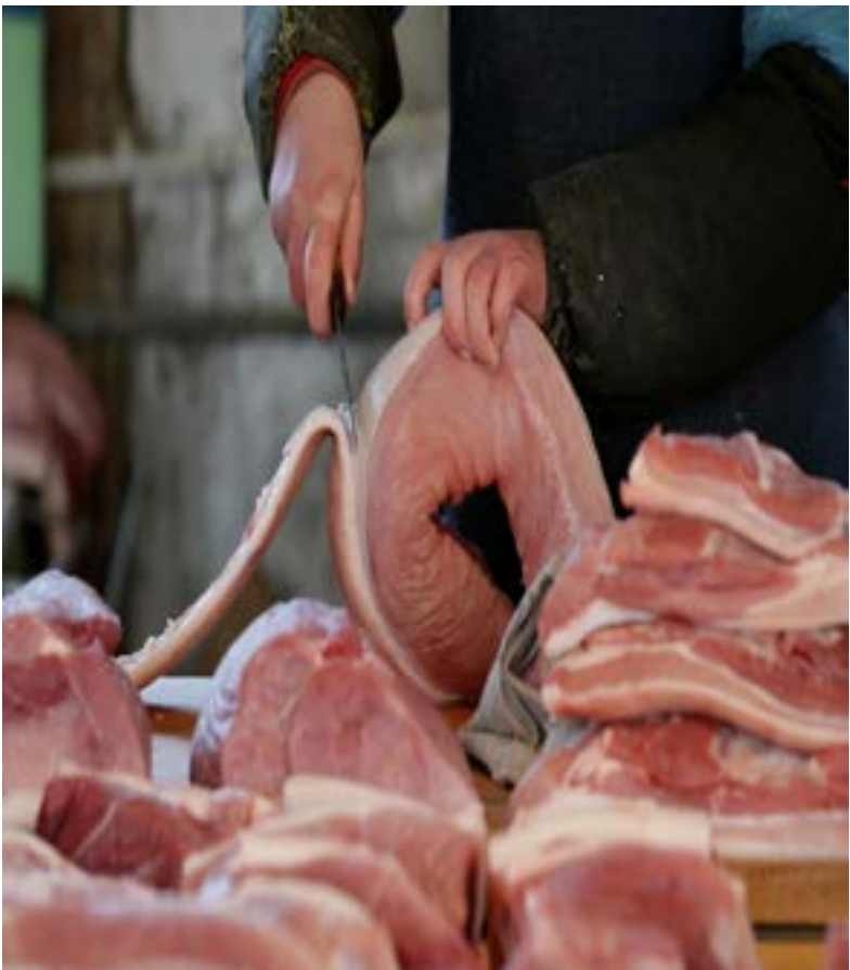
FILE PHOTO: A butcher cuts a piece of pork at a market in Beijing