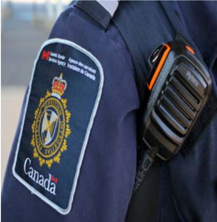
FILE PHOTO: A Canada Border Service Agency officer is seen in Fort Erie