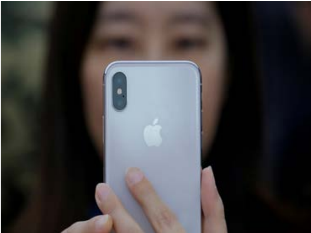
FILE PHOTO: A attendee uses a new iPhone X during a presentation for the media in Beijing