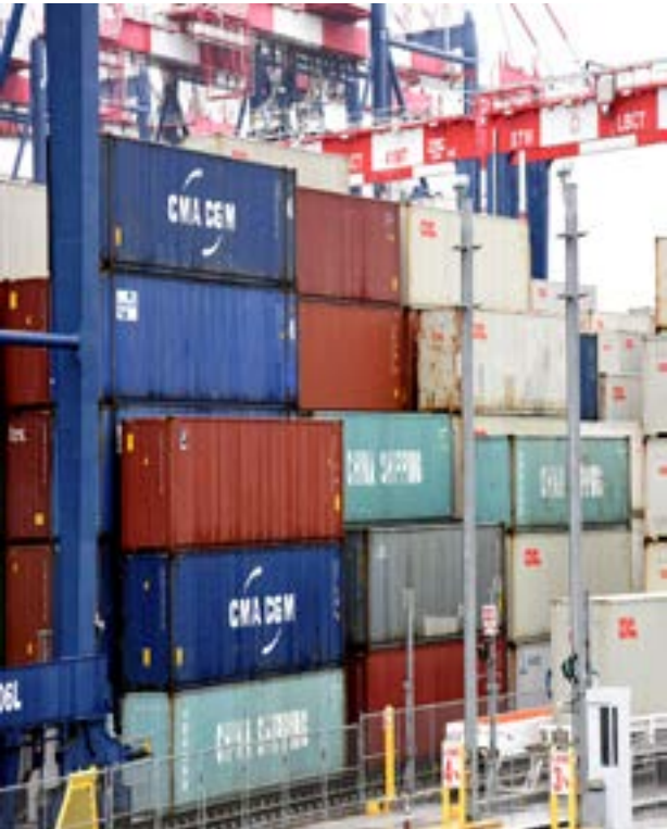
Containers are seen at the port in San Pedro, California