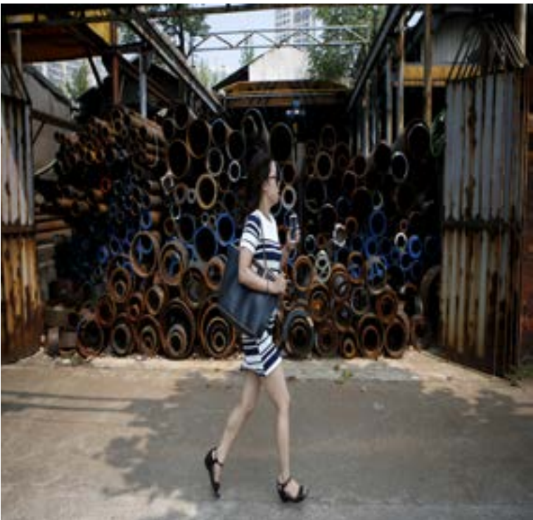
FILE PHOTO: A woman runs past steel products stacked at a steel-works in Seoul