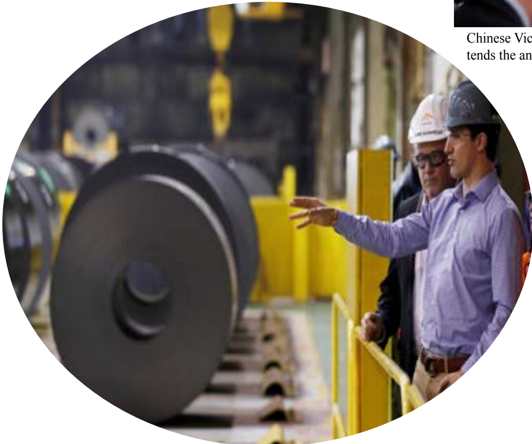
FILE PHOTO: Canada's PM Trudeau tours the ArcelorMittal Dofasco steel plant win Hamilton