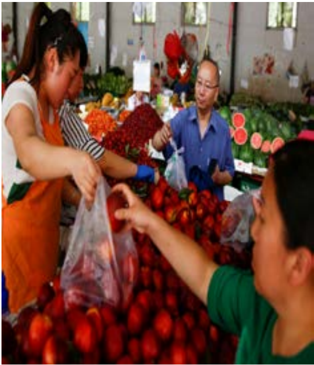
FILE PHOTO: People buy fruit at a fresh food market in Beijing