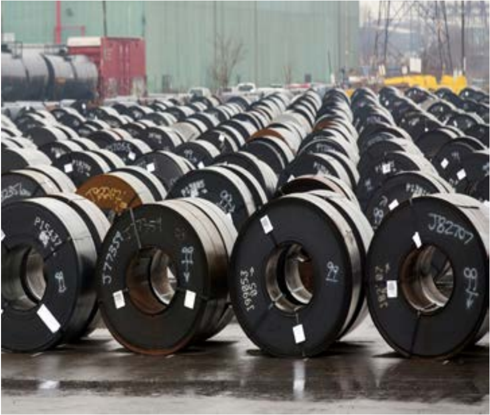
FILE PHOTO: Stored rolls of steel are seen outside the ArcelorMittal Dofasco plant in Hamilton

Experience fast, easy and safe online payments