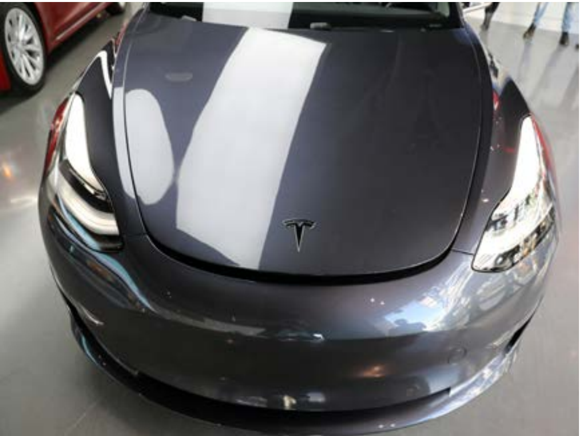
FILE PHOTO: A Tesla Model 3 is seen in a showroom in Los Angeles

that apparently was traveling in semi-autonomous mode. The NTSB can make safety recommendations but only NHTSA can order automakers to recall unsafe vehicles or fine automakers if they fail to remedy safety defects in a timely fashion. Before the agency could demand a recall from Tesla, it must open a formal investigation, a step it has not yet taken. Tesla’s Autopilot allows drivers under certain conditions to take their hands off the wheel for extended periods. Tesla requires users to agree to keep their hands on the wheel “at all times” before they can use Autopilot. The NTSB faulted Tesla in a prior fatal Autopilot crash. In September, NTSB Chairman Robert Sumwalt said operational limitations in the Tesla Model S played a major role in a May 2016 crash in Florida that killed a driver using Autopilot. That crash raised questions about the safety of systems that can perform driving tasks for long stretches with little or no human intervention but cannot completely replace human drivers. Tesla in September 2016 unveiled improvements to Autopilot, adding new limits on