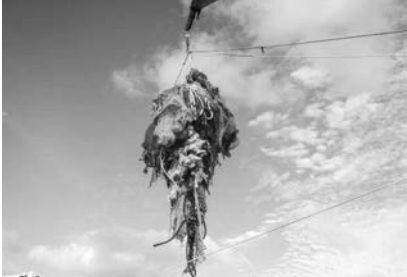
‘Ghost nets’ like these make up

The great Pacific garbage patch is even trashier than we thought –the ocean is flooded with plastic.