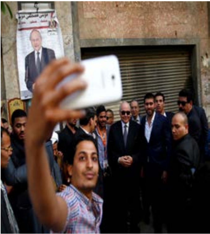
A man takes selfie pictures with Presidential candidate Mousa Mostafa Mousa after casting his vote during the presidential election in Cairo