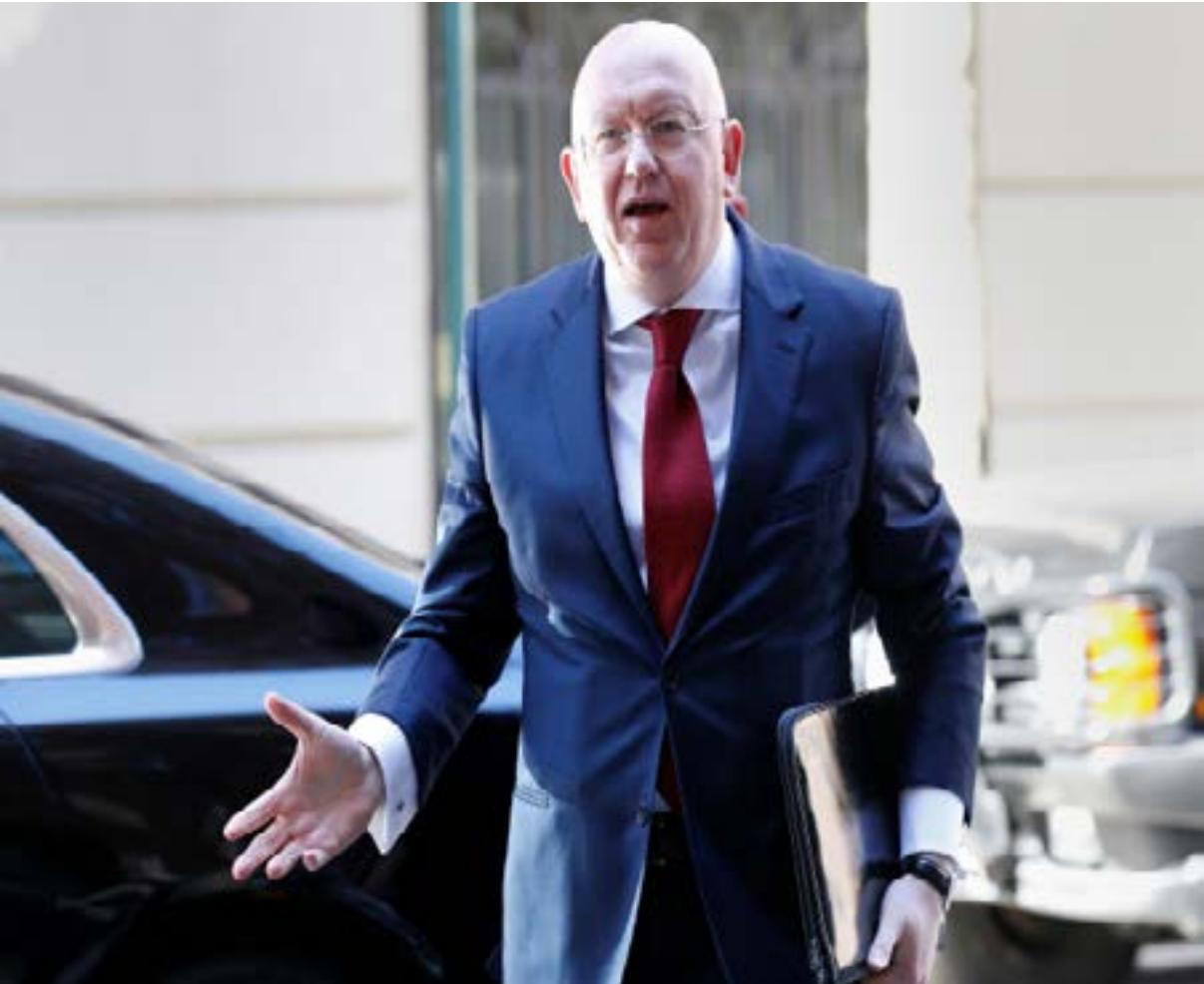
Russian United Nations ambassador Vasily Nebenzya arrives for a lunch meeting in the Manhattan borough of New York City