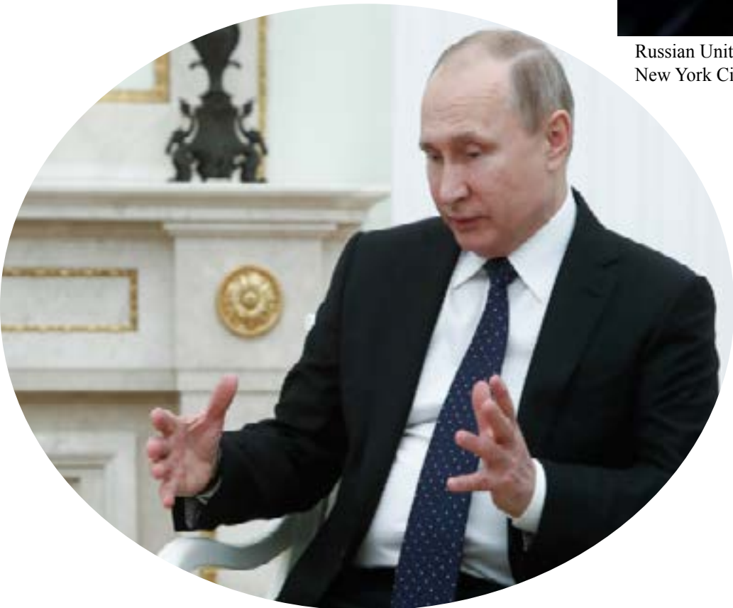
Russian President Vladimir Putin speaks during a meeting with Qatar’s Emir Sheikh Tamim bin Hamad al-Thani at the Kremlin in Moscow