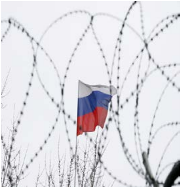
The Russian flag is seen through barbed wire as it flies on the roof of the Russian embassy in Kiev