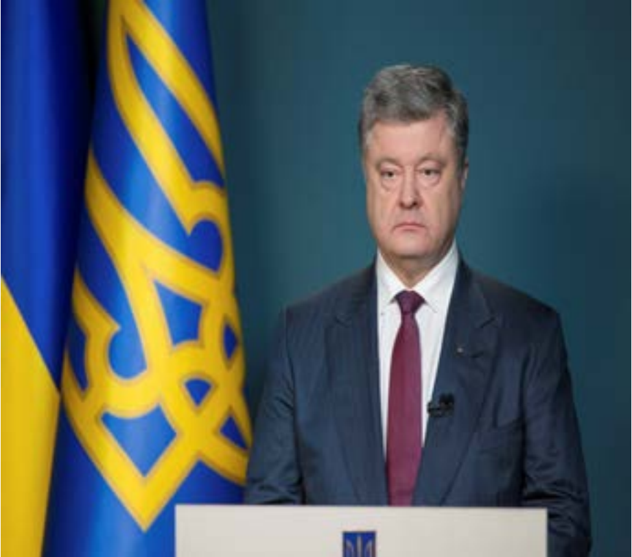
Ukrainian President Petro Poroshenko makes a statement on the decision to expel 13 Russian diplomats in response to the poisoning of a former Russian spy in England, in Kiev