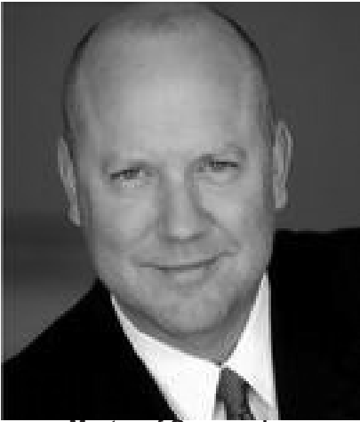
Master of Ceremonies