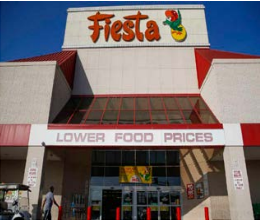
People shop at Fiesta Mart Sunday, March 25, 2018 in Houston