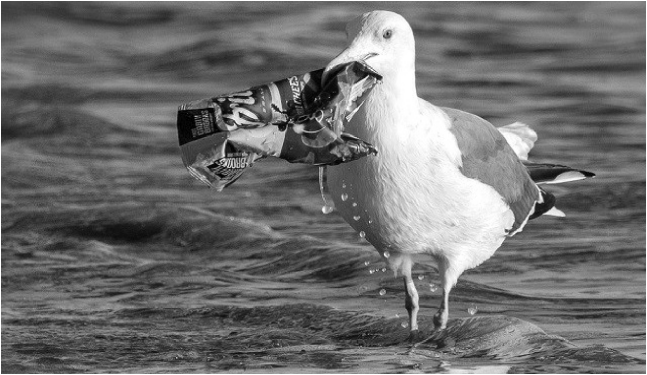
The Great Pacific Garbage Patch now consumes a whopping 600,000 square miles of the Pacific Ocean.