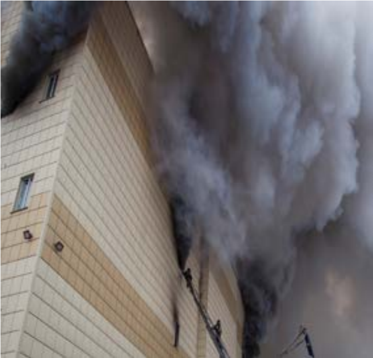
Members of the Emergency Situations Ministry work to extinguish a fire in a shopping mall in Kemerovo