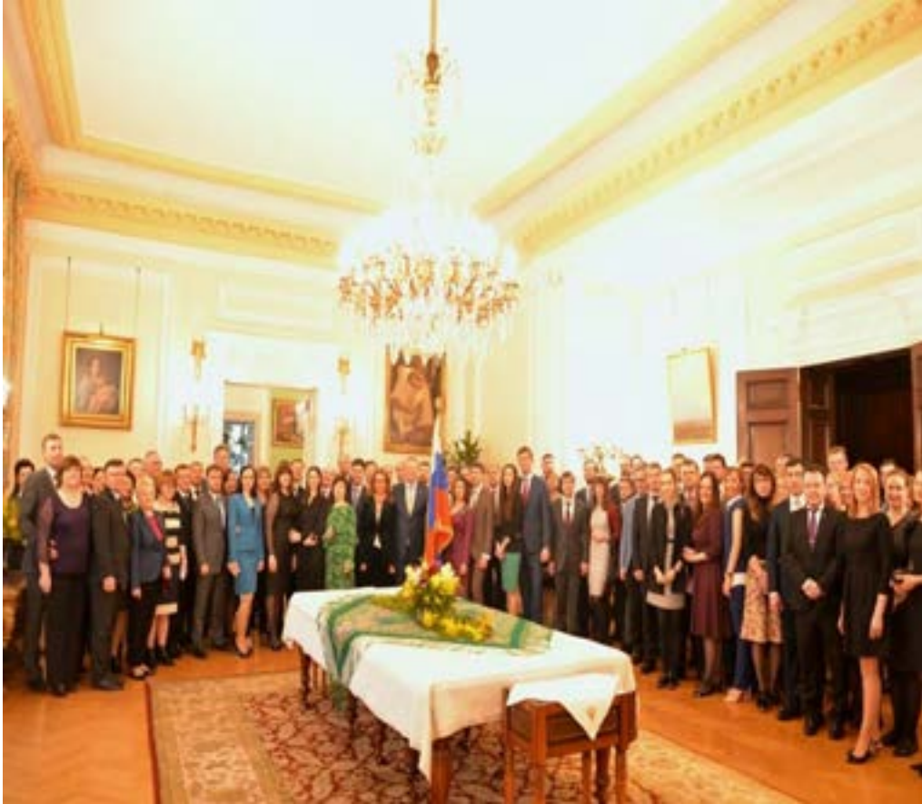
Staff at Russia’s Embassy attend a reception hosted by ambassador Alexander Yakovenko for the 23 diplomats who are being expelled by Britain’s government, in London