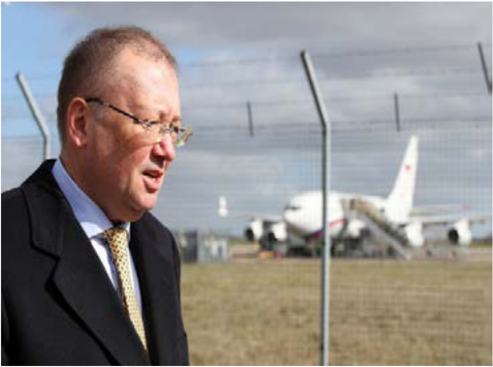
Alexander Yakovenko, Russia’s ambassador to Britain, speaks in front of the aircraft sent to collect diplomats and their families from Russia’s embassy in London, who were expelled by Britain, at Stansted airport