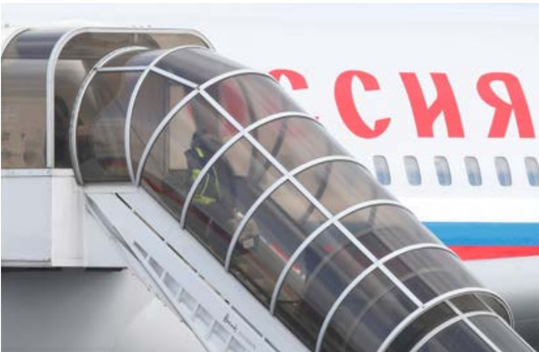
Adults and children board an aircraft sent to collect diplomats and their families from Russia's embassy in London, at Stansted airport

He did not bring up the poisoning attack in