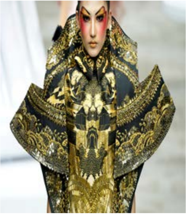
A model presents a creation for a make-up styling show at China Fashion Week in Beijing