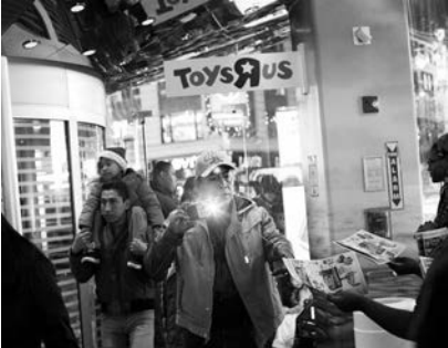
Toys R Us ‘will survive in a different form as online competition grows, former CEO says