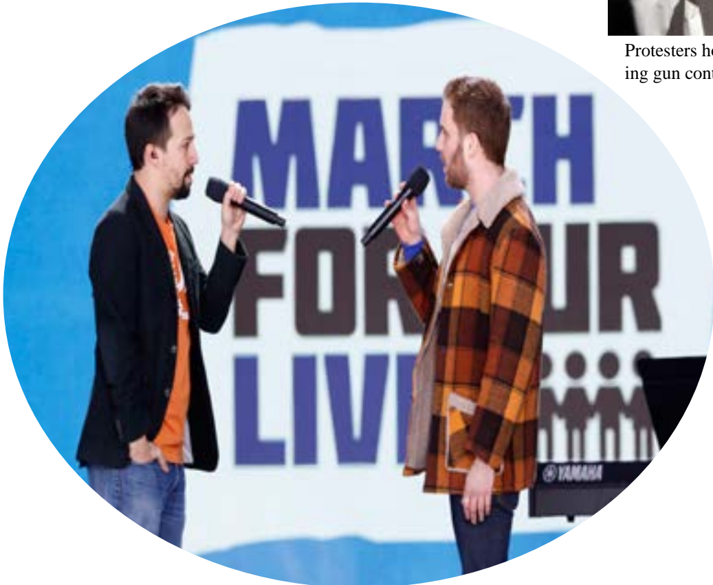
Mirand and Platt performs during the “March for Our Lives” rally demanding gun control in Washington