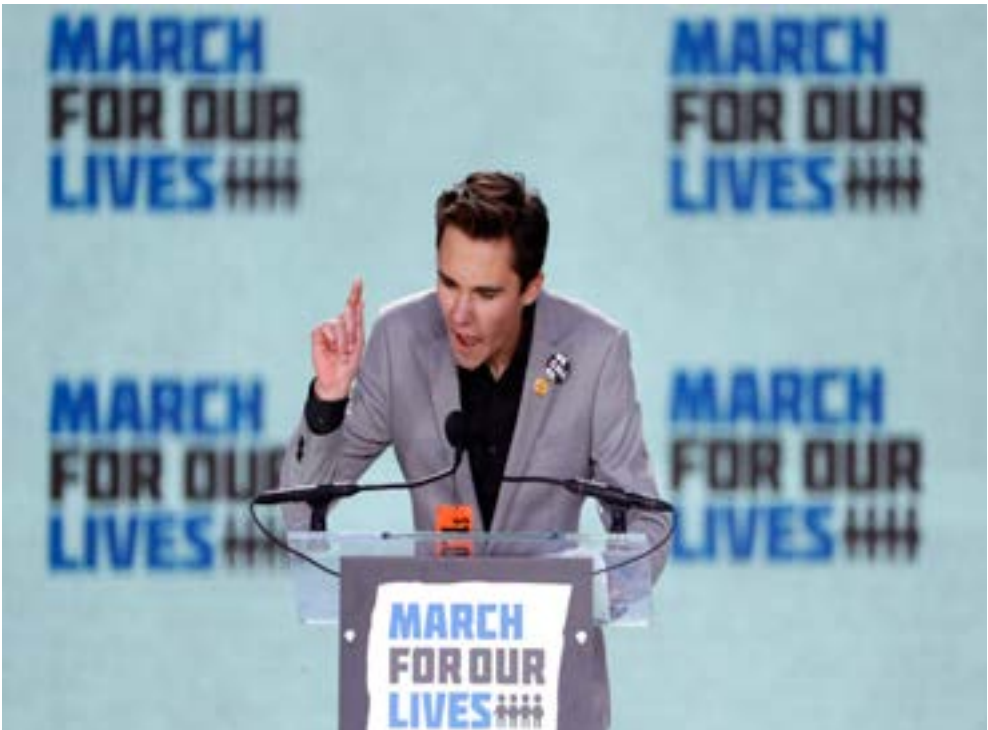
Students and young people gather for the “March for Our Lives” rally demanding gun control in Washington