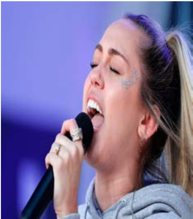
Singer Cyrus performs during the “March for Our Lives” rally demanding gun control in Washington