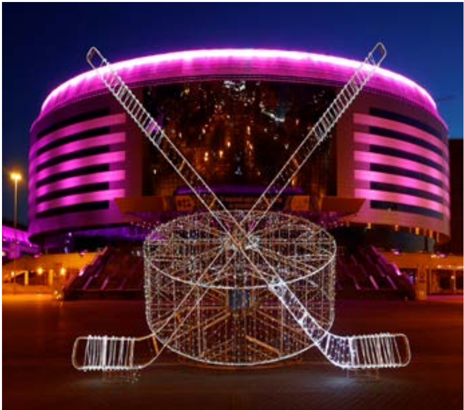
A general view of Minsk Arena complex before the lights are dimmed to mark Earth Hour, in Minsk