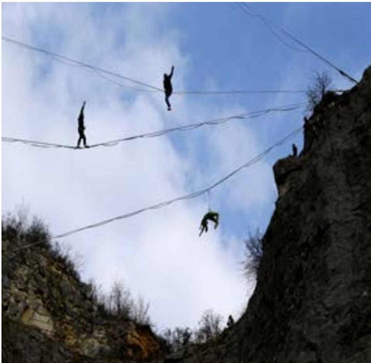
Participants balance on lines during highline event near Beroun