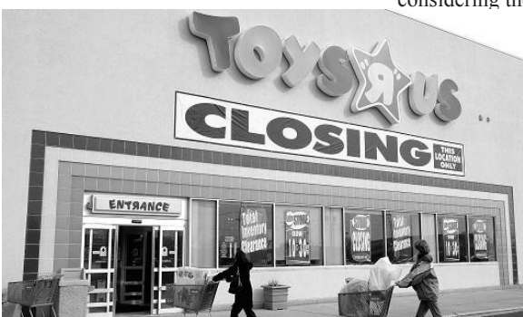
‘Store Closing’ sign is posted in a Toys R Us store.

Just four months ago and prior to the holiday shopping season, Toys R Us filed for bankruptcy protection as its sales were waning and debt was piling up. The toy chain faces increased competition from the likes of Amazon, Walmart, and Target, and it’s struggled meeting consumers’ needs online.