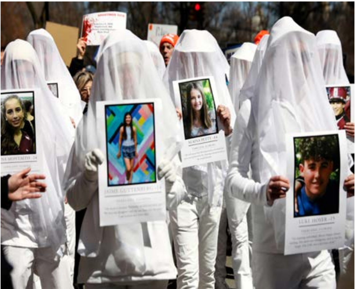
Protesters hold photos of victims of school shootings during a “March For Our Lives” demonstration demanding gun control in New York City