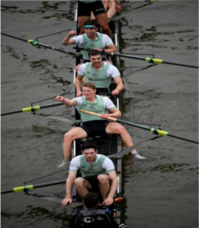
2018 Oxford University vs Cambridge University Boat Race