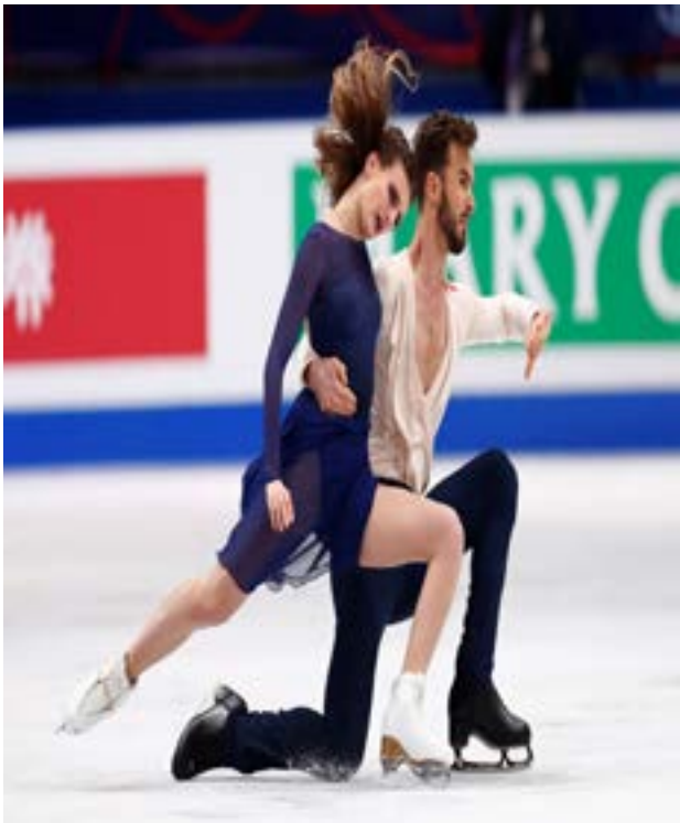
Figure Skating - World Figure Skating Championships - The Mediolanum Forum, Milan, Italy - March 24, 2018 France’s Gabriella Papadakis and Guillaume Cizeron during the Ice Dance Free Dance