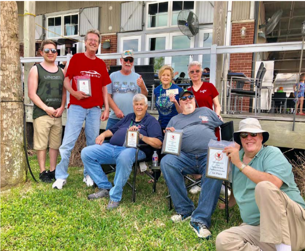
HALF club Prize winners!