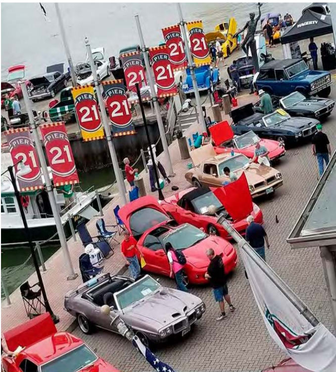
Pier 21 in Galveston where hundreds of old classic cars, mostly vintage Pontiacs meet to celebrate America's greatest!