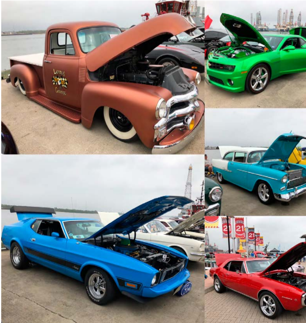
Some of the other cool cars