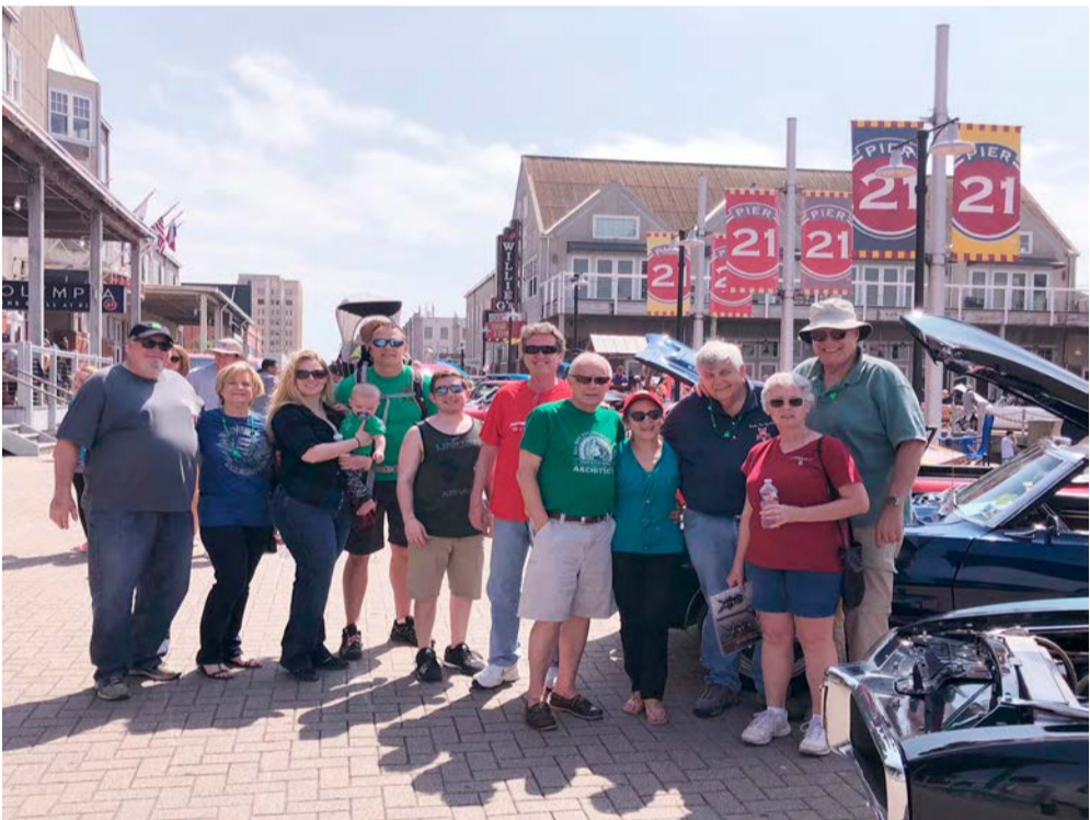
Houston Area Legendary Firebird HALF car club members at the event