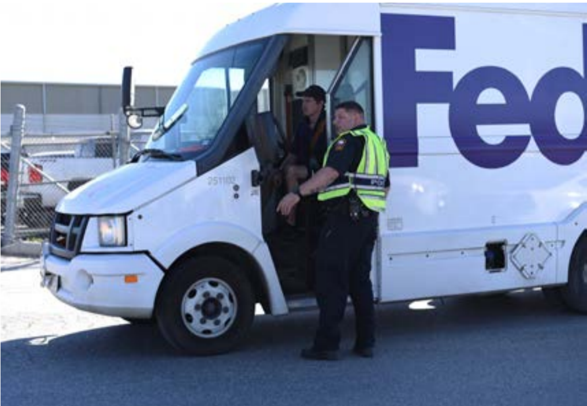
An officer with Schertz Police Department holds a FedEx truck from entering the scene of a blast at

delivery office in Sunset Valley. It appears that the source of the suspect packages was a private package delivery office in Sunset Valley," Sunset Valley police said in a statement. Even with the apparent Austin link, it remained unknown whether the latest incident was the work of what Austin police said could be a serial bomber who is responsible for the four earlier devices that killed two people and injured four others. The blast at the FedEx facility in Schertz was the fifth in the state in the last 18 days and the first involving a commercial parcel service. "We are committed to bringing perpetrators of these heinous acts to justice. There is no apparent nexus to terrorism at this time," White House spokesman Sarah Sanders said in a Twitter post. Investigators were trying to come up with a theory or intelligence regarding the motive for the bombings or identity of the bomber or bombers, a U.S. security official and a law enforcement official told Reuters. The FBI was investigating the FedEx package explosion as if there were a connection to the Austin bombings, the law enforcement official said. Both sources declined to be identified.