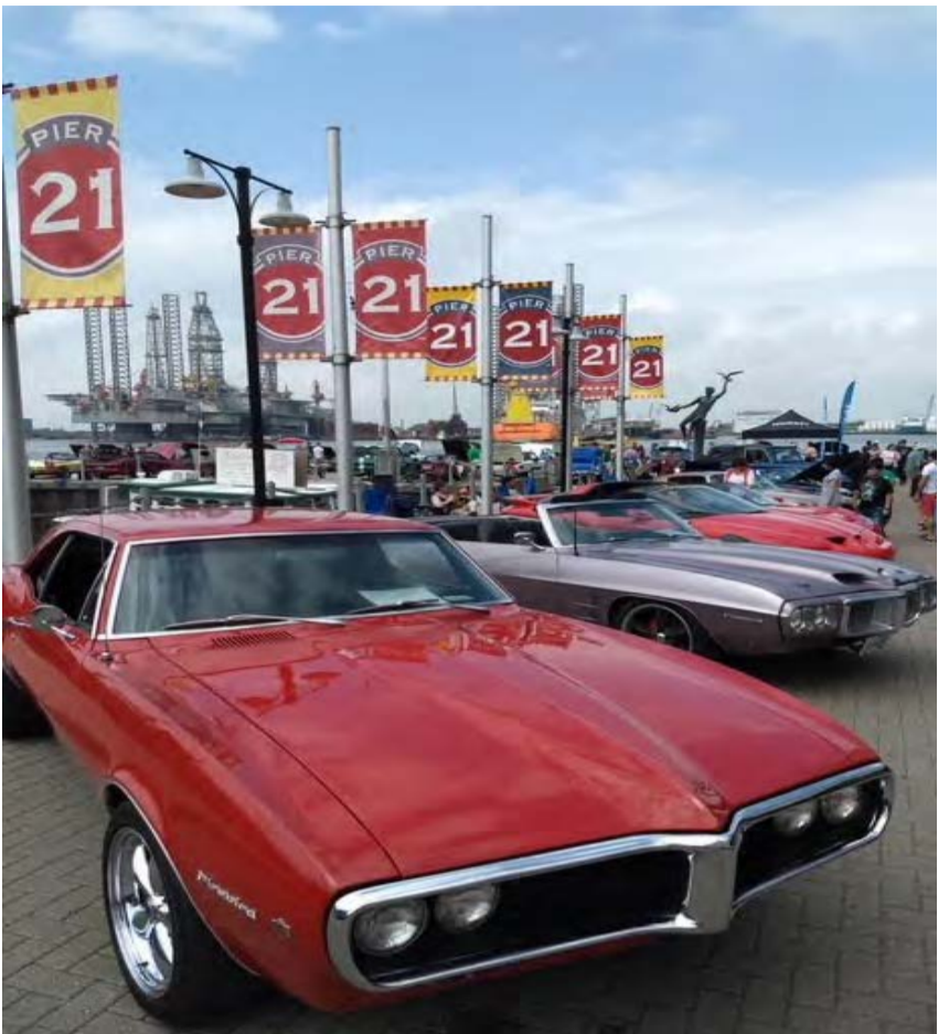
1967 Pontiac Firebird, 1st year Firebird production. Next a 69 Firebird then a 2000 Firehawk.