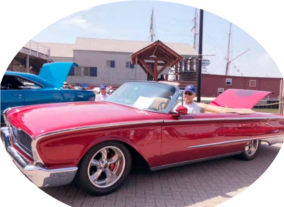
1960 Ford Galaxy with the proud owner