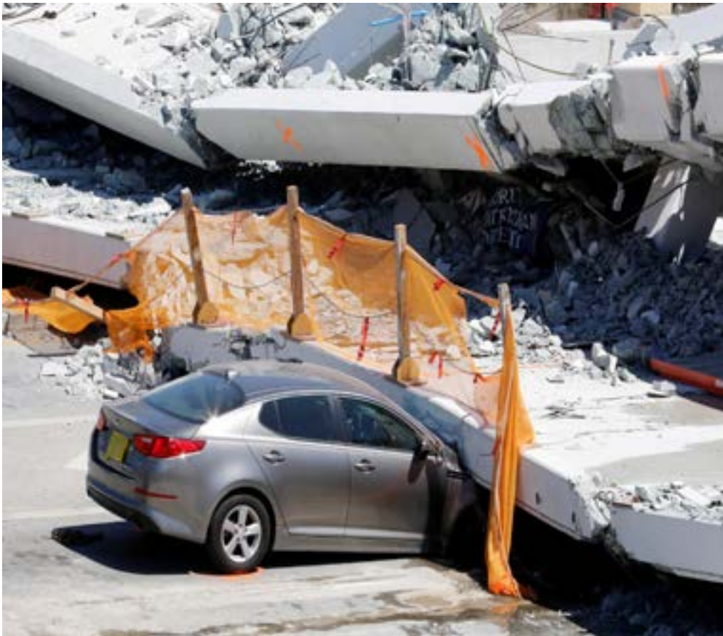
A damaged car is seen partially trapped as workers remove debris from a collapsed pedestrian bridge at Florida International University in Miami