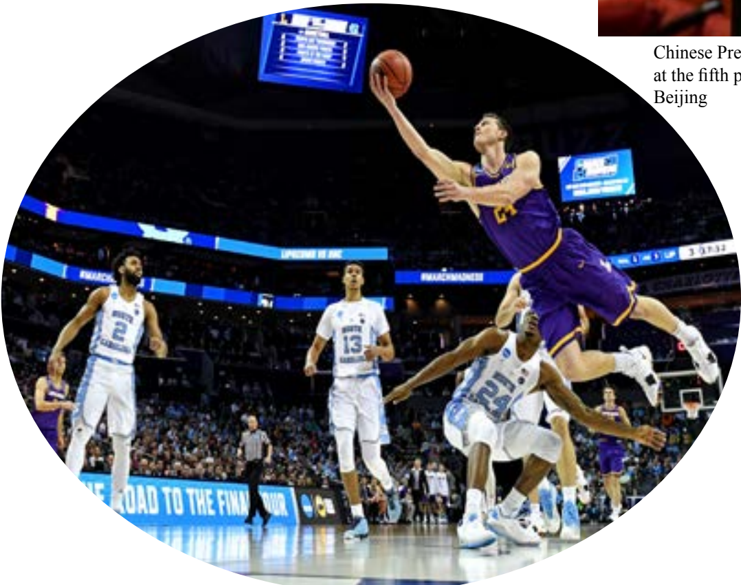
NCAA Basketball: NCAA Tournament-First Round-North Carolina vs Lipscomb