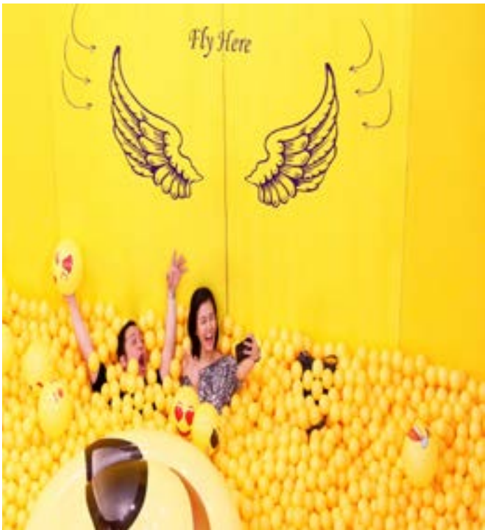
A couple takes a phone selfie at an amusement center