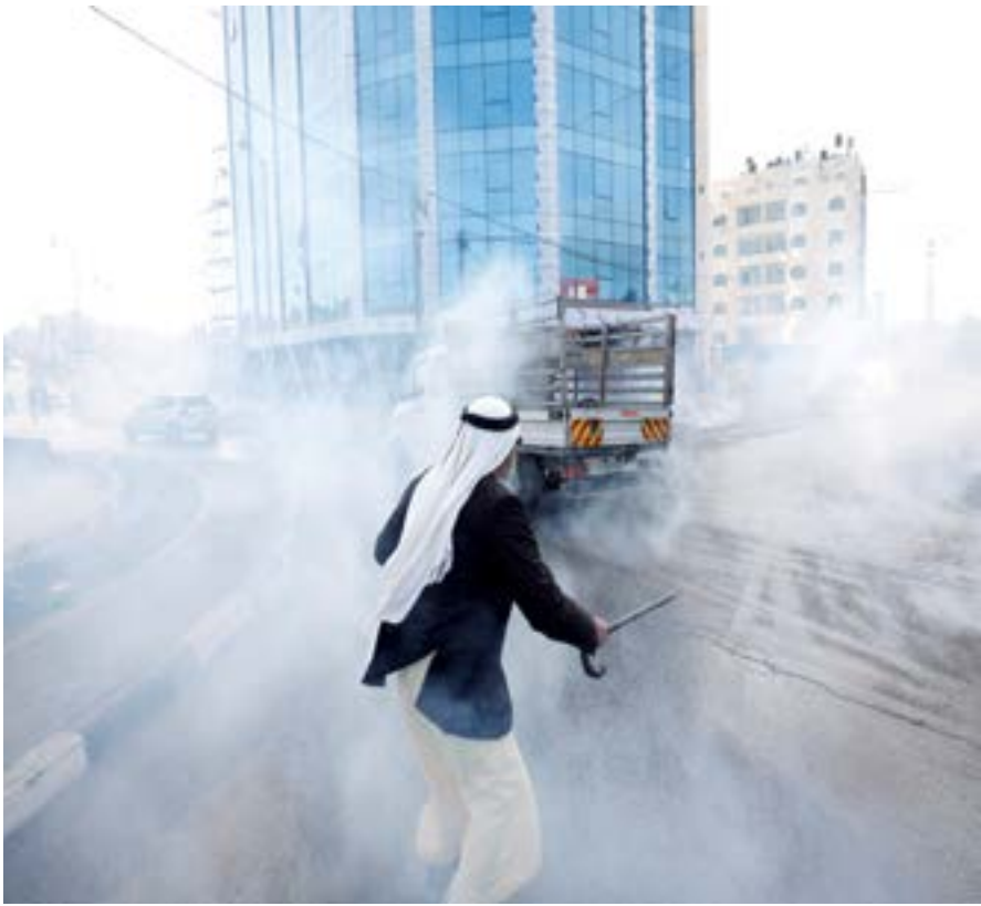
A Palestinian runs from tear gas fired by Israeli troops during clashes at a protest against U.S. President Donald Trump's decision on Jerusalem, near Ramallah, in the occupied West Bank