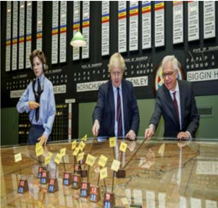
Britain's Foreign Secretary Boris Johnson and the Polish Foreign Minister Jacek Czaputowicz visit a Battle of Britain bunker at RAF Northolt in Uxbridge