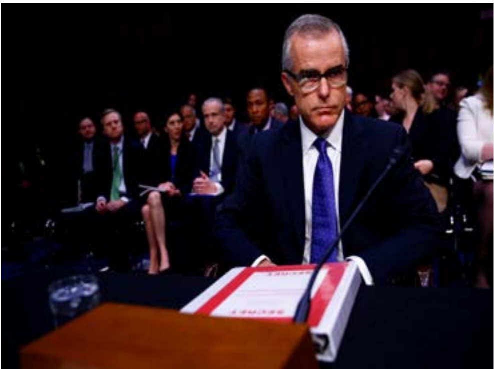
FILE PHOTO: Acting FBI Director Andrew McCabe arrives to testify before the U.S. Senate Select Committee on Intelligence on Capitol Hill in Washington