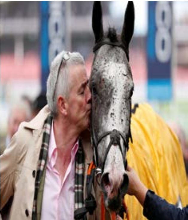
Horse Racing - Cheltenham Festival