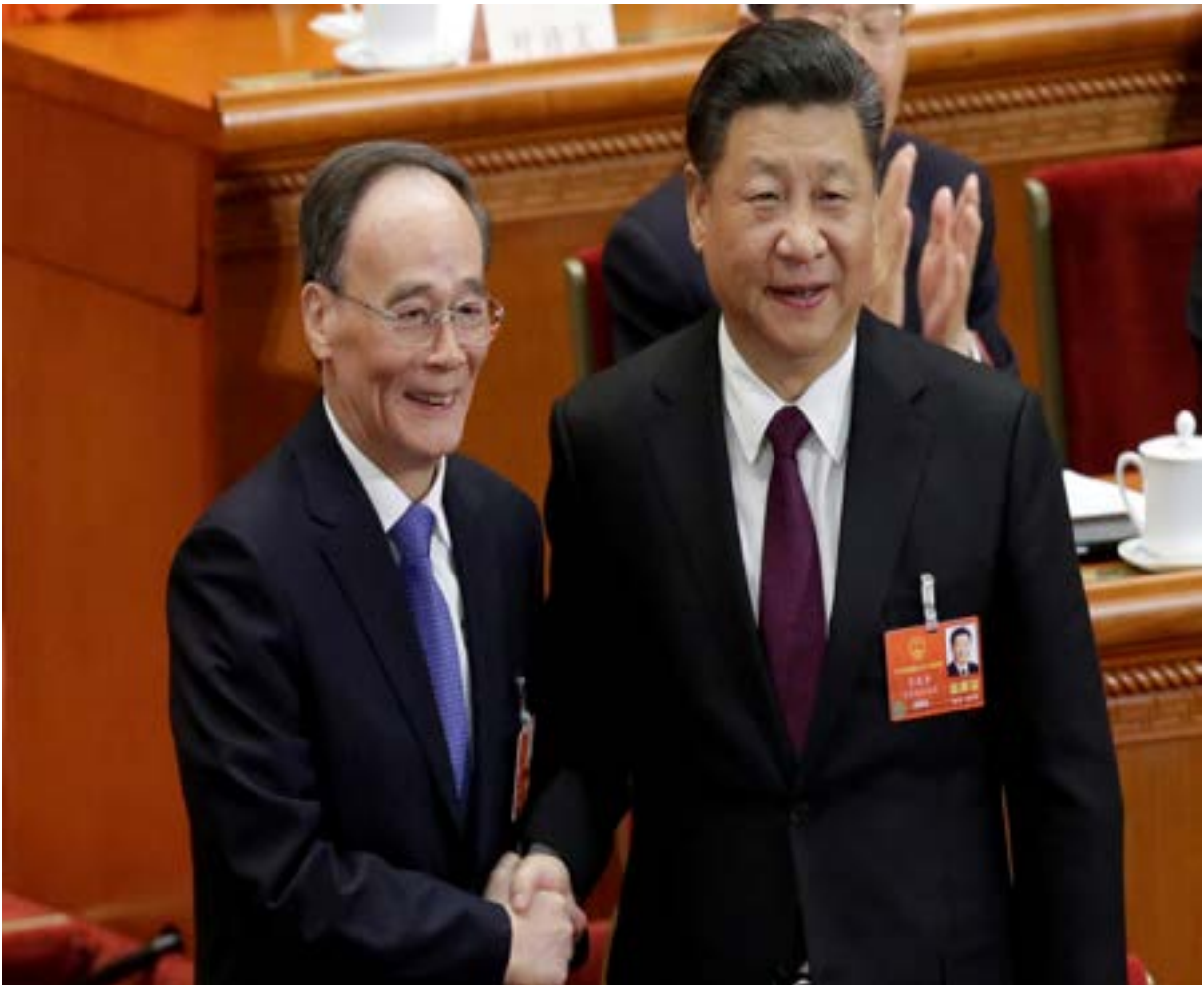
Chinese President Xi Jinping shakes hands with newly elected Chinese Vice President Wang Qishan at the fifth plenary session of the National People's Congress (NPC) at the Great Hall of the People in Beijing