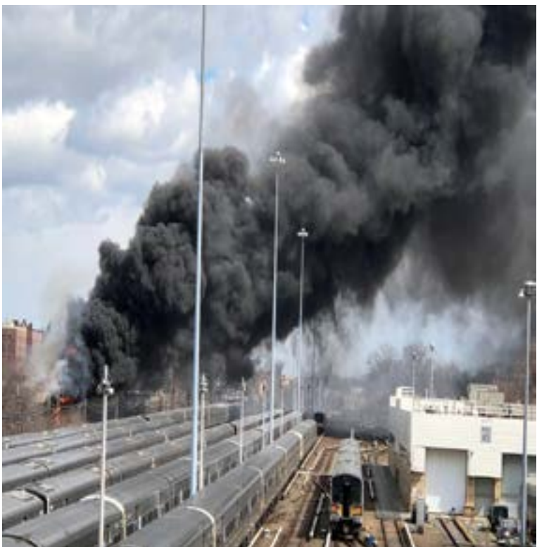
A fire breaks at a New York recycling plant next to the tracks of the Long Island Rail Road in New York City, New York