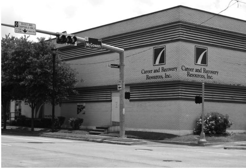
Career and Recovery Resources, Inc. (CRR) Main Campus, in Midtown Houston, 2525 San Jacinto St. @ McGowen Houston, Texas, 77002