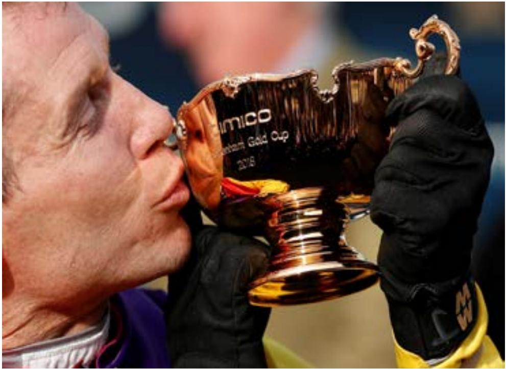
Horse Racing - Cheltenham Festival