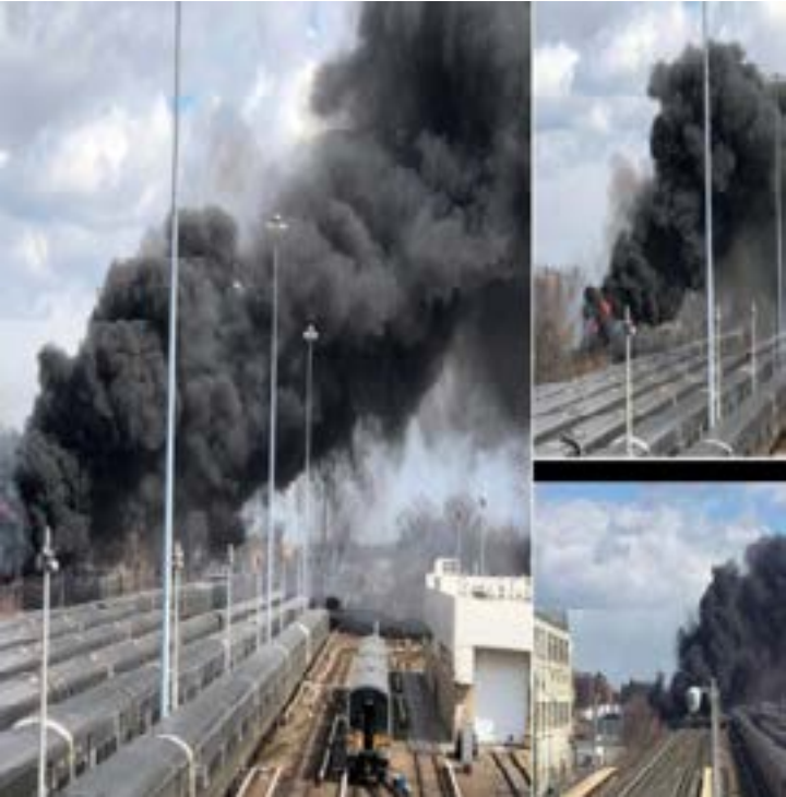
A fire breaks at a New York recycling plant next to the tracks of the Long Island Rail Road in New York City