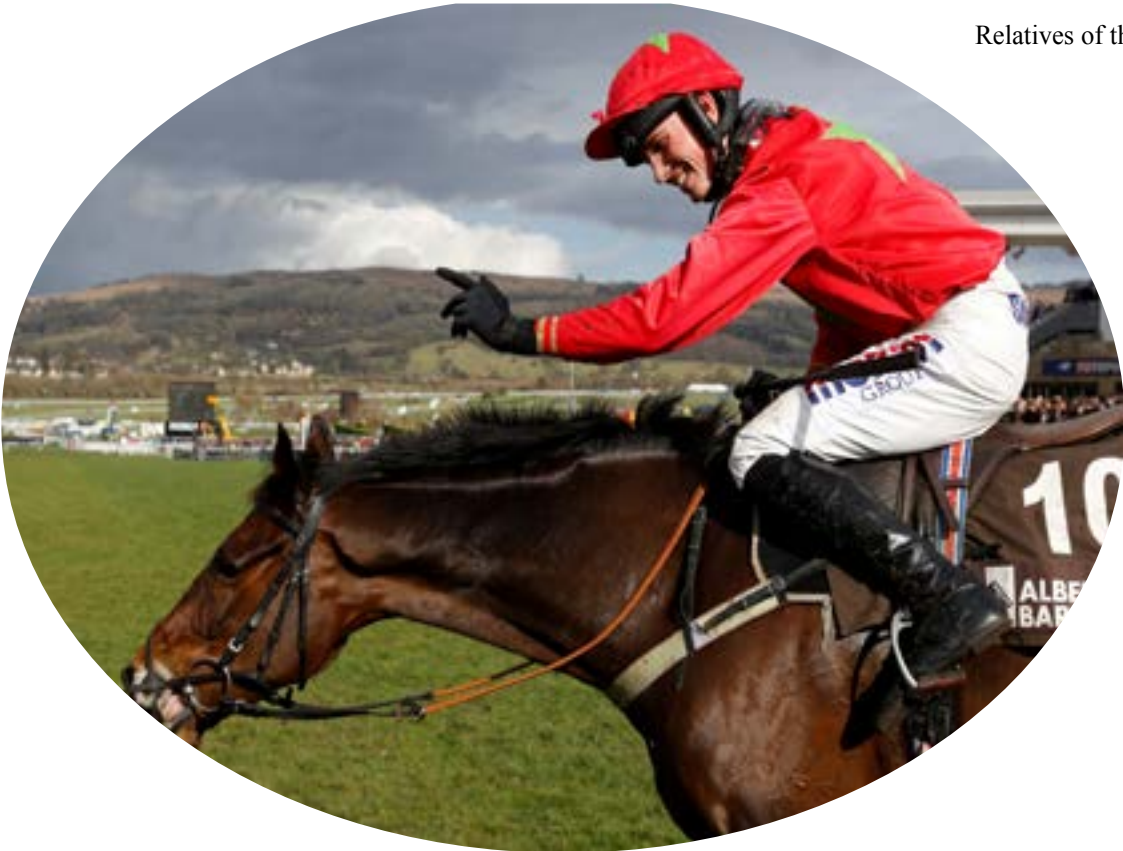
Horse Racing - Cheltenham Festival