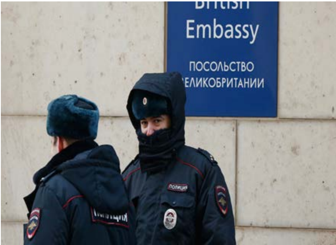
Russian policemen walk outside the British embassy in Moscow