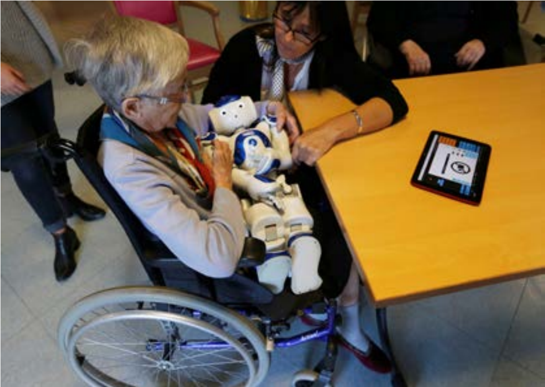
An elderly woman plays with a robot named NAO, manufactured by Softbank Robotics, in her retirement home in Bordeaux