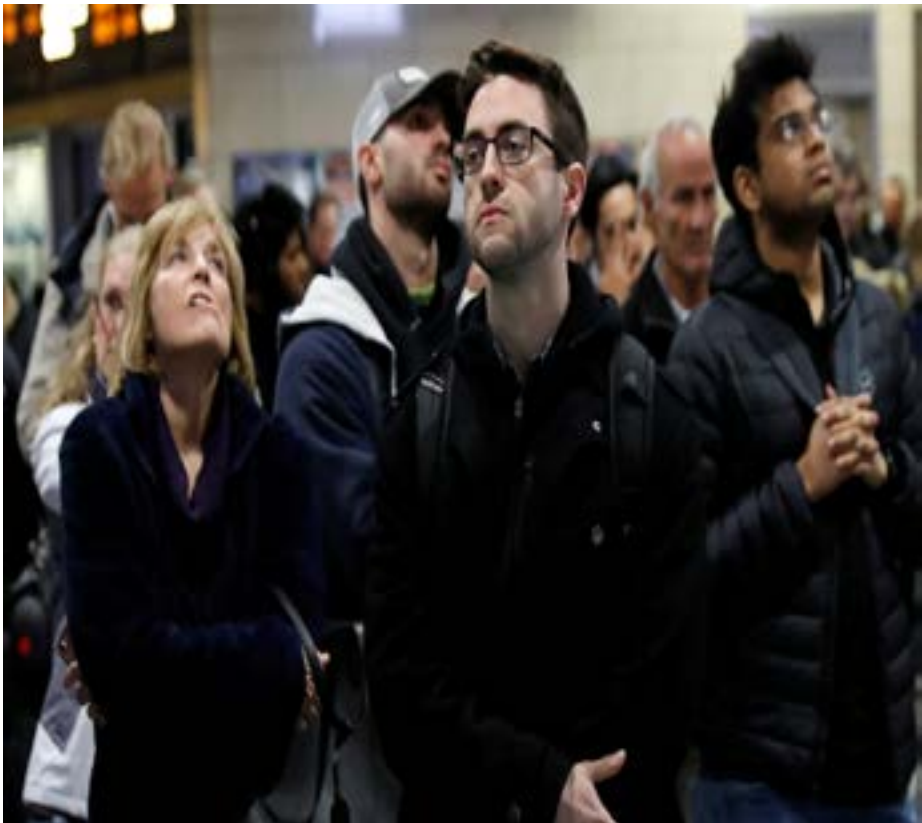
People stand in Pennsylvania Station waiting for trains in the Manhattan borough of New York City