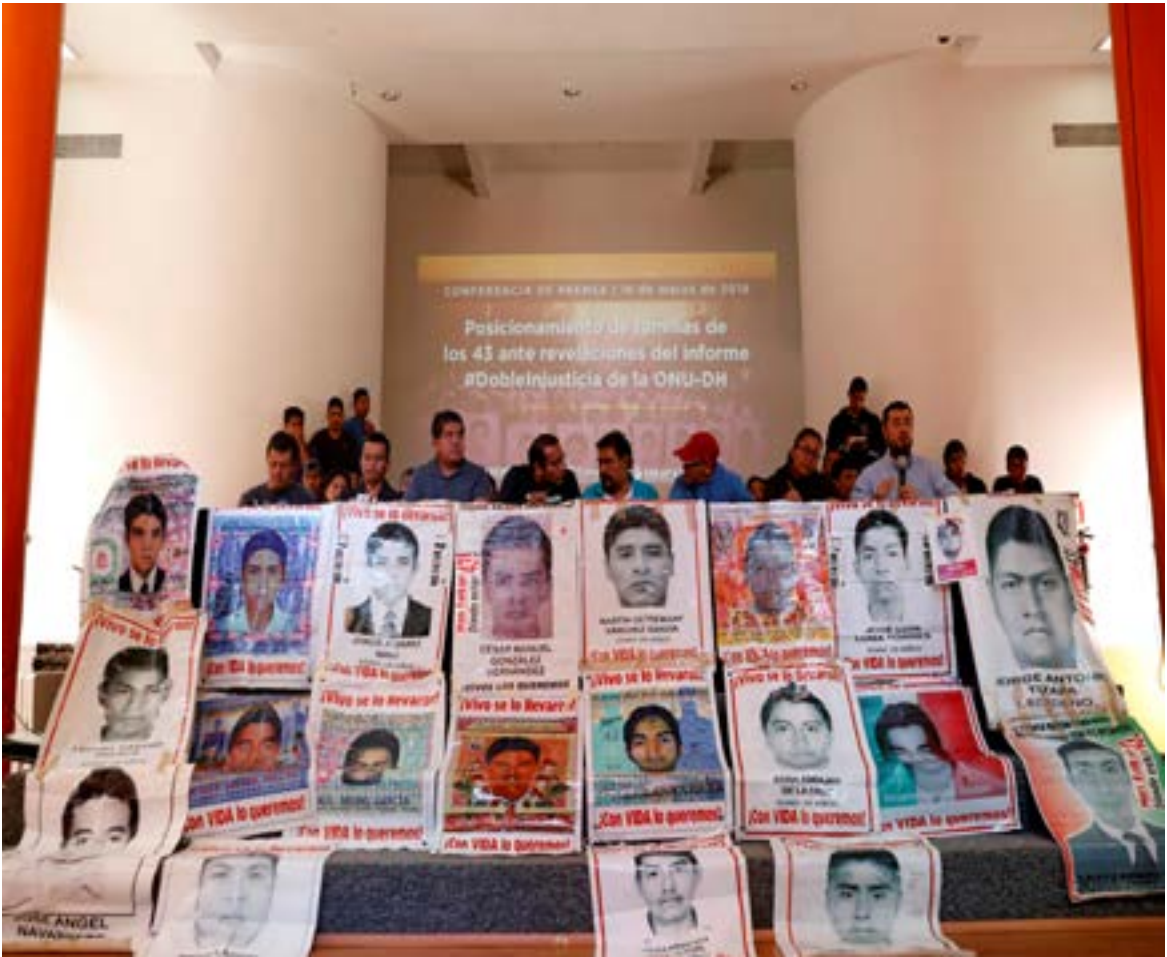
Relatives of the 43 students of Ayotzinapa hold a news conference in Mexico City