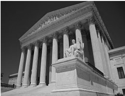
U.S. Supreme Court Building in Washington, D.C

WASHINGTON — The Supreme Court agreed Friday to decide if states should be able to collect taxes on internet sales, which would generate billions in revenue for local governments, but also raise the cost of online shopping for consumers. Just over a quarter-century ago, the court ruled that a state could not force mail order catalog companies to collect sales taxes unless they had a physical presence in the state. Led by South Dakota, 36 states want the court to take another look at the issue, arguing that the 1992 decision was issued “before Amazon was even selling books out of Jeff Bezos’s garage.” Part of the court’s logic was that it would be too difficult for mail order companies to compute the widely varying tax rates among, and even within, the 50 states. But lawyers for South Dakota said that’s no longer an issue in the digital age. “Advances in computing have made it easy for retailers to collect different states’ sales taxes,” they wrote in a court brief. Internet companies “can instantly tailor their marketing and overnight delivery of hundreds of thousands of products to individual customers based on their IP addresses. These companies can surely calculate sales tax from a zip code,” the state said.