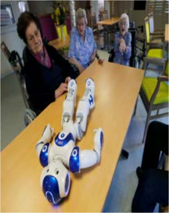
Elderly people play with a robot named NAO, manufactured by Softbank Robotics, in their retirement home in Bordeaux