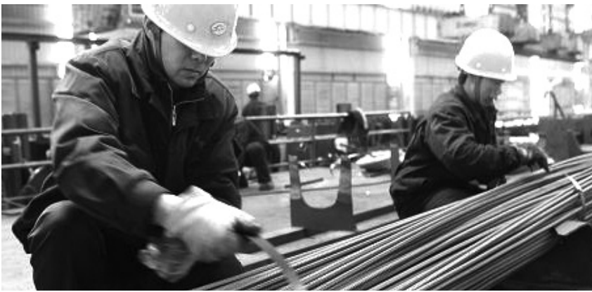
China will produce--and consume--more steel in 2018.