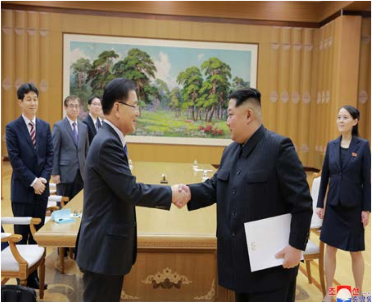
North Korean leader Kim Jong Un shakes hands with a member of the special delegation of South Korea's President