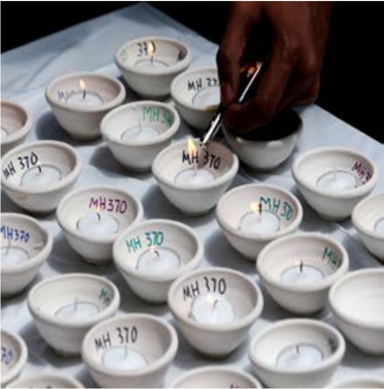
Man lights candles during the fourth annual remembrance event for the missing Malaysia Airlines flight MH370, in Kuala Lumpur