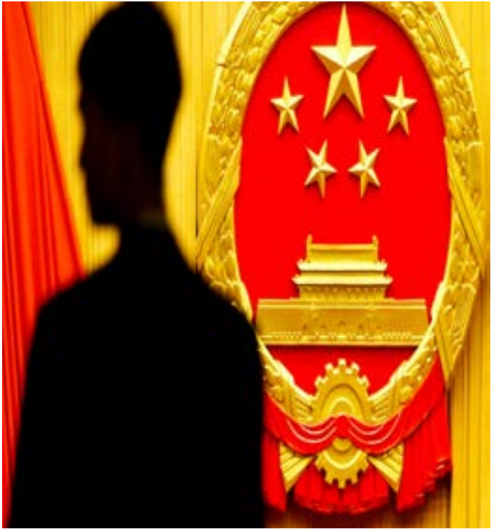
A member of the security personnel keeps watch at the end of the opening session of the National People's Congress in Beijing