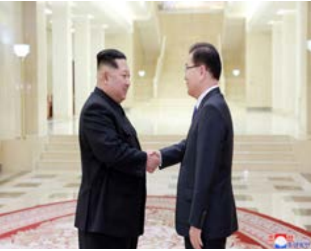
North Korean leader Kim Jong Un shakes hands with Chung Eui-yong who is leading a special delegation of South Korea's President, in this photo released by North Korea's Korean Central News Agency (KCNA) on March 6, 2018

ing and waiting! May be false hope, but the U.S. is ready to go hard in either direction!” There was no immediate comment from Pyongyang. The news came as a South Korean delegation returned from a first-ever meeting with North Korean leader Kim Jong Un in Pyongyang on Monday. The two sides will hold their first summit in more than a decade next month at the border village of Panmunjom, said Chung Eui-yong, the head of the South Korean delegation. The last inter-Korean summit was in 2007 when late former president Roh Moo-hyun was in office. “North Korea made clear its willingness to denuclearize the Korean peninsula and the fact there is no reason for it to have a nuclear program if military threats against the North are resolved and its regime is secure,” Chung told a media briefing. Chung cited North Korea as saying it would not carry out nuclear or missile tests while talks with the international community were under way. North Korea has not carried out any such tests since last