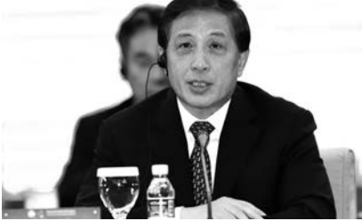
Chinese Vice Foreign Minister Zhang Yesui

Dalio founded Bridgewater Associates in 1975. The hedge fund now manages about $160 billion, according to its website. (Courtesy https://www.cnbc.com )