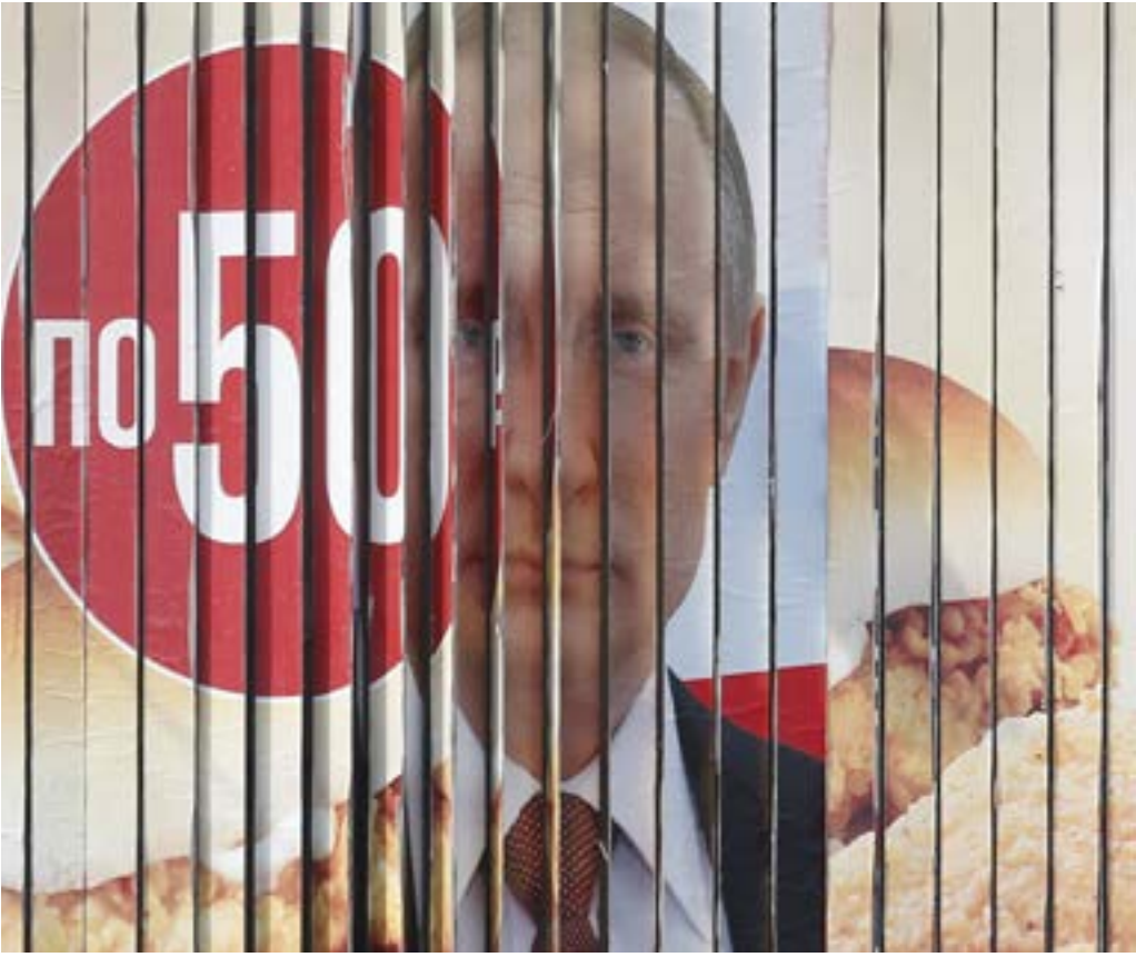
A board, advertising the campaign of Russian President Putin ahead of the presidential election, is on display in Stavropol