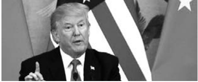
President Donald Trump and China’s President Xi Jinping (not shown) make a joint statement at the Great Hall of the People on November 9, 2017 in Beijing, China.

tween the U.S. and China is possible. “It seems to me that good deals are to be had for both countries, while a trade war has the risk of tit-for-tat escalations that could have very harmful trade and capital flow implications for both countries and for the world,” Dalio writes. Dalio’s firm manages about $160 billion, according to its website.