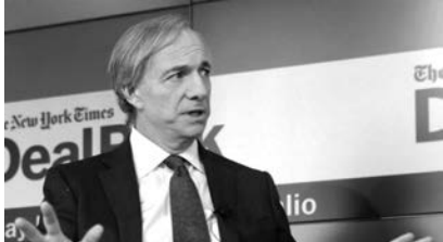
Bridgewater Associates found-

The hedge fund manager said the size of the tariffs announced thus far will have a “very small” impact on U.S.-China trade balances.