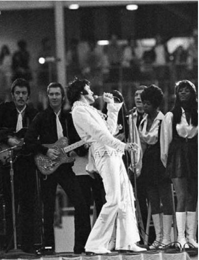
Feb. 27-March 1, 1970: Elvis Presley performed six shows at the Houston Livestock Show and Rodeo for a combined 207,494 fans. He returned for two shows on March 3, 1974, before 88,149.