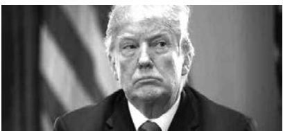
President Trump says he believes tariffs on imports will safeguard American jobs.

Trump has long sought a way to a more balanced trade relationship with China and is also considering potential trade sanctions against Beijing under a “Section 301” investigation into China’s intellectual property practices and pressure on foreign companies for technology transfers. His administration has said the United States mistakenly supported China’s membership in the World Trade Organization in 2001 on terms that have failed to force Beijing to open its economy. Diplomatic and U.S. business sources say the United States has all but frozen a formal mechanism for talks on commercial disputes with China because it is not satisfied Beijing has met its promises to ease market restrictions. (Courtesy https://www.cnbc.com )