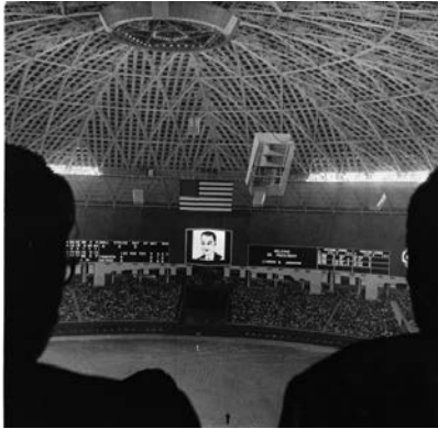
April 9, 1965: Opening Day, with President Johnson and Texas Gov. John Connally on hand for an Astros-Yankees exhibition game. Mickey Mantle launches the first Astrodome home run, but the Astros win, 2-1.