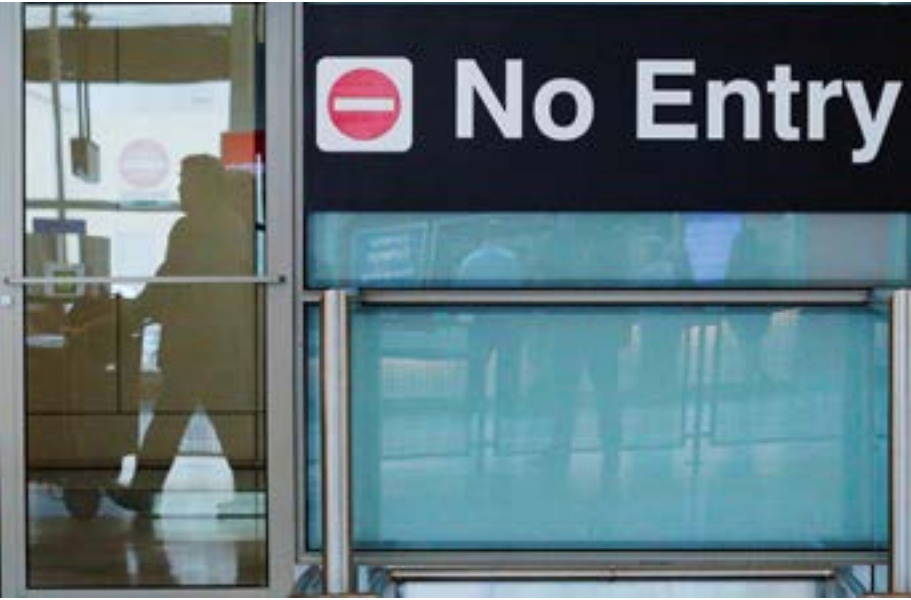
FILE PHOTO: International travelers (reflected in a closed door) arrive on the day that U.S. President Donald Trump's limited travel ban goes into effect at Logan Airport in Boston

all types of visa applications. But for the 2016 federal fiscal year, State Department data shows that applicants from the eight countries were refused tourist and business visas, called B visas, at rates of between 15 percent and 64 percent, depending on the country. North Koreans had the lowest rate of denials, while Somalis had the highest. In the first month after the travel ban took effect, more than 95 percent of U.S. visa applications from the countries were denied. Attorneys representing applicants abroad who were turned down for visas say consular officials have not clearly explained why their clients did not qualify for waivers. “There is a feeling of extreme frustration. People are operating basically in the blind,” said Diala Shamas, an attorney at the Center for Constitutional Rights, a New York-based nonprofit group that assists Yemeni applicants waiting for visas at the U.S. embassy