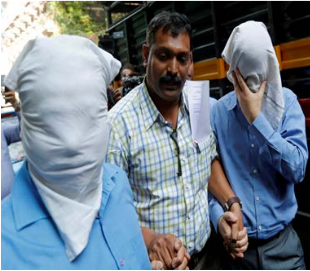
An official of India's CBI escorts men suspected of steering fraudulent loans to companies linked to billionaire jeweller Nirav Modi outside a court in Mumbai