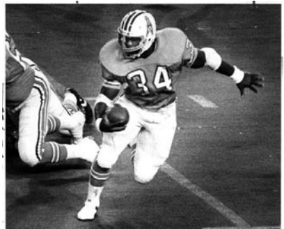
Dec. 22, 1973: The first high school championship game at the Astrodome featured a future Houston favorite – Earl Campbell, who ran for 164 yards and two TDs in