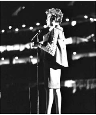
Dec. 17, 1965: Judy Garland, with the Supremes as opening act, presents the first