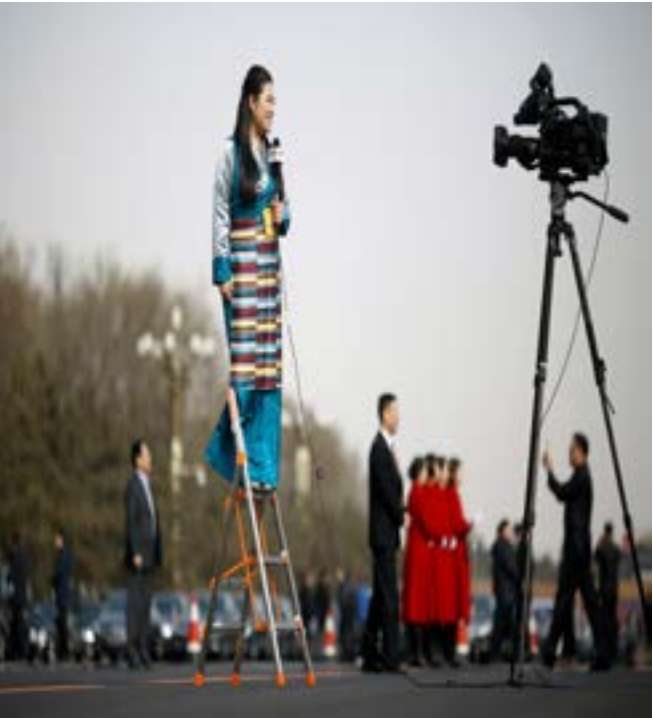
Journalist reports on a ladder outside the Great Hall of the People during the opening session of the National People's Congress (NPC) in Beijing