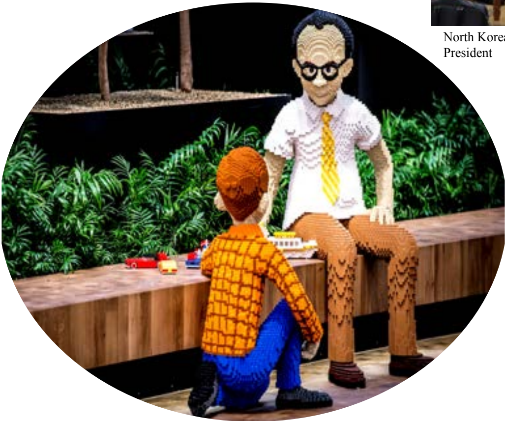
LEGO House in Billund, Denmark, March 6, 2018.