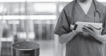
Speculation is that Amazon is interested in at least some aspects of the pharmacy business.

“The pharmacy business was always a topic of interest when I was with Amazon, and there was a sincere desire on the part of Amazon to create a better customer experience across pharmacy and health care as a whole,” he said.