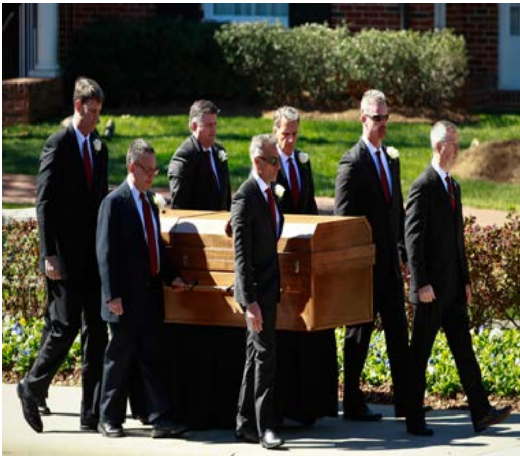
Casket is carried during funeral service for the late U.S. evangelist Billy Graham in Charlotte