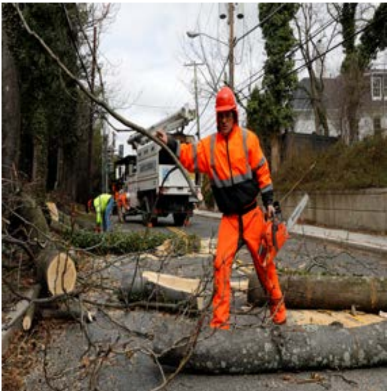
A worker removes a fallen tree blocking a road on Foxholl Road as high-wind weather conditions continue in Washington, U.S. March 2, 2018.