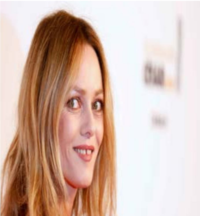
43rd Cesar Awards ceremony - Red Carpet Arrivals - Paris, France. 02/03/2018. Director and President of Ceremony Vanessa Paradis poses before the start of the ceremony.