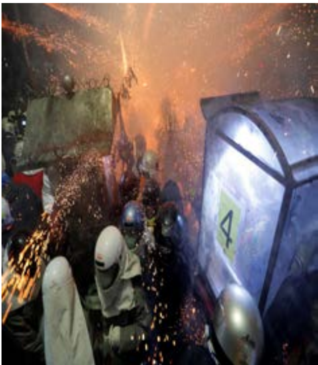
Participants wearing motorcycle helmets get sprayed with firecrackers, during the ‘Beehive Firecrackers’ festival at the Yanshui district in Tainan