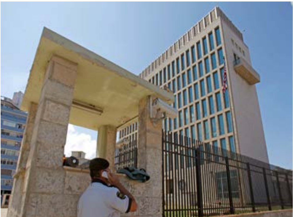
A security guard uses a phone outside of the U.S. Embassy in Havana