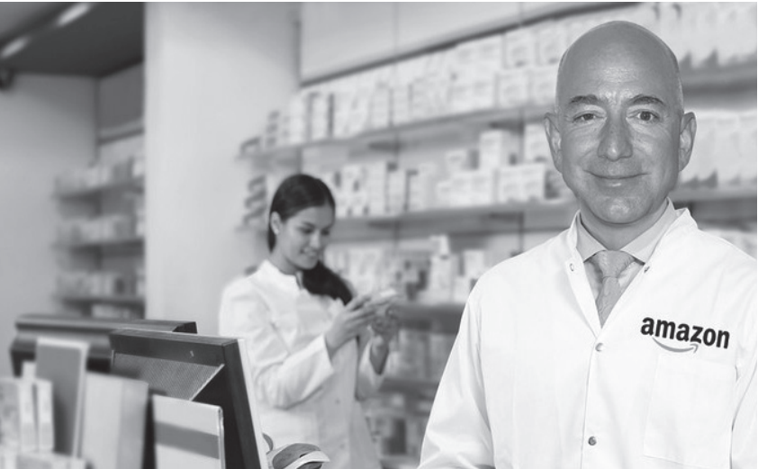
The pharmacy market, with huge amounts of consumer spending and frustrating inefficiencies, could be attractive to Amazon. Above, Jeff Bezos, Amazon CEO.