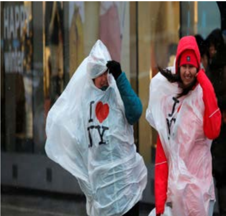
People struggle against strong wind while waiting to cross 42nd Street in the Times Square district during a winter nor’easter in New York City, U.S.