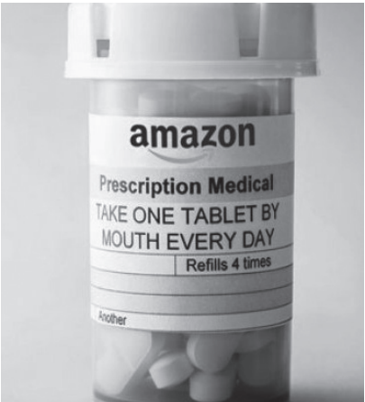
Amazon is eying the pharmacy market that has huge amounts of consumer spending and a long list of frustrating inefficiencies.

The near-term threat may be somewhat overstated. Amazon has received wholesale pharmacy licenses in at least a dozen states, as The St. Louis Post-Dispatch reported on Thursday. But the licenses permit the company to sell other kinds of products too. In Connecticut, for example, the license is for “wholesale of drugs, cosmetics and medical devices,” while in Louisiana it was granted to a “drug or device distributor.”