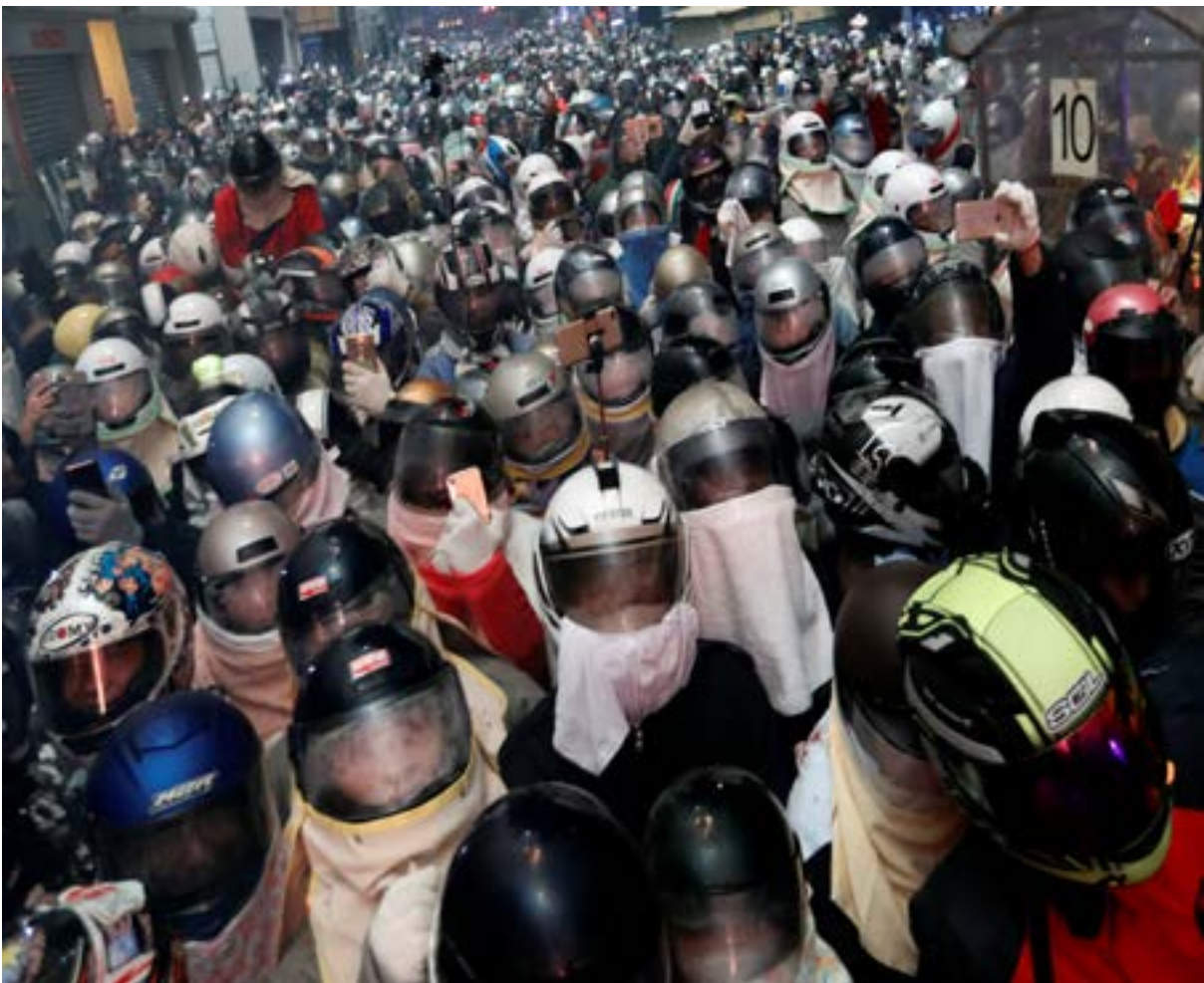
Participants wear motorcycle helmets as they attend the ‘Beehive Firecrackers’ festival at the Yanshui district in Tainan