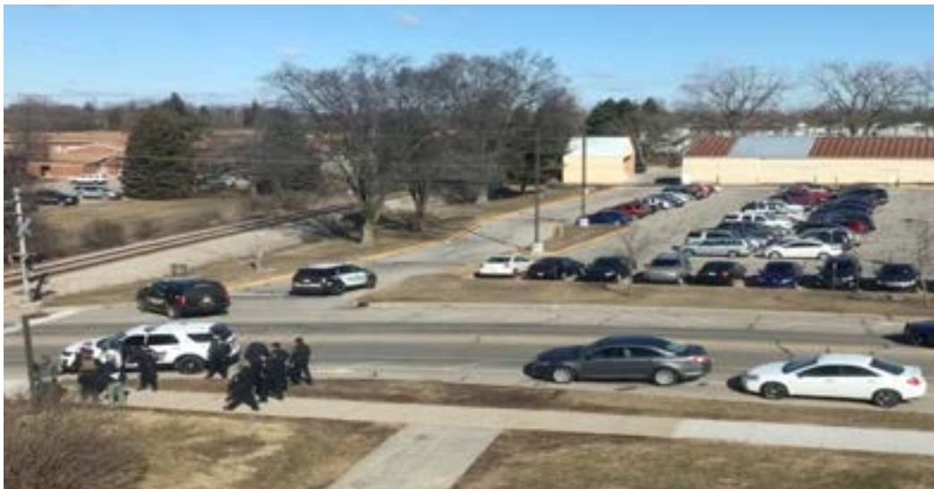
The site of shooting at Central Michigan University is seen, in Mount Pleasant, U.S., March 2, 2018 in this picture obtained from social media. COURTESY of GRANT POLMANTEER

in the city of Mount Pleasant, according to video posted online by reporters on the scene. The United States Bureau of Alcohol, Tobacco, Firearms and Explosives said on Twitter sent special agents to assist. “The priority right now is the safety of those still on campus and I thank all first responders involved for their swift action,” Michigan