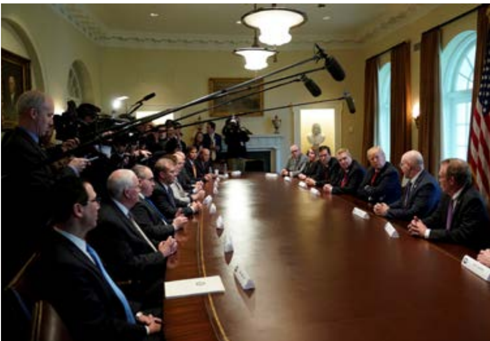
Trump holds a meeting on steel and aluminum tariffs at the White House in Washington

“We must protect our country and our workers. Our steel industry is in bad shape. IF YOU DON’T HAVE STEEL, YOU DON’T HAVE A COUNTRY!” he wrote. Many economists say that instead of increasing employment, price increases for consumers of steel and aluminum such as the auto and oil industries will destroy more U.S. jobs than they create. Major U.S. trade partners are likely to retaliate against any new duties imposed by Washington. Europe has drawn up a list of U.S. products on which to apply tariffs if Trump follows through on his plan. “We will put tariffs on Harley-Davidson, on bourbon and on blue jeans - Levis,” European Commission President Jean-Claude Juncker told German television. Officials have not said whether the tariffs would include imports from Canada and Mexico, Washington’s partners in the North American Free Trade Agreement (NAFTA), which is being reworked. Canadian Prime Minister Justin Trudeau said any U.S. tariffs on steel and aluminum imports would be “absolutely unacceptable” and vowed to continue to engage with U.S. officials on the issue. The International Monetary Fund also expressed concern about the proposed tariffs and said they likely would damage the U.S. economy as well as the economies