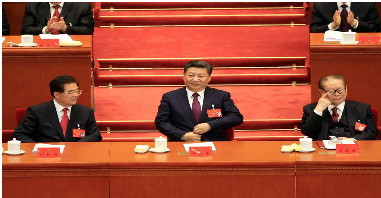
(L to R) Former Chinese president Hu Jintao, Chinese President Xi Jinping and former Chinese president Jiang Zemin are seen during the opening session of the 19th National Congress of the Communist Party of China at the Great Hall of the People in Beijing, China October 18, 2017.