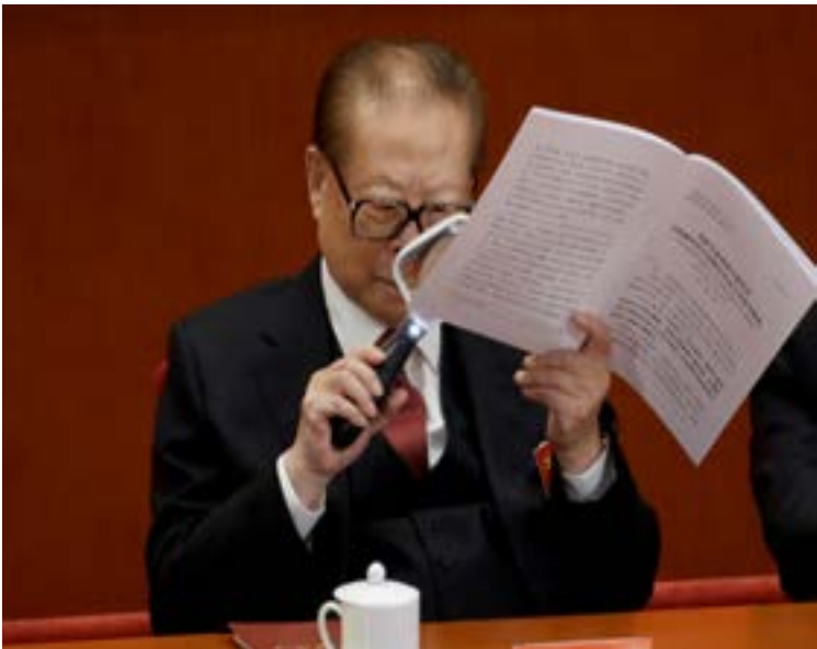
Former Chinese President Jiang Zemin uses a magnifier as he reads Chinese President Xi Jinping's report during the opening of the 19th National Congress of the Communist Party of China at the Great Hall of the People in Beijing