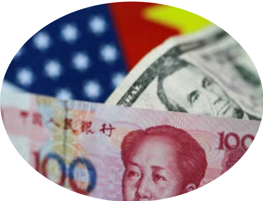
U.S. Dollar and China Yuan notes are seen in this picture illustration June 2, 2017.