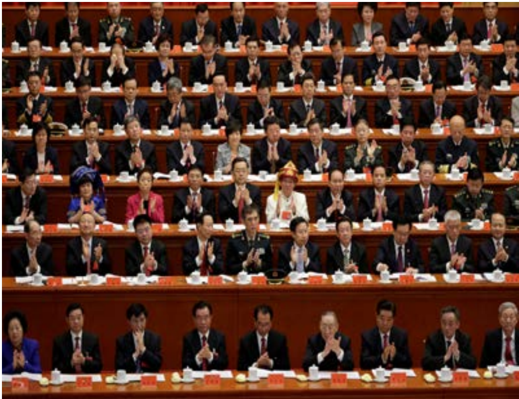
Delegates clap as Chinese President Xi Jinping delivers his speech during the opening of the 19th National Congress of the Communist Party of China at the Great Hall of the People in Beijing