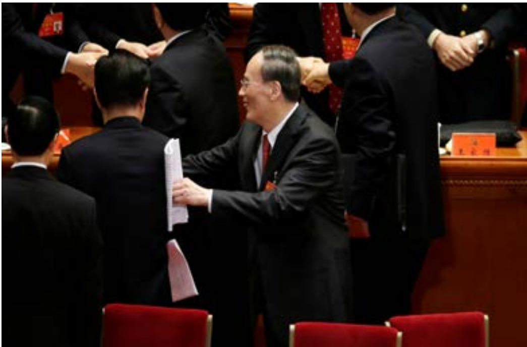
China's Politburo Standing Committee member Wang Qishan, the head of China's anti-corruption watchdog, leaves after the opening session of the 19th National Congress of the Communist Party of China in Beijing