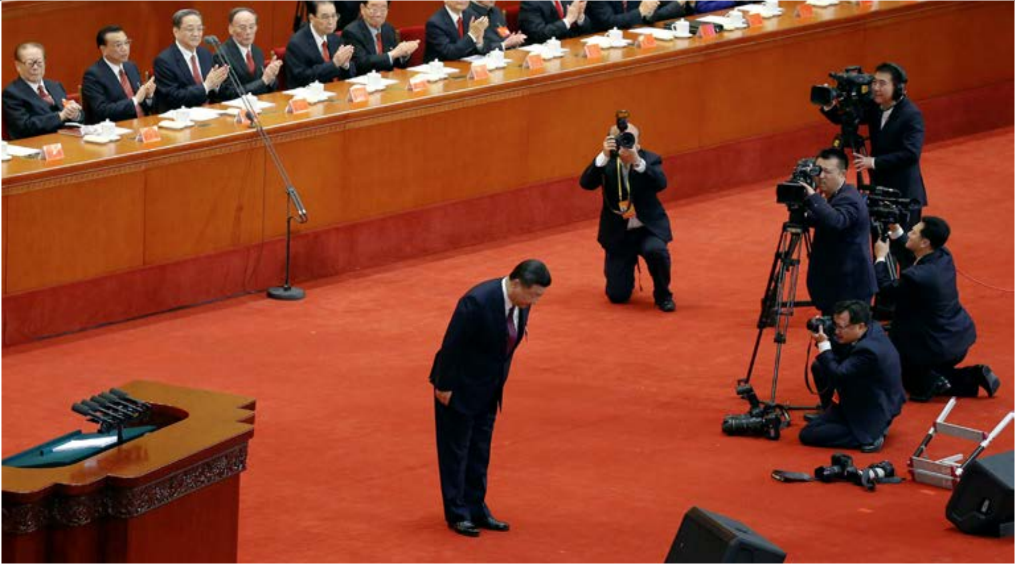
China's President Xi Jinping arrives for the closing session of China's National People's Congress (NPC) at the Great Hall of the People in Beijing