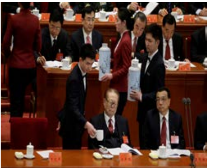
Former Chinese President Jiang Zemin (L) and Chinese Premier Li Keqiang attend the opening of the 19th National Congress of the Communist Party of China at the Great Hall of the People in Beijing