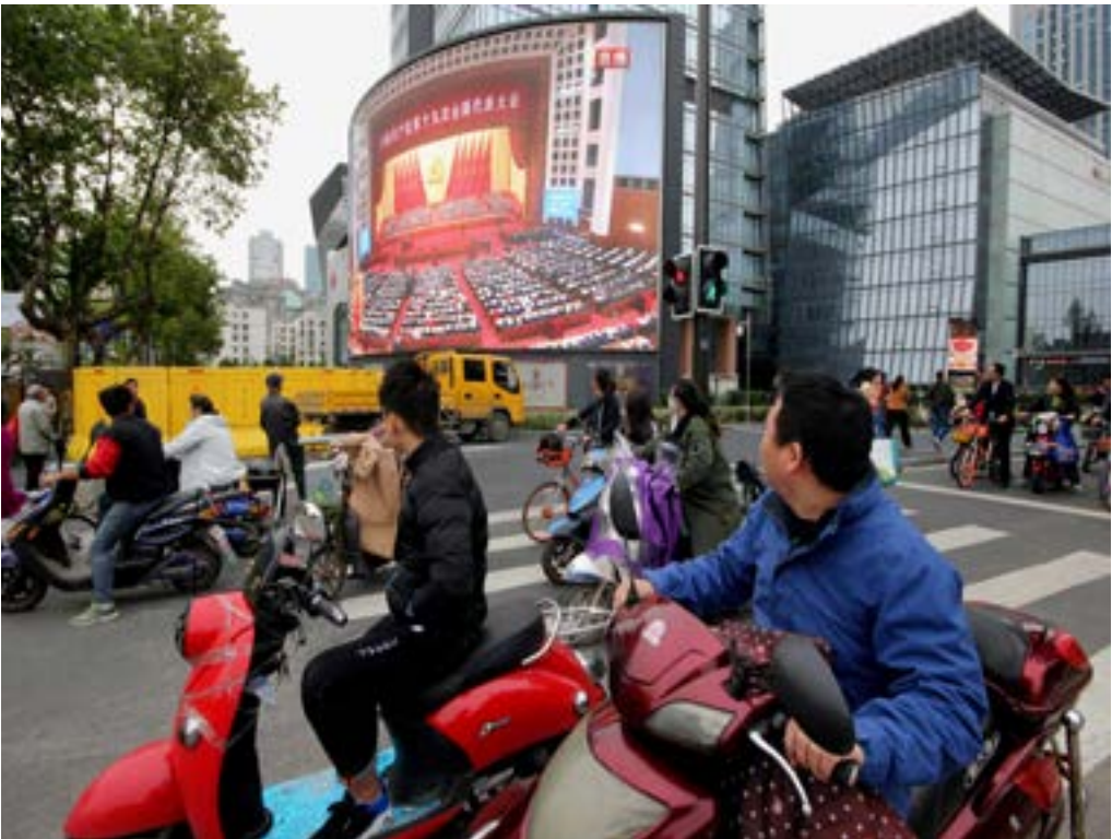
People watch a broadcast of Chinese President Xi Jinping delivering his speech during the opening of the 19th National Congress of the Communist Party of China, on a giant outdoor screen in Nanjing