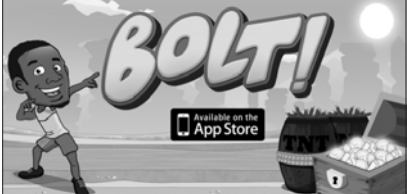
Gatorade cellphone game that features Olympic runner Usain Bolt.