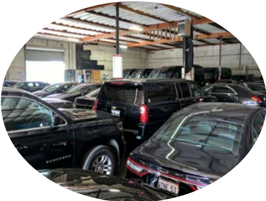
A fleet of tourism vehicles sit idled as wildfires spread in Napa, California, U.S., October 12, 2017.