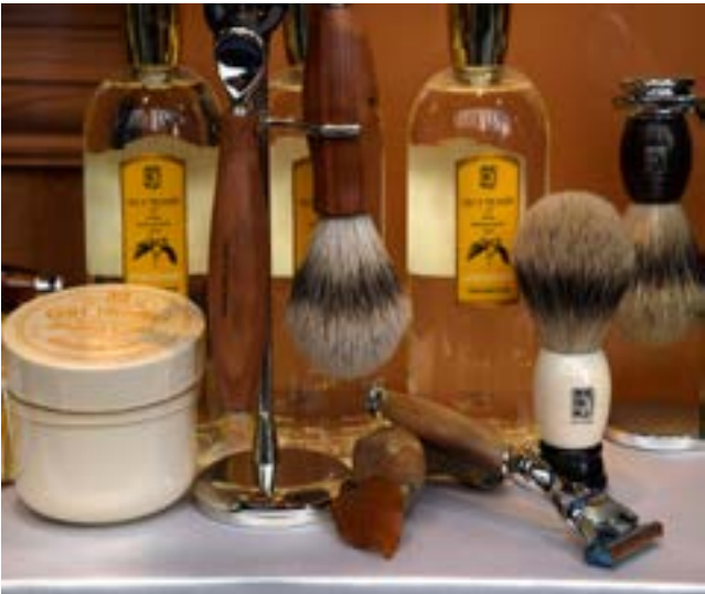
Men's hair and grooming products are seen on display for sale at a barber shop in London