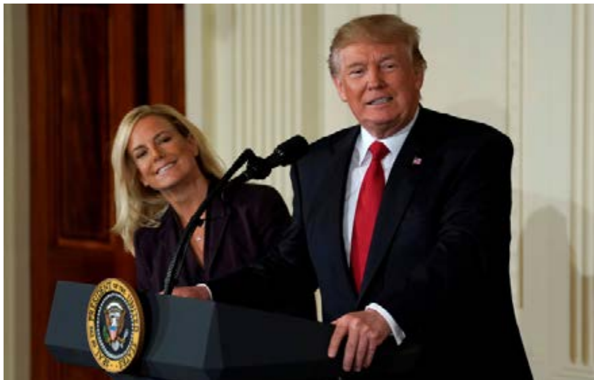
President Donald Trump introduces Secretary of Homeland Security nominee Kirstjen Nielsen