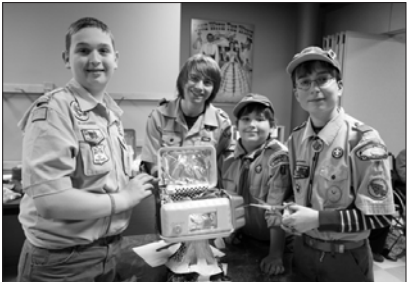
A new “American tradition” – girls in the Boy Scouts.