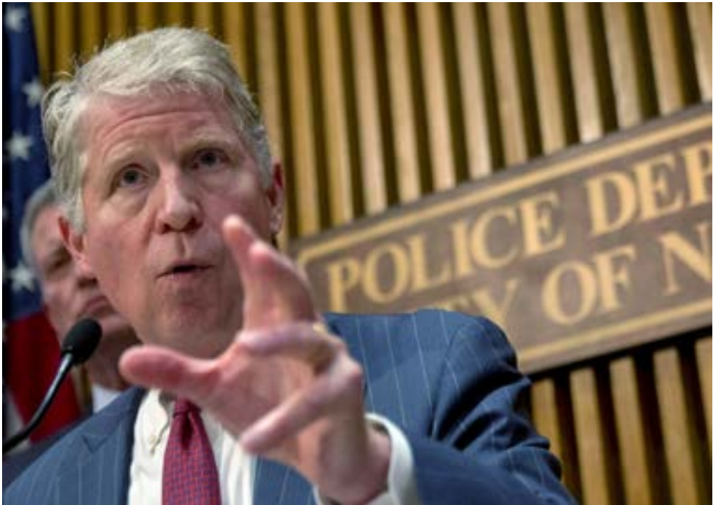
Manhattan District Attorney Cyrus Vance Jr. speaks during a news conference about a gun trafficking bust at New York City Police (NYPD) Headquarters in New York