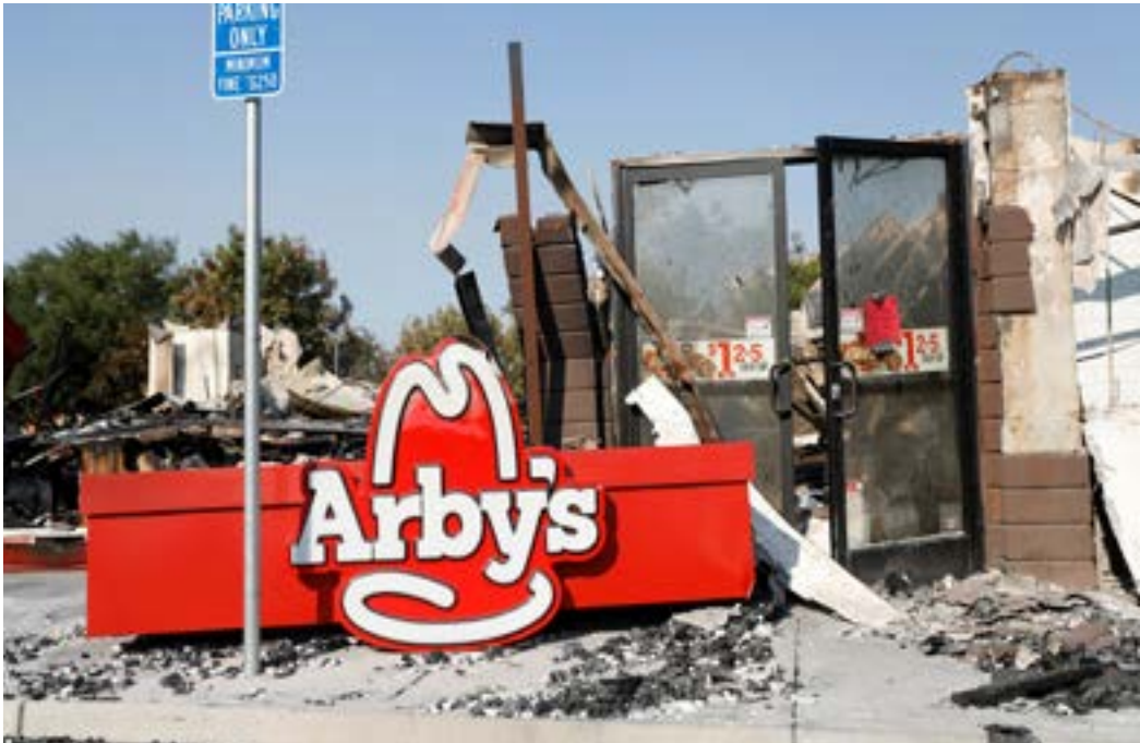
An Arby's destroyed by the Tubbs Fire is seen in Santa Rosa, California, U.S., October 12, 2017.