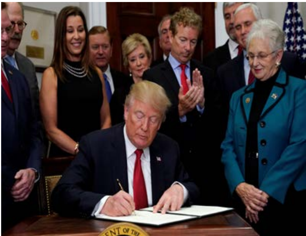
U.S. Senator Rand Paul (R-KY) applauds as U.S. President Donald Trump signs an executive order to make it easier for Americans to buy bare-bones health insurance plans and circumvent Obamacare rules at the White House in Washington, U.S., October 12, 2017.