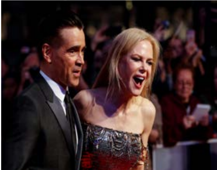
Cast members Colin Farrell and Nicole Kidman arrive for the UK Premiere of The Killing of a Sacred Deer in London