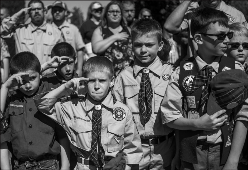
Boy Scouts and Cub Scouts in May saluting at a Memorial Day ceremony in Michigan. On Wednesday, the organization announced that it would accept girls into the Cub Scouts.

ed access to some programs before, but it has never before welcomed them into its core Cub Scouts and Boy Scouts programs. And the introduction of girls still does not mean that Boy Scouts’ gatherings will necessarily include both genders. The smallest groups of Cub Scouts will continue to be single sex.