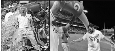
A Gatorade "drenching" of a winning team's coach or star athlete has become sports tradition.