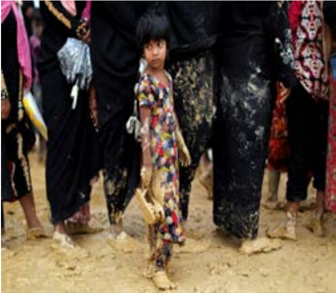
A Rohingya refugee girl queues to receive food at a camp near Teknaf