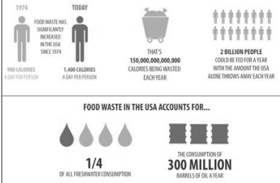
Food waste is a global problem according to the United Nations.