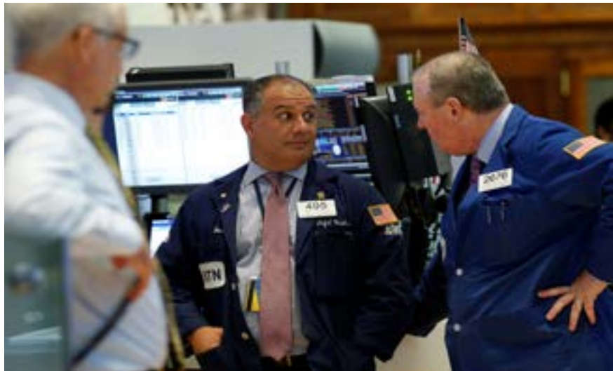
Traders work on the floor of the New York Stock Exchange (NYSE) in New York, U.S., September 21, 2017.

"The whole world should clearly remember it was the U.S. who first declared war on our country," Foreign Minister Ri Yong Ho told reporters in New York. "Since the United States declared war on our country, we will have every right to make countermeasures, including the right to shoot down United States strategic bombers even when they are not inside the airspace border