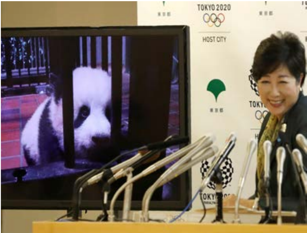
Panda cub Xiang Xiang is shown on a screen next to Tokyo Governor Yuriho Koiwa during news conference in Tokyo