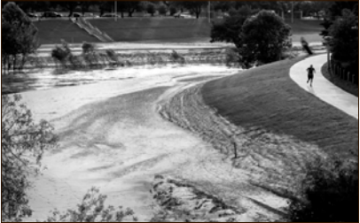
Floodwaters from Hurricane Harvey left "beaches" of sediment on the banks of Buffalo Bayou.