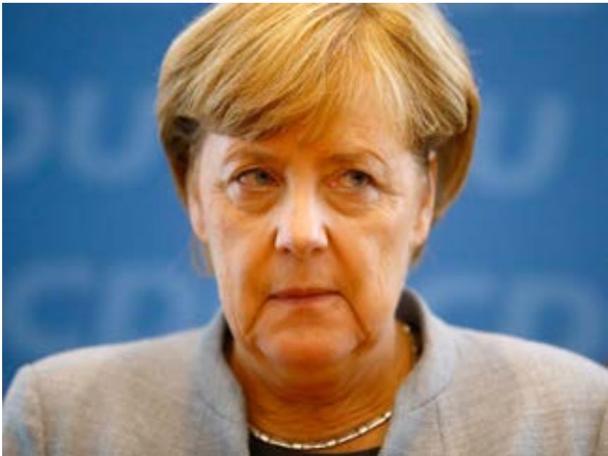
Christian Democratic Union CDU party leader and German Chancellor Angela Merkel arrives for a news conference at the CDU party headquarters, the day after the general election