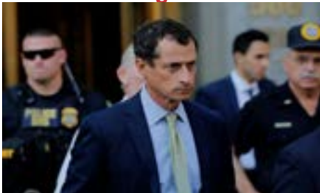
Former U.S. Congressman Anthony Weiner departs U.S. Federal Court, following his sentencing after pleading guilty to one count of sending obscene messages to a minor, in New York

Ex-U.S. Rep. Weiner sentenced to 21 months in teen 'sexting' case