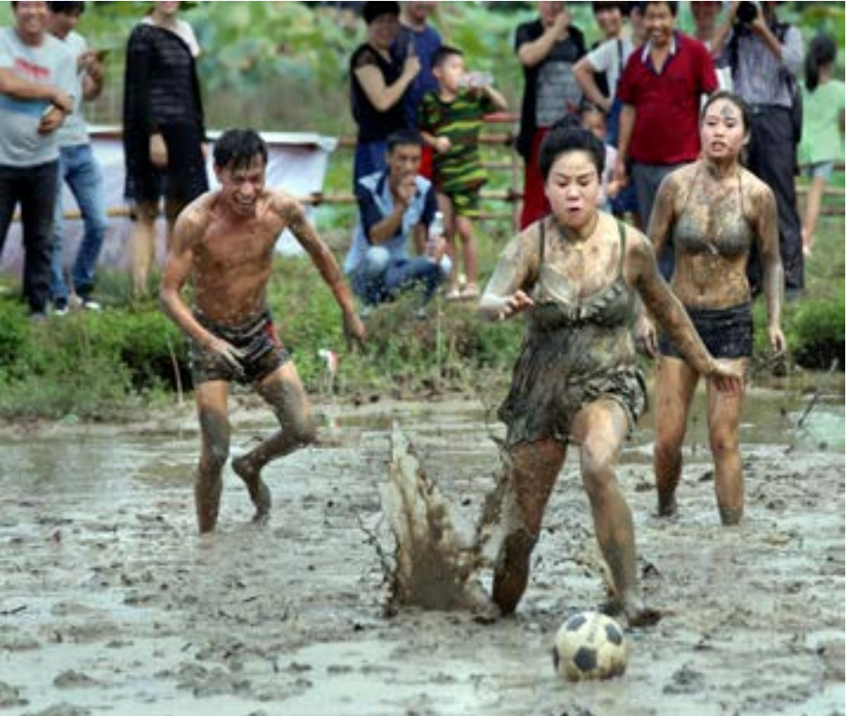
People fight for the ball as they take part in a mud football match during a festival for celebrating harvest in a village in Jinhua, Zhejiang Province, China September 24, 2017. Picture take September 24, 2017.