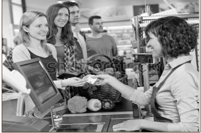
Study: a large percentage of grocery purchases wind up in landfills.