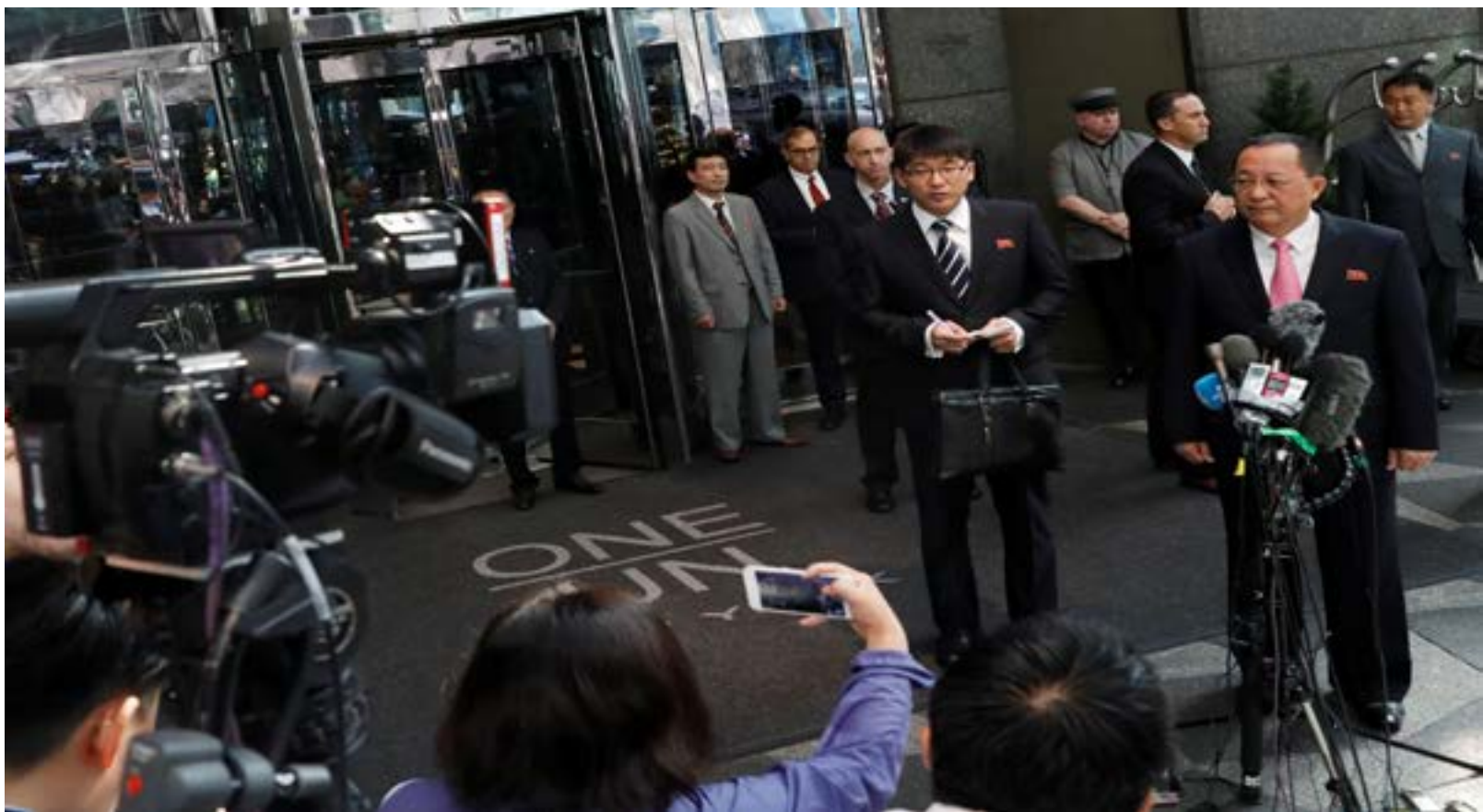
North Korean Foreign Minister Ri Yong-ho speaks to the media outside the Millennium hotel New York

North Korea says U.S. 'declared war' warns it could shoot down U.S. bombers