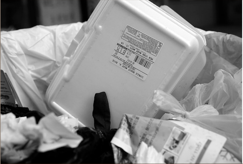
Almost 160 billion pounds of discarded food ends up in U.S. landfills annually.

guidance in that report. Consumers are confused by what is fresh food and what is bad food, and they conflate different supermarket labels. Phrases like “sell by,” “use by,” and “best before” are poorly regulated and often misinterpreted, the report found: “It is time for a well-intended but wildly ineffective food date labeling system to get a makeover.” There’s a massive hole in America’s food chain: As much as 40% of food goes uneaten in the U.S., according to government data. Americans throw away $165 billion in wasted food every year, the Harvard University and NRDC study concluded. In fact, one study estimates, just 15% of all this uneaten food would be enough to feed more than 25 million Americans every year. Some 160 billion pounds of discarded food also clogs up landfills, according to the Harvard Law School and NRDC study. (The United Nations estimates that one-third of global food production is either wasted or goes uneaten.) The existing “Sell by” dates are actually for stores to know how much shelf life products have. They are not meant to indicate the food is bad. “Best before” and “use by” dates are for consumers, but they are manufacturers’ estimates as to when food reaches its peak. Manufacturers mostly decide the shelf life for their own prod-