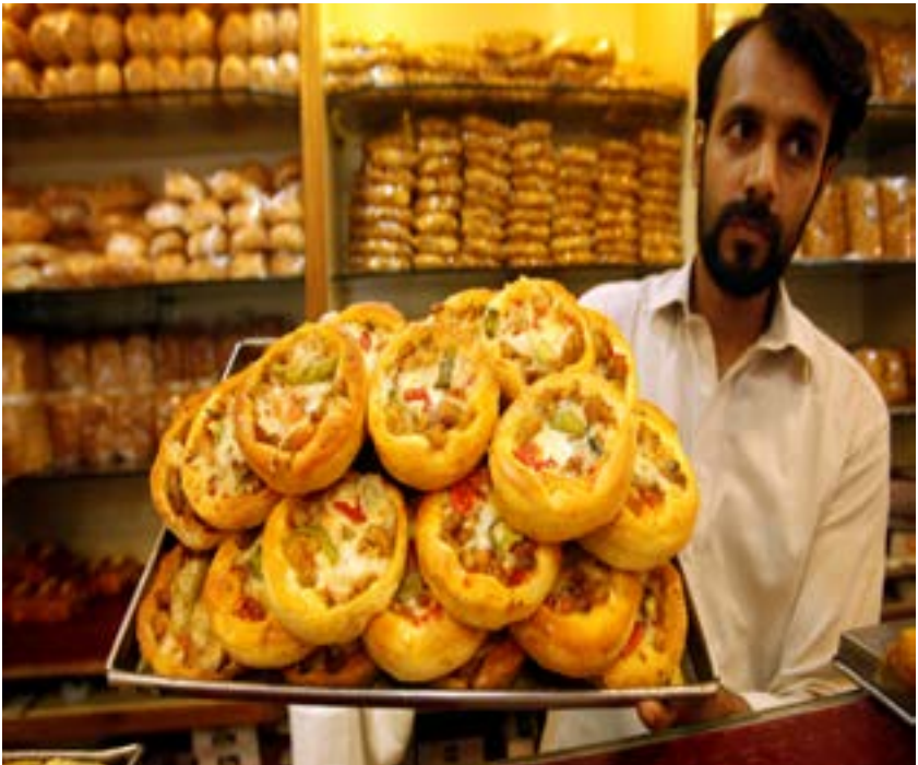
A worker poses with locally made pizzas at a bakery in Peshawar