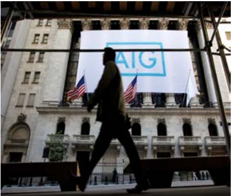
A banner for American International Group Inc hangs on the facade of the New York Stock Exchange