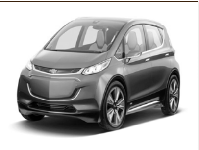
The Chevy Bolt

The Chevy Bolt technically debuted at the very end of last year, but I’m counting it anyway. It boasts a range of 238 miles and a base price of $36,620, which makes it squarely competitive with the Model 3. It got five stars from Car & Driver and won Motor Trend’s 2017 Car of the Year — by all accounts it’s a fantastic car — but it’s received oddly little hype relative to Tesla, and sales have been disappointing.