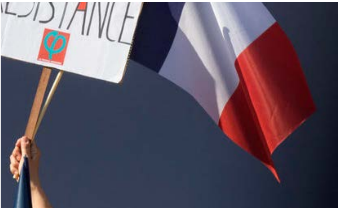
A protestor holds a French flag and a banner of the "France Insoumise" (France Unbowed) party during a demonstration in Paris