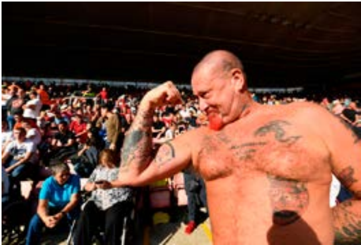
Southampton vs Manchester United - St Mary's Stadium, Southampton, Britain - September 23, 2017 A Manchester United fan displays his tattoos