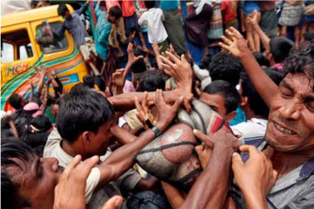
Rohingya refugees scuffle as aid is distributed in Cox's Bazar, Bangladesh, September 23,