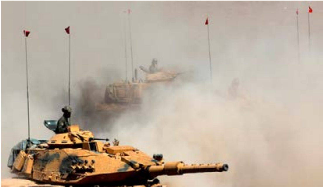
Turkish tanks maneuver during a military exercise near the Turkish-Iraqi border in Silopi