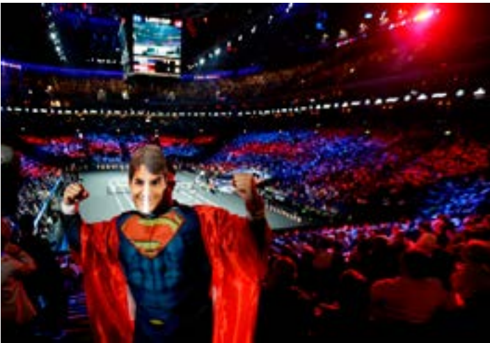
Tennis - Laver Cup - 2nd Day - Prague, Czech Republic - September 23, 2017 - A fan wearing a mask depicting Roger Federer cheers during the match.