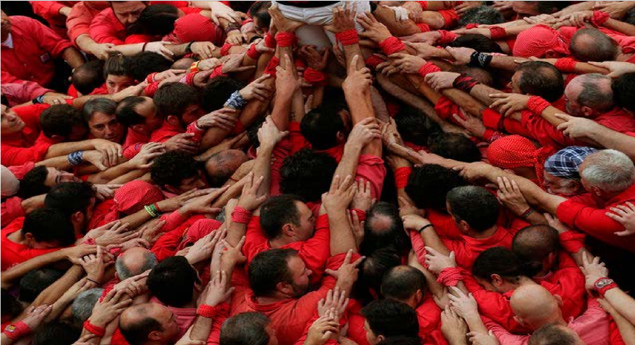
Castellers de Barcelona" form a human tower or "castell" during the festival of the patron saint of Barcelona "The Virgin of Mercy" at Sant Jaume square in Barcelona, Spain, September 23, 2017