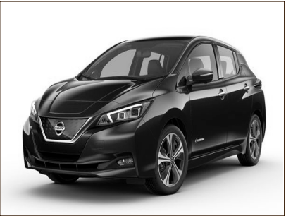
2018 Nissan Leaf

The 2010 Nissan Leaf is the world’s best-selling EV, but it has gotten long in the tooth. The 2018 Nissan Leaf is an upgrade, with 150-mile range and a $29,990 base price. The company plans to introduce a higher-powered version next year.