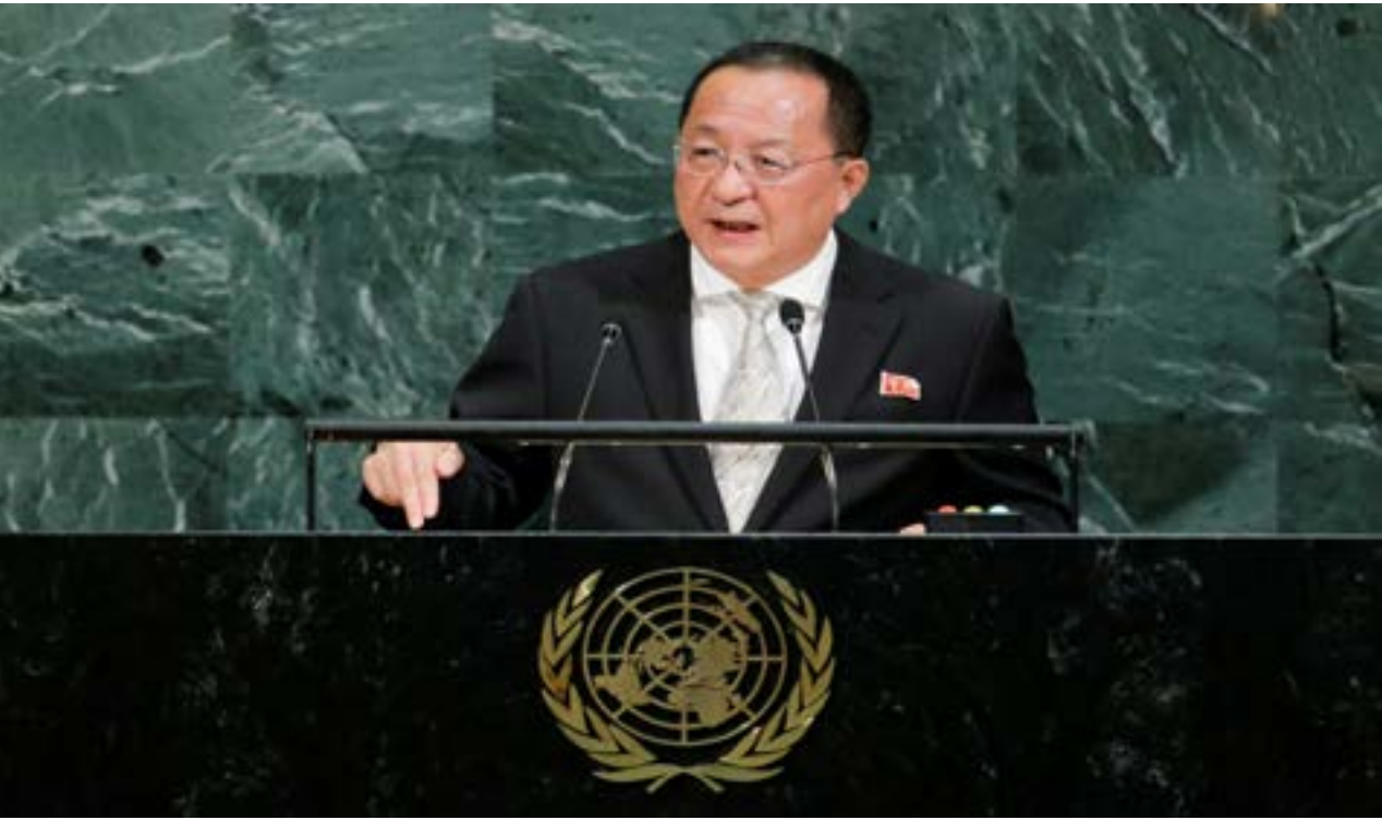
North Korean Foreign Minister Ri Yong-ho addresses the 72nd United Nations General Assembly at U.N. headquarters in New York, U.S., September 23, 2017.

UNITED NATIONS/WASHINGTON (Reuters) - North Korea said on Saturday firing its rockets at the U.S. mainland was "inevitable" after U.S. President Donald Trump called Pyongyang's leader "rocket man", in a further escalation of rhetoric between the two countries over the North's nuclear weapons and ballistic missile program. North Korean Foreign Minister Ri Yong Ho's remarks before the United Nations General Assembly came hours after U.S. Air Force B-1B Lancer bombers escorted by fighter jets flew in international airspace over waters east of North Korea in a show of force the Pentagon said demonstrated the range of military options available to Trump. Ri's speech capped a week of escalating rhetoric between Washington and Pyongyang, with Trump and Kim Jong Un trading insults. Trump called the North Korean leader a "madman" person, The patrols came after officials and experts said a small earthquake near North Korea's nuclear test site on Saturday