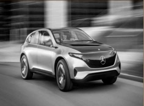
Daimler’s (owner of Mercedes-Benz) electric car subbrand will be called EQ.

In most big markets outside the US, EVs are the hot thing, so lots of major automakers have announced plans to start shifting in the direction of electrification, through either conventional gas-electric hybrids (HEVs), plug-in gas-electric hybrids (PHEVs), or pure battery electric vehicles (BEVs). Some pledges are more ambitious than others. And all must be taken with a grain of salt, given that many automakers are not hitting their current EV targets. Here are a few, in chronological order. Last year, Volkswagen announced that it would attempt to bring 30 or more BEVs to market by 2025, with a target of 2 million to 3 million sold by that year, roughly 25 percent of its total sales. This year, the company upped the ante again, vowing to create electric versions of all 300 of its models. (After its diesel scandal debacle, Volkswagen is all in on electrics.) In March, Daimler (owner of Mercedes-Benz) announced it was acceler-