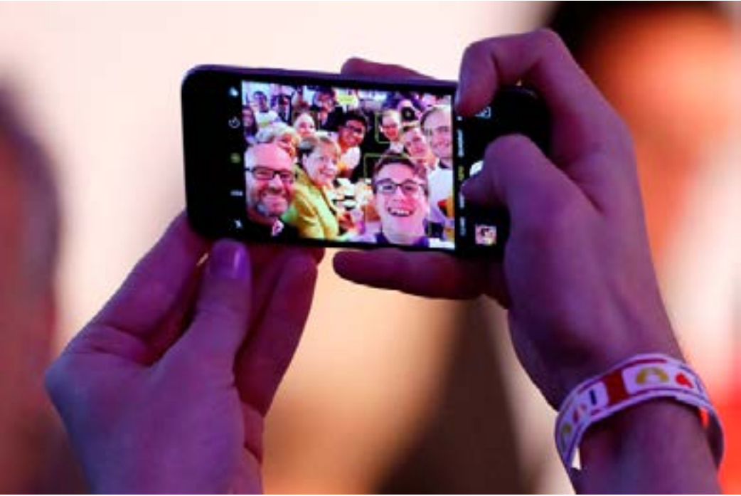
German Chancellor Angela Merkel is pictured on a mobile phone as she attends a breakfast with supporters at the CDU party election campaign meeting centre in Berlin