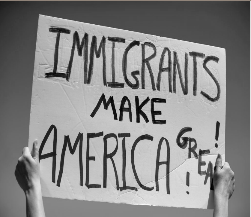
A demonstration poster in favor of the California Values Act.