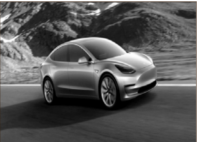
The Tesla Model 3

($45,200 base price). Full reviews haven’t come in yet, but early encounters are described in rapturous terms.