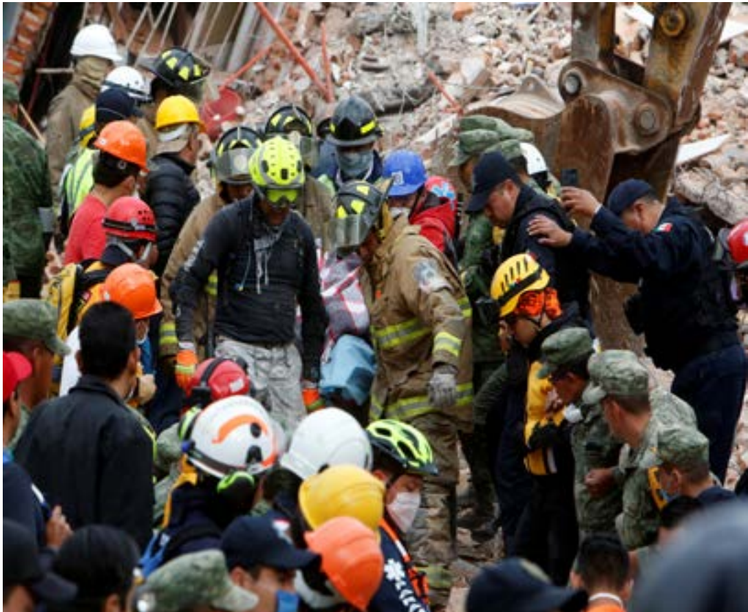
Rescue team members remove a body from the rubble of a collapsed building after an earthquake hit Mexico City

Television network Televisa broadcast the nailbiting rescue attempt live after crews at the school in the south of the city reported finding the girl, seeing her move her hand and threading a hose through debris to get her water 24 hours after the quake. It was part of a search for dozens of victims feared buried beneath the Enrique Rebsamen school, where local officials reported 21 children and 4 adults dead after Tuesday's quake. The school was one of hundreds of buildings destroyed by the country's deadliest earthquake in a generation. The magnitude 7.1 quake, which killed at least 93 people in the capital alone, struck 32 years to the day after a 1985 earthquake that killed thousands. Mexico is also still reeling from a