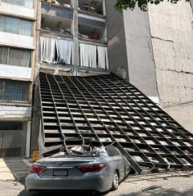
Damages are seen after an earthquake hit in Mexico City, Mexico September 19, 2017.