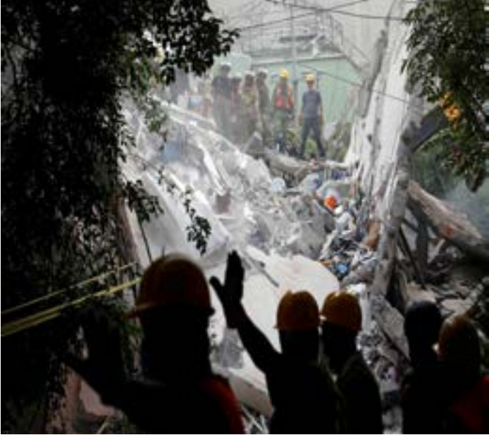
Soldiers and rescue workers search in the rubble of a collapsed building after an earthquake in Mexico City