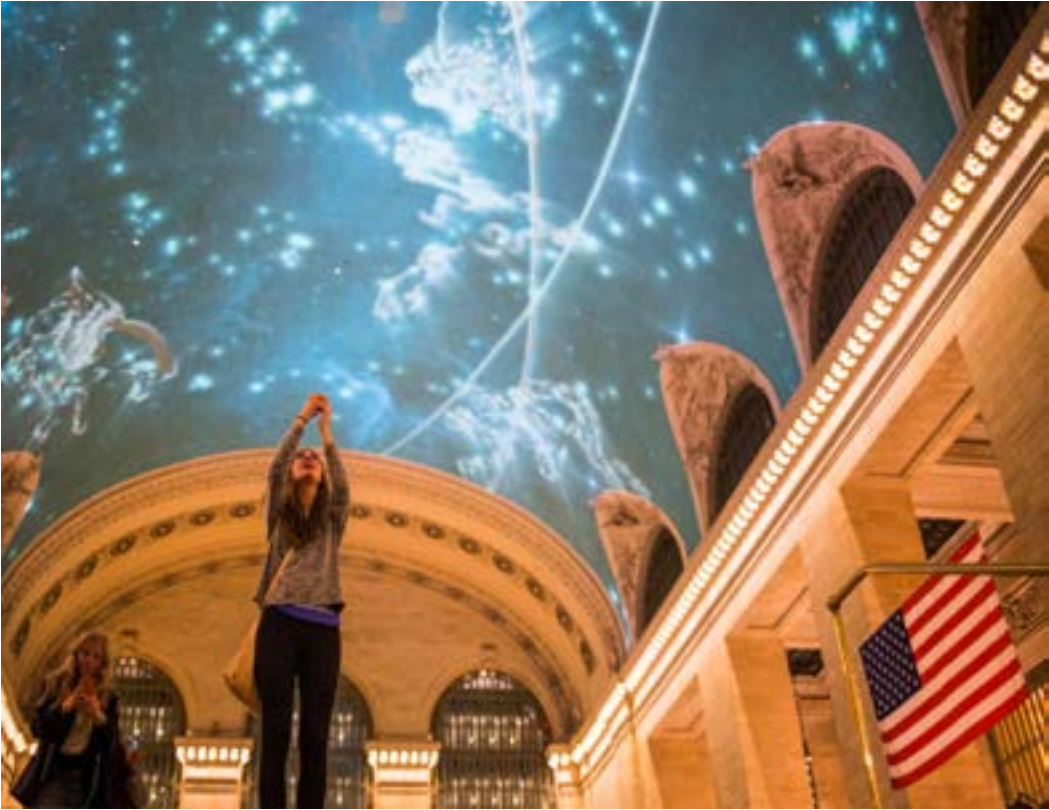
A woman takes photographs of a light show on the ceiling of Grand Central Terminal which organizers said was honoring the work of female scientists and engineers in Manhattan, New York, U.S.