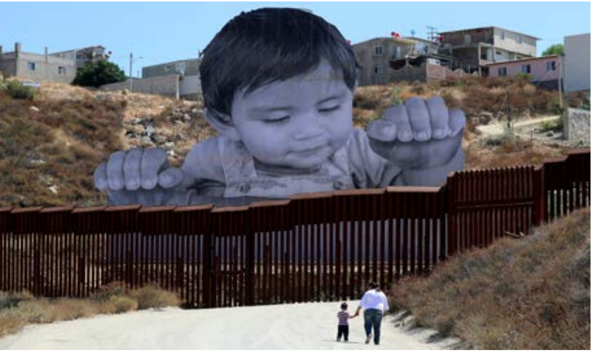
A small boy walks with his mother in front of French artist JR's image of an inquisitive baby looking into the United States over the U.S.- Mexico border wall towards Tecate, California