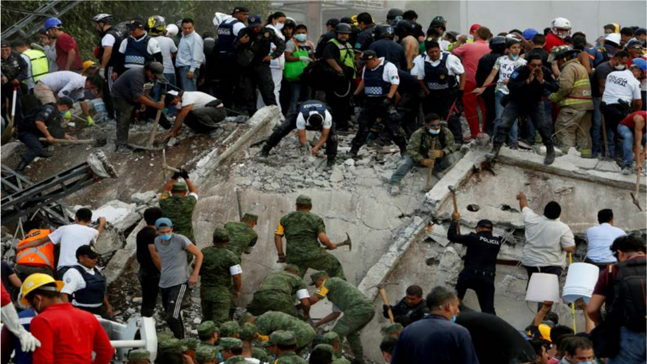
Soldiers, rescuers and people work at a collapsed building after an earthquake in Mexico City, Mexico