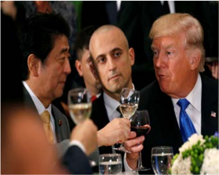
U.S. President Trump and Japanese Prime Minister Abe attend a luncheon hosted by the Secretary General of the United Nations