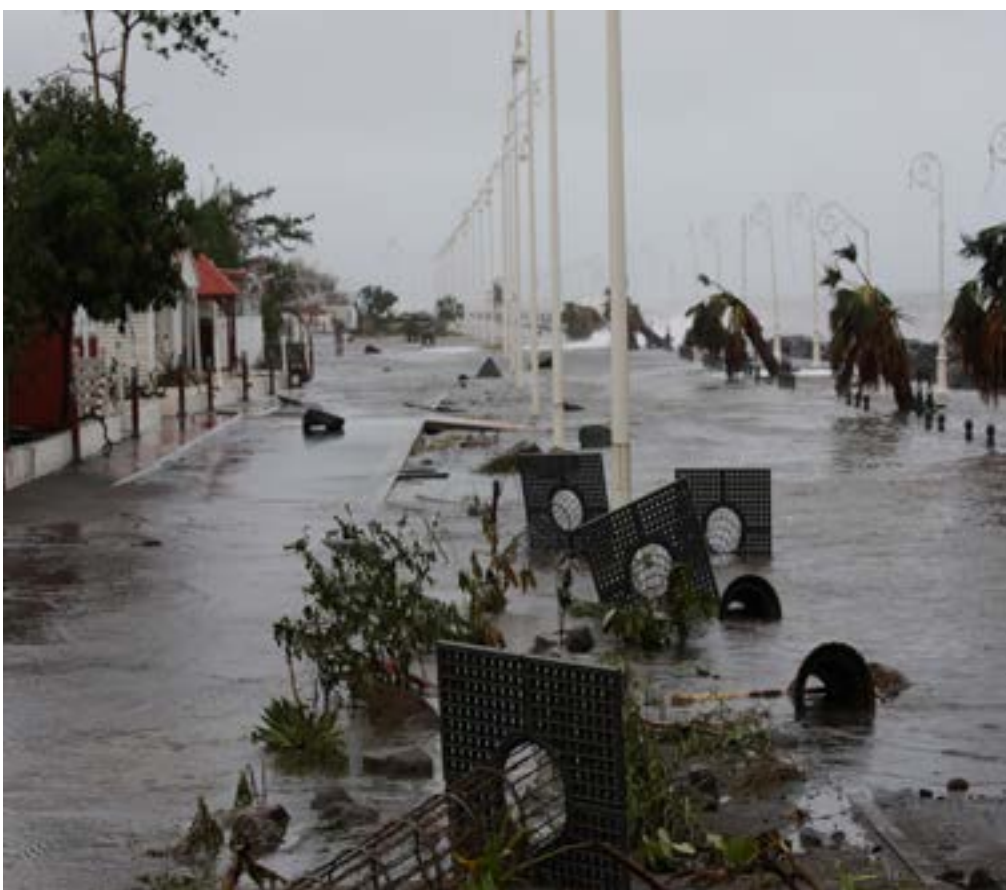
Debris lies on a flooded seafront after the passage of Hurricane Maria

Hurricane Maria rampaged across Puerto Rico on Wednesday as the strongest storm to hit the U.S. territory in nearly 90 years, causing major flooding, damaging homes and knocking out power to the whole island after killing at least nine people in the Caribbean. Maria, the second major hurricane to roar through the Caribbean this month, was carrying winds of up to 155 miles per hour (250 kph), when it made landfall near Yabucoa, on the southeast of the island of 3.4 million people. It ripped the roofs off buildings and turned low-lying streets into rushing rivers of debris knocked down by winds. Houston: On Thursday, September 21, Jan