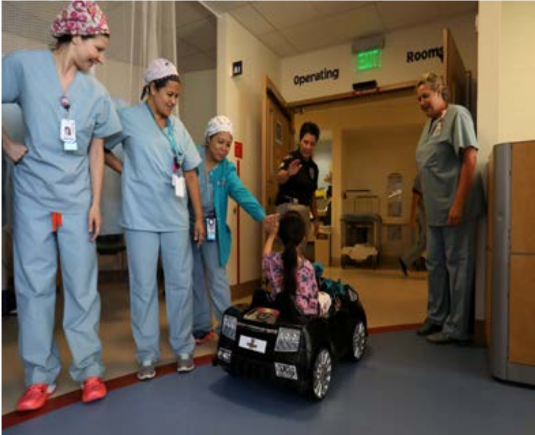
Rady Children's Hospital unveils remote control cars that will transport young patients to the operating room in San Diego