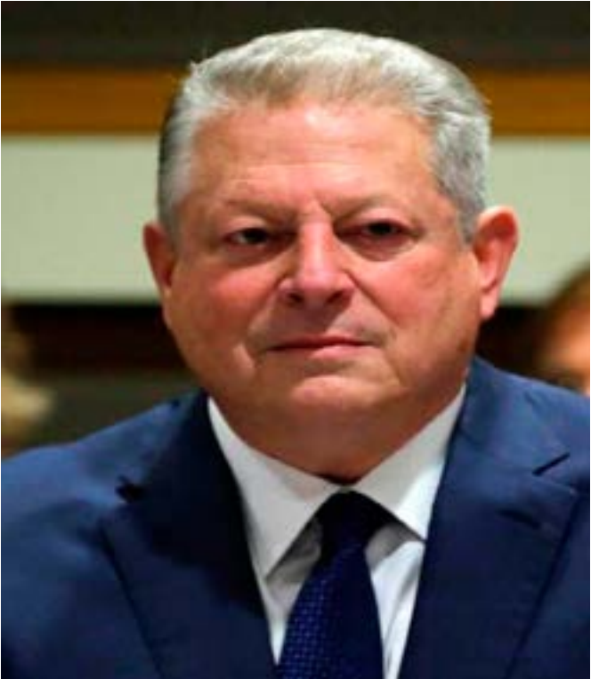
Former U.S. Vice-President Gore attends the High-Level Stakeholders Meeting on Climate Change at U.N. headquarters in New York