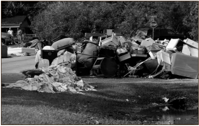
Flood-damaged contents from people's homes line the street following the aftermath of tropical storm Harvey in Wharton, Texas, a small town close to Houston, September 6, 2017.

HOUSTON (Reuters) - Disposing of the mounds of debris lining Houston streets three weeks after Hurricane Harvey flooding damaged about 126,000 homes is riling residents and officials in the nation's fourth largest city. The sheer volume of work is overwhelming initial efforts, say residents, resulting in pleas from officials for the state and private contractors to contribute vehicles. Houston also is offering to increase its fees for emergency trash removal to bring in more waste disposal trucks. "We have been asking for more trucks for weeks," said Greg Travis, a Houston city councilor whose hard-hit west Houston district had just two trucks operating one day this week. There is no schedule of collections nor estimate when one would be available, he said. Houston's trash haulers are working side-by-side with a disaster contractor's crews from San Antonio and Austin, Texas. The city's size, about 627 square miles (1623.92 square kilometers), is larger than Los Angeles or New York. Across Texas, the debris left behind by the storm could reach 200 million cubic yards - enough to fill up a football stadium almost 125 times, Texas Governor Greg Abbott estimated on Thursday. Harvey's path up the Texas coast killed as many as 82 people, flooding homes and businesses with up to 51 inches of rain. "We have no idea when it's going to be picked up," said Houston resident David Greely, 51. "It's overwhelming." DRC Emergency Services LLC, the city's