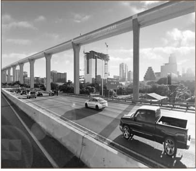
Hyperloop Texas Was A Finalist Chosen In The Hyperloop One Global Project.

AUSTIN - Texas is another step closer to having a transportation option that would sharply slice the travel time between the largest cities in the Lone Star State. Out of hundreds of applicants across the world, the Texas Triangle, created by Hyperloop Texas, was one of 10 routes chosen to be a part of the Hyperloop One Global project. It would connect Dallas, Austin, San Antonio and Houston with a Hyperloop freight route to Laredo.