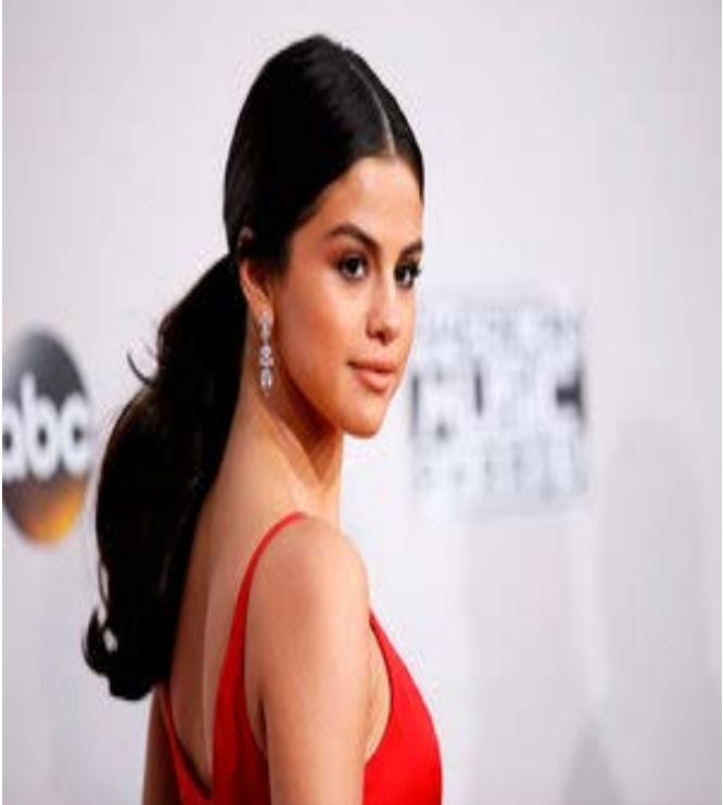
Selena Gomez's best friend gave her a kidney this summer