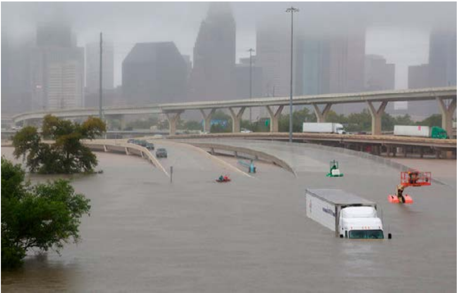
Submerged freeways from the effects of Hurricane Harvey are seen during widespread flooding in Houston

The Stonehenge HOA president said in a voicemail message to KHOU 11 that the association is working on finding a guard for the neighborhood as the cleanup continues.