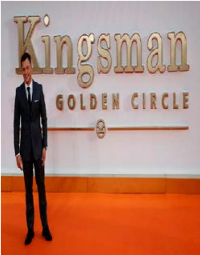
Cast member Taron Egerton arrives for the world premiere of 'Kingsman: The Golden Circle' in London