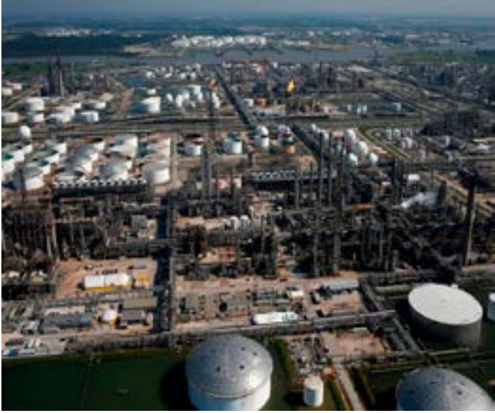
An aerial view of the Shell Deer Park Manufacturing Complex is seen in Deer Park, Texas, U.S. August 31, 2017.