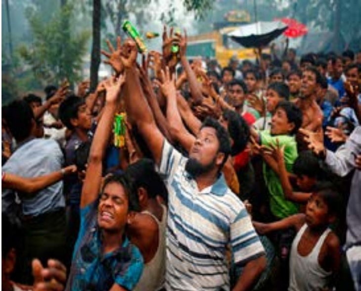
Rohingya refugees reach out their hands to grab aid packages in Cox's Bazar