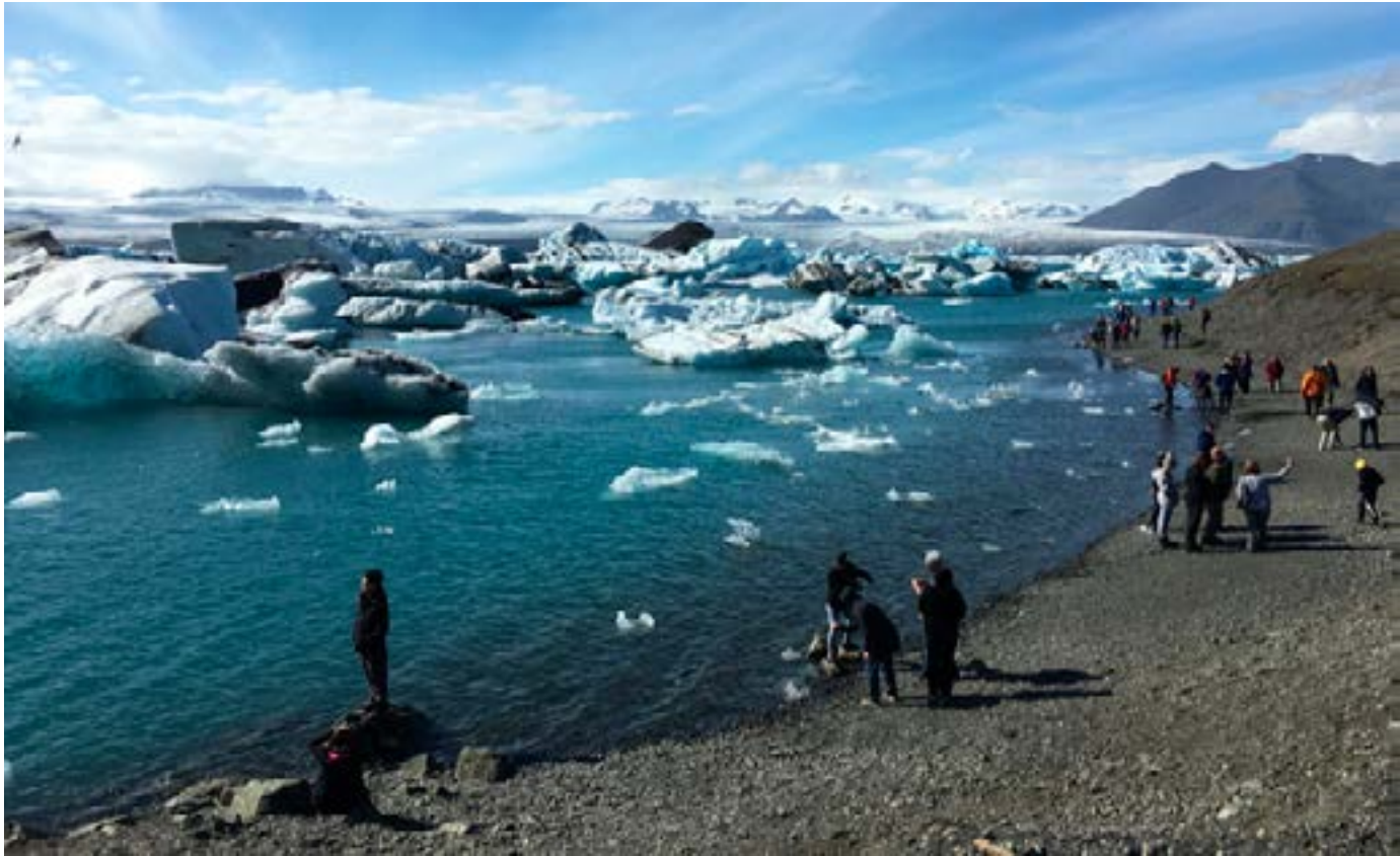
Tourists at the Jokulsarlon, a glacier lagoon in southern Iceland where ice bergs breaking off from the Breidamerkurjokull glacier have formed the country's deepest lake in the last 80 years, on Jul 4, 2017. \n