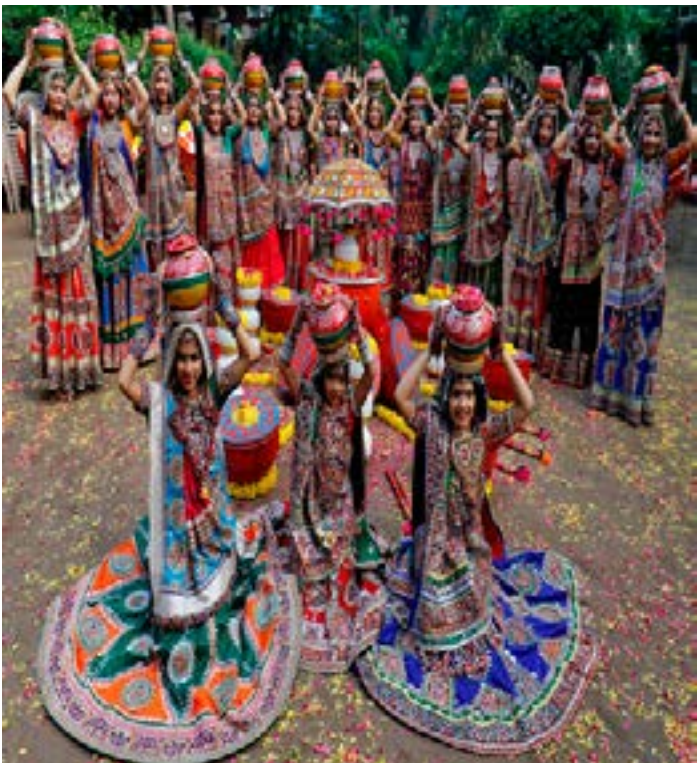
Performers dressed in traditional attire pose before performing Garba ahead of Navratri festival in Ahmedabad