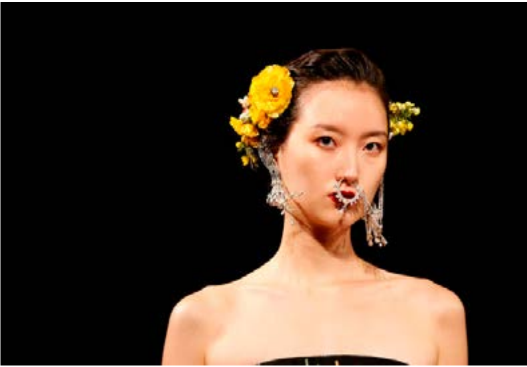
A model presents creations from designer Naeem Khan's Spring/Summer 2018 collection during New York Fashion Week in the Manhattan borough of New York City, U.S. September 12,