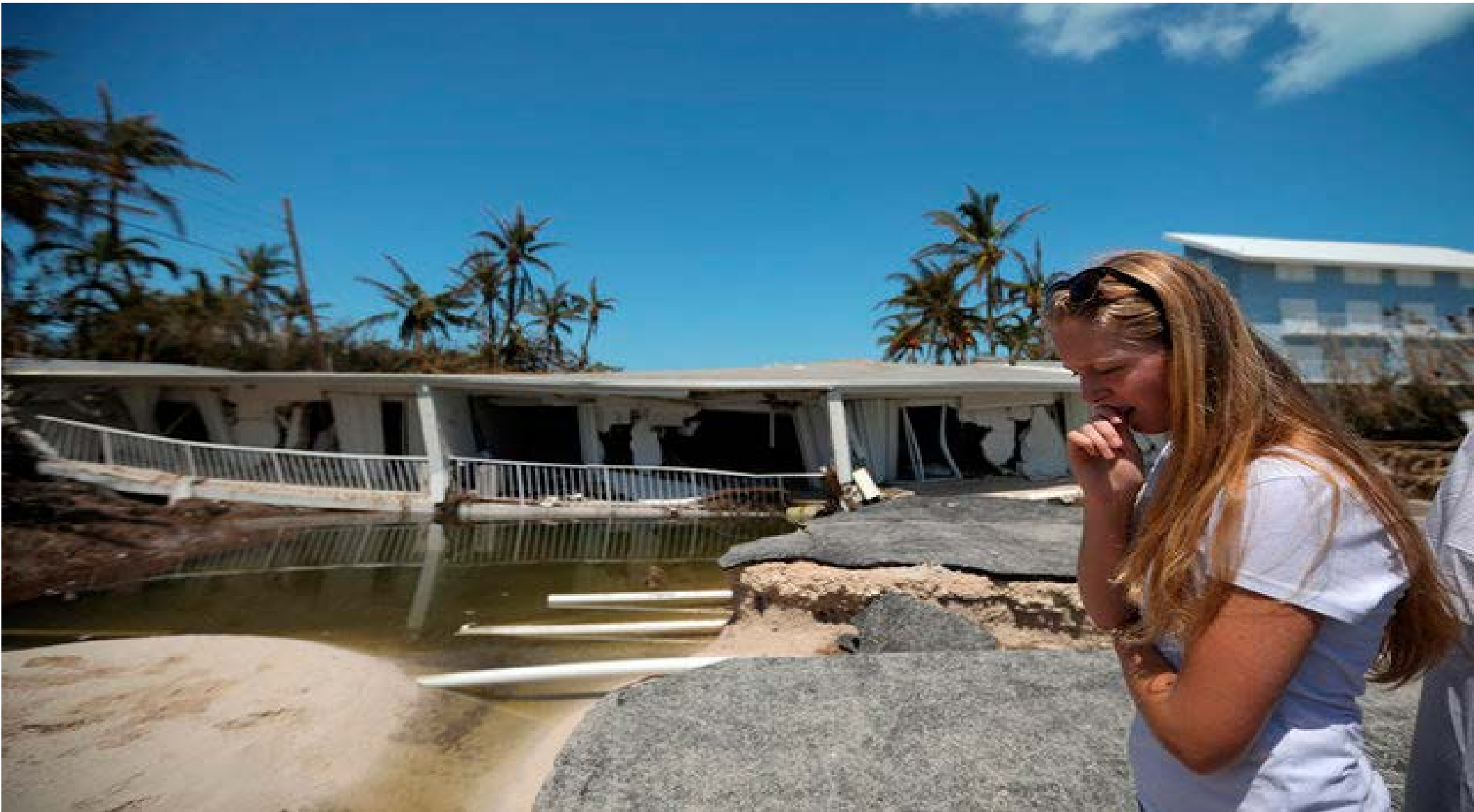
Es A local resident reacts as she sees the damage on her home after Hurricane Irma struck Florida, in Islamorada Key