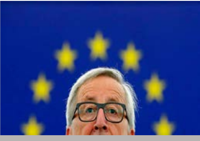
European Commission President Jean-Claude Juncker addresses the European Parliament during a debate on The State of the European Union in Strasbourg, France, September 13, 2017.