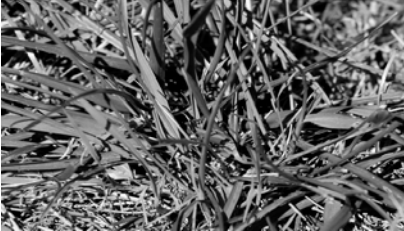
Texas Fescue Grass First Species Protected by Trump Administration. The coarse plant is often considered a grassy weed.

wether species for the survival of grasses in habitats at 6,000 feet or higher, also known as sky islands. “This grass used to be found in mountaintops throughout the sky islands region in south and west Texas and in northern Mexico, and is now reduced to one mountaintop,” he relates. “Now that it’s on the Endangered Species list, it can benefit from science based recovery actions.”