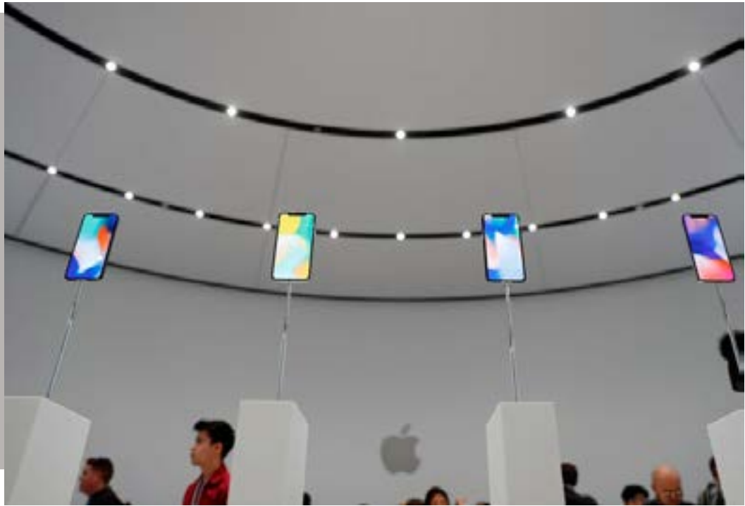
Apple iPhone X samples are displayed during a product launch event in Cupertino, California, U.S. September 12, 2017.