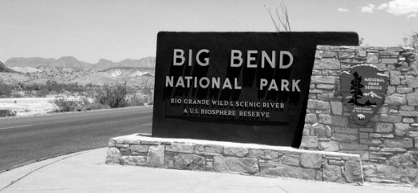
U.S. Fish and Wildlife Service has set aside 7,800 acres in Big Bend National Park to protect the Guadalupe fescue, a type of bunchgrass recently added to the endangered species list.

TERLINGUA, Texas – The federal government has added a species of bunchgrass found mostly in Texas to its list of endangered species. The U.S. Fish and Wildlife Service gave Guadalupe fescue protected status and set aside 7,800 acres of the fescue’s last U.S. location, in Big Bend National Park, as “critical habitat.” Michael Robinson, a conservation advocate at the Center for Biological Diversity, says it has taken four decades to gain protected status for the three-foot-tall species of bunchgrass that became rare because of climate change and overgrazing. “The primary reason is that it got to the brink of extinction is that it was very palatable for cattle, and everywhere where cattle were allowed, they ate it up,” he explains. “Big Bend National Park in the Chisos Mountains is the only place in the United States that we know it survived.” The decision to protect the species is the result of a 2011 settlement agreement with the Center. In it, the Wildlife Service agreed to extend protection to hundreds of vulnerable species. [View the official government document here: http://s3.amazonaws.com/public-inspection.federalregister.gov/2017-19001.pdf ] The fescue is the 185th species to be protected under the agreement and the first to be designated under the Endangered Species Act by the Trump administration. Robinson says the Guadalupe fescue is a bell-