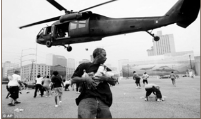
Storm victims gather food and water dropped from military helicopters.

Speaking to the Houston Chronicle, he added: ‘Dr. Martin Luther King said ‘I have a dream. “Thanks to the American people’s help, I have realized some small dreams.