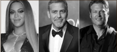
Highlighting the “Hand In Hand” telethon (l-r) were Beyonce, George Clooney and Blake Shelton.

An A-list of celebrities came out in droves on Monday night to take part in the “Hand in Hand” hurricane relief benefit, which raised more than $44 million for the victims of Hurricanes Harvey and Irma. During the telethon, Stephen Colbert announced that Apple was donating $5 million and Jimmy Fallon added that Albertsons Cos. and Merck each gave $1 million. NBA star Chris Paul also said that the NBA Players Association, which donated $500,000, would match any professional basketball player’s donation up to $20,000. “We come together today to love on people that have been devastated by the hurricanes,” Stevie Wonder, who sang “Lean on Me,” said at the start of the telethon. “When love goes into action, it preferences no color of skin, no ethnicity, no religious beliefs, no sexual preferences, and no political persuasions. It just loves.”