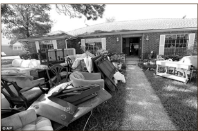
Thousands of Houston area residents have been impacted by Hurricane Harvey.

He has a personal worth of around $3billion, according to Forbes.