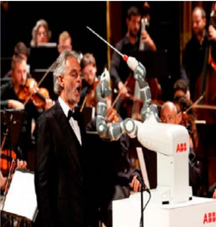
Humanoid robot YuMi conducts the Lucca Philharmonic Orchestra performing a concert alongside Italian tenor Andrea Bocelli at the Verdi Theatre in Pisa