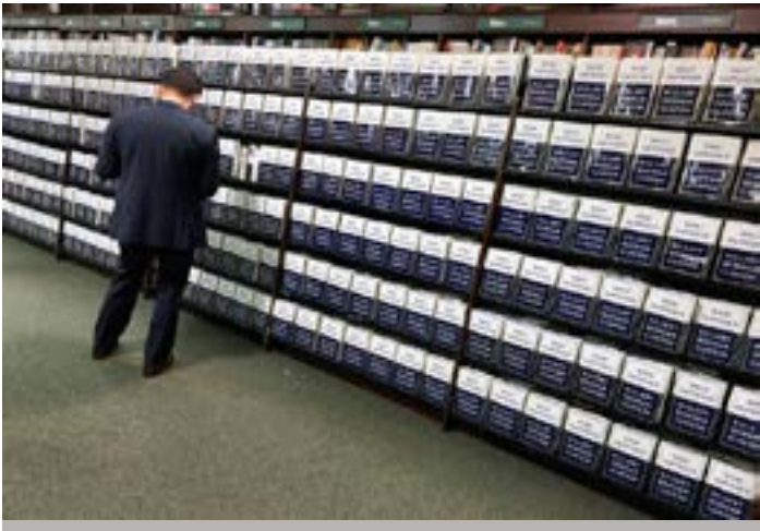
Copies of Hilary Clinton's new book "What Happened" line shelves before she arrives for a book signing in Barnes & Noble Union Square in Manhattan, New York