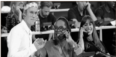
Justin Bieber and Oprah Winfrey were among the star-studded cast of volunteers for the telethon. Also answering phones during the telethon:

“This is what we can give people with our donations tonight. We can’t bring back what they lost, but we can help them know where to take the next step and provide some solid footing for them to place their next foot. A path to stability. To a place where they can rebuild,” Matthew McConaughey told viewers. “This is what they need and this is what we can give them.”