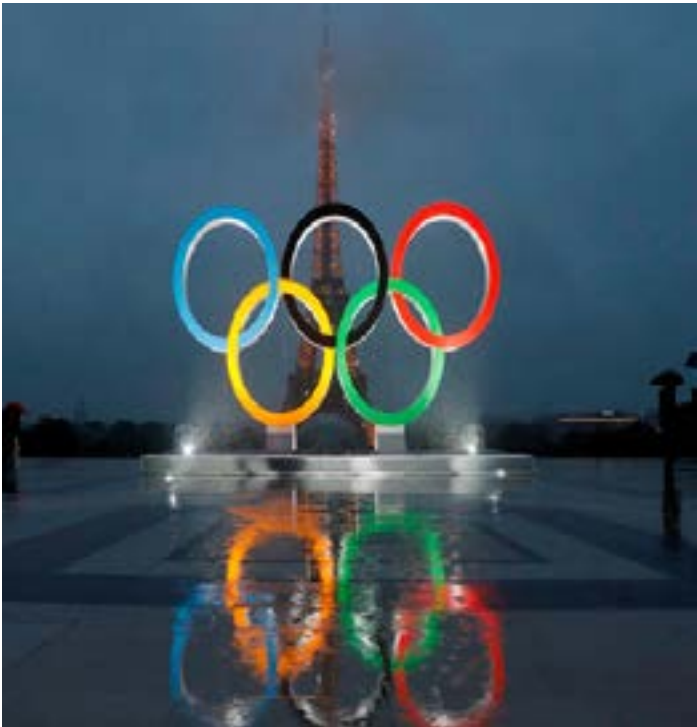
Olympic rings to celebrate the IOC official announcement that Paris won the 2024 Olympic bid are seen during a ceremony at the Trocadero square in Paris, France, September 13