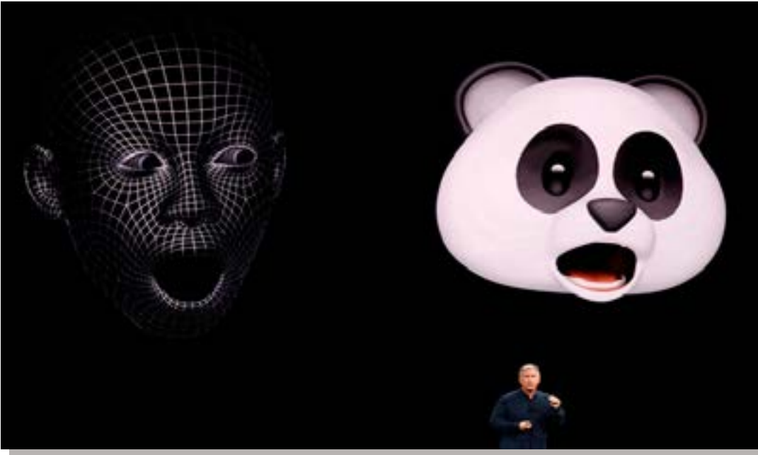
Apple Senior Vice President of Worldwide Marketing, Phil Schiller, shows Animoji during a launch event in Cupertino, California, U.S. September 12