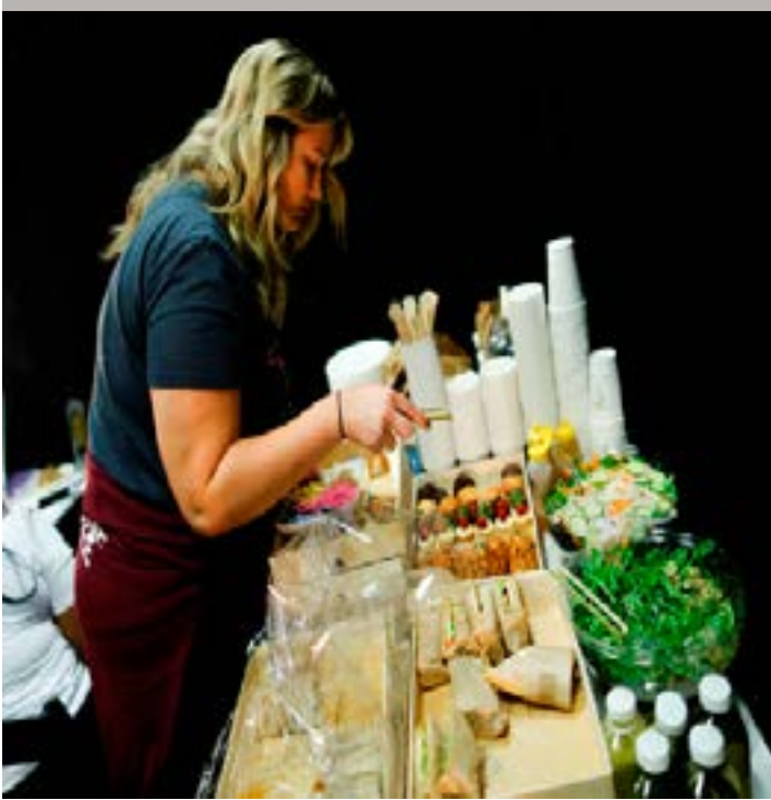
Models are seen at the backstage before the Torrid Spring 2018 collection show during New York Fashion Week in New York