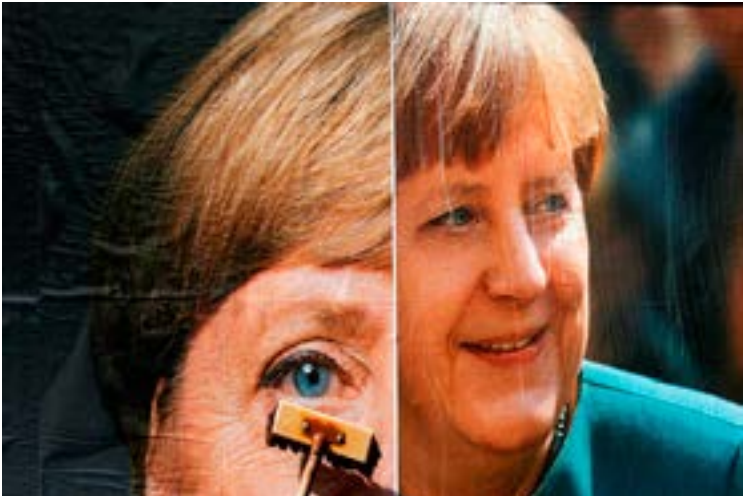
A worker pastes up an election campaign poster for the upcoming general elections of the CDU party with a headshot of German Chancellor Angela Merkel in Berlin