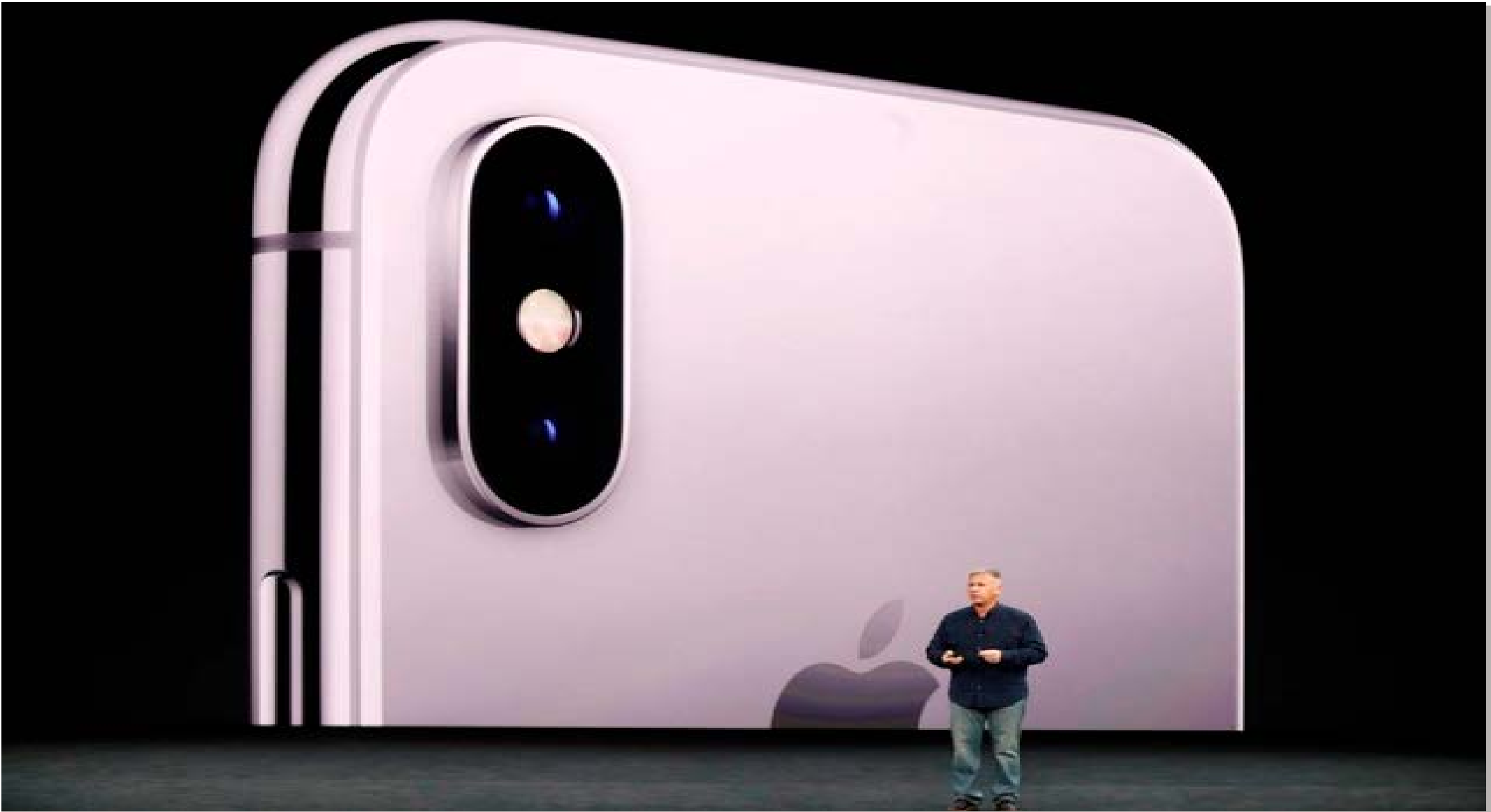
Apple Senior Vice President of Worldwide Marketing, Phil Schiller, introduces the iPhone X during a launch event in Cupertino, California, U.S. September 12, 2017the beach after Hurricane Irma passed the area in Ponte Vedra Beach