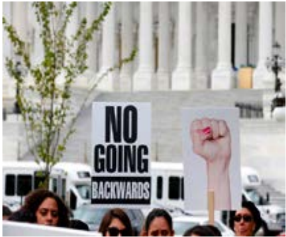
Immigiran activists and DACA recipients take part in a rally about the importance of passing a clean DREAM Act before delivering a million signatures to Congress on Capitol Hill in Washington, U.S., September 12, 2017.