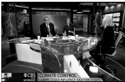
In an interview (above), Dr. Michio Kaku discusses the history of weather modification with CBS anchors Charlie Rose and Norah O'Donnell.