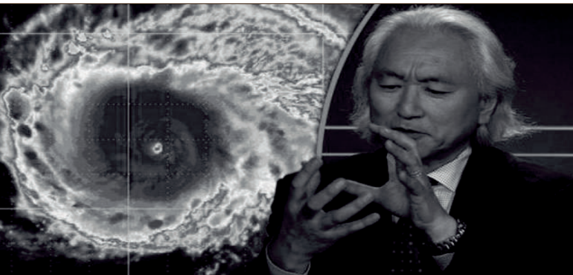
World renowned physicist Dr. Michio Kaku made a shocking confession on live TV when he admitted that HAARP is responsible for the recent incidents of hurricanes.

In an interview aired by CBS, Dr. Michio Kaku admitted that recent "man-made" hurricanes have been the result of a government weather modification program in which the skies were sprayed with nano particles and storms then "activated" through the use of "lasers". The High-Frequency Active Auroral Research Program (HAARP) was created in the early 1990's as part of an ionospheric research program jointly funded by the U.S. Air Force, the U.S. Navy, the University of Alaska Fairbanks, and the Defense Advanced Research Projects Agency (DARPA).