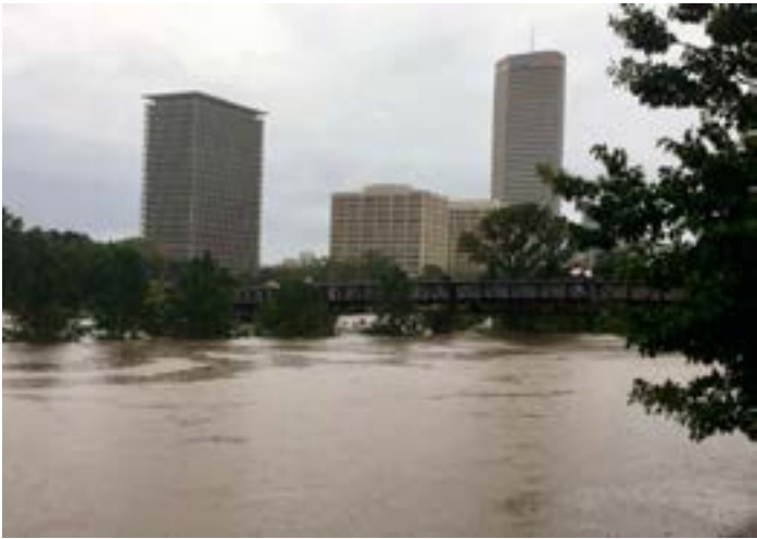
It's been about two weeks since Hurricane Harvey dumped more than 51 inches of water in some spots across Houston, and some areas still haven't fully recovered.