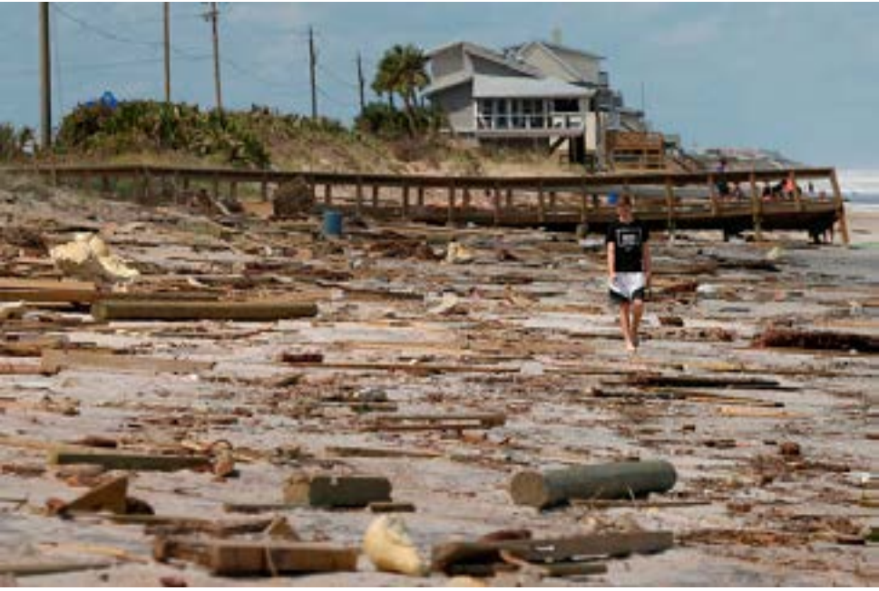
A boy walks amongst debris on the beach after Hurricane Irma passed the area in Ponte Vedra Beach