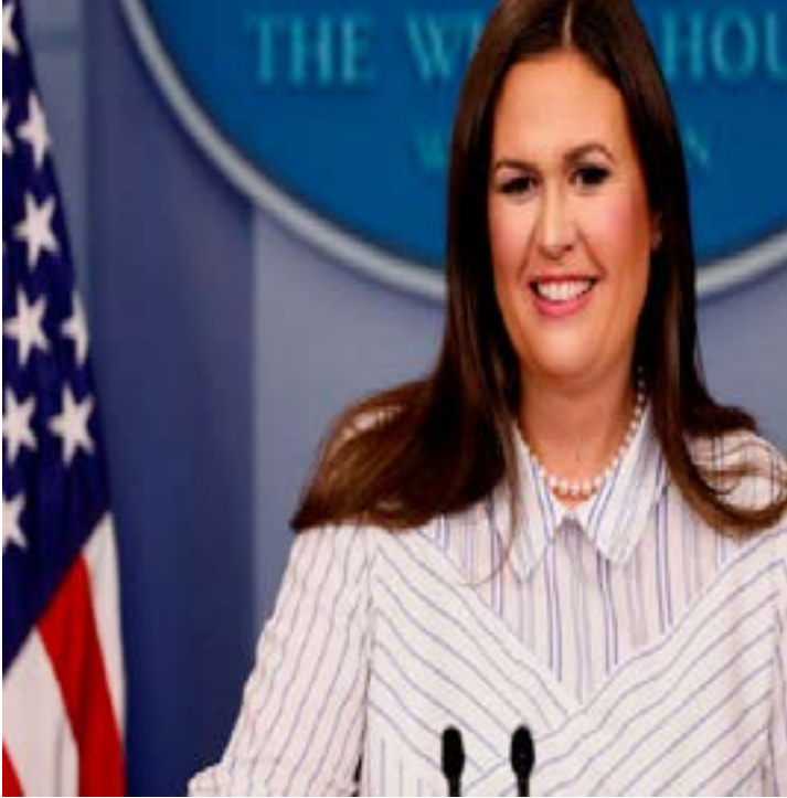
White House Press Secretary Sarah Huckabee Sanders holds the daily briefing at the White House in Washington, U.S. September 12, 2017.