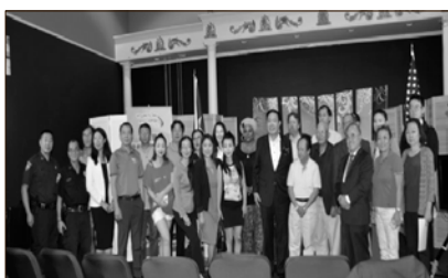
Members of the press and volunteers for the Harvey Relief efforts. Representatives of ethnic communities are actively involved in the effort.