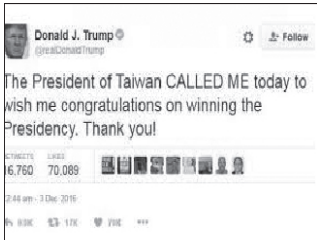
Tweet Message From Donald Trump

The senator, Chris Coons of Delaware, said it was "concerning" that Trump's way of governing might mirror the "shoot-from-the-hip style" in which he campaigned for the White House.