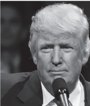
Taiwan President Tsai Ing-wen and President-elect Donald Trump spoke on the phone for 10 minutes on Friday.

China lodged a diplomatic protest Saturday against President-elect Donald Trump, after Trump spoke on the phone Friday with Taiwanese President Tsai Ing-wen.