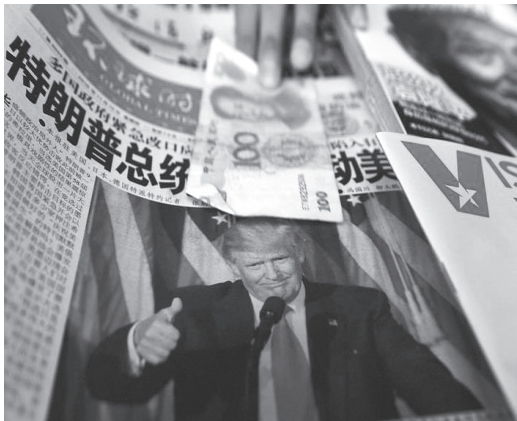
A news stand in Beijing: US president-elect Donald Trump has accused China of currency manipulation.