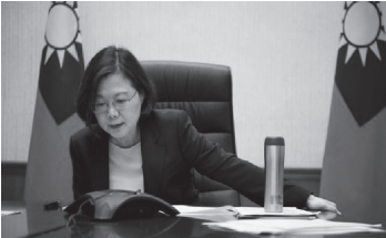
Taiwan President Tsai Ing-wen Calls U.S. President-elect Donald Trump

His transition team described the conversation in a statement as a discussion "of the close economic, political and security ties that exist between Taiwan and the United States", in which the president-elect also congratulated Tsai on her election earlier this year. The Taiwanese president characterized the phone call as an "intimate and relaxed conversation" that lasted 10 minutes.