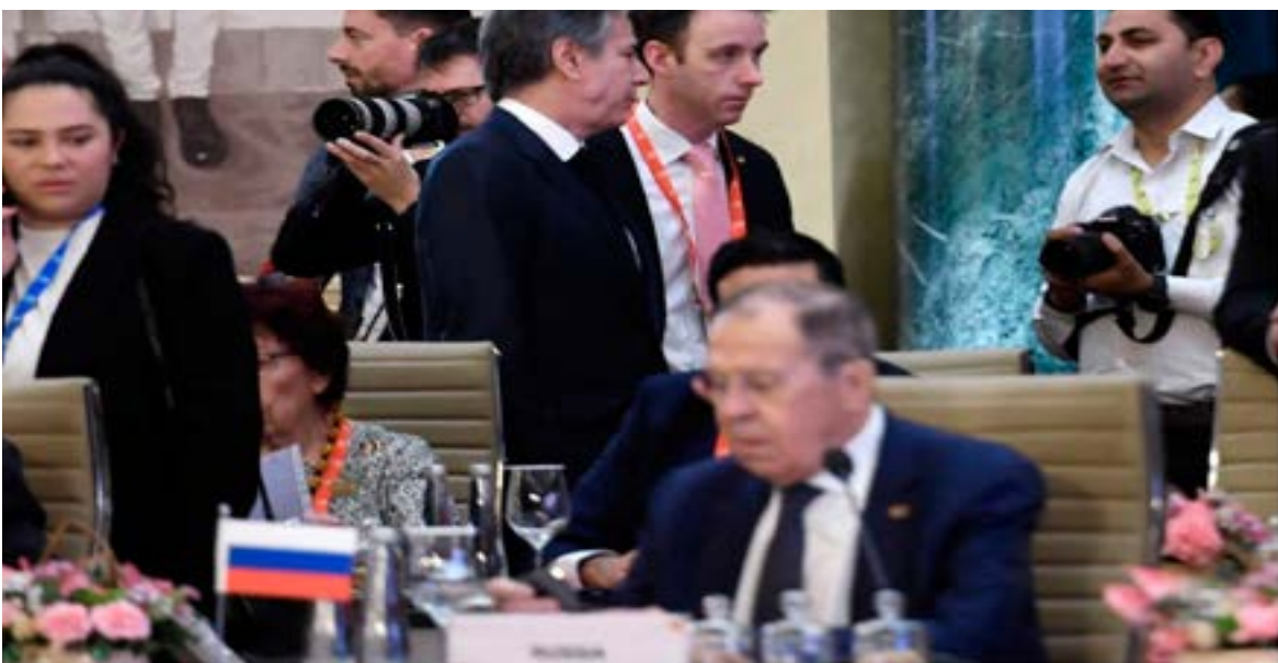
West - without providing evidence - of being directly involved French Foreign Minister Cath-

President Vladimir Putin last week announced Russia's decision to suspend participation in the latest START treaty, after accusing the