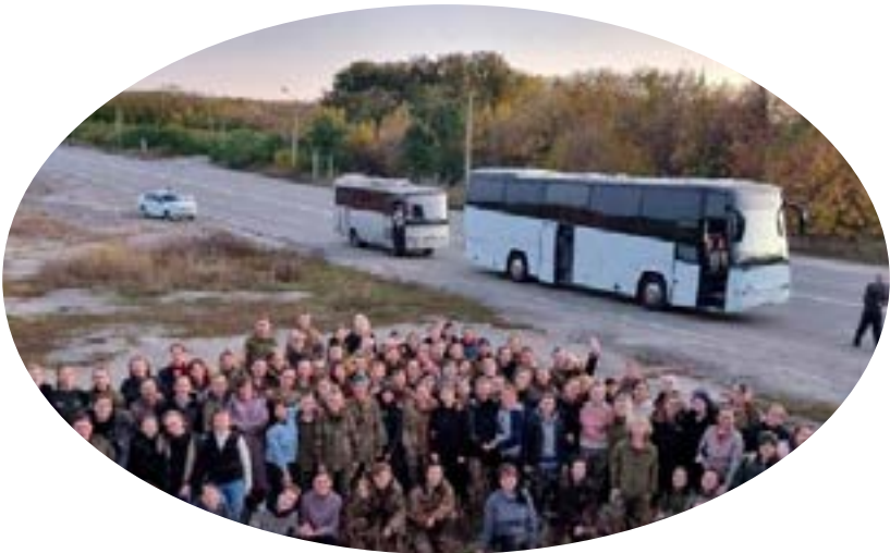
Ukrainian prisoners of war (POWs) pose for a picture after a swap, amid Russia's attack on Ukraine, in an unknown location, Ukraine.