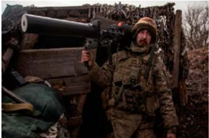
A Ukrainian service member holds an anti-drone rifle in a trench at a position outside the frontline town of Horlivka, amid Russia's attack on Ukraine, in Donetsk region, Ukraine March 1.