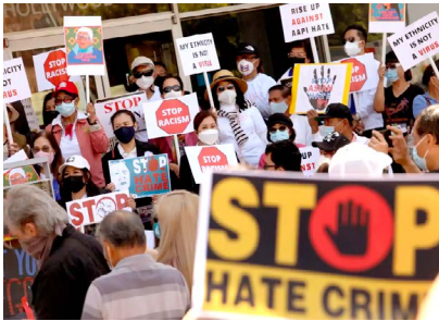
Members of the Thai-American community along with political leaders and members of law enforcement participate in a rally against Asian hate crimes in Thai Town in Los Angeles on 8 April 2021.