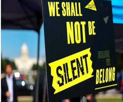
People gather at the Solidarity Against AAPI Hate rally on the National Mall in Washington DC on 31 May 2021.

ly invisible by our history books," said four NJ assembly sponsors of the bill in a joint statement. "This erasure ... not only prevents students from gaining a full understanding of our nation's history, but also opens the door for racial biases that can turn into violence and hatred."