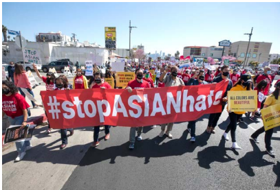
Hundreds March In Los Angeles To Protest Asian Hate And Violence Against Asians.

The initiative plans to support research to correct discriminatory practices against Asian Americans