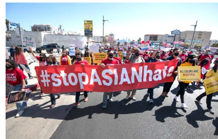
President Joe Biden Signs COVID-19 Hate Crimes Act Into Law to Fight Anti-Asian Hate. The law responds to the surge in hate crimes against Asian Americans.