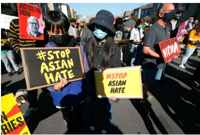
Protesters during the Asian Justice Rally in San Francisco, on 30 January.

As the fastest growing racial or ethnic group in the US, Asian Americans are finally in a position to do more than stock up on pepper spray and hope for the best.