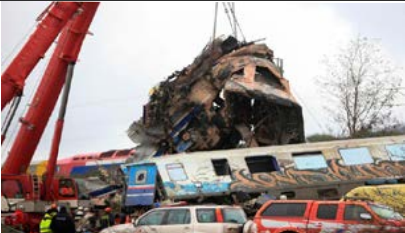
A crane lifts parts of a destroyed carriage as rescuers operate on the site of a crash, where two trains collided, near the city of Larissa, Greece, March 2.