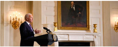
President Joe Biden delivers remarks on racial equity, in the State Dining Room of the White House, Jan. 26, 2021, in Washington, DC. | President Joe Biden delivers remarks on racial equity, in the State Dining Room of the White House, Jan. 26, 2021, in Washington, DC.

President Biden Makes Racial Justice A Top Priority With Four Executive Orders