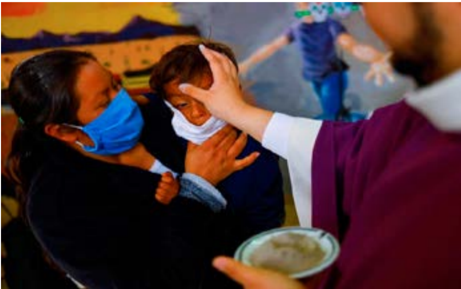
A priest makes a cross with ashes on a migrant’s head, seeking asylum in the United States, during the Ash Wednesday mass inside the Casa del Migrante shelter, in Ciudad Juarez, Mexico February 22.