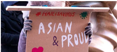
A woman holds a sign at a protest against anti-Asian discrimination.

Within these areas, TAAF seeks to build long-term solutions to defeat anti-Asian discrimination, invest in data-driven research to inform future policymaking, and create school curriculums that reflect the history of AAPI people in the US.