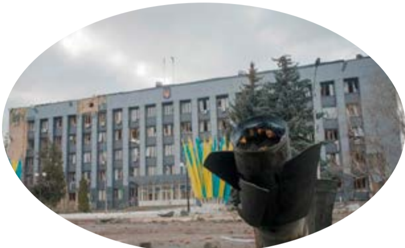
A part of a rocket is seen near a building damaged by a Russian military strike, amid Russia’s attack on Ukraine, in the front line city of Bakhmut, Ukraine February 21.