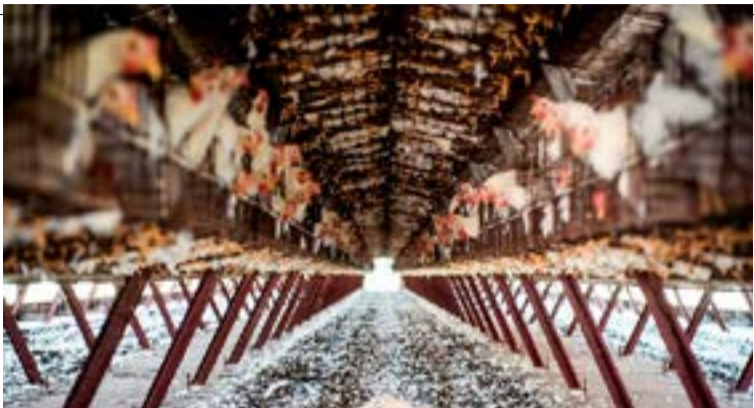
Chickens sit in cages at a farm, as Argentina’s government adopts new measures to prevent the spread of bird flu and limit potential damage to exports as cases rise in the region, in Buenos Aires, Argentina February 22.