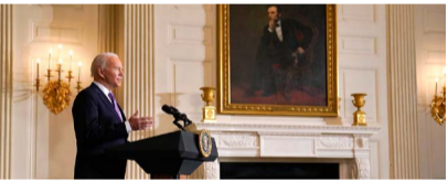
President Joe Biden delivers remarks on racial equity, in the State Dining Room of the White House, Jan. 26, 2021, in Washington, DC. | President Joe Biden delivers remarks on racial equity, in the State Dining Room of the White House, Jan. 26, 2021, in Washington, DC.

“It’s Time To Act Now.” President Biden Makes Racial Justice A Top Priority With Four Executive Orders