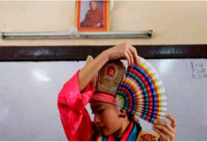
A Tibetan woman adjusts her traditional headgear as she stands near the portrait of spiritual leader Dalai Lama during a function organized to mark “Losar” or the Tibetan New Year in Kathmandu, Nepal February 23.