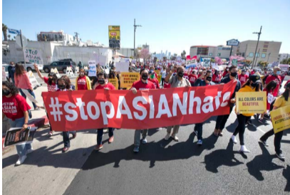
Hundreds March In Los Angeles To Protest Asian Hate And Violence Against Asians.

The initiative plans to support research to correct discriminatory practices against Asian Americans