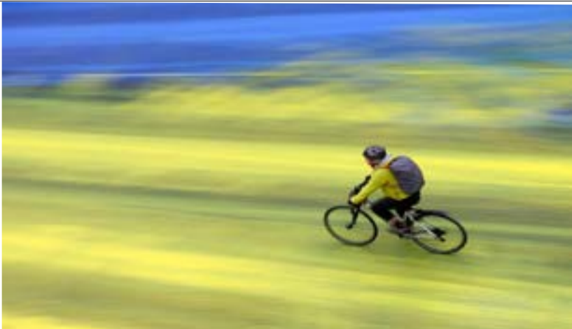
A cyclist rides on a painted road, after Protest group ‘Led by Donkeys’ spread paint in the colors of the Ukrainian flag on the road, ahead of the first anniversary of Russia’s invasion of Ukraine, outside the Russian Embassy in London, Britain February 23, 2023.