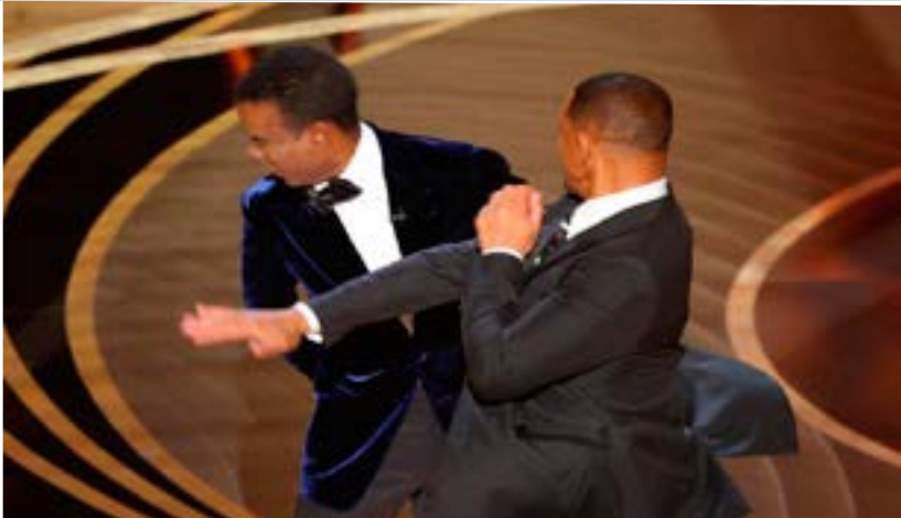
Will Smith hits at Chris Rock as Rock spoke on stage during the 94th Academy Awards in Hollywood, March 27.