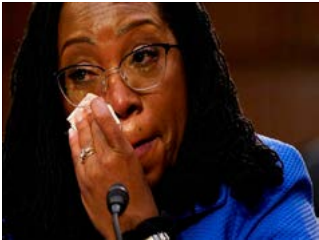
Judge Ketanji Brown Jackson wipes away tears as she listens to Senator Cory Booker (D-NJ) speak on the third day of her U.S. Senate Judiciary Committee confirmation hearings on her nomination to the Supreme Court, on Capitol Hill in Washington, March 23.