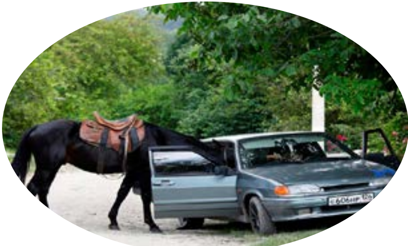
A horse puts its head into the car to eat a carrot near the Cossack cultural complex in the village of Borgustanskaya in Stavropol region, Russia.