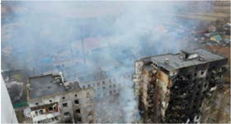
An aerial view shows a residential building destroyed by shelling, as Russia's invasion of Ukraine continues, in the settlement of Borodyanka in the Kyiv region, Ukraine, March 3.