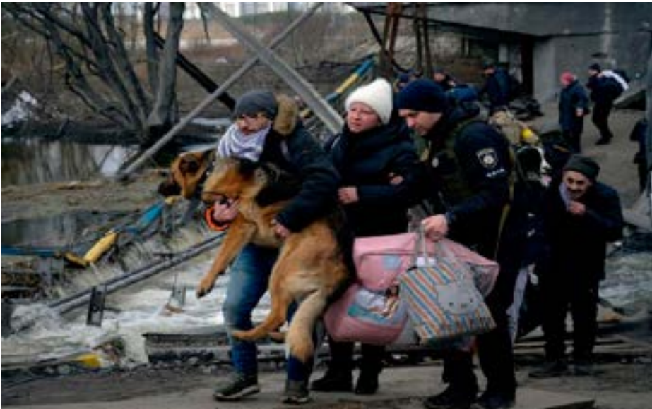
A man carries a dog as people flee, amid Russia's invasion of Ukraine, in Irpin, Ukraine, March 9.