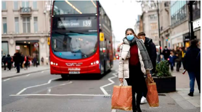
Shoppers walking along Oxford Street in London on Dec. 21, 2021.

Though BA.2 is rising in the U.S., leading public health officials are not expecting another dramatic surge in new cases, largely due to the level of immunity the population has from vaccination and the fierce outbreak during the winter omicron wave.