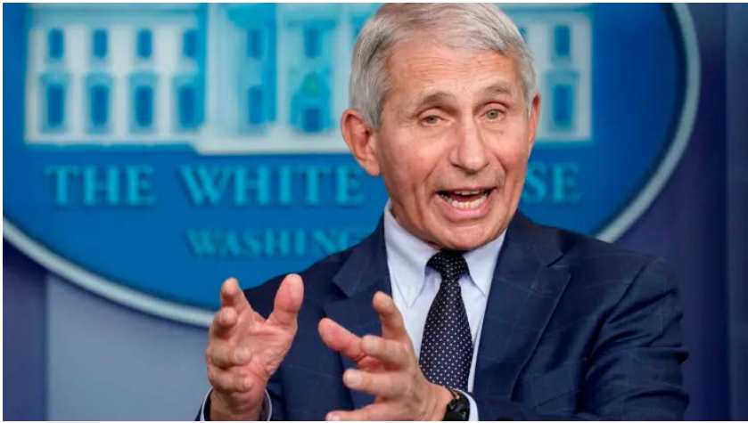
Dr. Anthony Fauci speaks about the Omicron coronavirus variant during a press briefing at the White House in Washington, December 1, 2021.