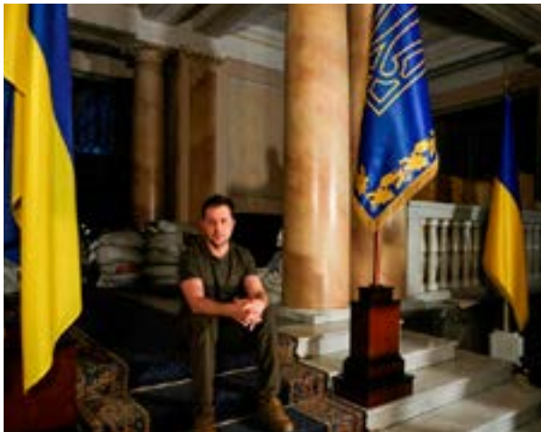
Ukrainian President Volodymyr Zelenskyy poses after an interview with Reuters in Kyiv, Ukraine, March 1.