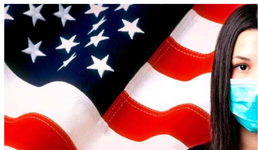
Attacks on East Asian people living in the US have shot up during the pandemic, revealing an uncomfortable truth about American identity.

More than 2,100 anti-Asian American hate incidents related to COVID-19 were reported across the country over a three-month time span between March and June, according to advocacy groups that compile the data. The incidents include physical attacks, verbal assaults, workplace discrimination and online harassment. The Asian Pacific Policy and Planning Council and Chinese for Affirmative Action launched a hate incident reporting website on March 19 when the coronavirus was becoming widespread across the U.S. and the media began reporting violent incidents targeting Asian-Americans. The online tool is available in multiple languages and allows users to report the information with the promise that personal information will be kept confidential. On Wednesday, the advocacy groups released an analysis of the incidents reported through June 18 in California, where about 40 percent of the 2,120 hate incidents took place. The groups released the national data to CBS News after an inquiry. Of the 832 incidents reported in California, many included anti-Asian slurs and references to China and the coronavirus. One assailant yelled about “bringing that Chinese virus over here” during an attack against an Asian-American man at a San Francisco hardware store on May 6.