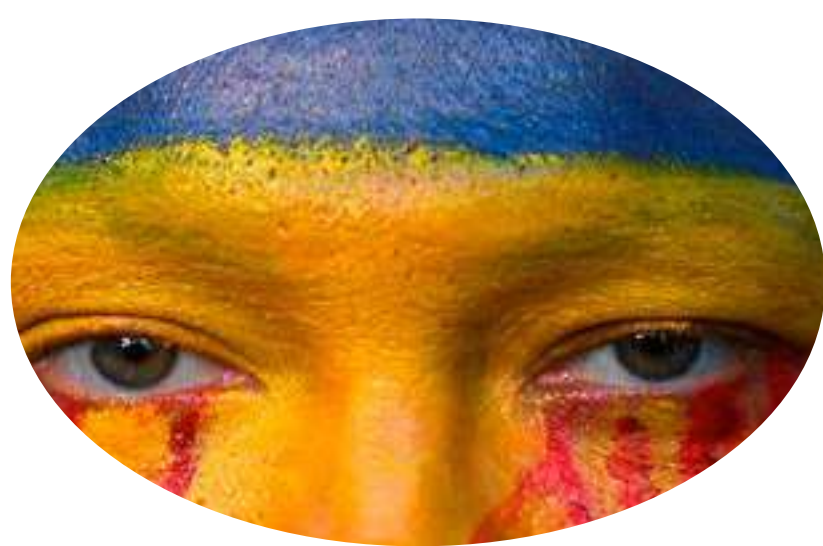
Lidiya Zhuravlyova, a Ukraine-born performance artist, looks on as she takes part in an anti-war protest, after Russia launched a massive military operation against Ukraine, in Bangkok, Thailand.