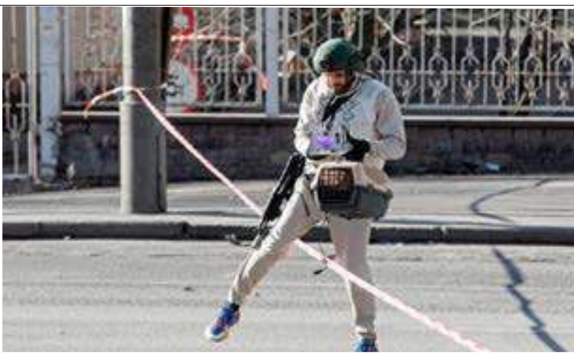
An armed local resident carries a cat in a carrier and a fish in an aquarium, which he took out of an apartment building damaged by recent shelling in Kyiv, Ukraine.