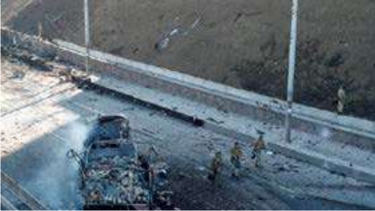
Ukrainian servicemen walk by a damaged vehicle, at the site of a fighting with Russian troops, after Russia launched a massive military operation against Ukraine, in Kyiv, Ukraine.