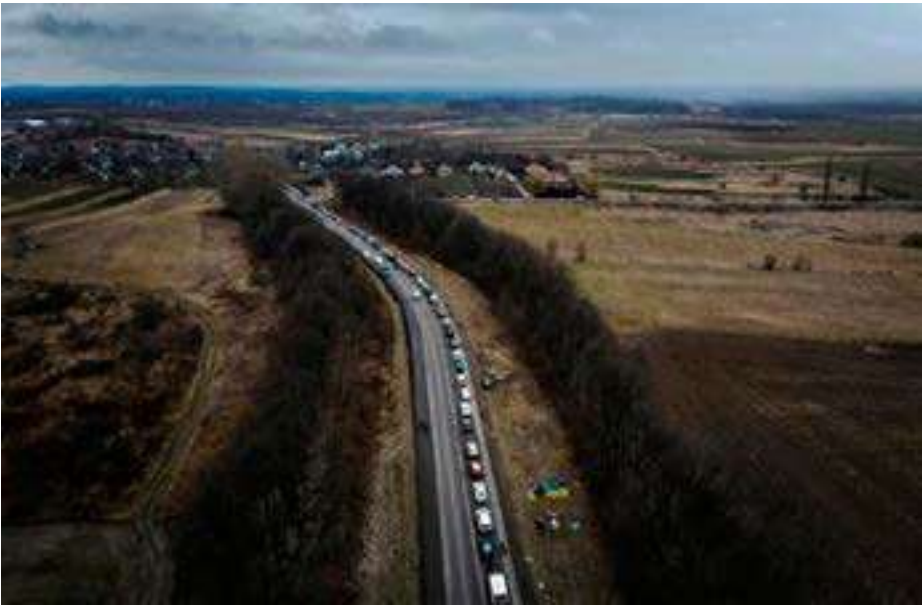
Cars line up on the road to the Shehyni border crossing as people flee to Poland, after Russia launched a massive military operation against Ukraine, outside Mostyska, Ukraine.