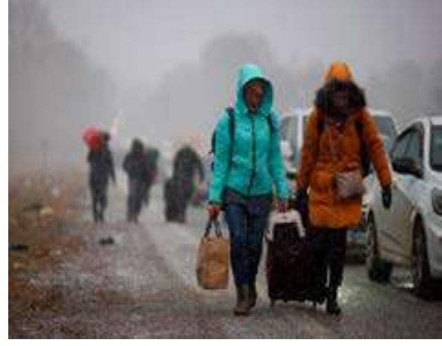
People fleeing Russia's military operation against Ukraine walk toward the Shehyni border crossing to Poland past cars waiting in line to cross the border, outside Mostyska, Ukraine.