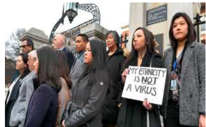
Members of the Asian American Commission gather in Massachusetts to condemn racism.