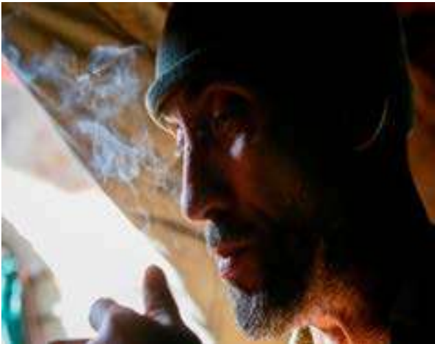
A Ukrainian service member smokes in a trench at a position on the front line near the village of Travne in Donetsk region, Ukraine, February 21.