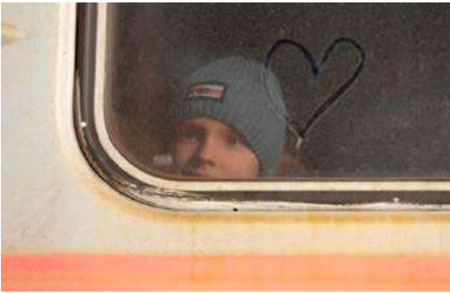
A child looks out of a dust-covered window of a train next to a heart symbol depicted on it, as evacuees board a train before leaving the rebel-controlled city of Donetsk, Ukraine, February 20.