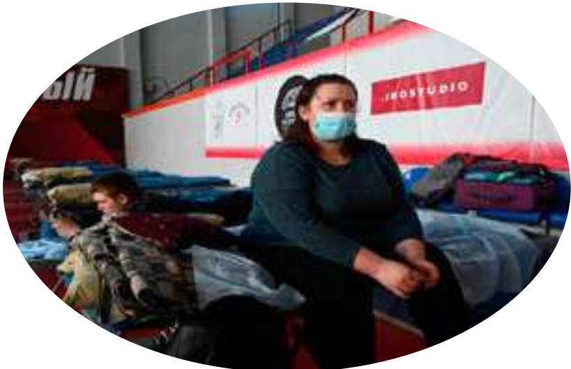
A view shows a temporary accommodation centre for evacuees from the separatist-controlled regions of eastern Ukraine, which is located at a local sports school in the city of Taganrog in the Rostov region, Russia, February 21.