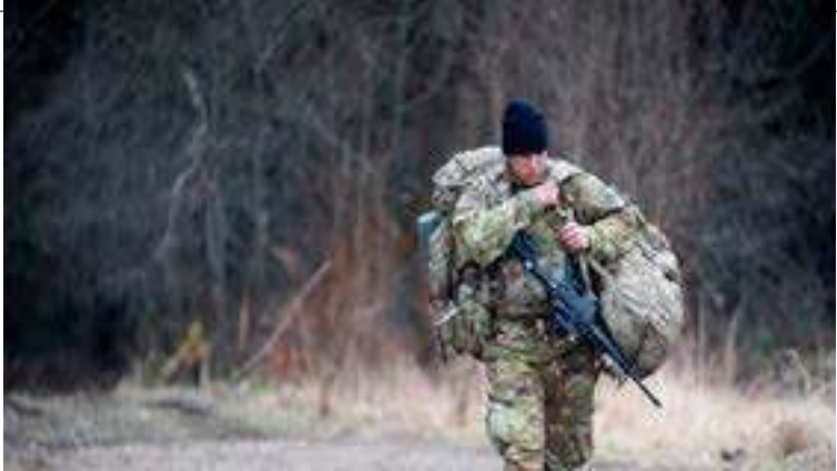
U.S. Army soldiers assigned to the 82nd Airborne Division, deployed to Poland to reassure NATO allies and deter Russian aggression, encamp at an operating base 6KM from the Ukrainian border, near Przemyśl, Poland, February 21.