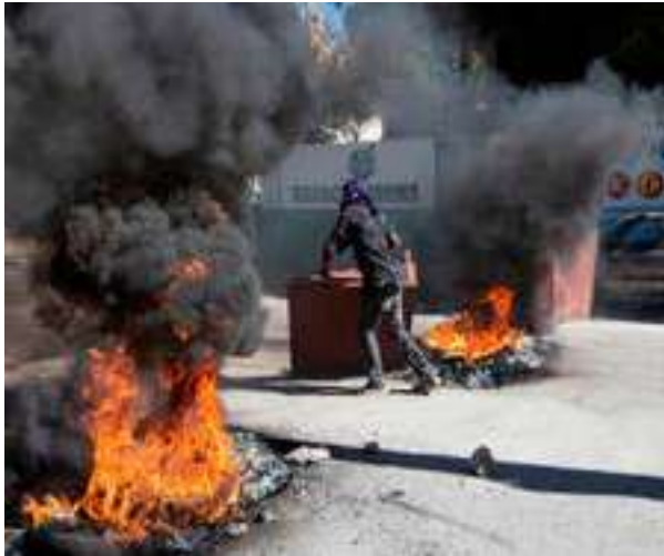
A protestor adds to a burning barricade during a demonstration against high prices and fuel shortages, in Port-au-Prince, Haiti October 21, 2021.