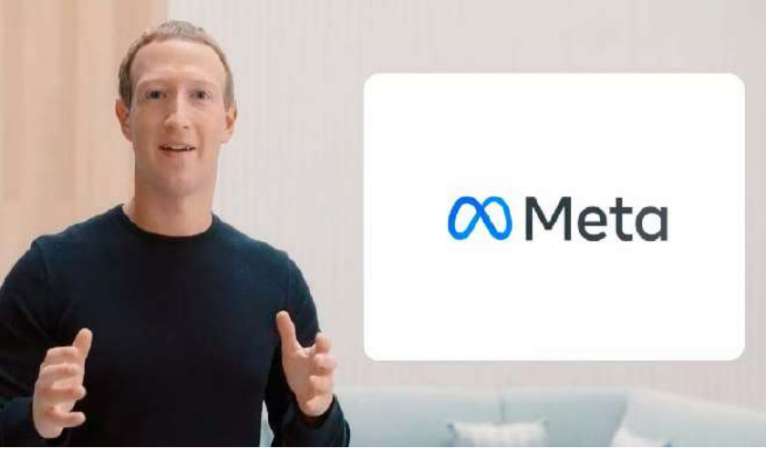
Screen shot of CEO Mark Zuckerberg at the company’s “Connect” virtual event.

(Editor’s Note: Below is the complete, unedited Founder’s Letter as delivered by Facebook CEO Mark Zuckerberg on Thursday, October 28, 2021, as published on the internet. The only addition to Mr. Zuckerberg’s statement has been photos and graphics for the purpose of emphasizing his announcement.)