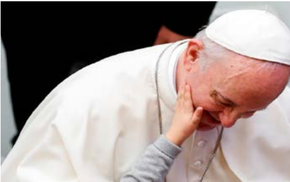
A child touches the face of Pope Francis after the weekly general audience at the Vatican.