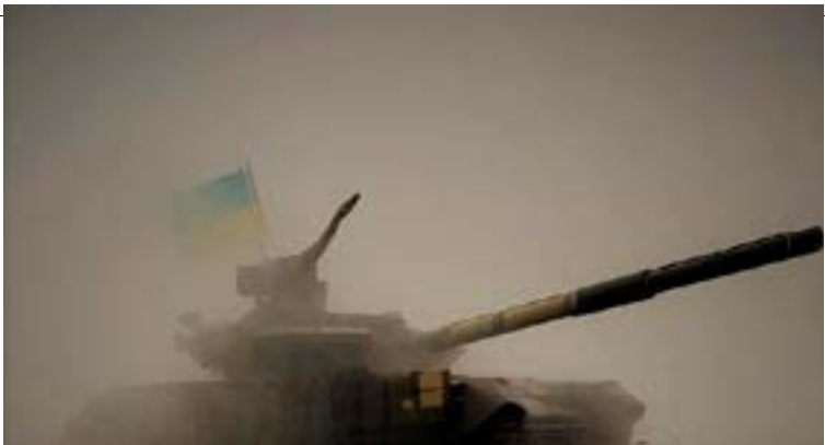
A tank of the Ukrainian Armed Forces is seen during military drills at a training ground in the Dnipropetrovsk region, Ukraine, February 8.