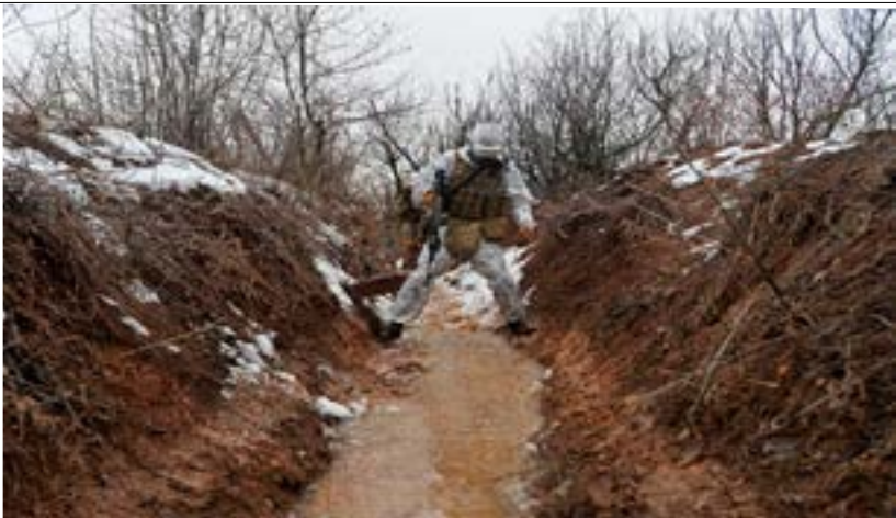
Service members of the Ukrainian armed forces walk at combat positions near the line of separation from Russian-backed rebels outside the town of Avdiivka in the Donetsk Region, Ukraine February 10, 2022.