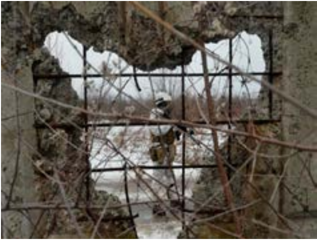
A service member of the Ukrainian armed forces walks at combat positions near the line of separation from Russian-backed rebels outside the town of Avdiivka in the Donetsk Region, Ukraine February 10.