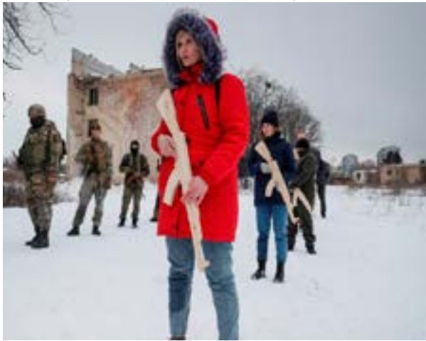
People take part in a military exercise for civilians conducted by veterans of the Ukrainian National Guard Azov battalion, amid threat of Russian invasion, in Kyiv, Ukraine, February 6.