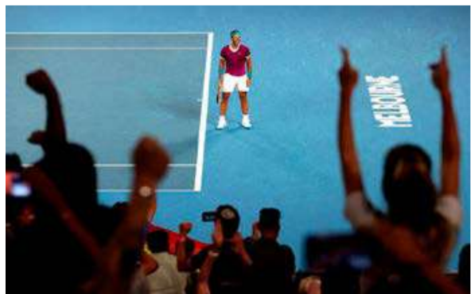
Spain's Rafael Nadal celebrates winning his semi final match against Italy's Matteo Berrettini.