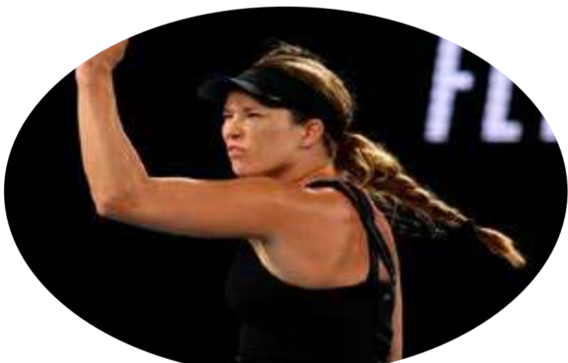
Danielle Collins of the U.S. reacts during her semi final match against Poland's Iga Swiatek.