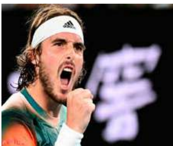
Greece's Stefanos Tsitsipas reacts during his quarter final match against Italy's Jannik Sinner.