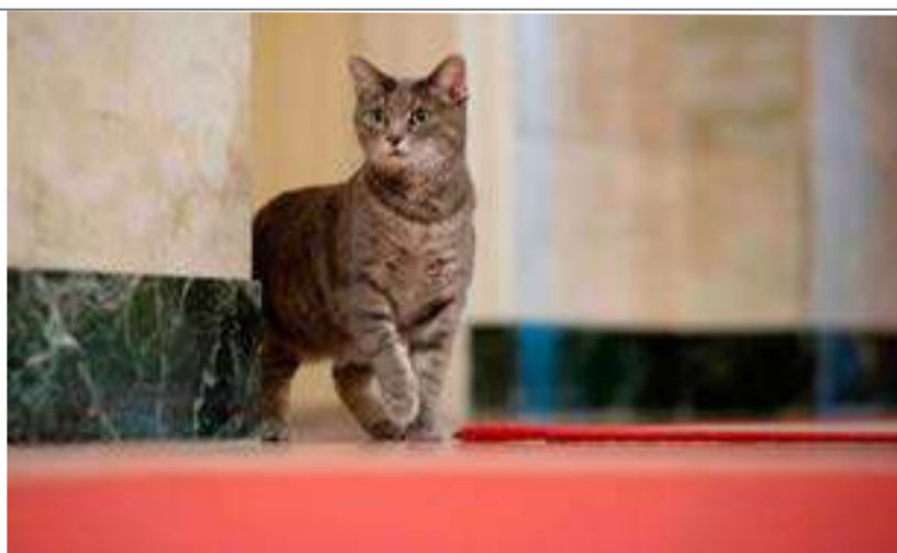
Willow, the Biden family's new pet cat, is seen as she wanders through the halls of the White House.