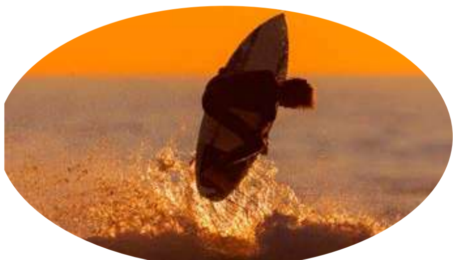
A surfer rides a wave as the sun sets at Seaside Beach in Encinitas, California, January 11, 2022.