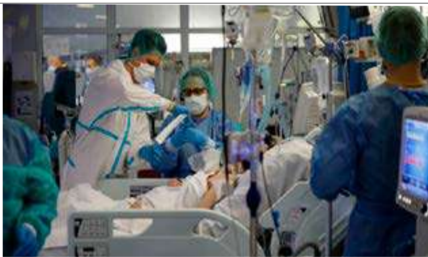
Medical staff members treat patients inside the coronavirus ward at the Interior Ministry Hospital in Warsaw, Poland, January 11.