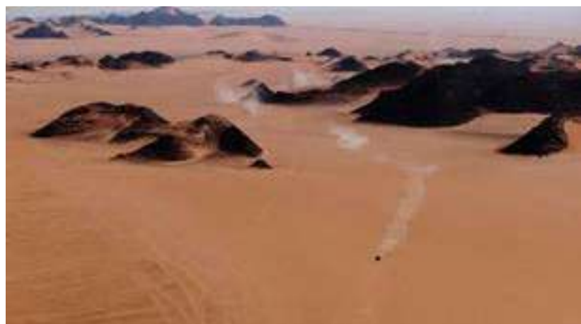
General view during Stage 9 of the Dakar Rally in Saudi Arabia, January 11.