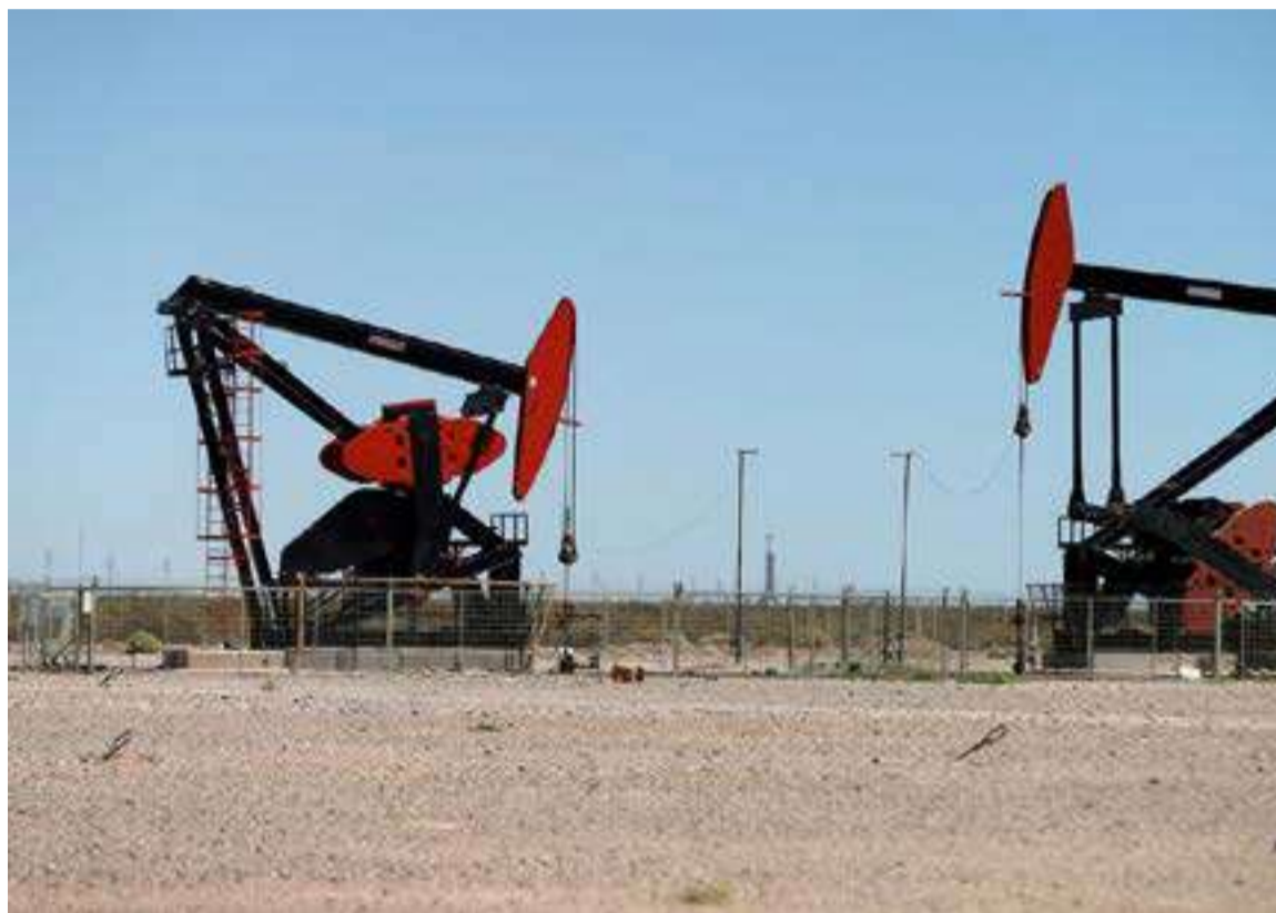
Oil pump jacks are seen at the Vaca Muerta shale oil and gas deposit in the Patagonian province of Neuquen, Argentina, January 21, 2019.

Last month's inflation readings were in line with expectations. Rising inflation is also eroding wage gains. Inflation-adjusted average weekly earnings fell 2.3% on a year-on-year basis in December.