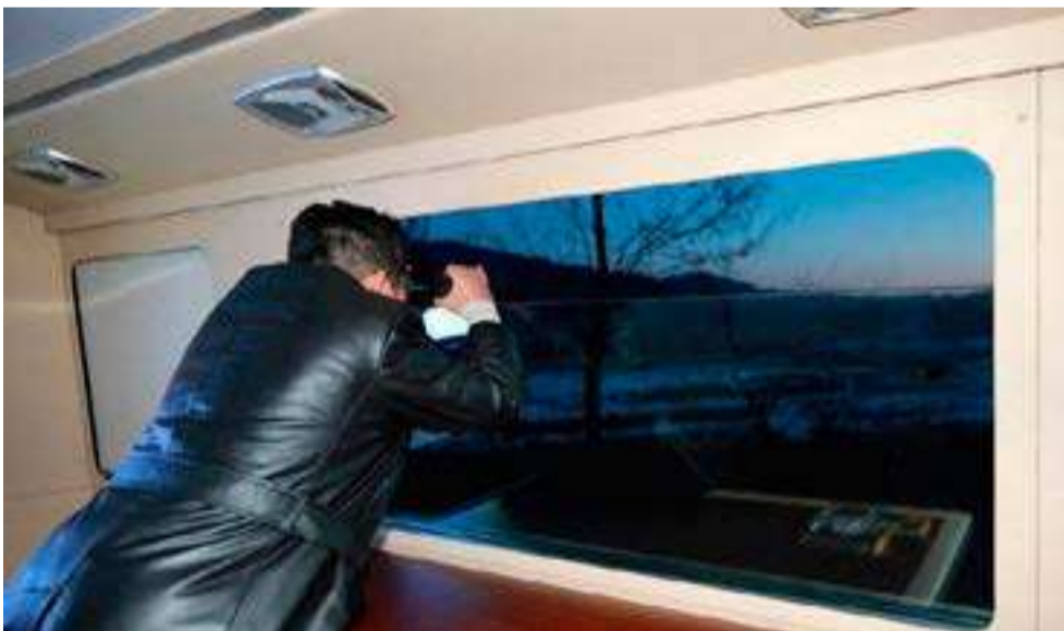
North Korean leader Kim Jong Un observes what state media report is a hypersonic missile test at an undisclosed location in North Korea, January 11, 2022.