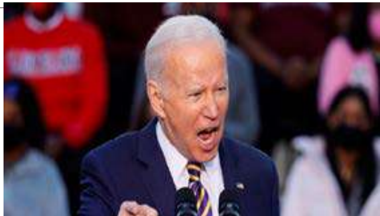
President Joe Biden delivers remarks on the grounds of Morehouse College and Clark Atlanta University in Atlanta, Georgia, January 11.