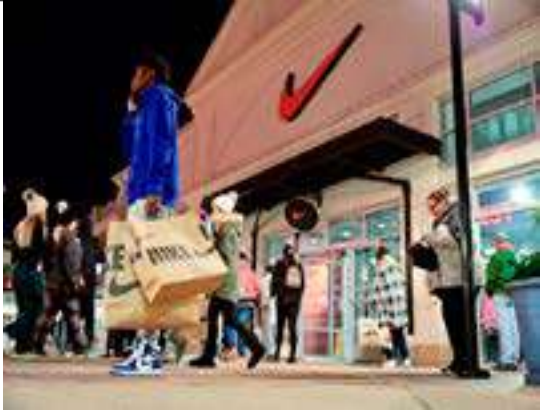
A man with Nike bags talks on the phone in front of a Nike store as Black Friday sales begin at The Outlet Shoppes of the Bluegrass in Simpsonville, Kentucky, November 26, 2021.