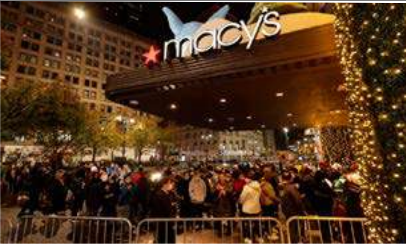
People wait in line at Macy's before Black Friday sales in Manhattan, New York, November 26, 2021.