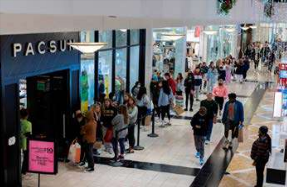
Shoppers line up for the Black Friday sales at the King of Prussia shopping mall in King of Prussia, Pennsylvania, November 26, 2021.