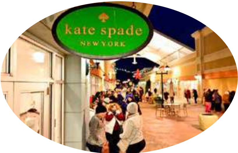
Guests wait in line to enter a Kate Spade store as Black Friday sales begin at The Outlet Shoppes of the Bluegrass in Simpsonville, Kentucky, November 26, 2021.