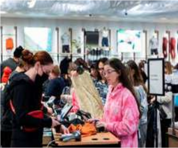
Shoppers show up early for the Black Friday sales at the King of Prussia shopping mall in King of Prussia, Pennsylvania, November 26, 2021.