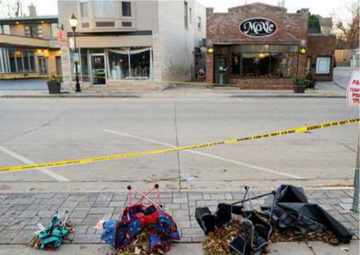
Chairs are left abandoned on Main Street the morning after a car plowed through a holiday parade in Waukesha, Wisconsin, U.S., November 22, 2021.