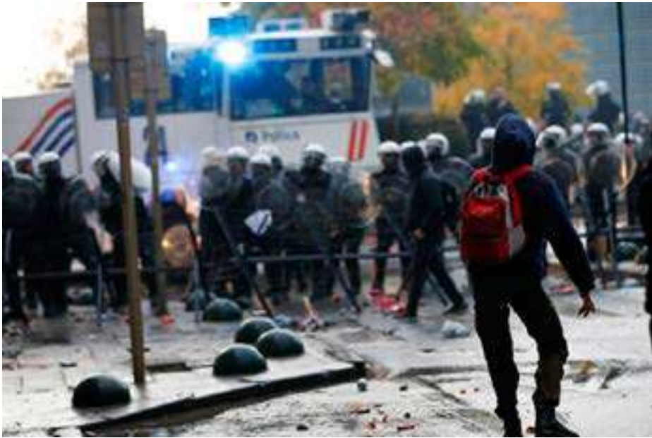
People protest against coronavirus measures as police forces stand guard, near the European Commission in Brussels, Belgium, November 21.