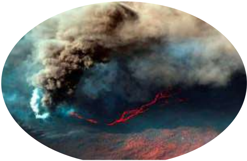
A satellite image in infrared color shows smoke rising as lava flows while the Cumbre Vieja volcano continues to erupt on the Canary Island of La Palma, Spain.