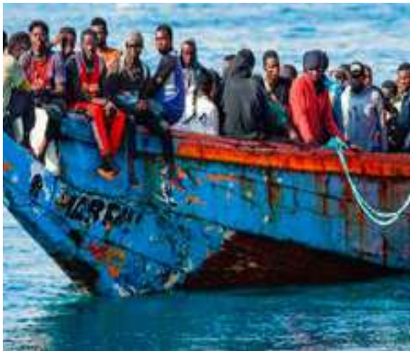
Migrants wait to disembark from a boat towed by a Spanish coast guard vessel, in the port of Arguineguin, on the island of Gran Canaria, Spain.