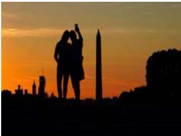
The sky goes orange behind the Washington Monument and the Smithsonian Castle as a couple pose for a sunset selfie in Washington.