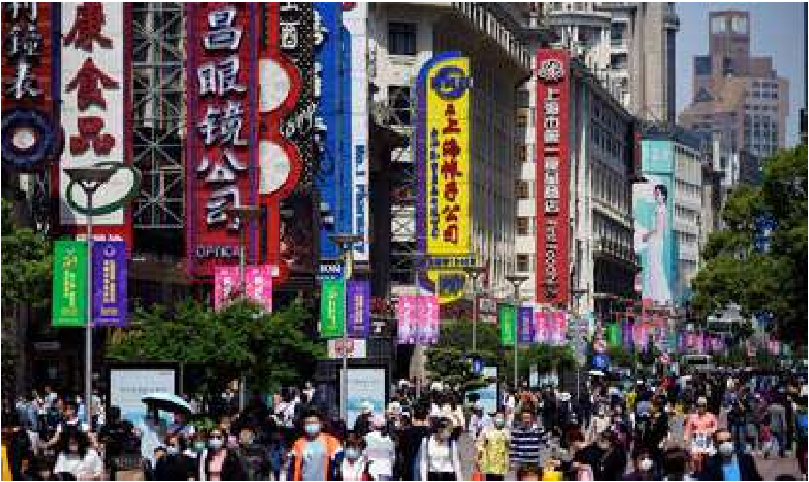
People walk along Nanjing Pedestrian Road, a main shopping area, during the Labour Day holiday, following the outbreak of the coronavirus disease (COVID-19), in Shanghai, China May 5, 2021.