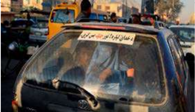
A woman wearing a burqa sits in the trunk of a taxi in Chawok market in Kabul, Afghanistan. The sticker reads “for God sake stop fighting”.