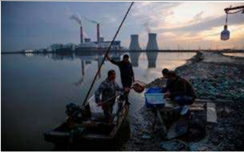
Fishermen bring in their catch from a lake in front of a power plant of the State Development and Investment Corporation (SDIC) outside Tianjin, China.