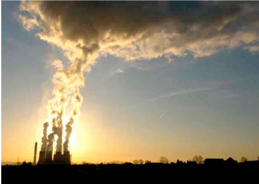
The concentration of carbon dioxide, the most important greenhouse gas, is now 50% higher than before the Industrial Revolution.

KEY POINTS UN seeks ‘dramatic increase’ in climate commitments Summit will seek to avert menacing levels of warming UK’s Johnson says COP26 outcome is ‘touch and go’