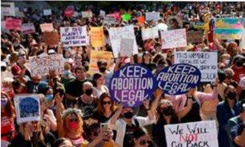
Supporters of reproductive choice take part in the nationwide Women's March, held after Texas rolled out a near-total ban on abortion procedures and access to abortion-inducing medications, in New York City, New York