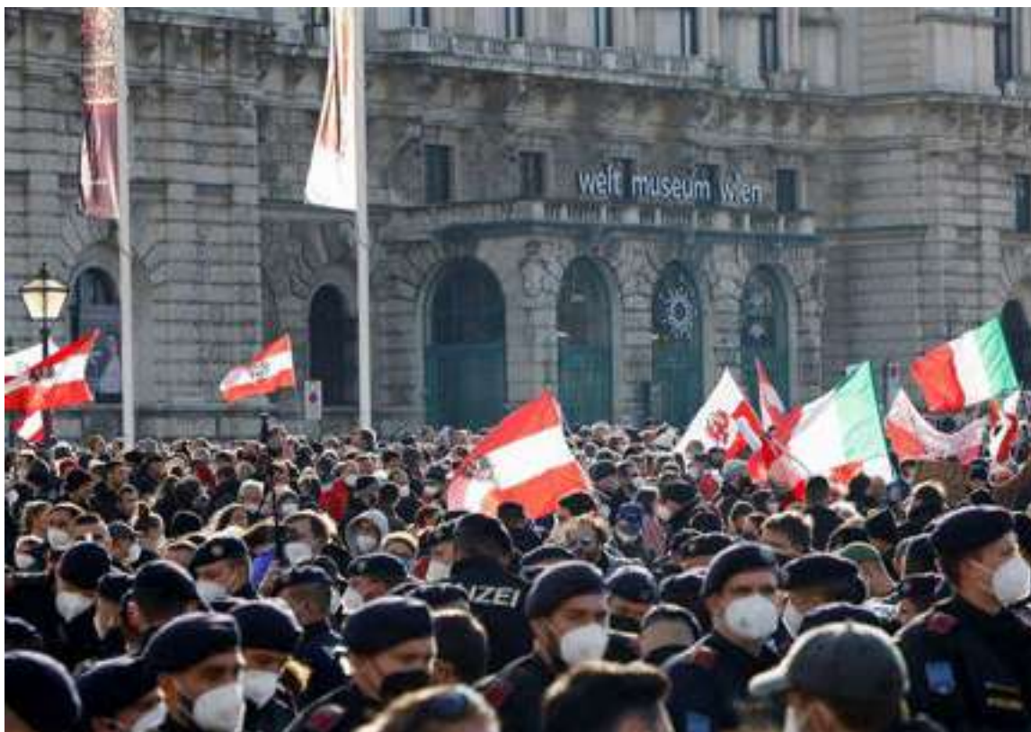
Police officers stand guard as demonstrators gather to protest against the coronavirus disease (COVID-19) measures in Vienna, Austria, November 20, 2021.

"We are not in favour of our government's measures," said one protester, who was part of a group wearing tin foil on their heads and brandishing toilet brushes. Like most protesters who spoke to the media, they declined to give their names, though the mood was festive.