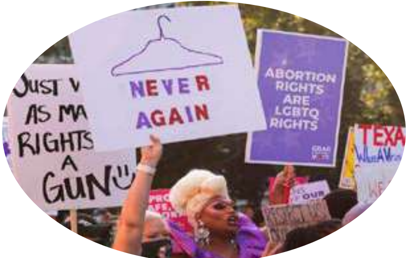
Brita Filter and supporters of reproductive choice take part in the nationwide Women's March, held after Texas rolled out a near-total ban on abortion procedures and access to abortion-inducing medications, in Manhattan, New York, . REUTERS/Caitlin Ochs