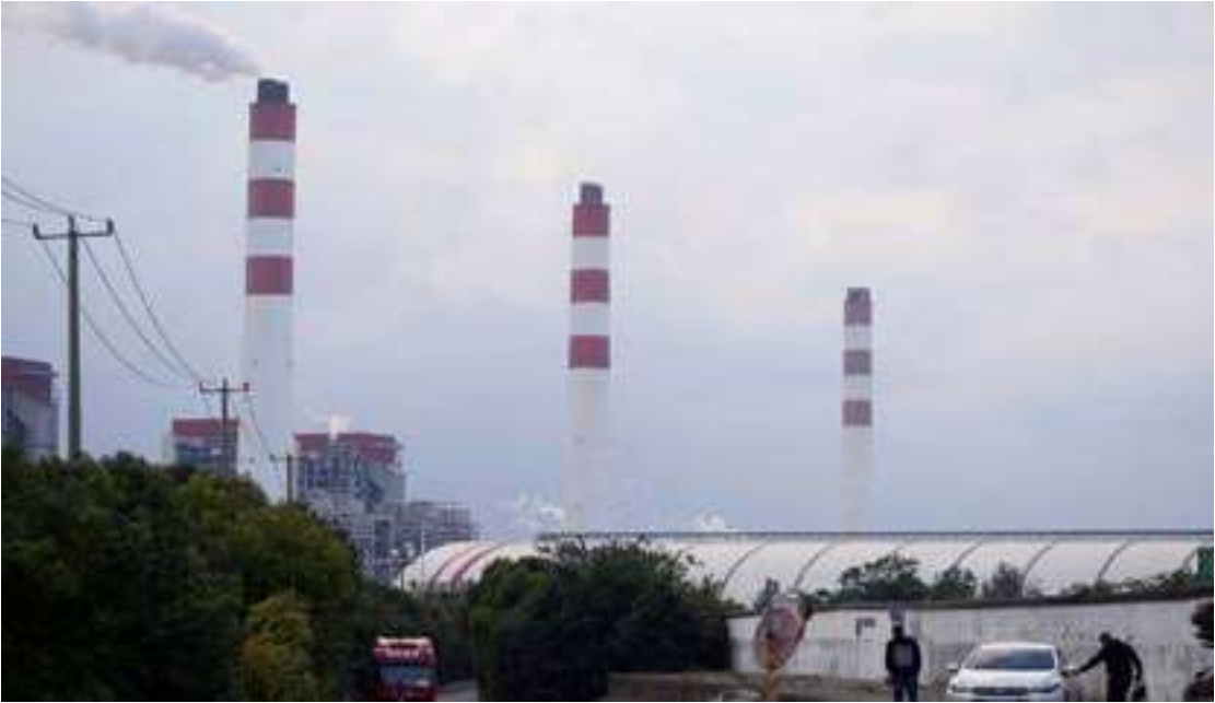
Men stand by a car near a coal-fired power plant in Shanghai, China October 21, 2021.

On Friday, President Xi Jinping said China will make efforts to ensure the stable supply of coal and electricity for economic and social use and also called up more exploration and development of oil and gas, state media reported. read more