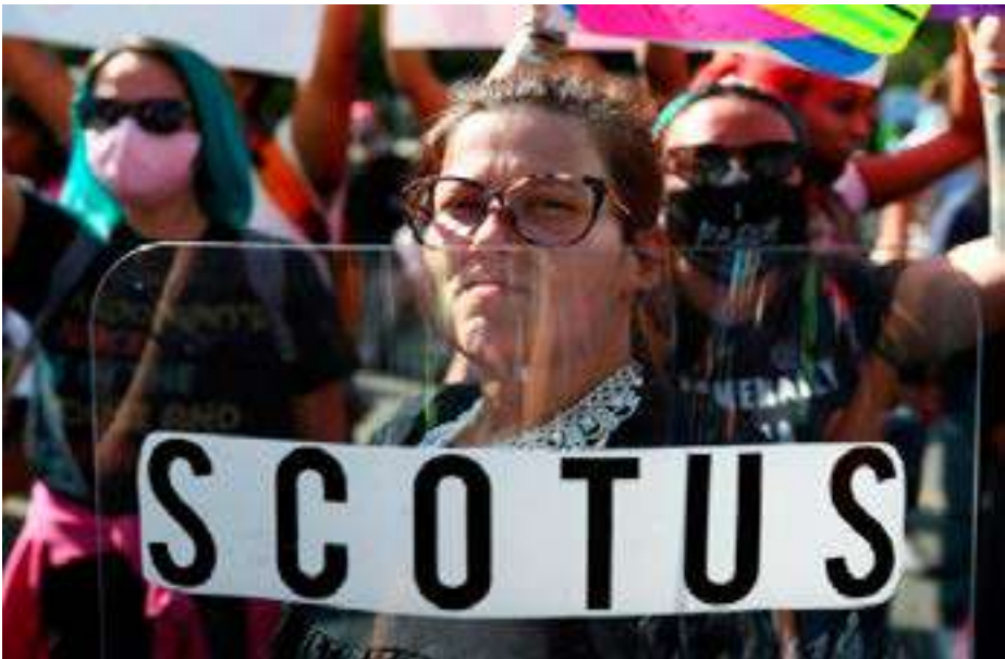
A woman dressed as late U.S. Supreme Court Justice Ruth Bader Ginsburg looks on as supporters of reproductive choice take part in the nationwide Women's March, held after Texas rolled out a near-total ban on abortion procedures and access to abortion-inducing medications, outside the Supreme Court in Washington, D.C., .