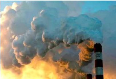
Smoke and steam billow from Belchatow Power Station, Europe’s largest coal-fired power plant, near Belchatow, Poland. Picture taken November 28, 2018. In London, climate activists restarted their campaign of blockading major roads by disrupting traffic in the city’s financial district, while in Madrid a few dozen people staged a sit-in protest, briefly blocking the Gran Via shopping street. “Greenhouse gas emissions are provoking climate catastrophes all over the planet. We don’t have time. It’s already late and if we don’t join the

by 2100, according to the median replies to the survey. Australia’s cabinet was expected to formally adopt a target for net zero emissions by 2050 when it meets on Monday to review a deal reached between parties in Prime Minister Scott Morrison’s coalition government, official sources told Reuters. The ruling coalition has been divided over how to tackle climate change, with the government maintaining that harder targets would damage the A$2-trillion ($1.5-trillion) economy.