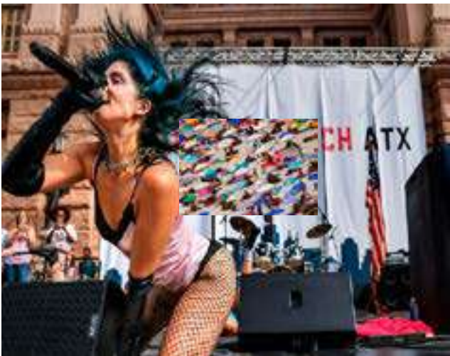
A member of Pussy Riot performs in the nationwide Women's March, held after Texas rolled out a near-total ban on abortion procedures and access to abortion-inducing medications, in Austin, Texas, October 2, 2021.