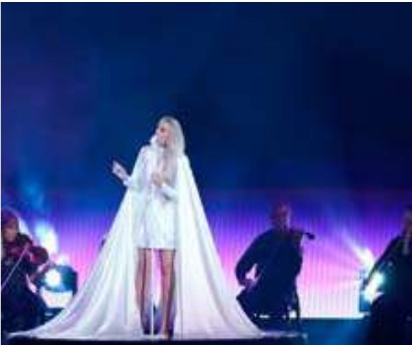
Gabby Barrett performs on stage.