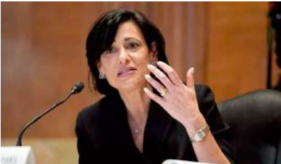
Centers for Disease Control and Prevention Director Rochelle Walensky

Why it matters: The “dramatic increase,” up from 50% on July 3, has led to a rise in virus-related deaths, Walensky told lawmakers. COVID fatalities have risen by nearly 48% since last week to an average of about 239 per day, according to Walensky.