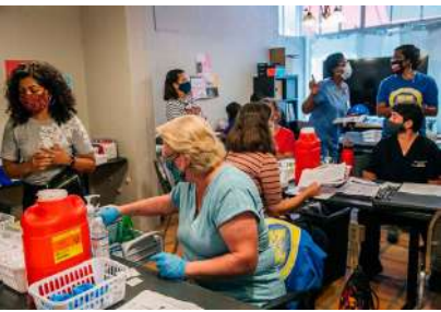
Volunteer doctors and nurses prepare ahead of a COVID-19 vaccine clinic on May 13, 2021 in Houston.

“I don’t think there’s sufficient evidence at this point that we should be more concerned about lambda than delta, I still think delta is the primary concern for us. There’s a lot more evidence that we have that delta is much more contagious, the viral loads are much higher,” he added. The lambda variant “has been associated with substantive rates of community transmission in multiple countries, with rising prevalence over time concurrent with increased COVID-19 incidence,” the WHO said in its June report. In June, the variant was detected in 29 countries.