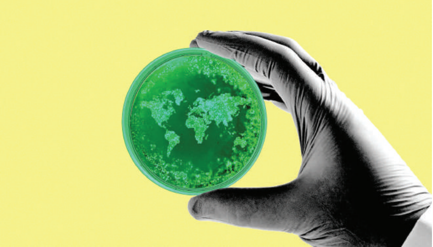
Illustration above depicts the world in a Petri dish.