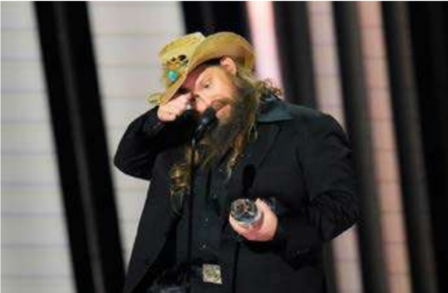
Chris Stapleton wins Male Vocalist of the Year award.