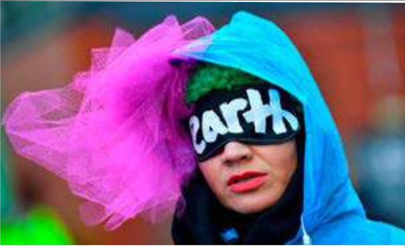
A person demonstrates near the UN Climate Change Conference (COP26) venue, in Glasgow, Scotland, Britain November 12, 2021.