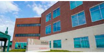
Houston Methodist Baytown Hospital in Baytown, Texas, June 22, 2021.