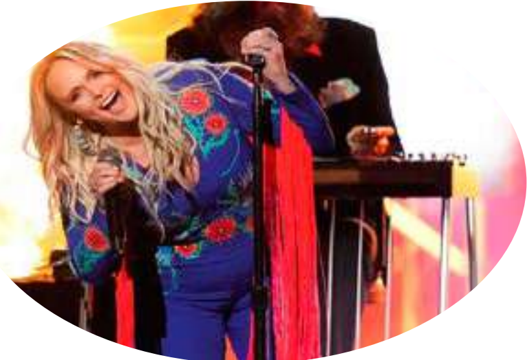
Miranda Lambert performs on stage.