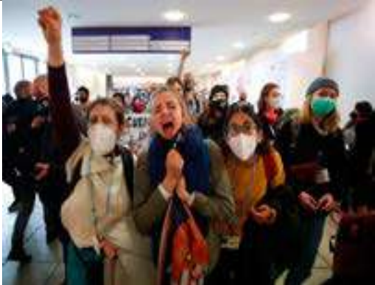
People attend a protest at the UN Climate Change Conference (COP26), in Glasgow, November 12.

A second source said the approach appeared geared at getting companies to delay the legislative process rather than block the bills entirely.