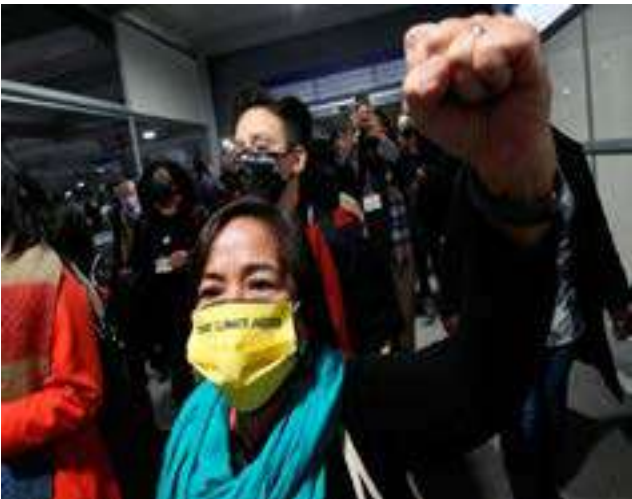
People attend a protest at the UN Climate Change Conference (COP26), in Glasgow, November 12.