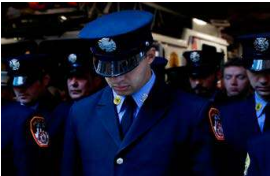
Firefighters attend a ceremony marking the 20th anniversary of the September 11, 2001 attacks, at the FDNY Engine 1/Ladder 24 fire house in New York City.