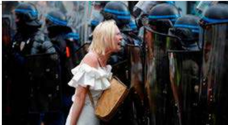
A protester confronts riot police officers during a demonstration against France's restrictions, including compulsory health passes, to fight the coronavirus pandemic, in Paris, France.