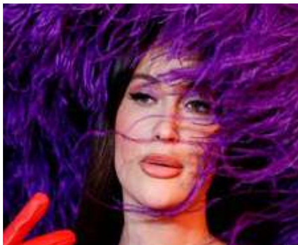
Kacey Musgraves arrives at the MTV Video Music Awards at the Barclays Center in Brooklyn, New York.