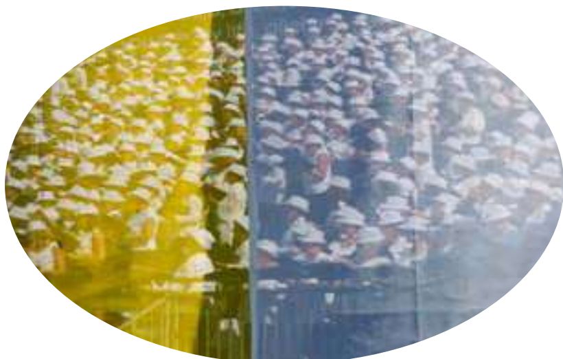
A choir sings as people wait for Pope Francis to arrive in Heroes' Square in Budapest, Hungary.