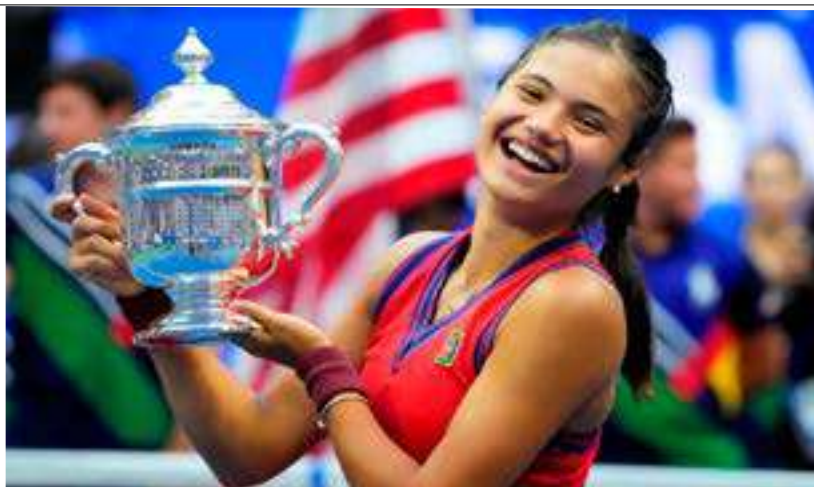
Emma Raducanu of Great Britain celebrates with the championship trophy after her match against Leylah Fernandez of Canada in the women's singles final at the 2021 U.S. Open tennis tournament in New York.