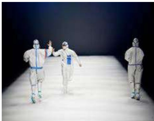
Models interact while they present protective suits made for medical professionals, designed by the Beijing Institute of Fashion Technology in collaboration with Dishang, during China Fashion Week in Beijing.