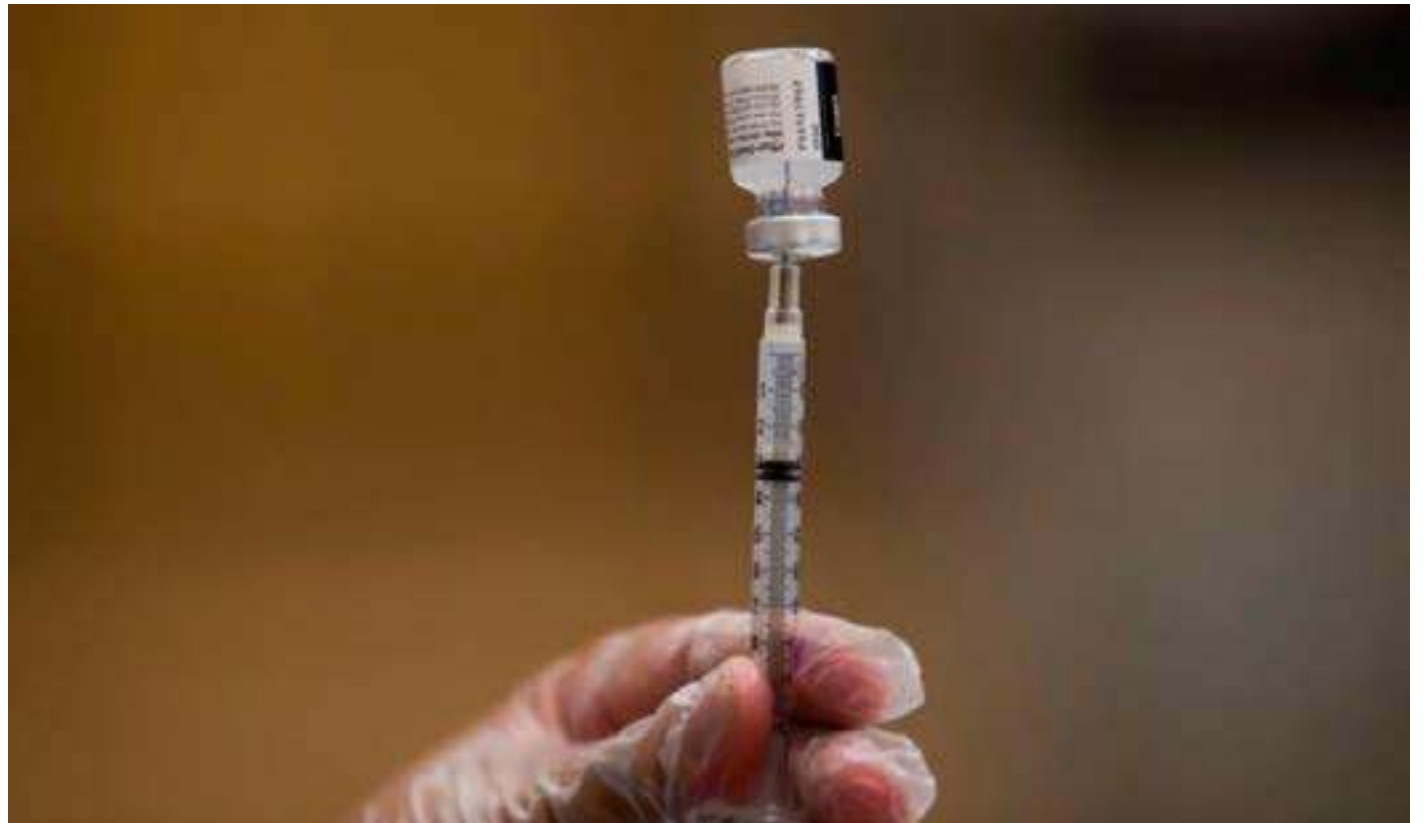
A nurse fills a syringe with Pfizer vaccine as mobile vaccination teams begin visiting every Los Angeles Unified middle and high school campus to deliver first and second doses of the coronavirus disease (COVID-19) vaccines in Los Angeles, California, U.S., August 30, 2021.

Pfizer partner BioNTech told Der Spiegel that it also expects to request authorization globally for the COVID-19 vaccine in children as young as five over the next few weeks and that preparations for a launch were on track.