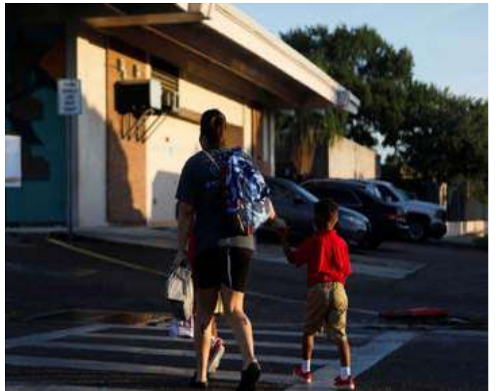
A parent walks their children on the first day of school, amid the coronavirus (COVID-19) pandemic, at West Tampa Elementary School in Tampa, Florida, U.S., August 10, 2021.