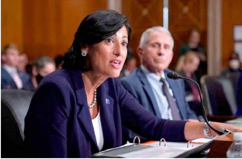
Dr. Rochelle Walensky, the director of the Centers for Disease Control and Prevention, testifies during a congressional hearing in Washington on March 18, 2021.