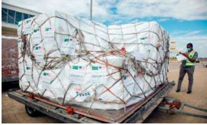
Vaccines are delivered to Tanzania as part of the COVAX program.