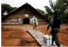
A health worker and a military police officer carry the AstraZeneca/Oxford vaccine to an Indigenous hut in Manaus, Brazil, February 9, 2021.

Several COVID-19 vaccines have been approved or authorized, but rollout has been hindered.