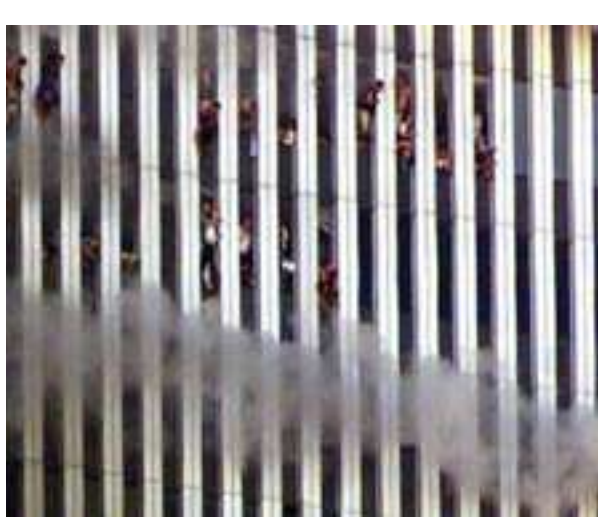
People look out of the burning North Tower of the World Trade Center.