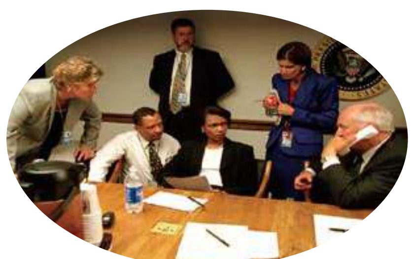
U.S. Vice President Dick Cheney speaks to President George W. Bush by phone inside the operations center at the White House.