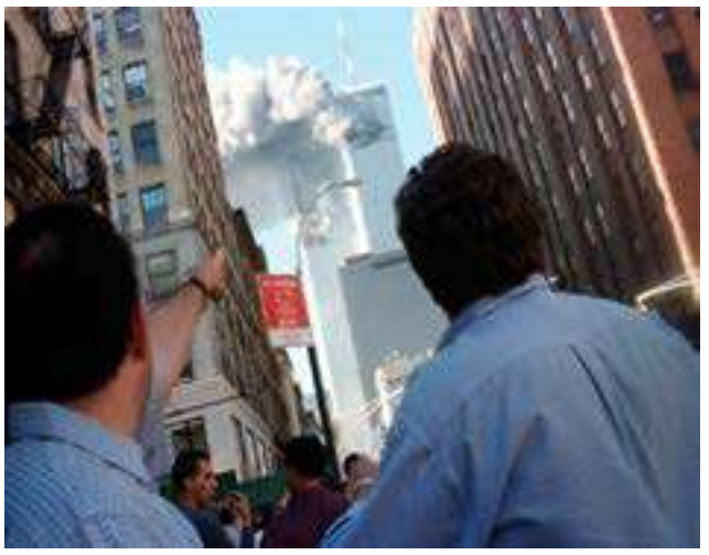
Pedestrians react while watching the World Trade Center.