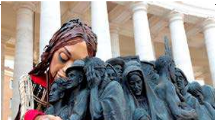
Little Amal, a 3.5 metre tall puppet of a young Syrian refugee girl, embraces the Angels Unawares sculpture in St. Peter's Square as she travels across Europe from Turkey to Britain as part of an 8,000 kilometre walk to raise awareness for the plight of young refugees, Vatican.